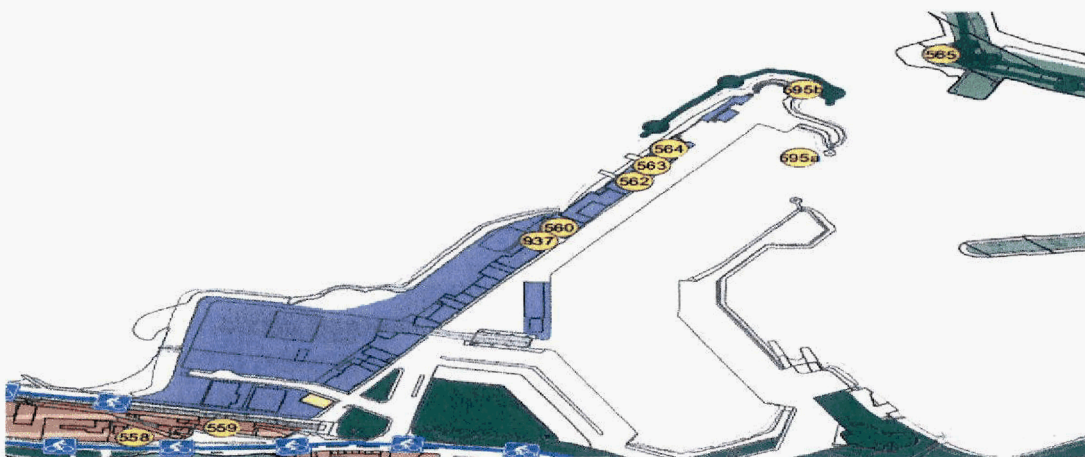
Extract from Fingal County Development Plan 2017 -2023 showing the protected views and prospects at the end of the pier.

I would agree with the Conservation Officer and would suggest that the overall scheme could be improved, for the good of all, by refusing any development north of the boat yard and focusing all of the infill to the area closest to the railway station which is the source of most of the pedestrian traffic to the beach area. In order to facilitate boat trailers access to the water a limited access route could be provided to an area to the south east of the boat yard. Furthermore all traffic to, and from, the area would be from the industrial estate road thereby protecting the pier from unnecessary car borne traffic and congestion. While a number of car parking spaces could be provided in the reclaimed area, the number of spaces should be minimal as there is sufficient car parking spaces on the pier and on the roads and car park area on the harbour front.