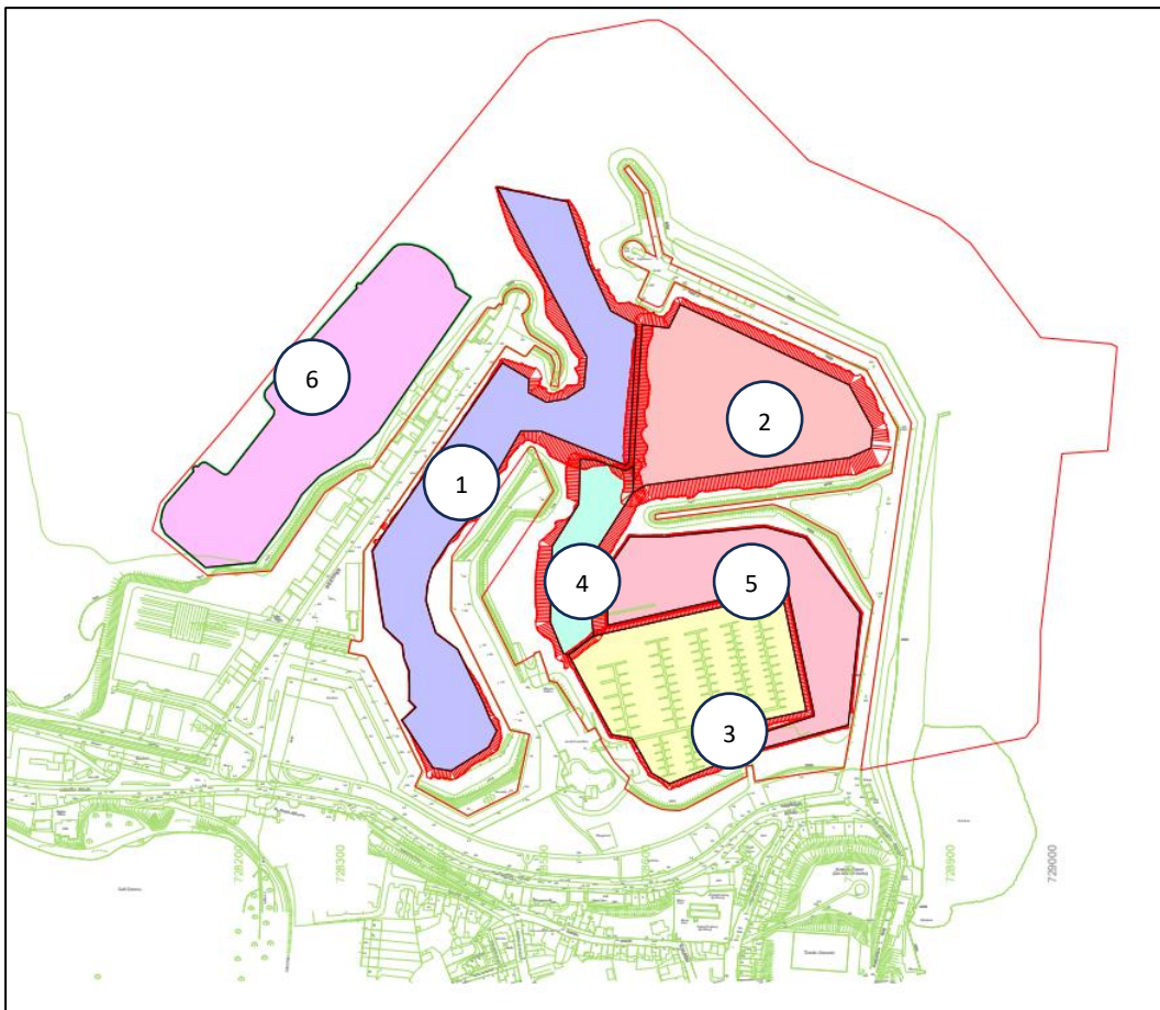
Figure 1: AutoCAD screenshot

The following screenshots are taken from AutoCAD Civil 3D. They show the proposed dredge areas and the reclamation area (6).