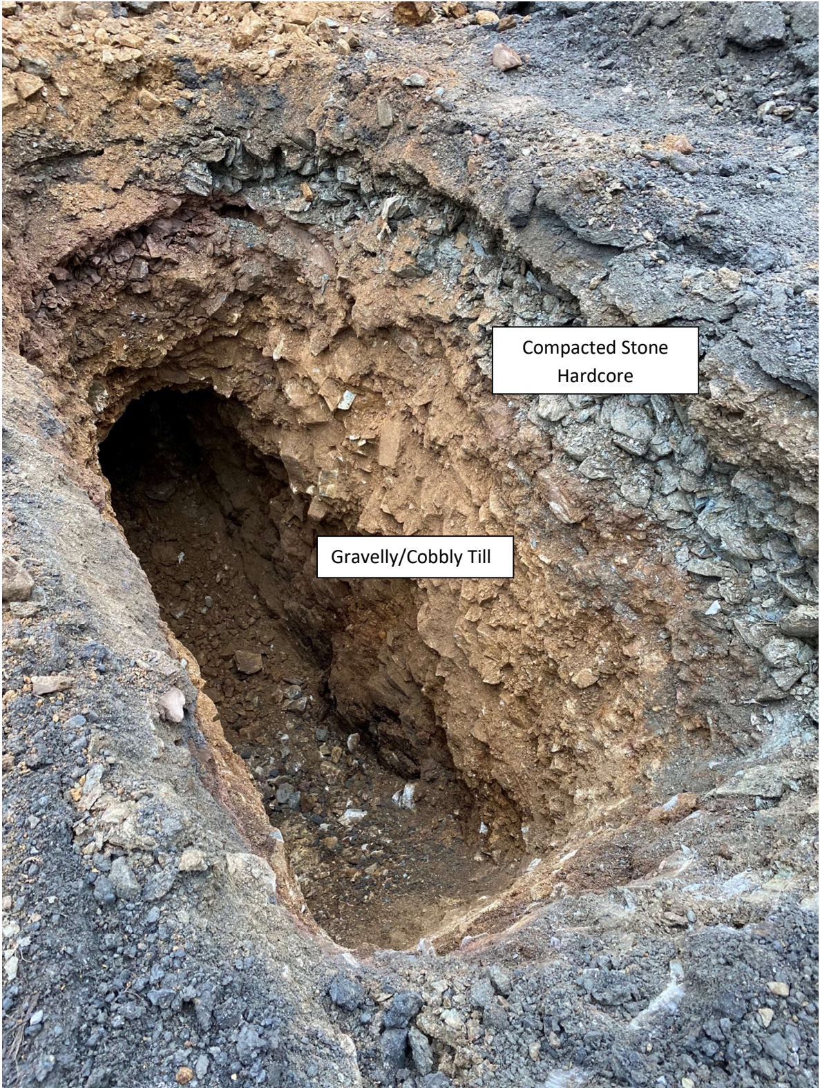
Plate 1 – TP1 (excavated pit)