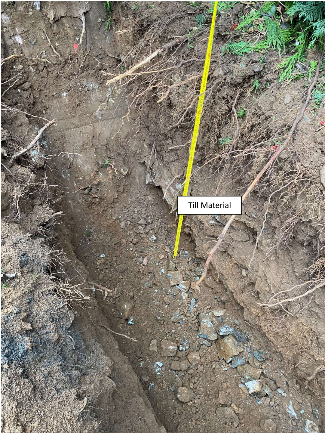
Plate 3 – TP3 (excavated pit)