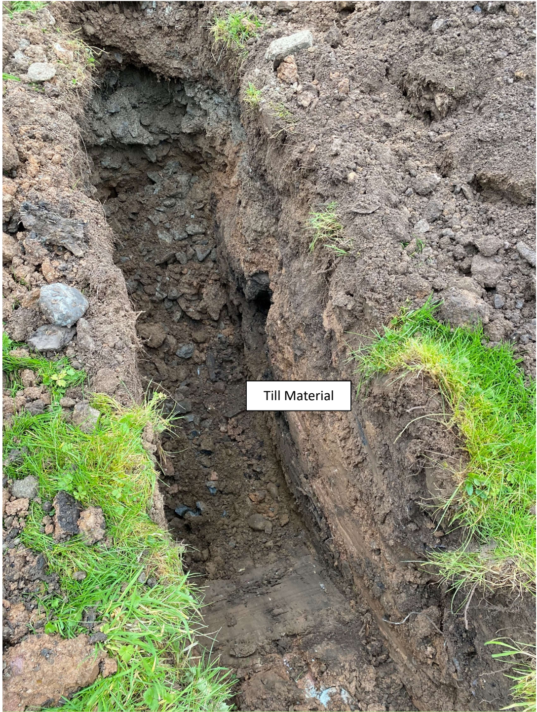
Plate 4 – TP4 (excavated pit)