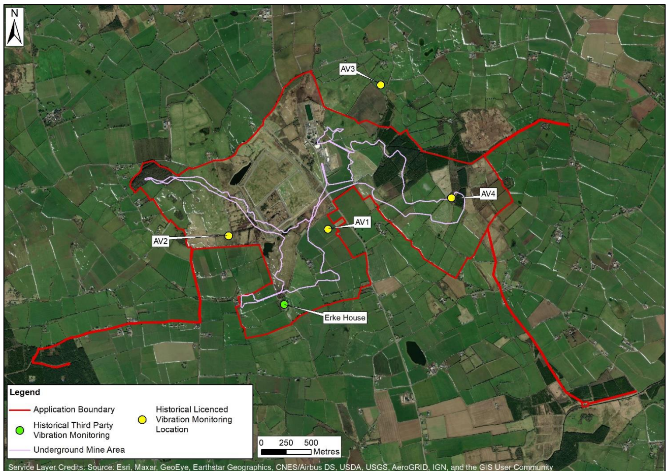
Figure 12.2: Former vibration monitoring locations at the Site

With the exception of the vibration level measured on the 14 February 2012 at Erke House, the significance of previous blasts is considered to be Neutral , the Erke House 7.5 mm/sec rppv value would be considered Moderate under the assessment criteria presented here.