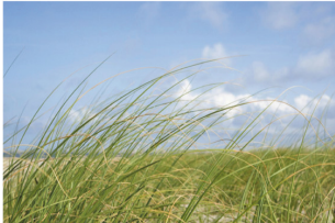
ENVIRONMENTAL BALANCE IN DESIGN AND CONSTRUCTION