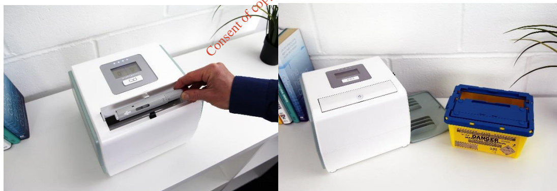
Fig 1: HealthBeacon Smart Sharps System – demonstrating how a patient disposes of their used autoinjector pen