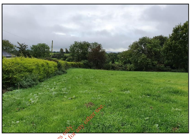
Plate 6: Section of fiedgerows (WL1) within southern portion of site.