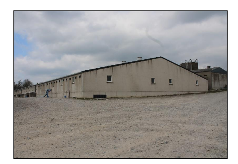
Plate 1: Example of BL3 habitat onsite - the sow house.

WOODVILLE PIG FARMS LTD., BALLYMACKEY, CO. TIPPERARY