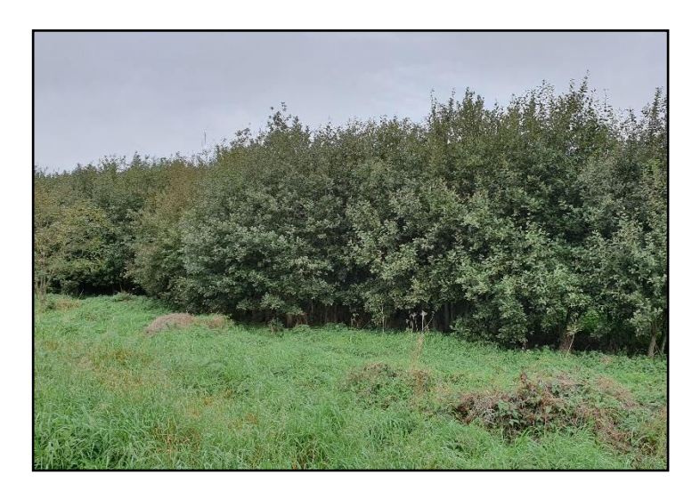
Plate 5: Area of WS1 habitat, mainly comprised of Willow.

WOODVILLE PIG FARMS LTD., BALLYMACKEY, CO. TIPPERARY