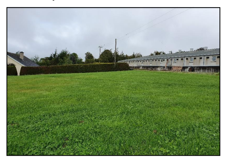
Plate 3: Area of GA2 habitat, within the southern portion of the site.