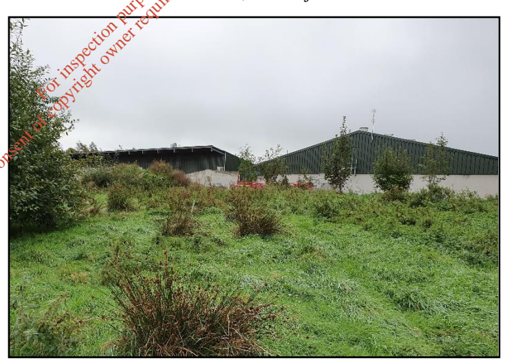
Plate 4: GS4 habitat in the site's northern section.