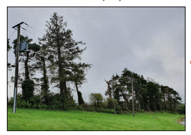
Plate 7: Section of treelines (WL2) along eastern site boundary.