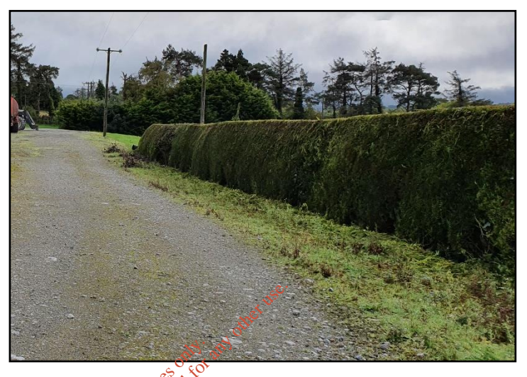
Plate 2: Section of WE1 habitat, with adjacent ED3 habitat.