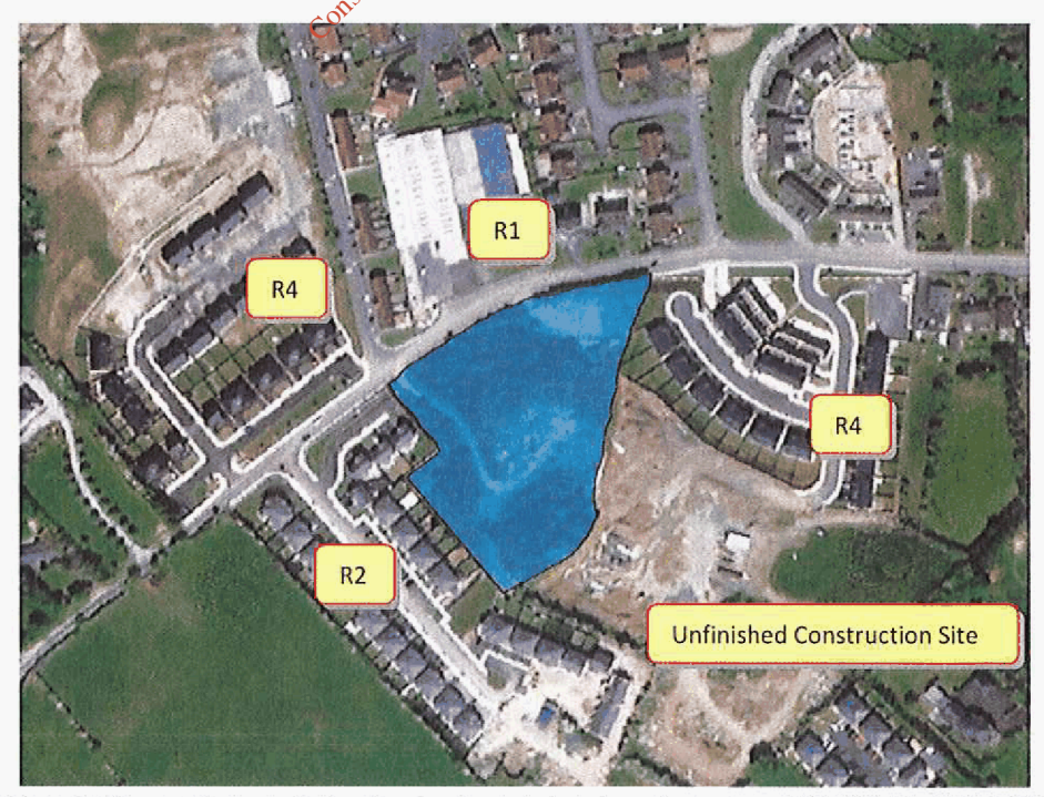
"Geological Survey of Ireland - Online Mapping. Geotechnical viewer September - 2012" (OSI, No. EN0047212)