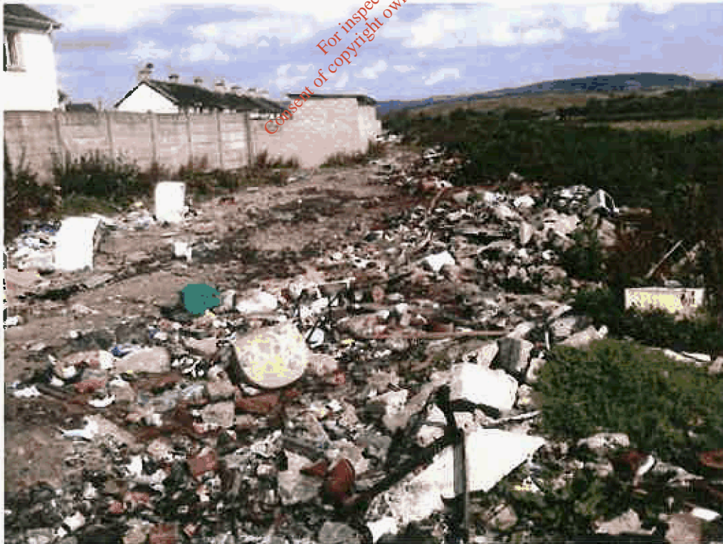
Photo 2 - Type of waste visible on surface of the landfill