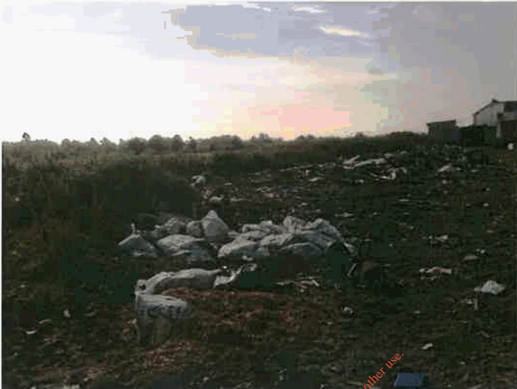
Photo 3 - Manure and other mixed wastes becoming overgrown on the landfill