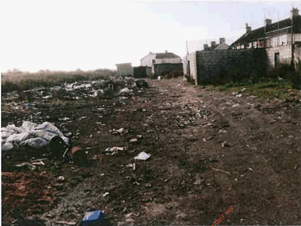
Photo 1 - Access road between rear of houses and the landfill