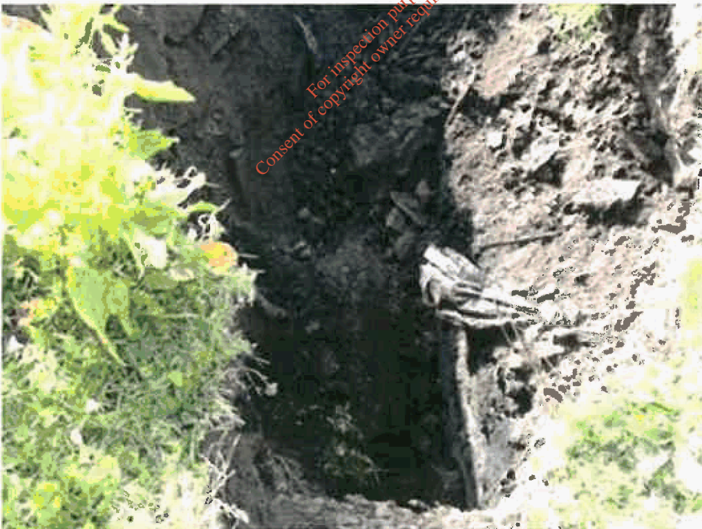
Photo 4- Trial pit excavations showing buried mixed waste beneath