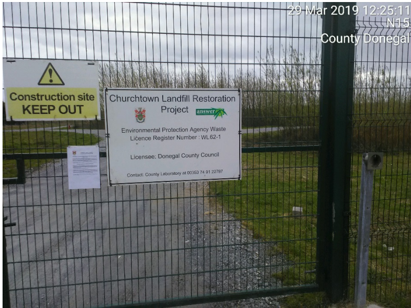
Figure 2 Site Notice on Entrance Gate

For inspection purposes only. Consent of copyright owner required for any other use.