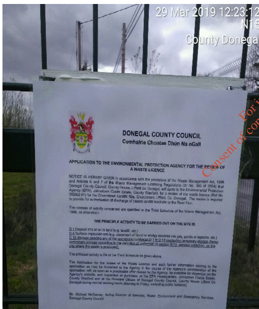
Figure 1 Site Notice

A copy of the site notice is provided in Appendix B. Date stamped photos of the site notice are also provided below.