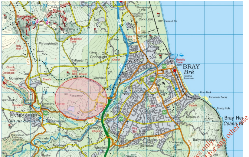
Figure 1.1: Site Location Map

There are 5 No. distinct landfill sites at the overall Fassaroe lands. These are identified on Figure 1.2 below.