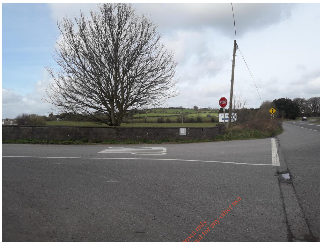
Distant View of Site Notice in place at Site Entrance