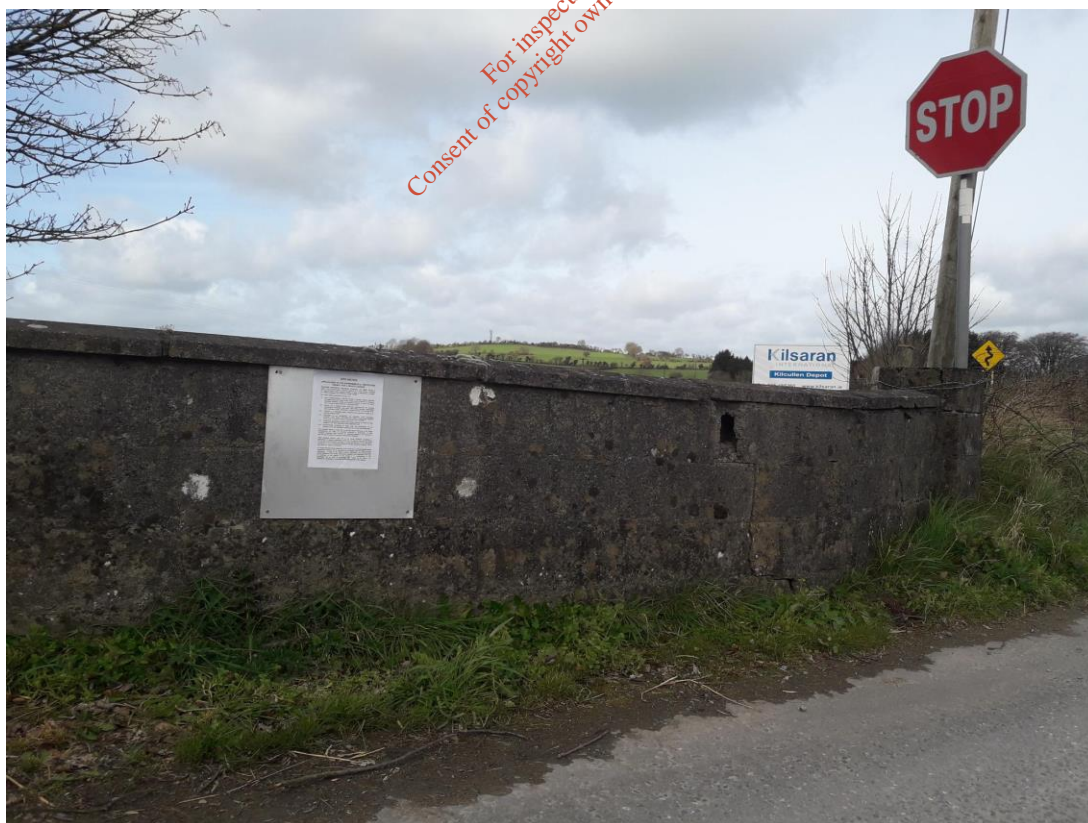
Closer-in View of the Site Notice