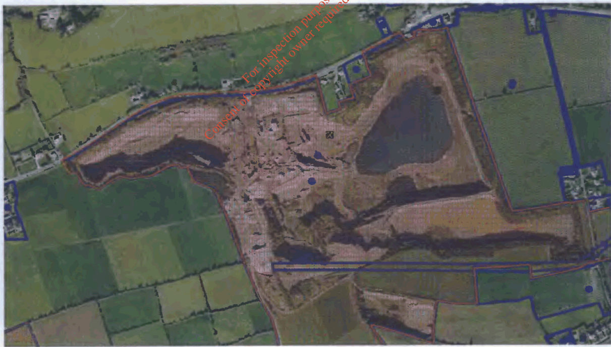
Aerial photo 2005