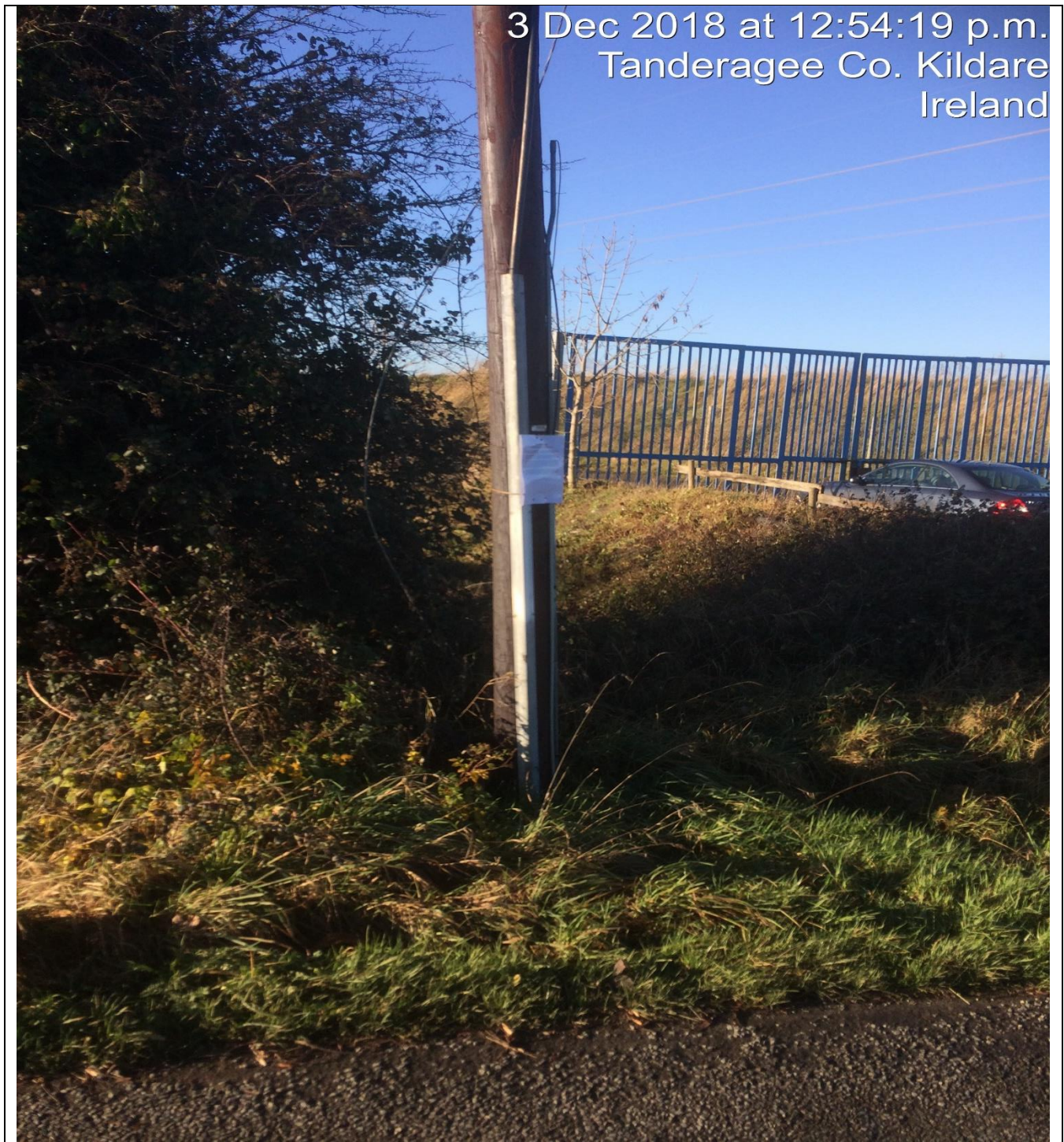
Photo 2: Site Notice No.2 (Laminated) securely erected to ESB post (Time stamped 03.12.18 12.54 hrs)