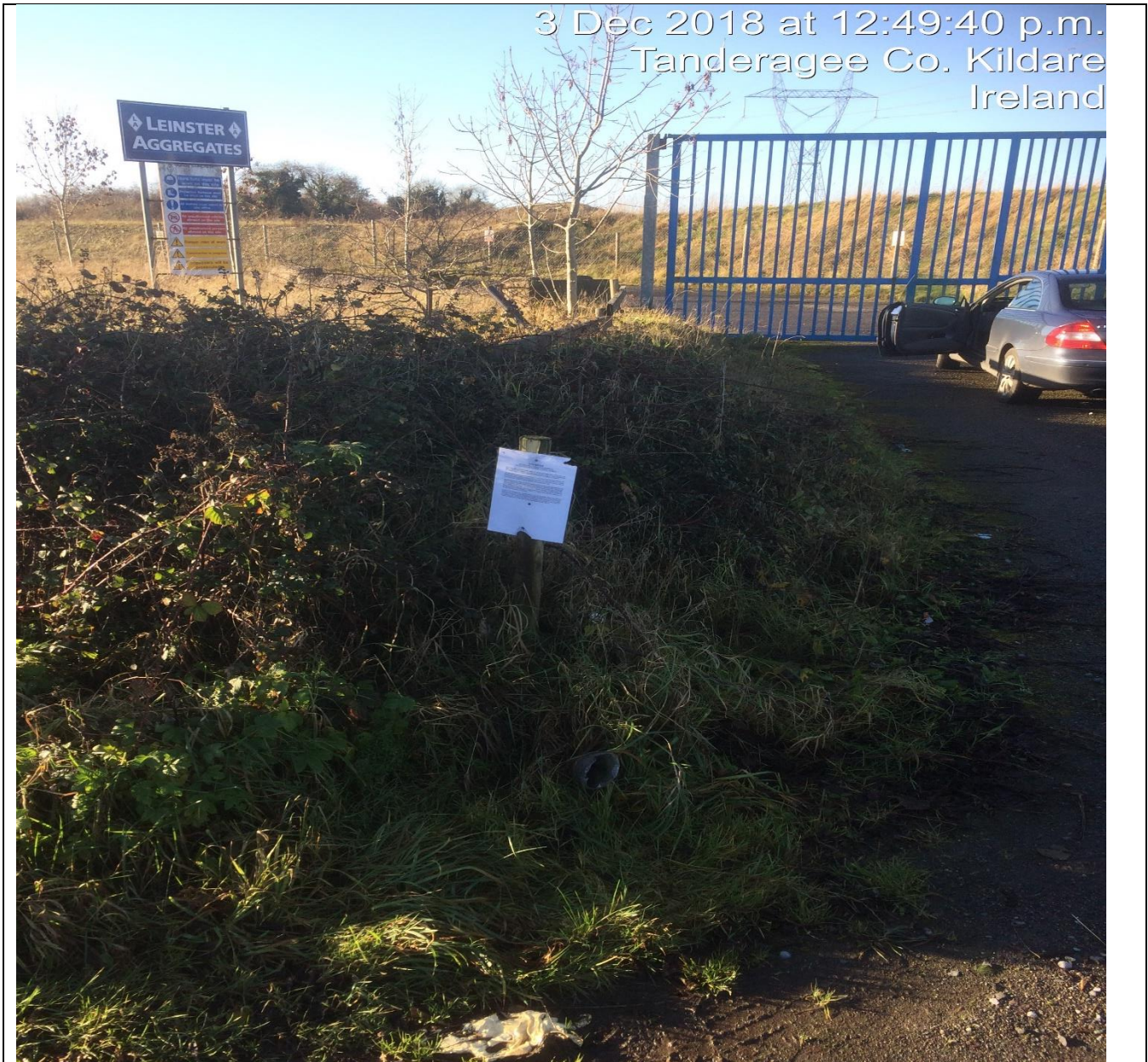
Photo 1: Placement of Site Notice No.1 (laminated) on left hand side fence post at entrance (time stamped 03.12.18 at 12.49 hrs)