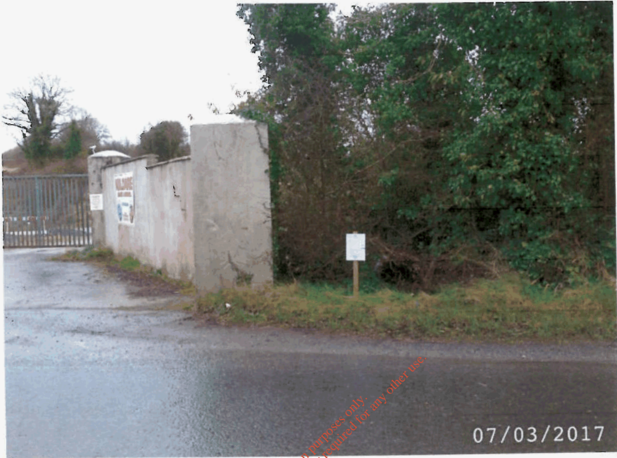
Figure 2.0 Site Notice in situ on 07/03/2017 (ii)

I can confirm that I passed the site on 21/03/2017 and the Notice was still in place and intact.