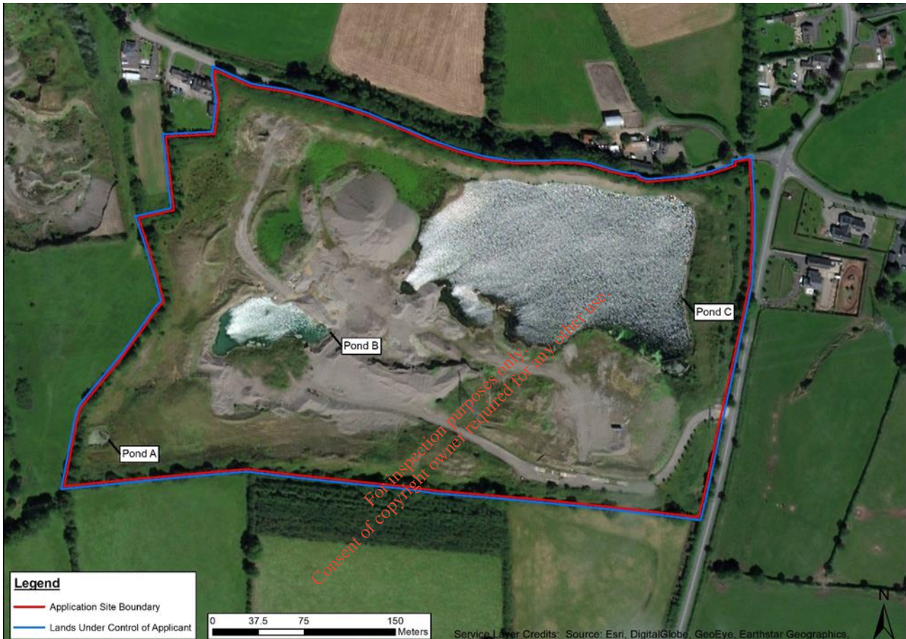
Figure NTS-3: Aerial image showing the current site layout (red/blue = application/ownership boundary)

Excavation of material took place beneath the water table to an estimated maximum depth of ca. 75.0 m OD in Ponds B and C. The largest pond, Pond C, has a surface area of approximately 2.65 ha and a volume of approximately 74,000 m 3 below a reference level of 78.5 m OD. Pond B, has a surface area of approximately 0.29 ha and a volume of approximately 9,000 m 3 also below a reference water level of ca. 78.5 m OD.