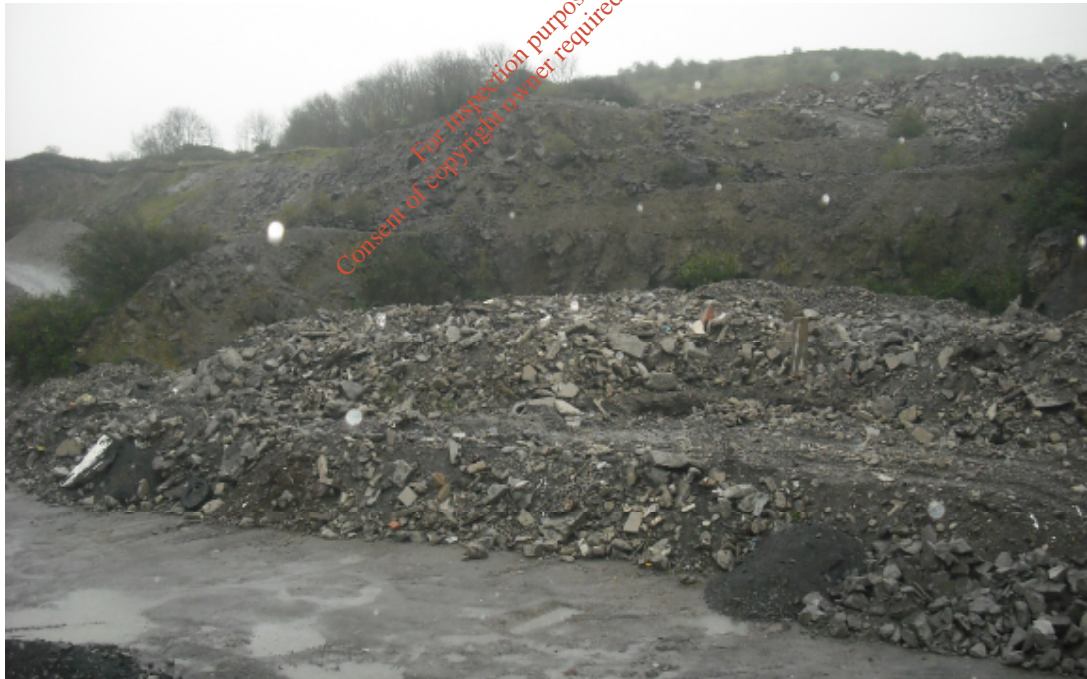
Plate 11-3 View of Area 2, the Central Quarry Area, looking South