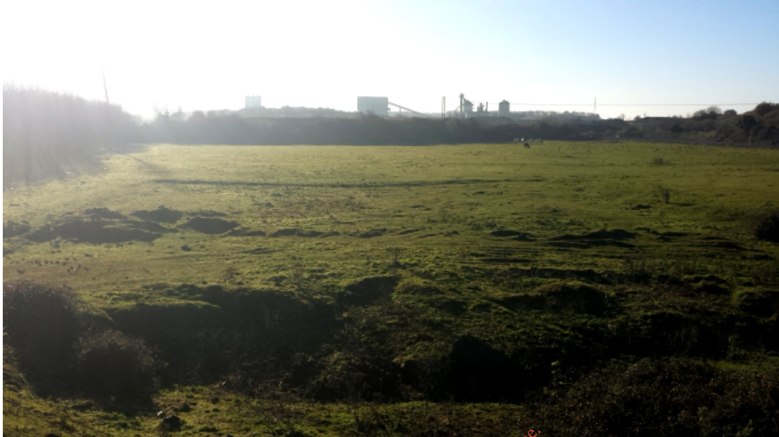
Plate 11-2 View of Area 1 Looking South