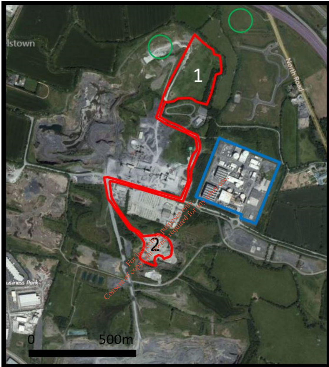
Plate 11-1 Aerial Photograph Showing the Application Area Outlined in Red and the fieldwork areas numbered