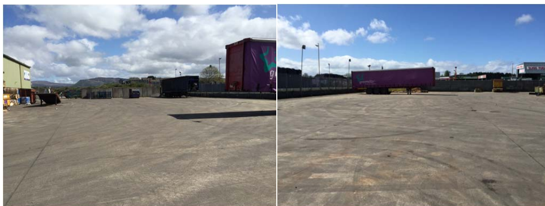
Figure 2 – Topography of site

system comprises a number of stormwater drains, manholes, gullies and interceptors. Soils and subsoils of the surrounding area are mapped as made ground. The terrain of the site can be described as relatively flat (Figure 2). An elevation of 6 m OD (Malin) is mapped to the south-east of the site.