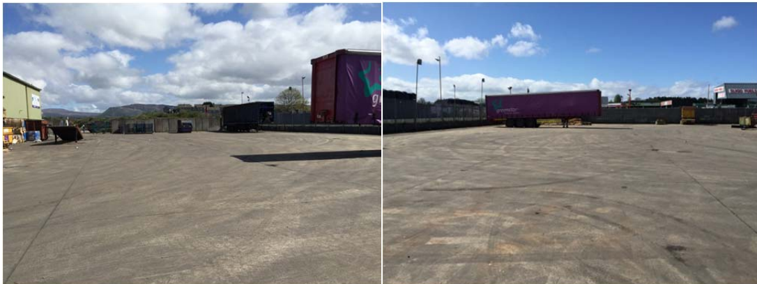
Figure 2 – Topography of site

system comprises a number of stormwater drains, manholes, gullies and interceptors. Soils and subsoils of the surrounding area are mapped as made ground. The terrain of the site can be described as relatively flat (Figure 2). An elevation of 6 m OD (Malin) is mapped to the south-east of the site.