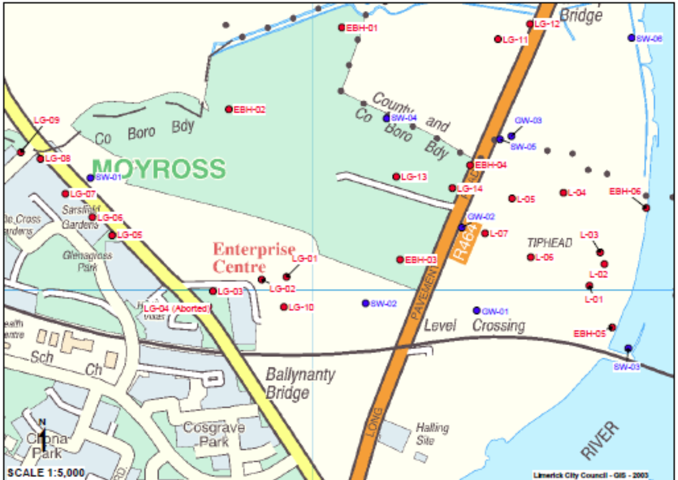
Site map showing sampling locations