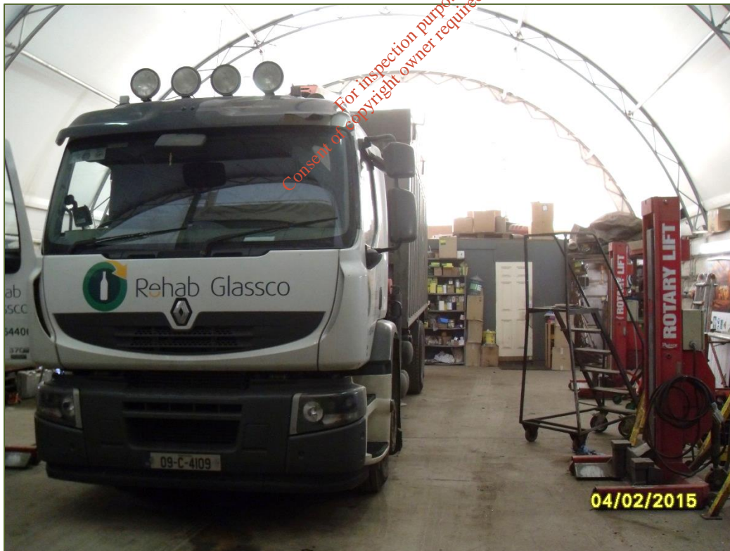
Photograph D.1.10: Garage/vehicle workshop plant and equipment