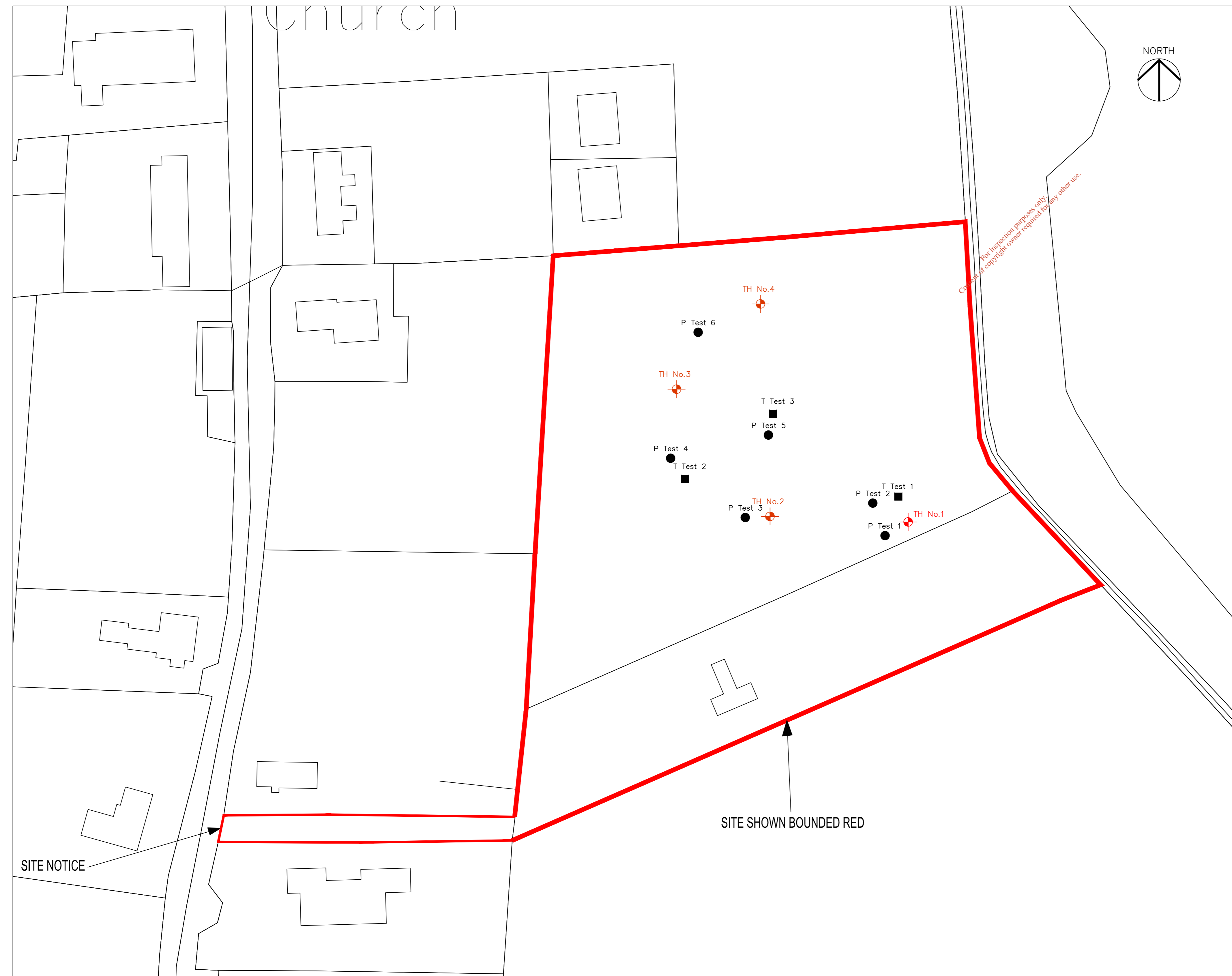
SITE LAYOUT PLAN SCALE : 1/500