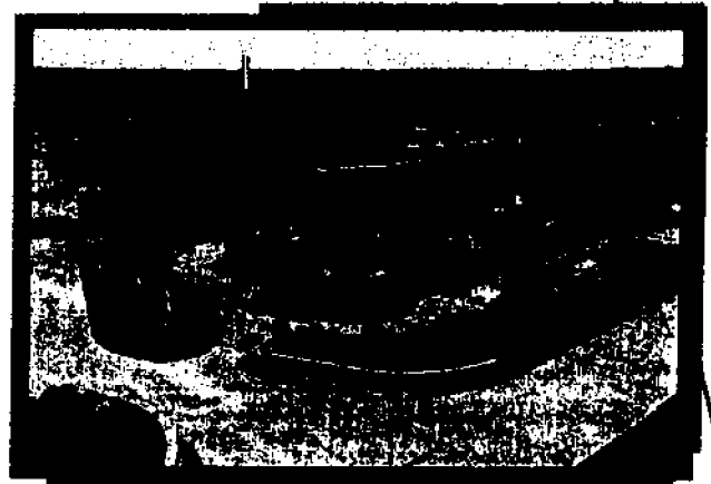
Artists impression of the proposed facility