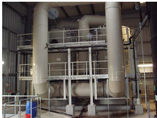
Typical Acid Scrubber

The scrubber will also be equipped with a bunded acid storage tank and an ammonium sulphate tank.