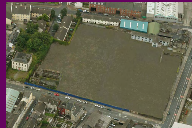
Planned Post Remediation