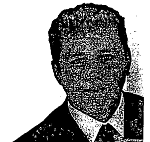
Senator Thomas Byrne