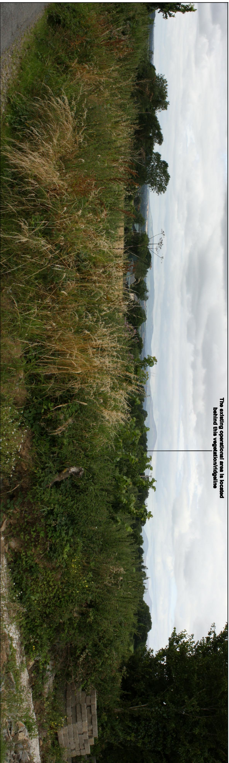
The existing operational area is located behind this vegetation/ridgeline