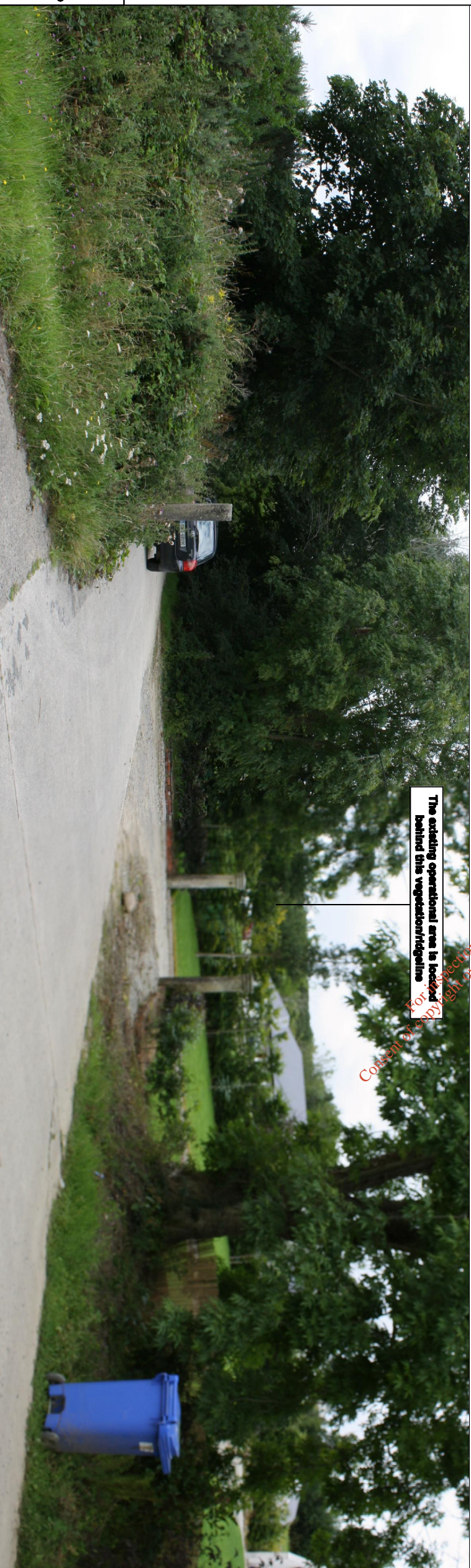
The existing operational area is located behind this vegetation/ridgeline