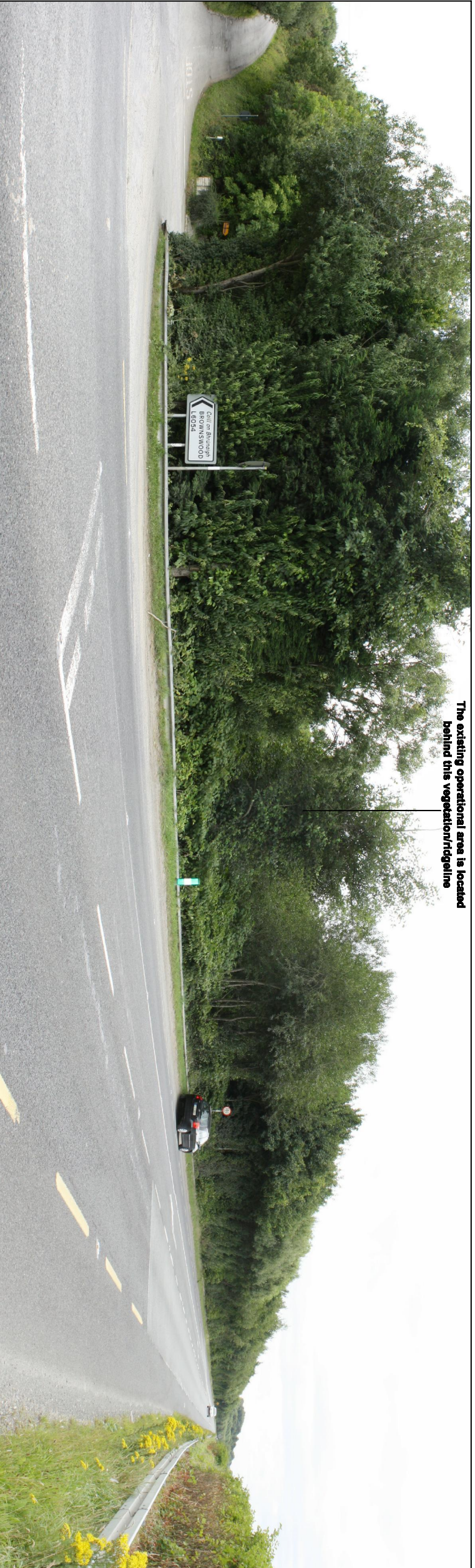
The existing operational area is located behind this vegetation/ridge/line

VIEWPOINT A: JUNCTION AND SITE BOUNDARY ALONG THE N11 NATIONAL ROAD & L6054 LOCAL ROAD TO THE ENTRANCE OF BROWNSWOOD QUARRY