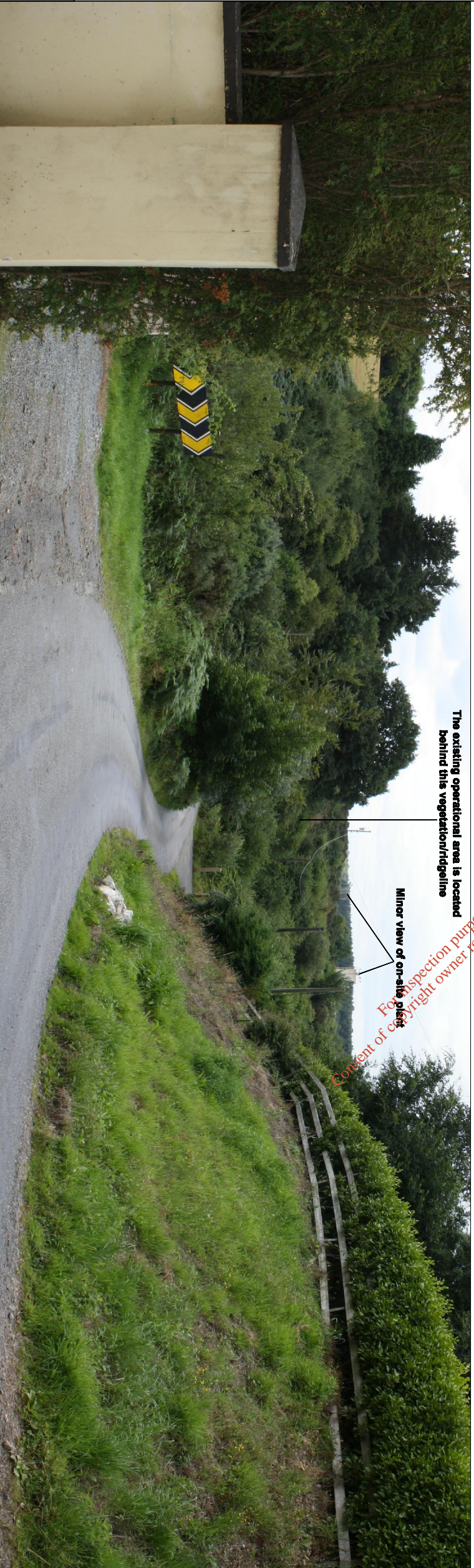
The existing operational area is located behind this vegetation/ridge/line