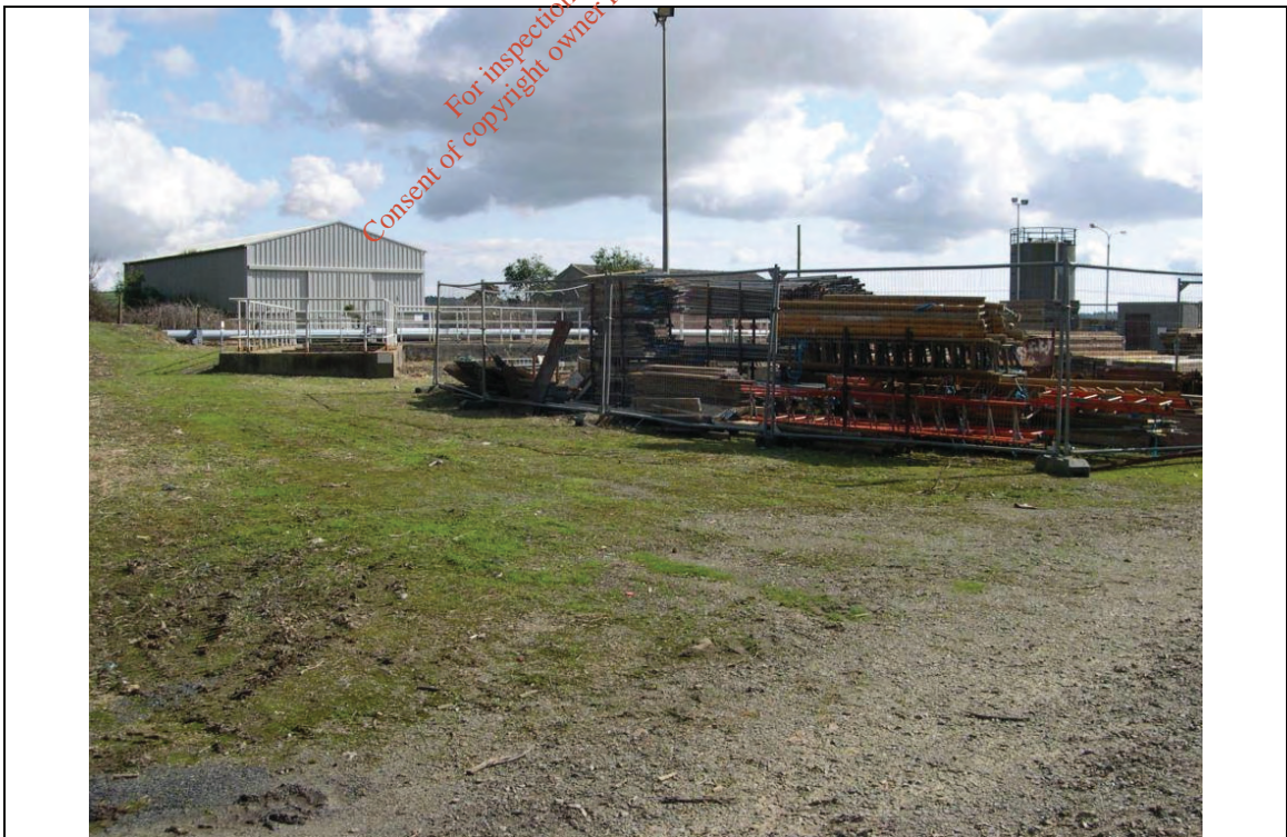
Location No: 9 View southeast.