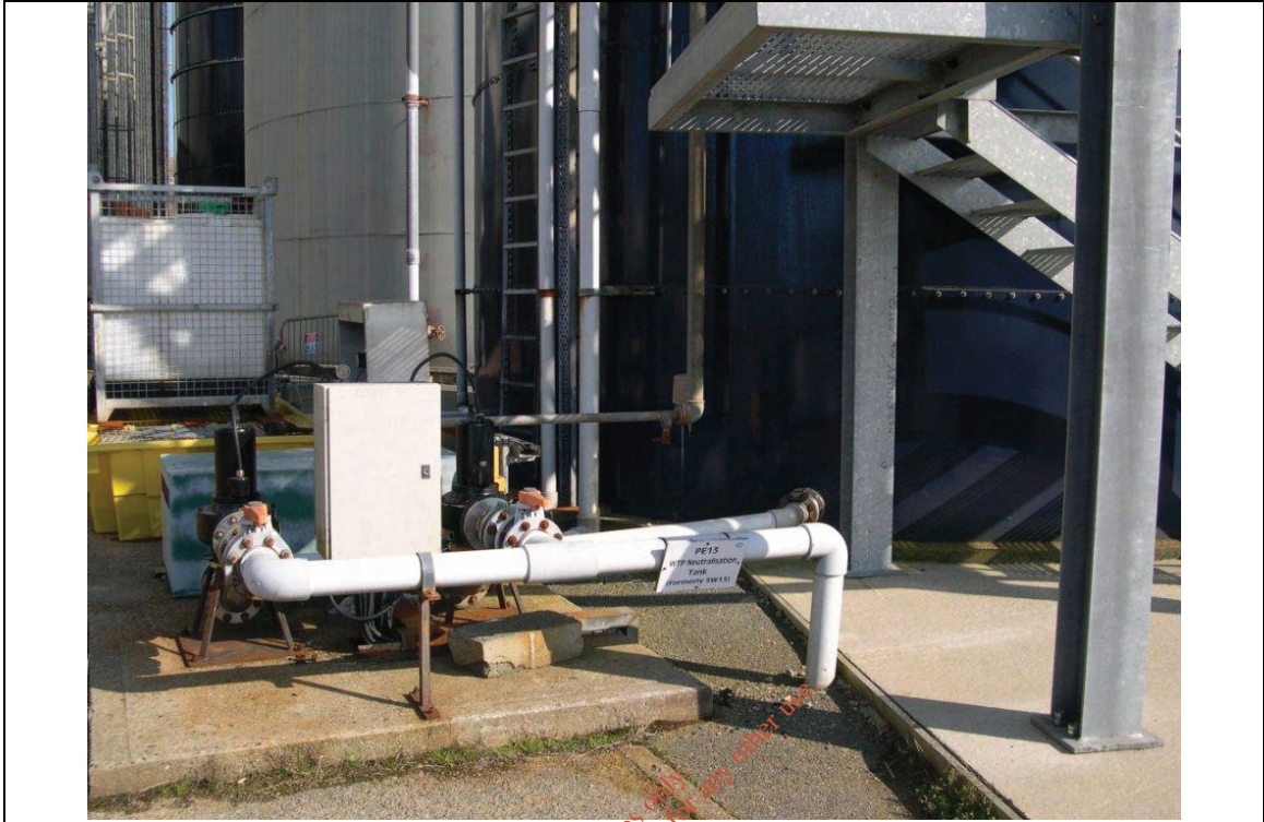
Location No: 14 View of the water treatment plant.