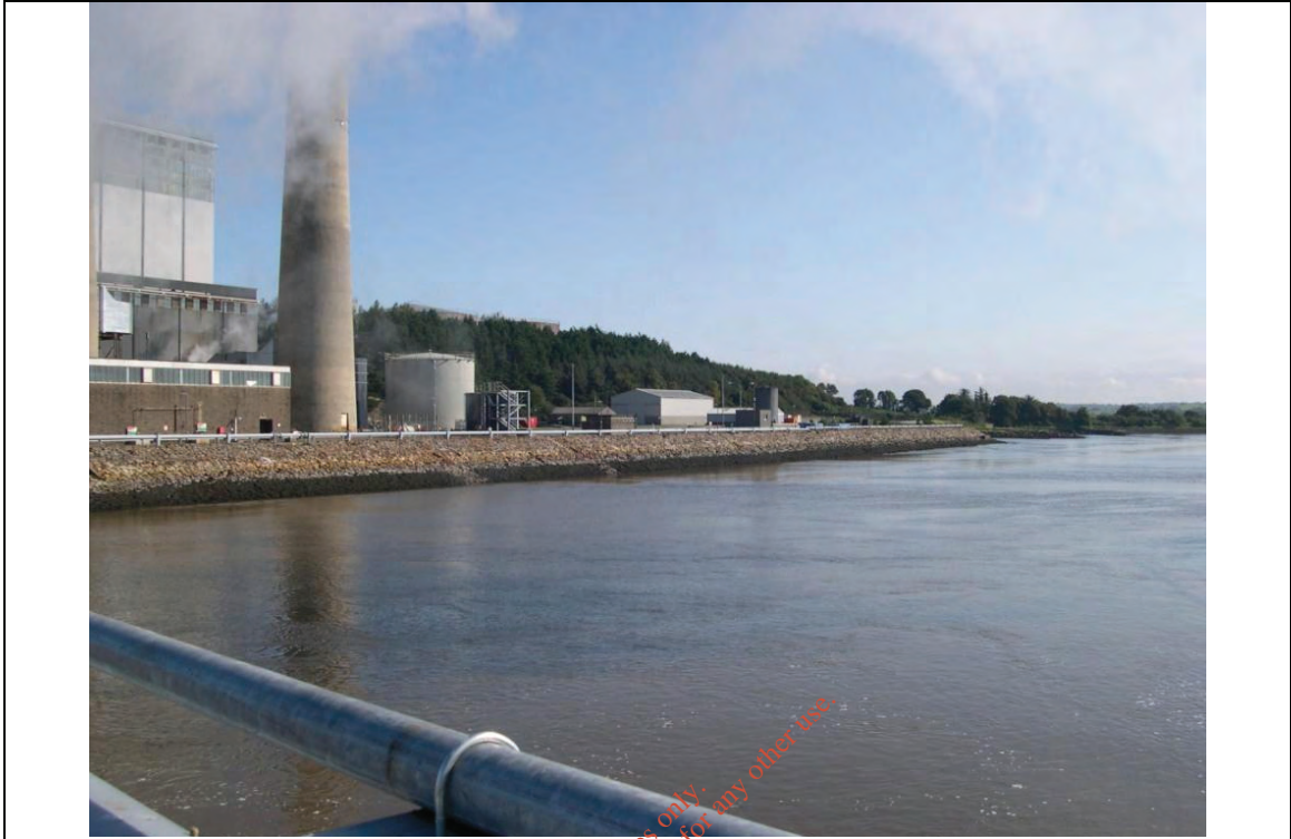
Location No: 2 View northeast from Jetty.