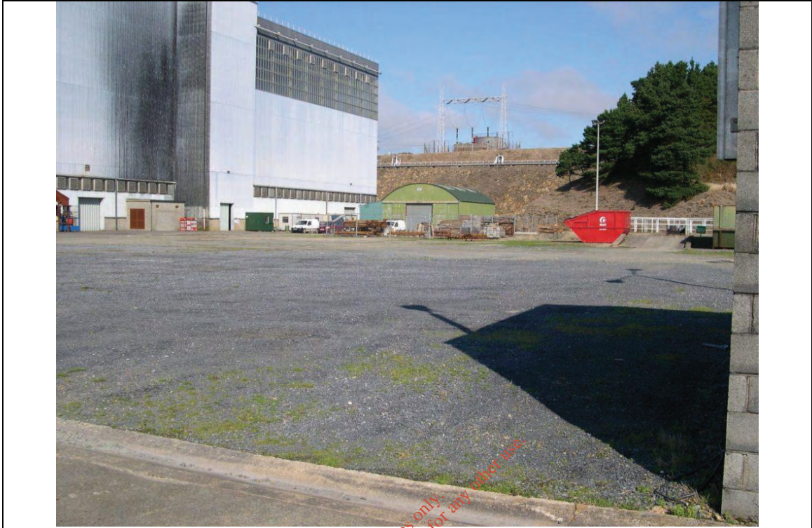
Location No: 5 View north west towards Power Gen building.