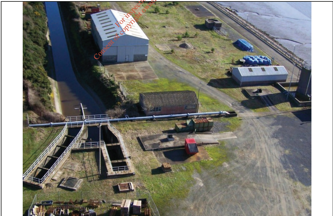
Location No: 1 View southeast from Power Gen building rooftop.