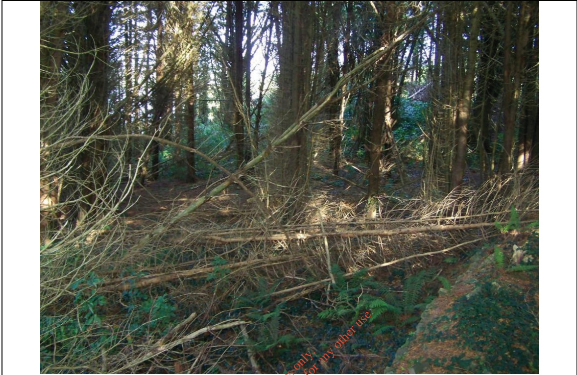
Location No: 12 View south of the woods.