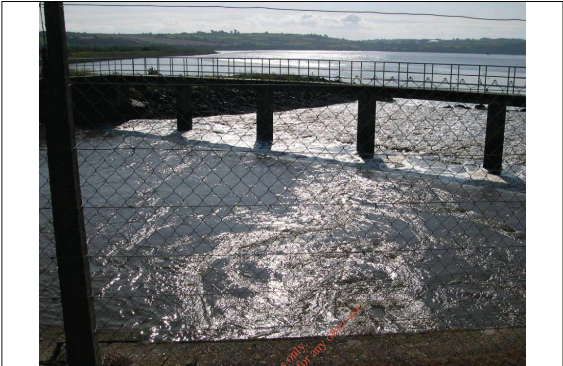
Location No: 8 View south at water channel out flow.