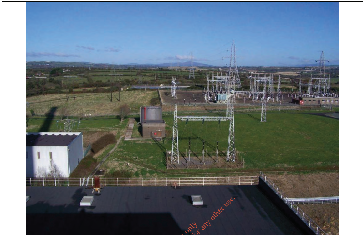
Location No: 1 View north from Power Gen building rooftop.