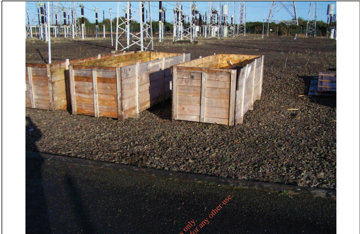
Location No: 10 View north 220 kV switching yard.