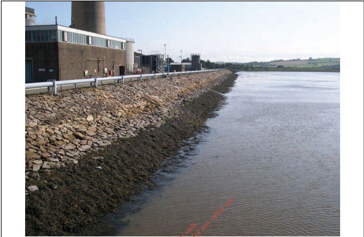
Location No: 3 View east from Jetty.