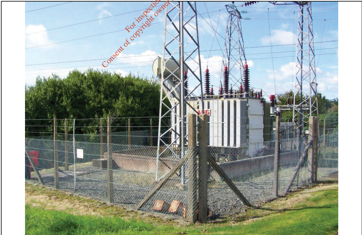
Location No: 13 View southwest 110 kV switching yard.