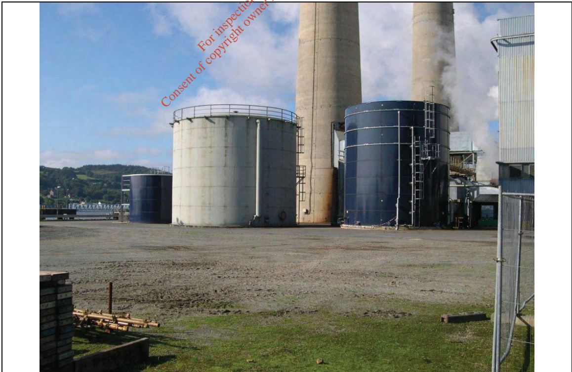
Location No: 6 View west towards chimneys.