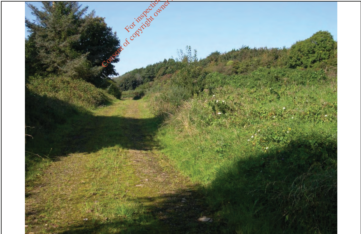
Location No: 15 View east along laneway to landfill cells.