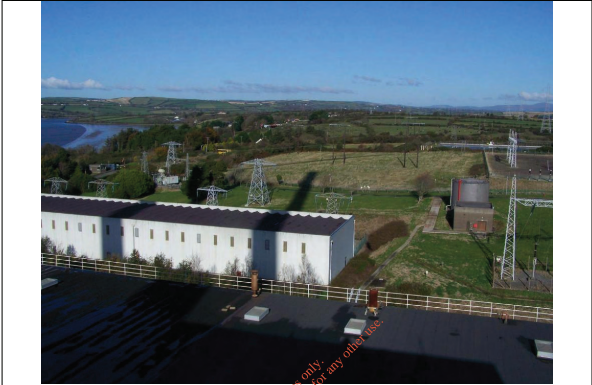
Location No: 1 View northwest from Power Gen building rooftop.