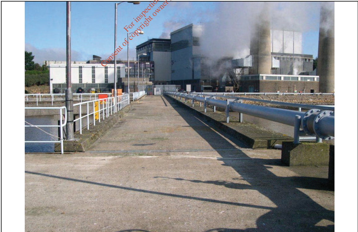
Location No: 2 View north from Jetty towards generating building.