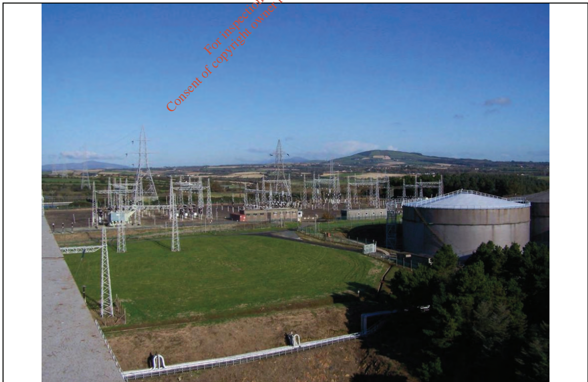
Location No: 1 View northeast from Power Generating building rooftop.