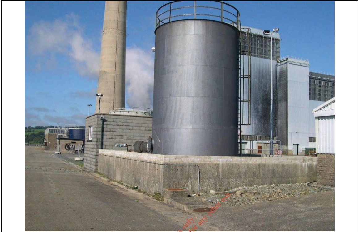
Location No: 4 Stripping Tank.