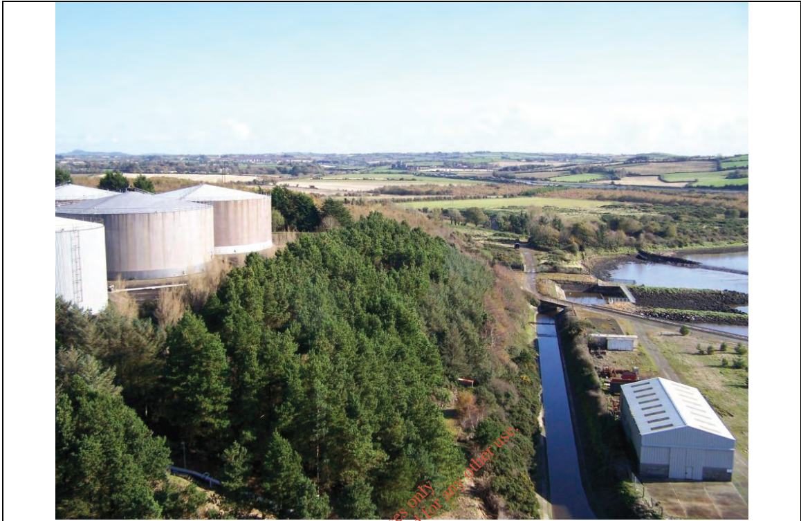
Location No: 1 View east from Power Gen building rooftop.