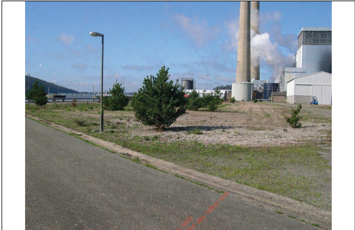
Location No: 7 View west towards chimneys.