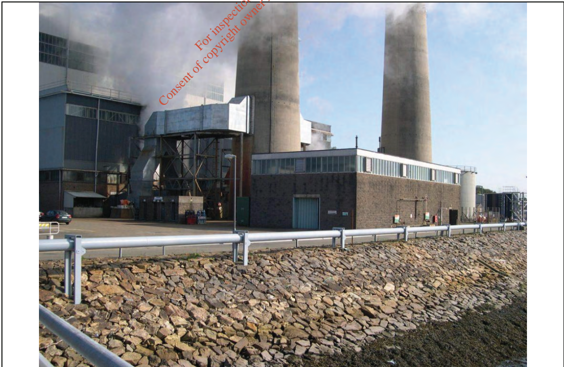
Location No: 3 View northeast from Jetty