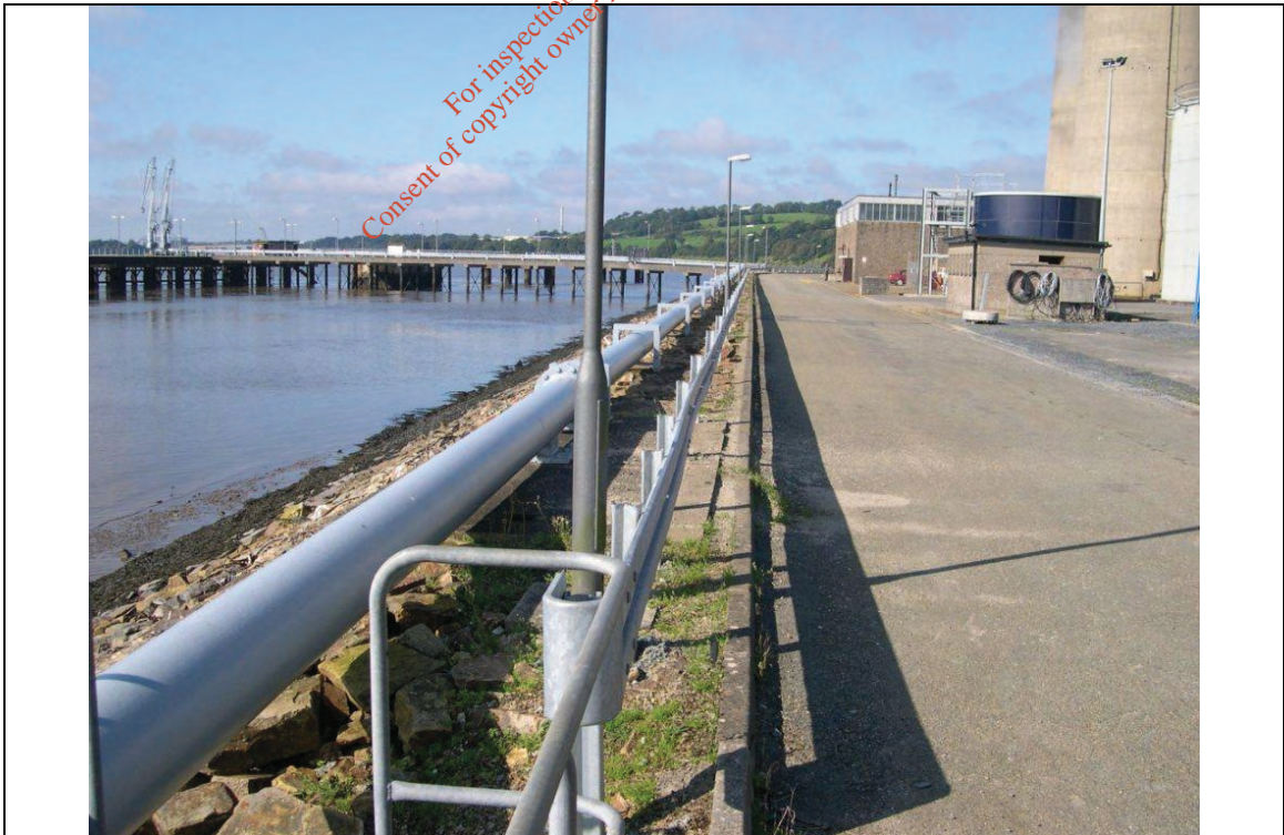
Location No: 4 View west along foreshore.