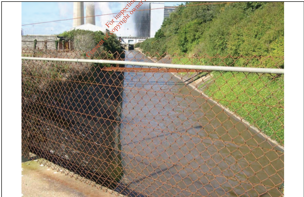
Location No: 8 View west along water channel.