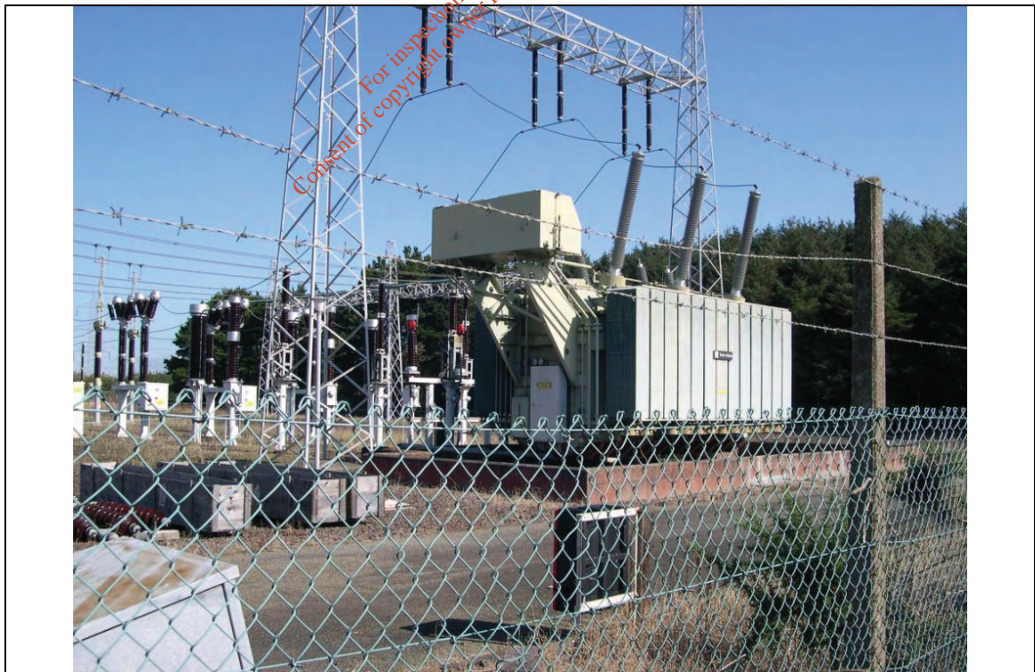
Location No: 11 View northeast 220 kV switching yard.