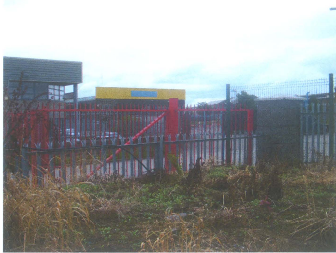
Photograph taken at D3

For inspection purposes only. Consent of copyright owner required for any other use.