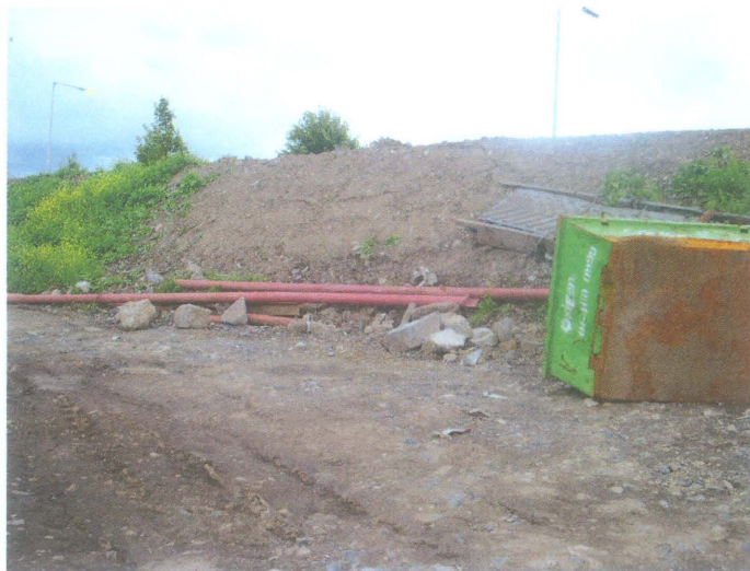
Photograph taken at D2