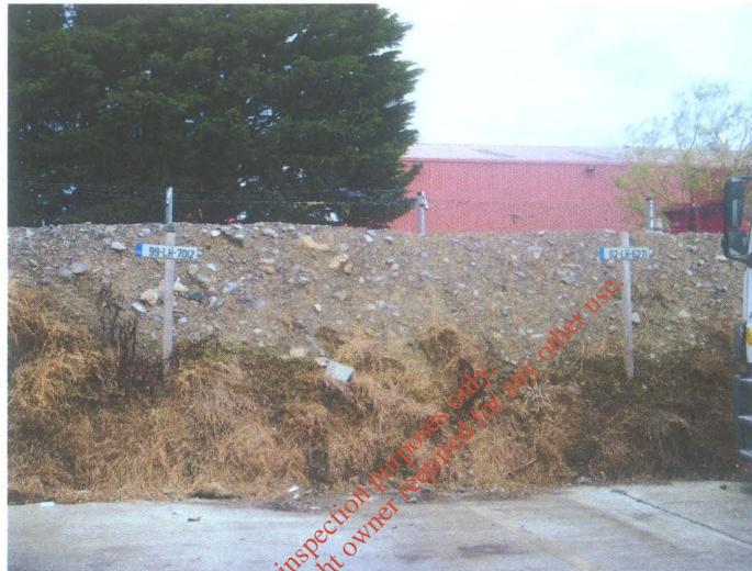
Photograph taken at D1