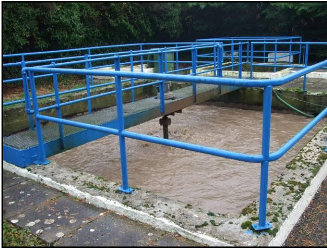
Plate 1 Errill WwTP which operates an activated sludge suspended growth process.