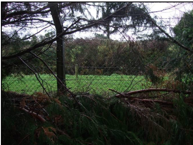
Plate 3 The discharge point is located at the back right hand corner of the WwTP and is gravity fed to the Erkina river.