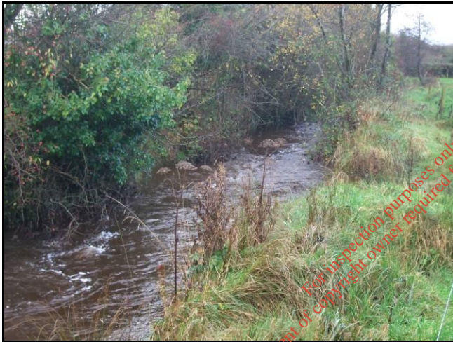
Plate 2 The Erkina River which receives discharge from Errill WwTP.