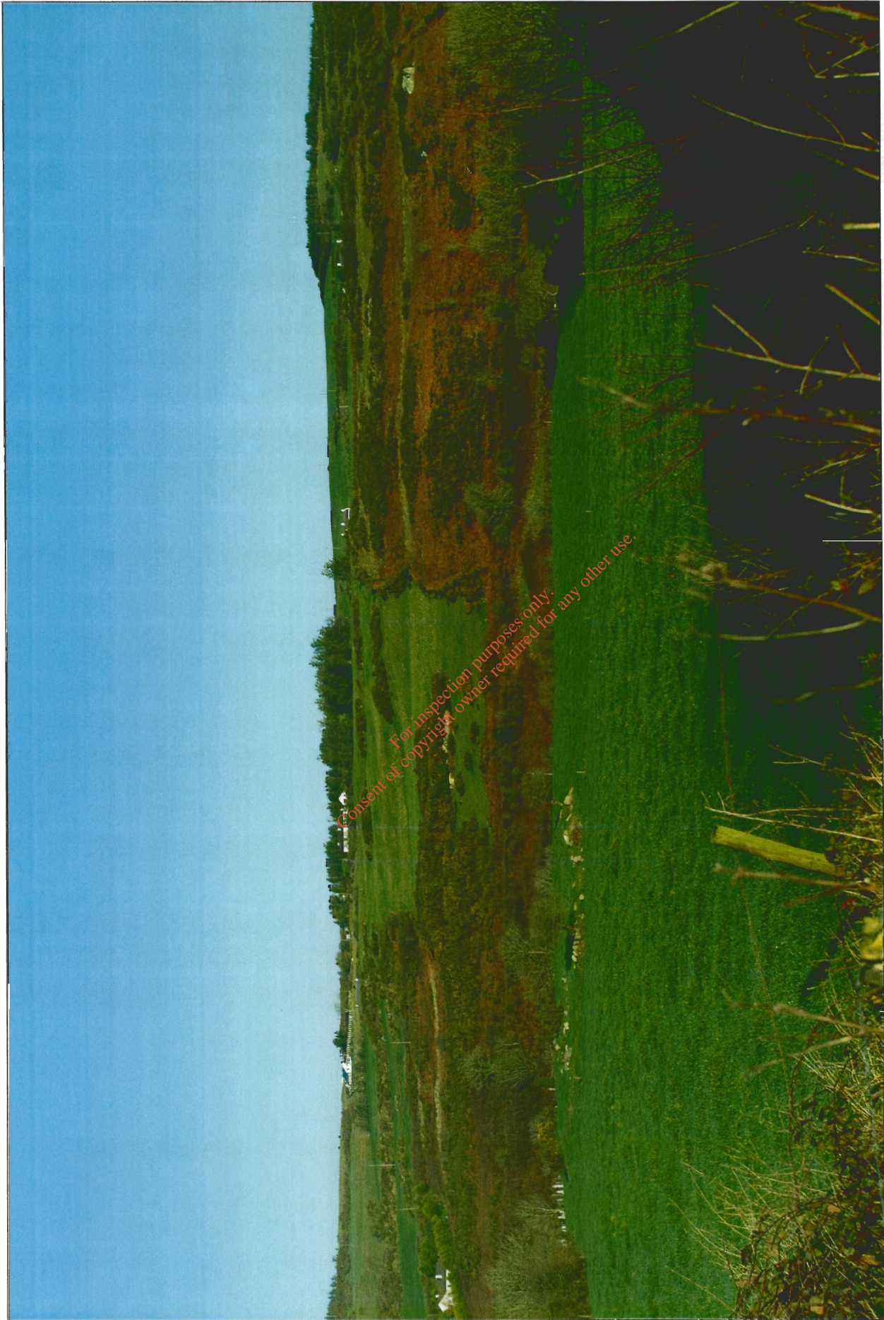
Plate A4: View Point B - Existing View