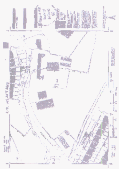
Key Plan Scale: NTS