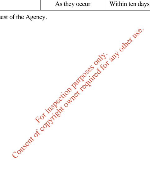
Note 1: Unless altered at the request of the Agency.