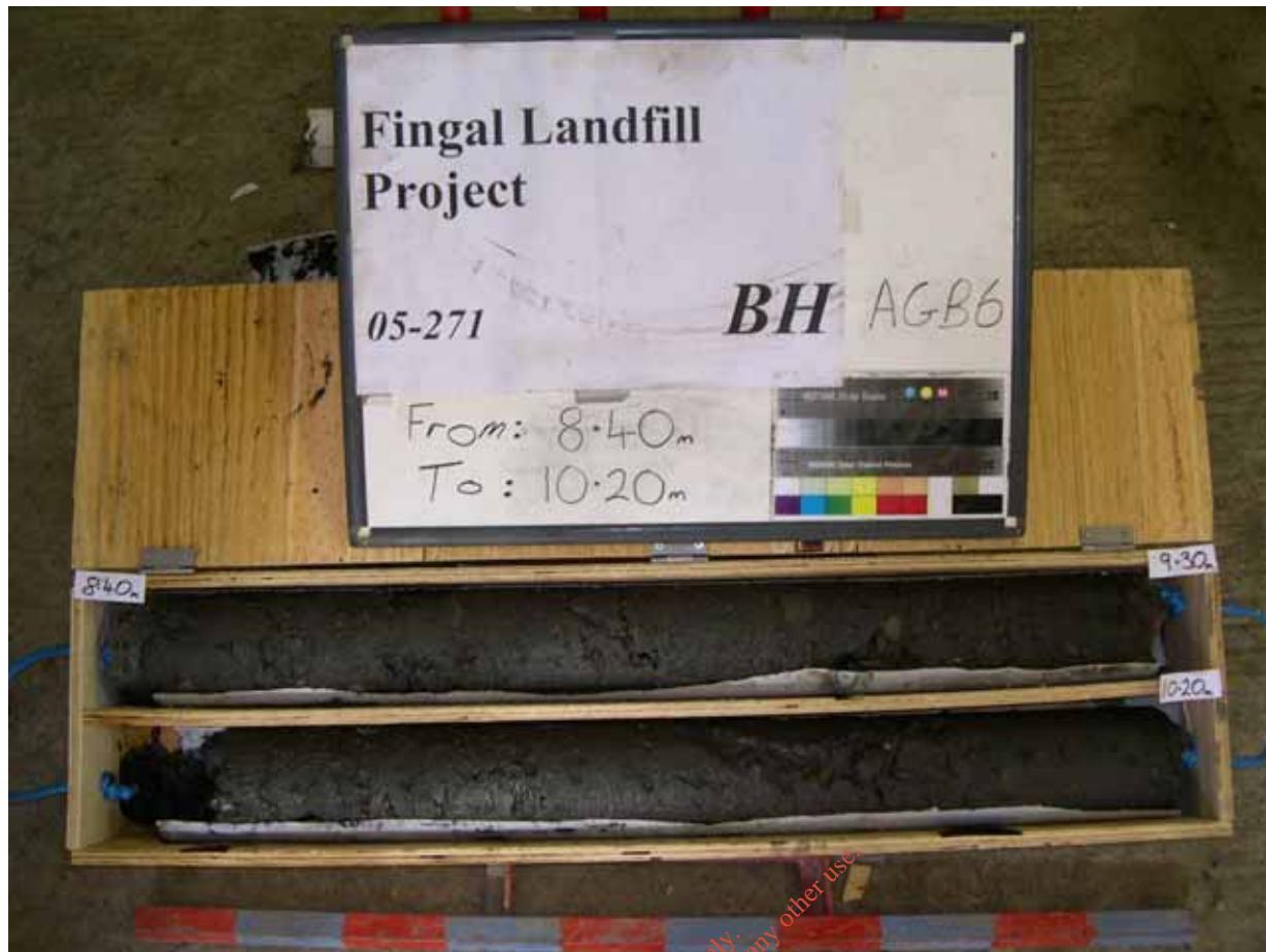
BH AGB6 8.40-10.20m