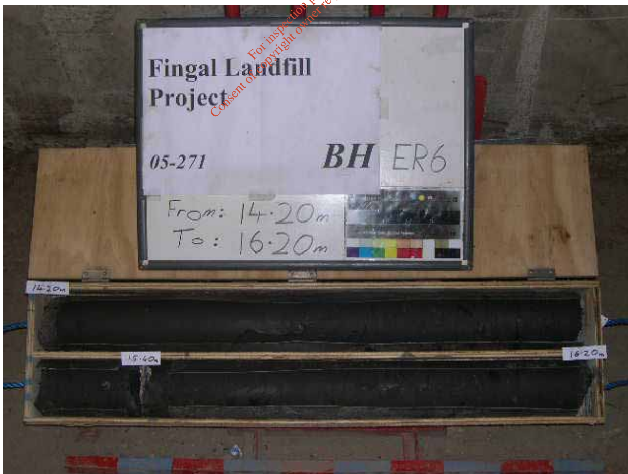
BH ER6: 14.20-16.20m