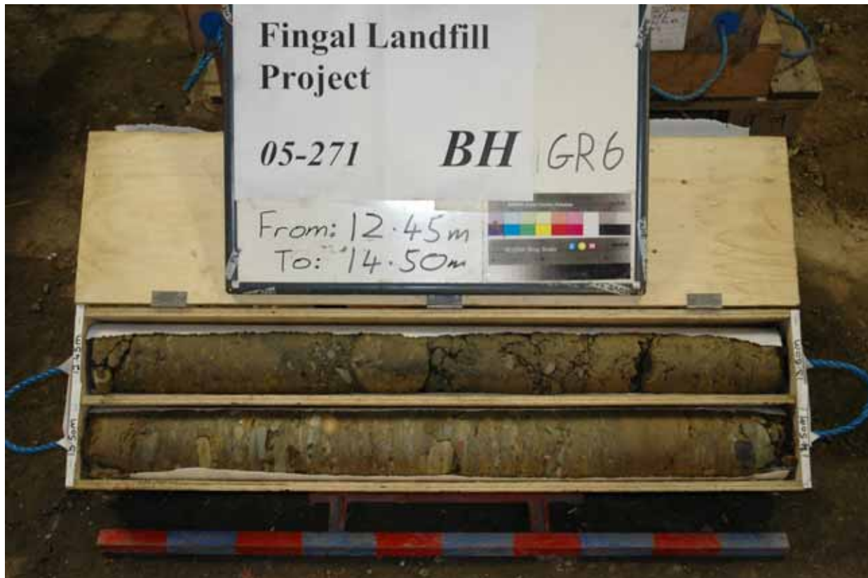
BH GR6: 12.45-14.50m