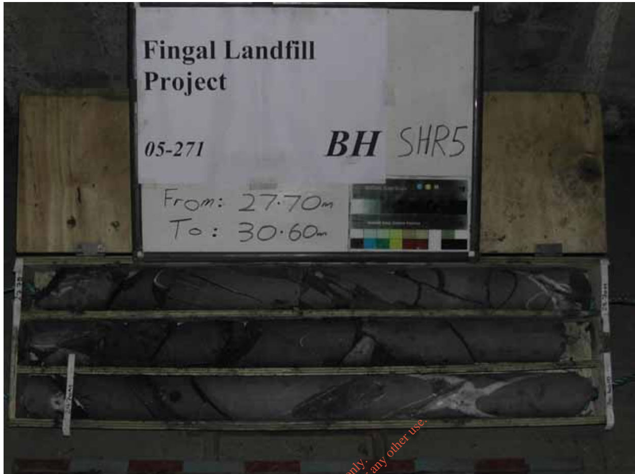
BH SHR5: 27.70-30.60m