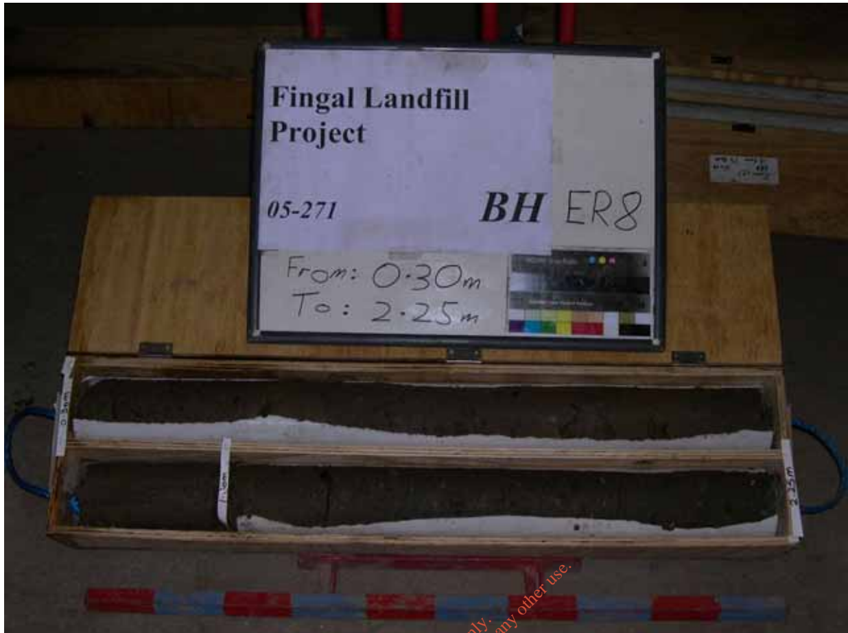
BH ER08: 0.30-2.25m