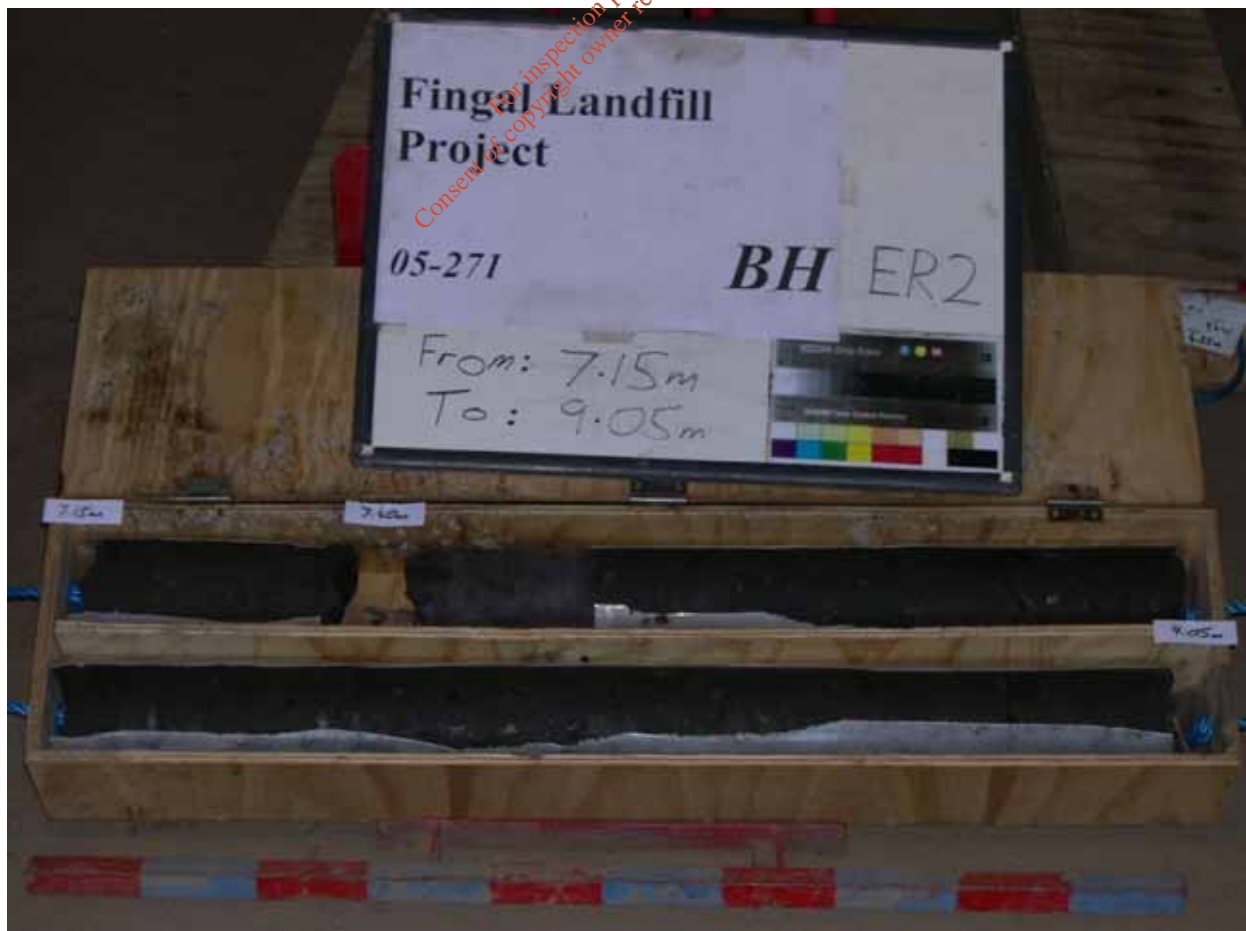
BH ER2: 7.15-9.05m