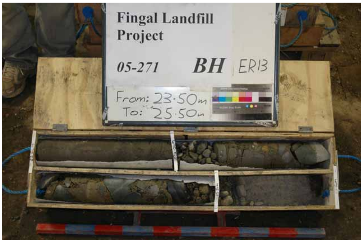
BH ER13: 23.50-25.50m

For inspection purposes only. Consent of copyright owner required for any other use.