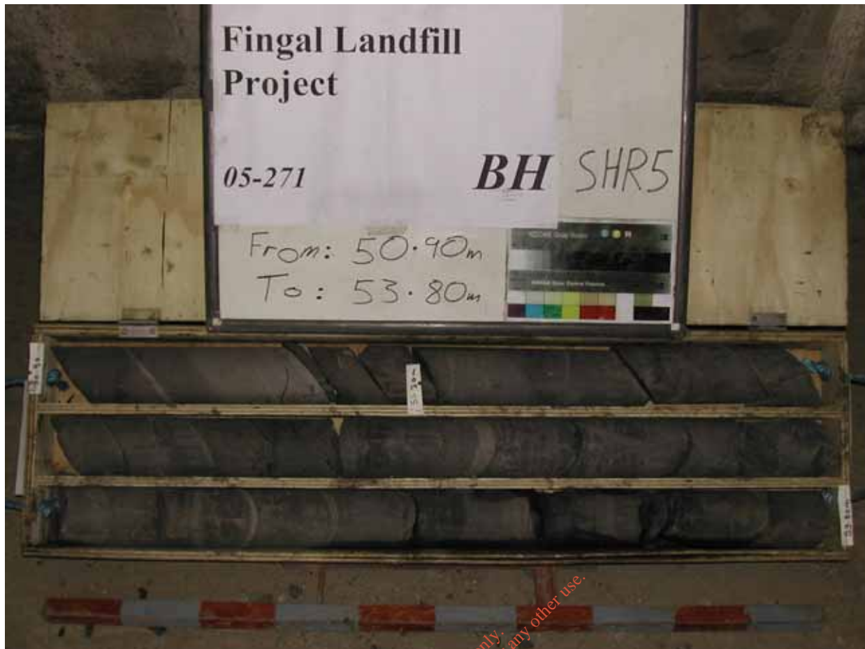
BH SHR5: 50.90-53.80m