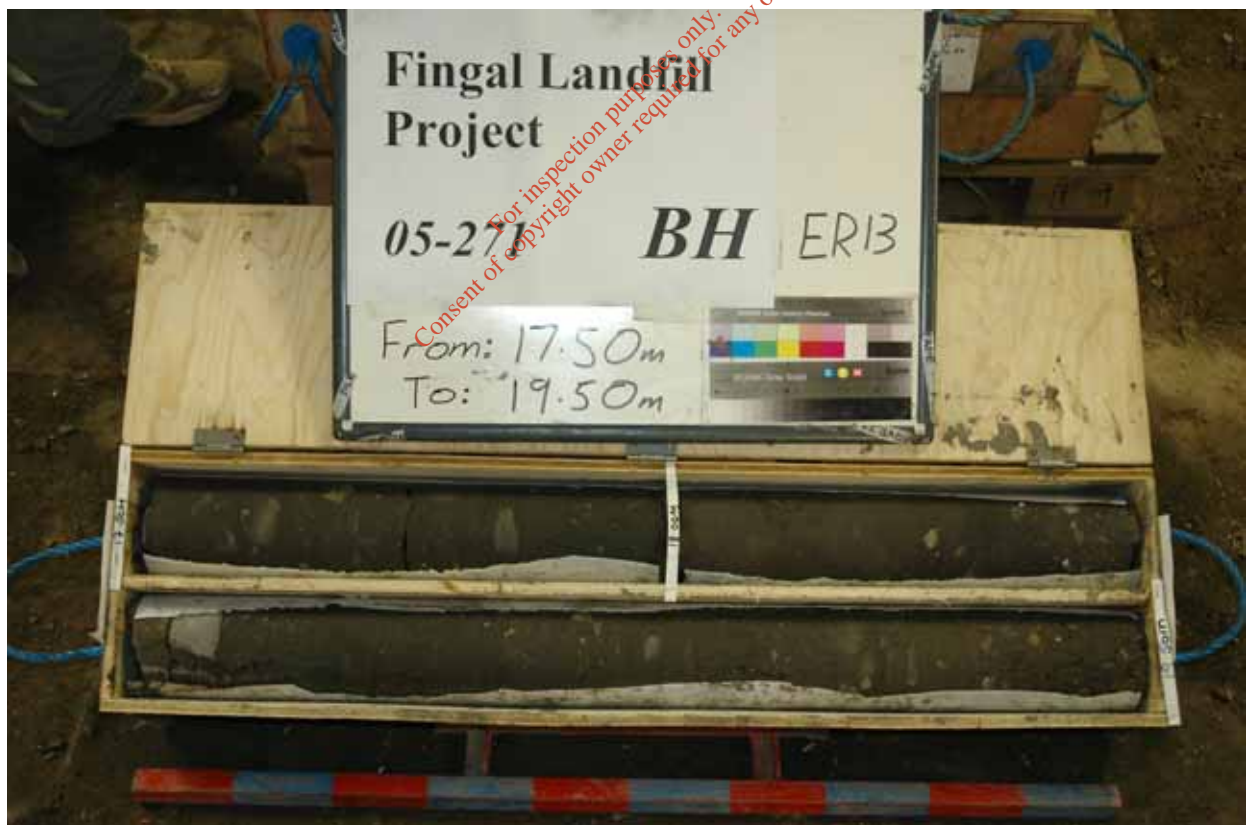
BH ER13: 17.50-19.50m