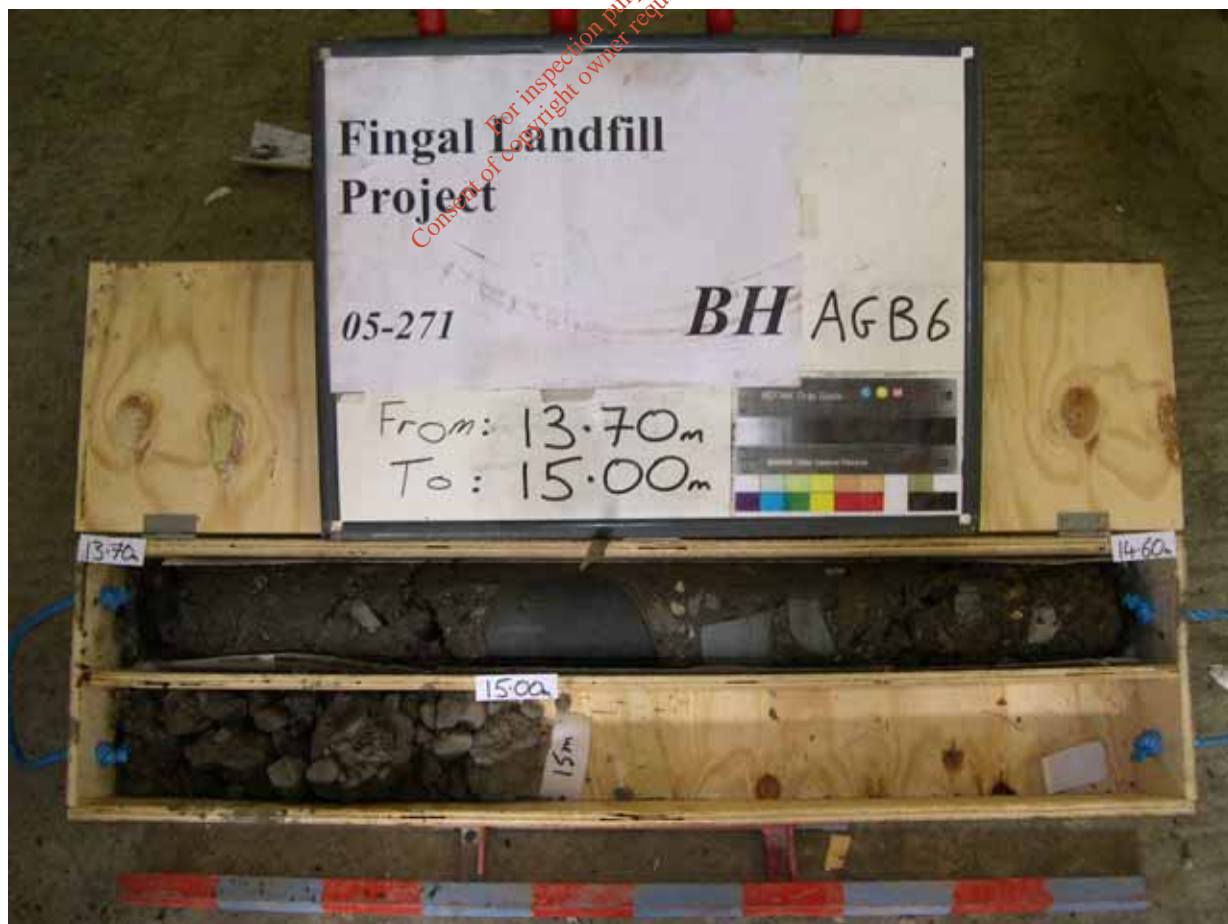
BH AGB6 13.70-15.00m