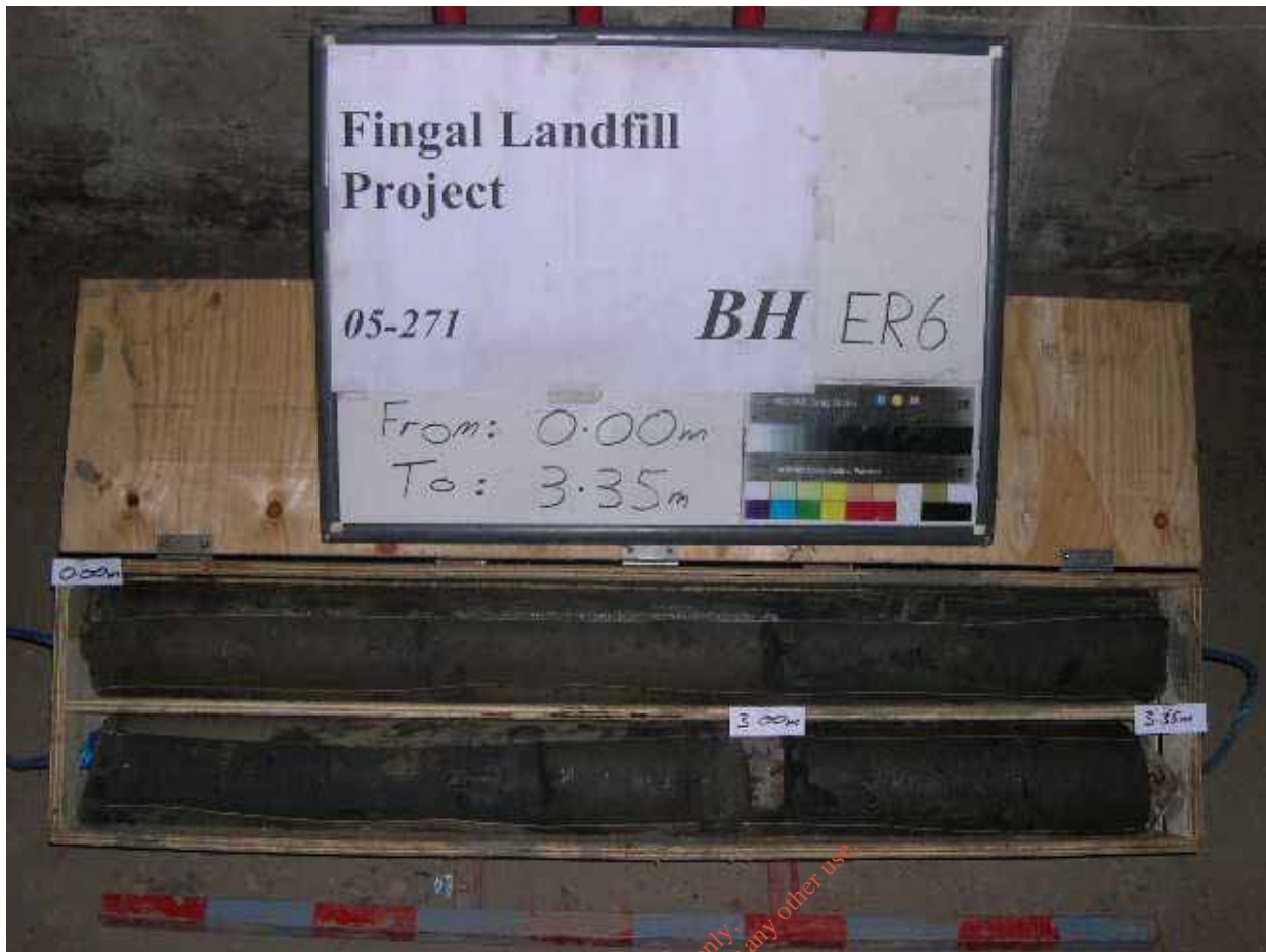
BH ER6: 0.00-3.35m