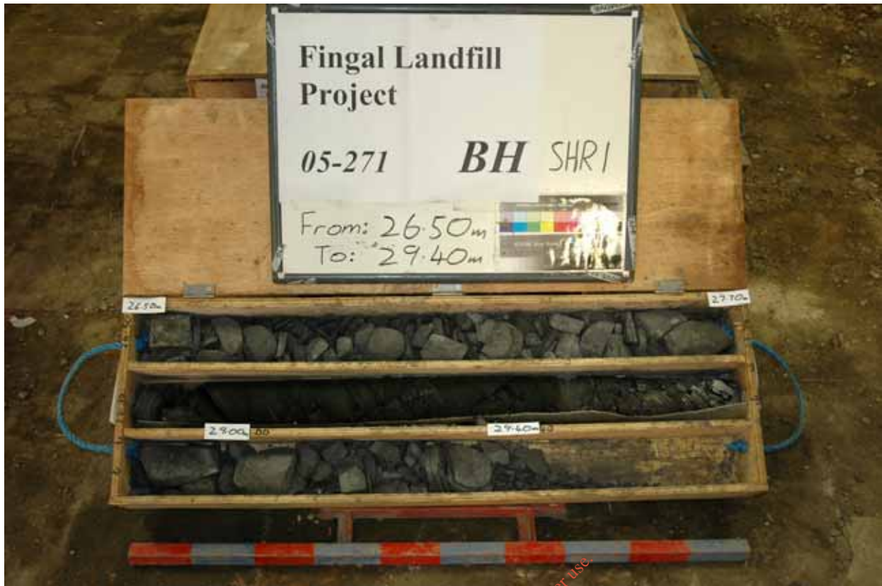
BH SHR1: 26.50-29.40m