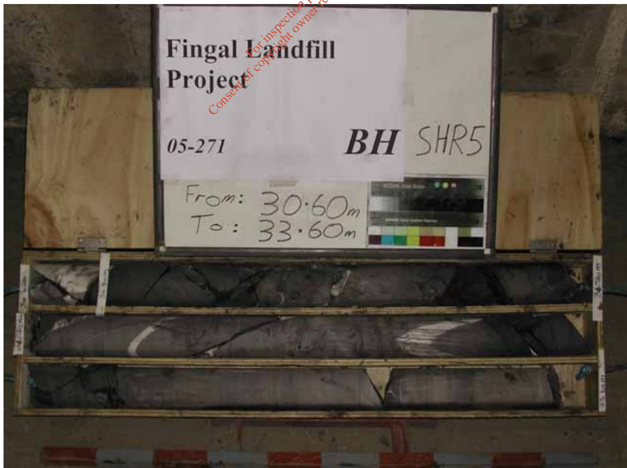
BH SHR5: 30.60-33.60m