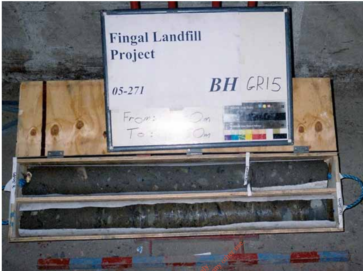
BH GR15: 8.30-10.50m