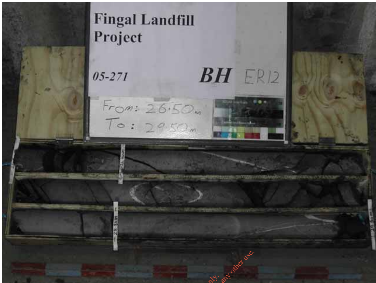
BH ER12: 26.50-29.50m