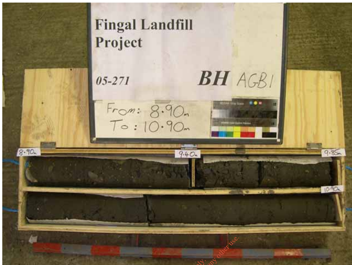
BH AGB1: 8.90-10.90m