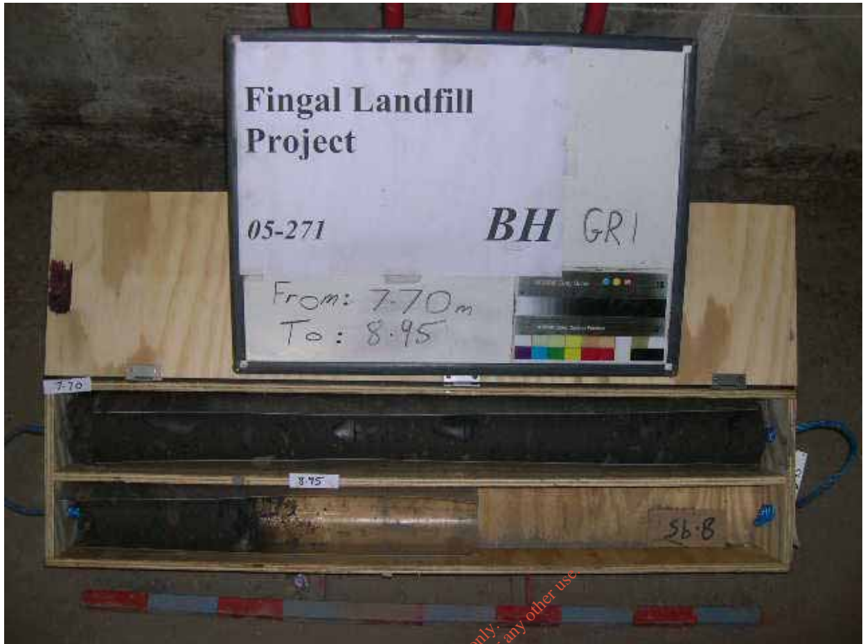
BH GR1: 7.70-8.95m