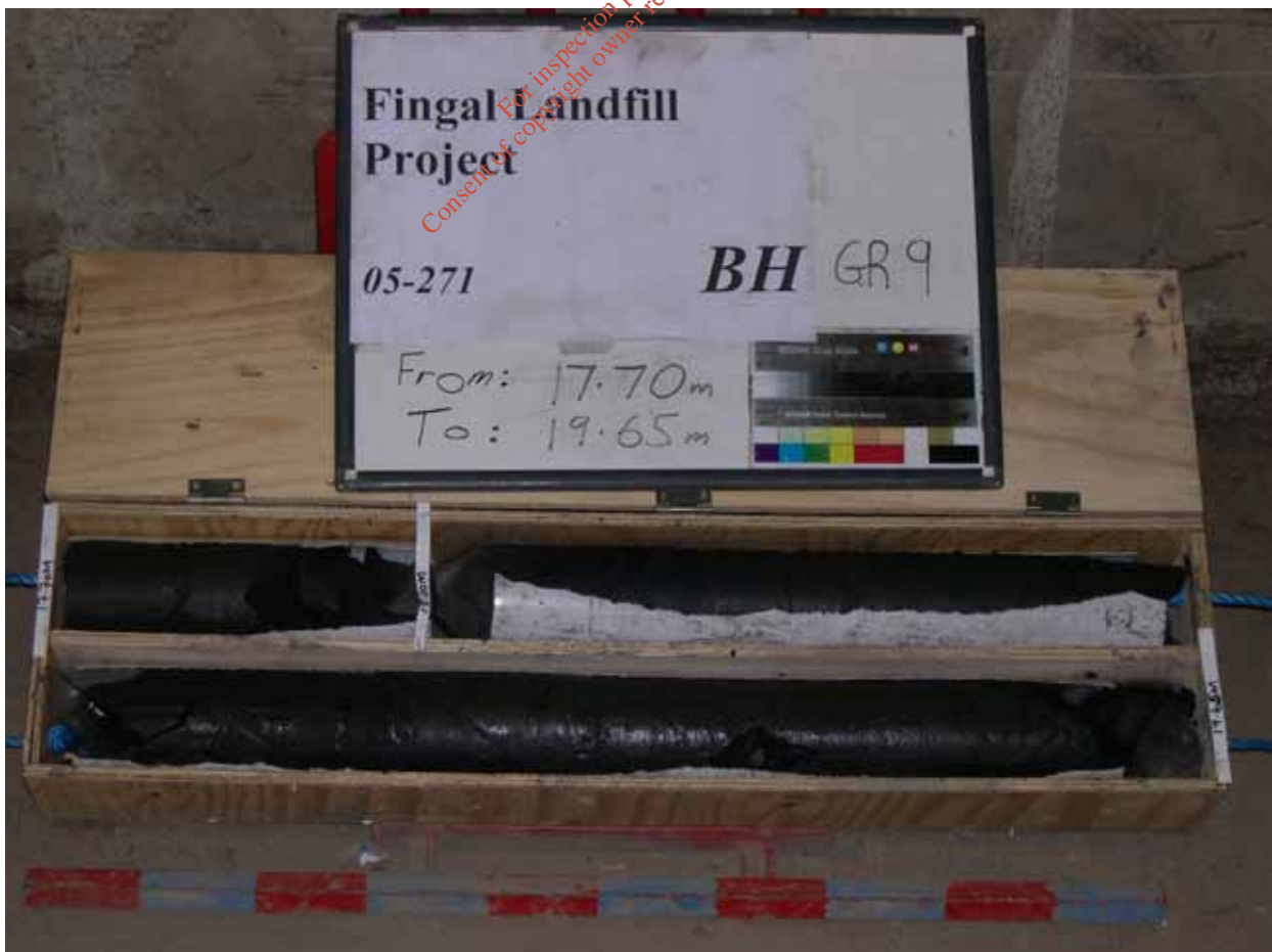
BH GR9: 17.70-19.65m