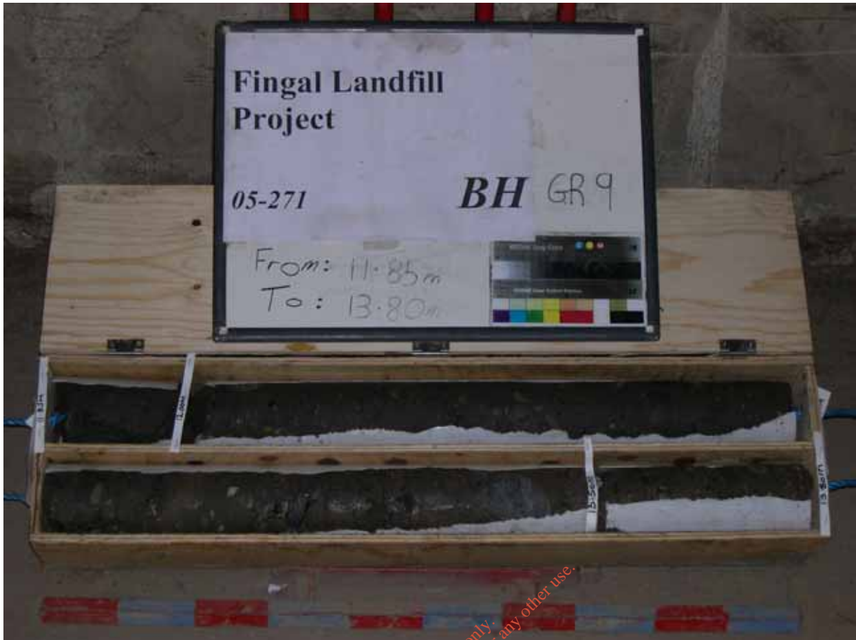
BH GR9: 11.85-13.80m