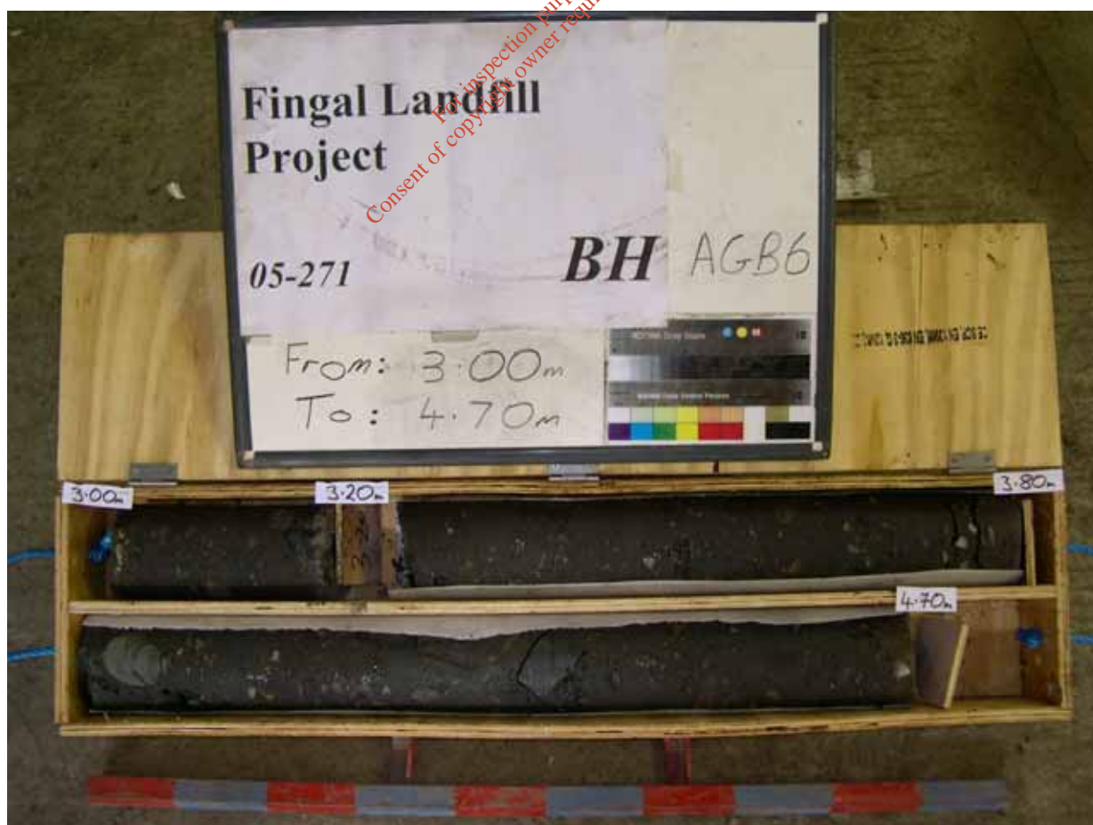
BH AGB6 3.00-4.70m