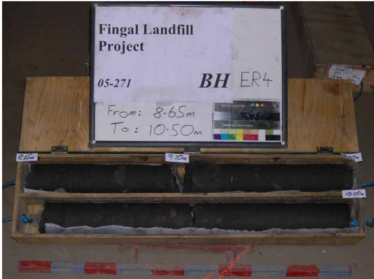
BH ER4: 8.65-10.50m