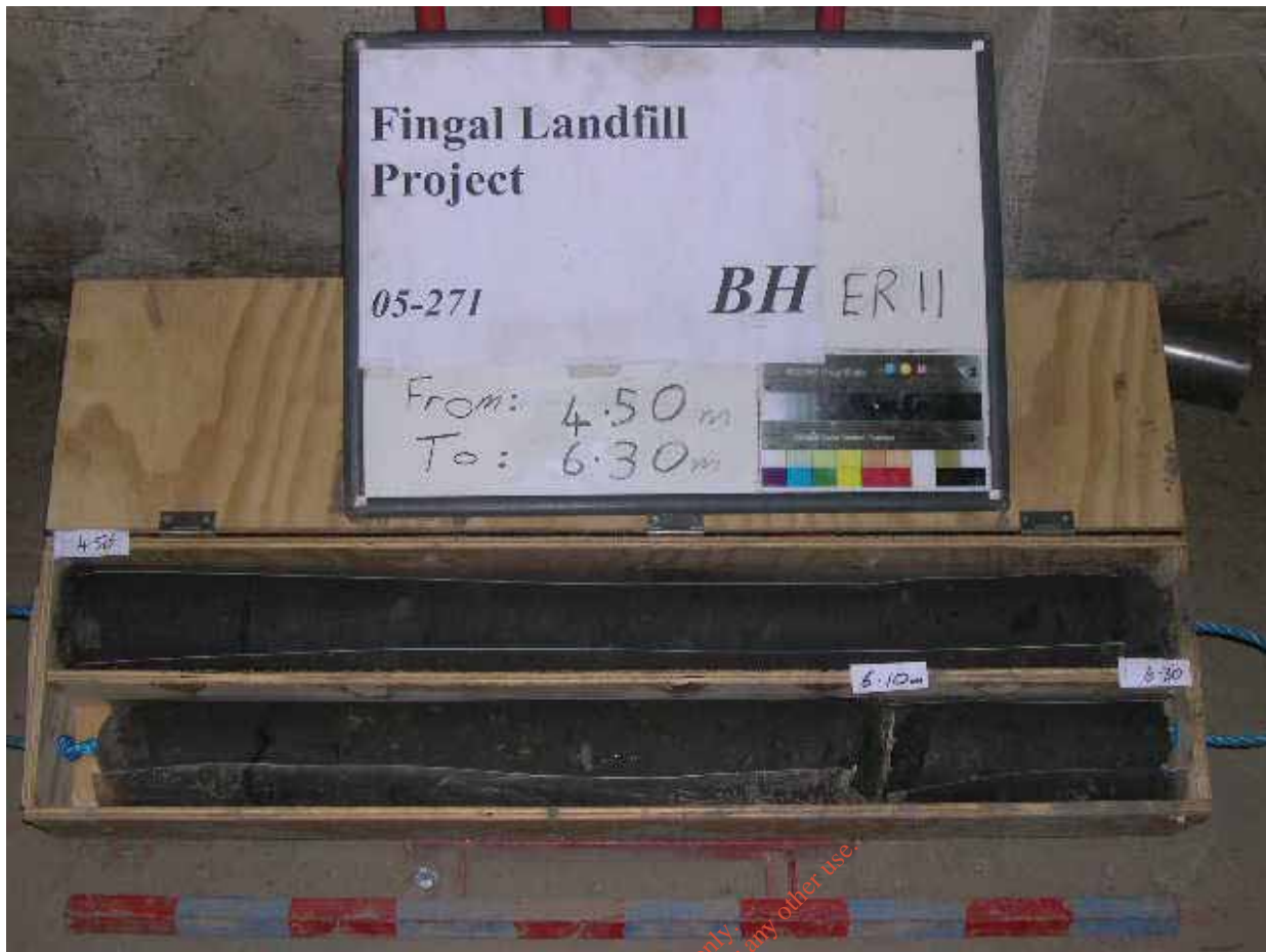
BH ER11: 4.50-6.30m