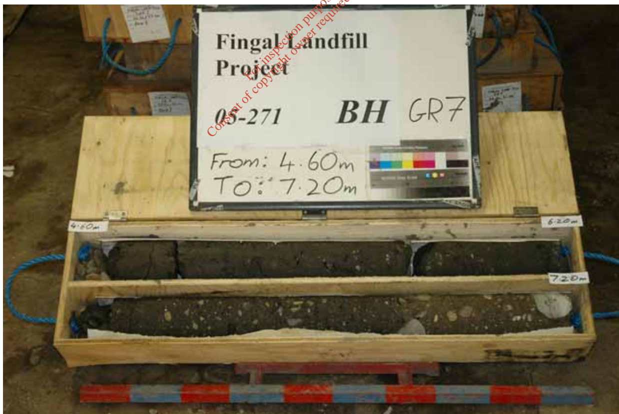
BH GR7: 4.60-7.20m