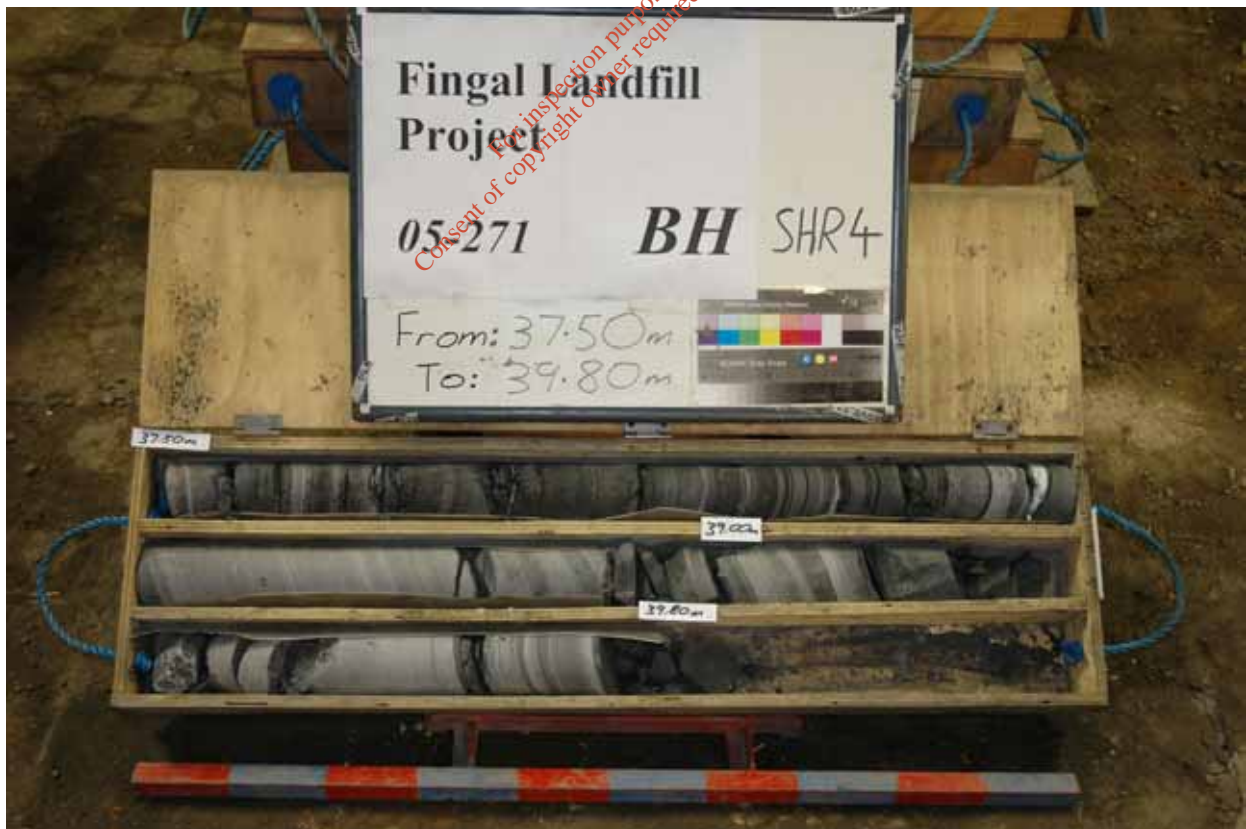
BH SHR4: 37.50-39.80m