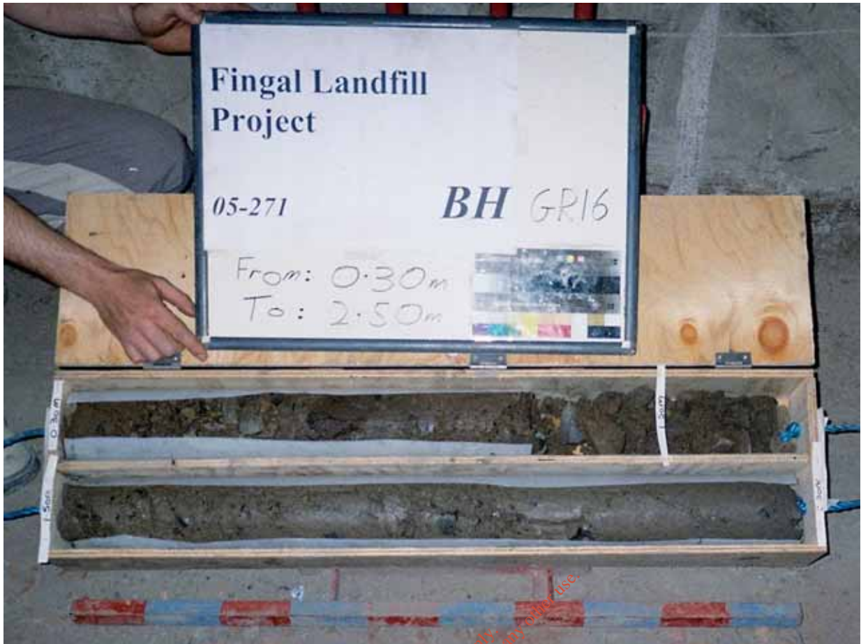
BH GR16: 0.30-2.50m