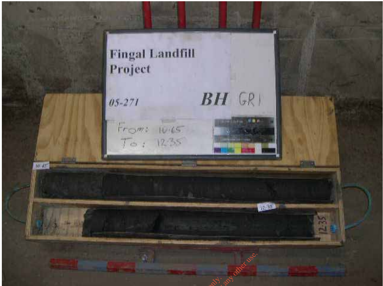
BH GR1: 10.65-12.35m