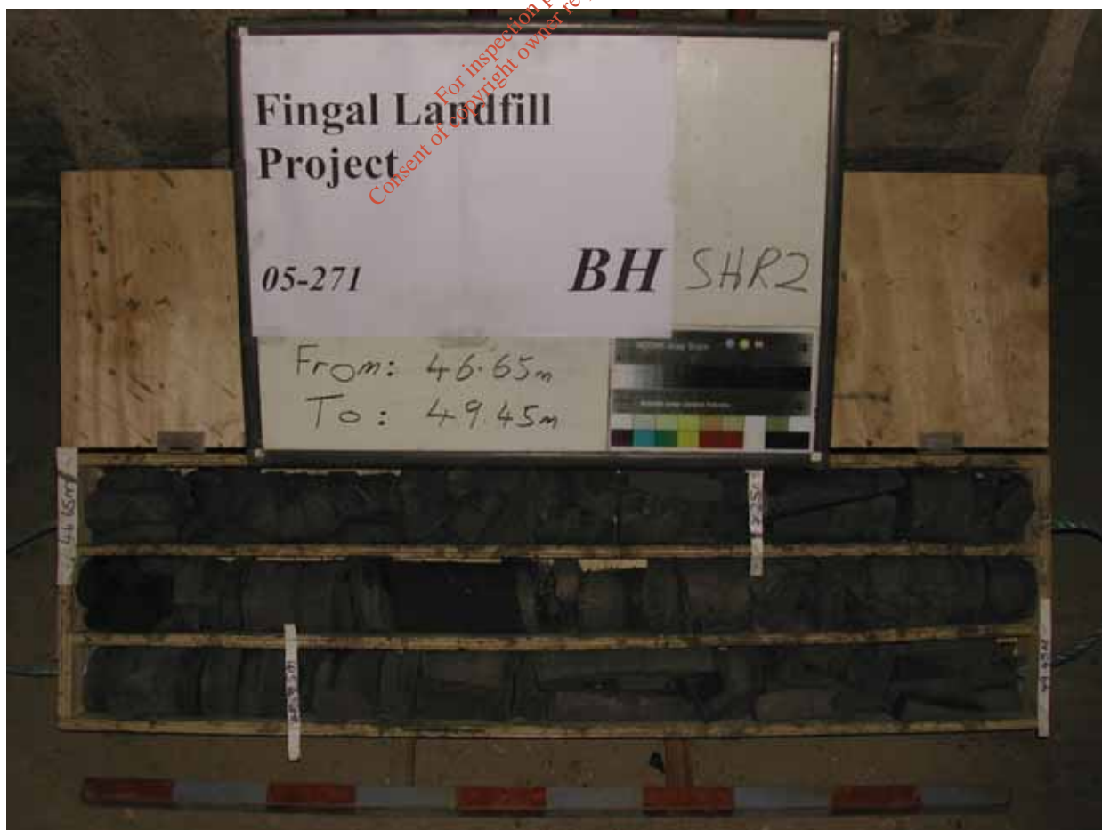
BH SHR2: 46.65-49.45m