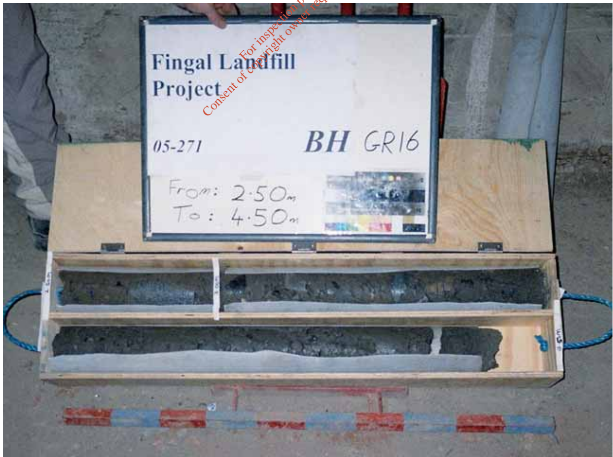
BH GR16: 2.50-4.50m