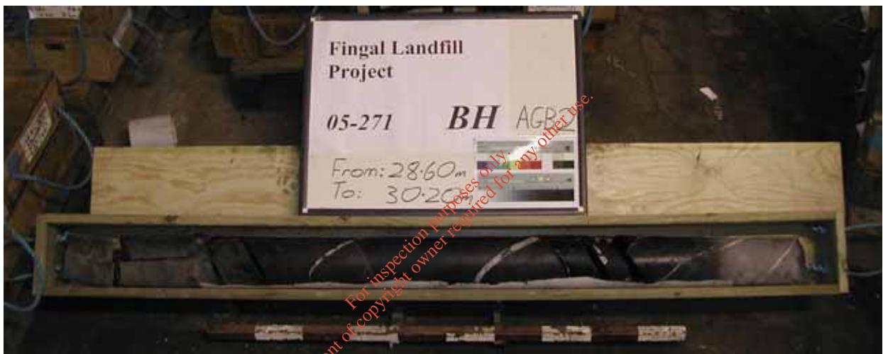
BH AGB2: 28.60-30.20m