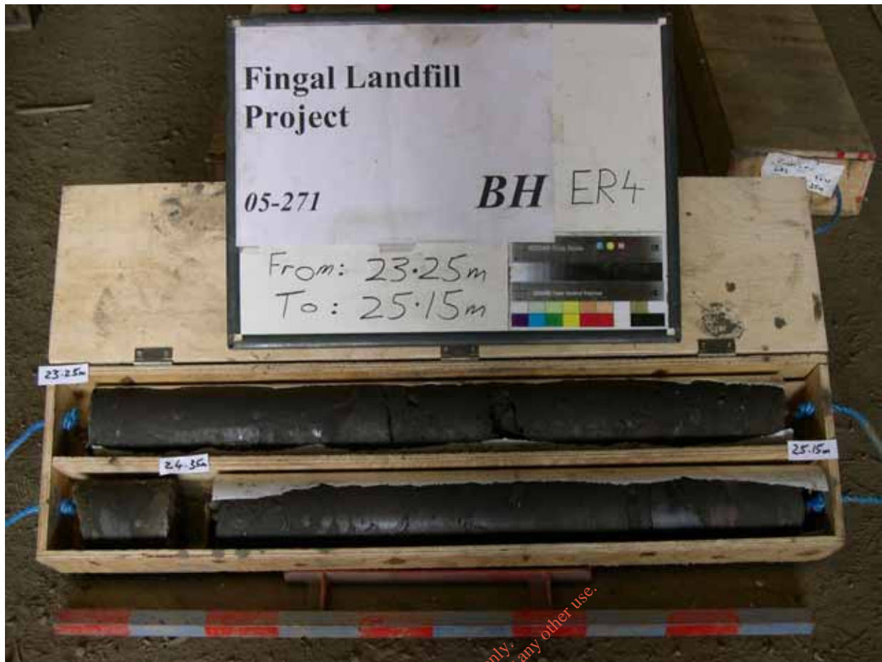
BH ER4: 23.25-25.15m