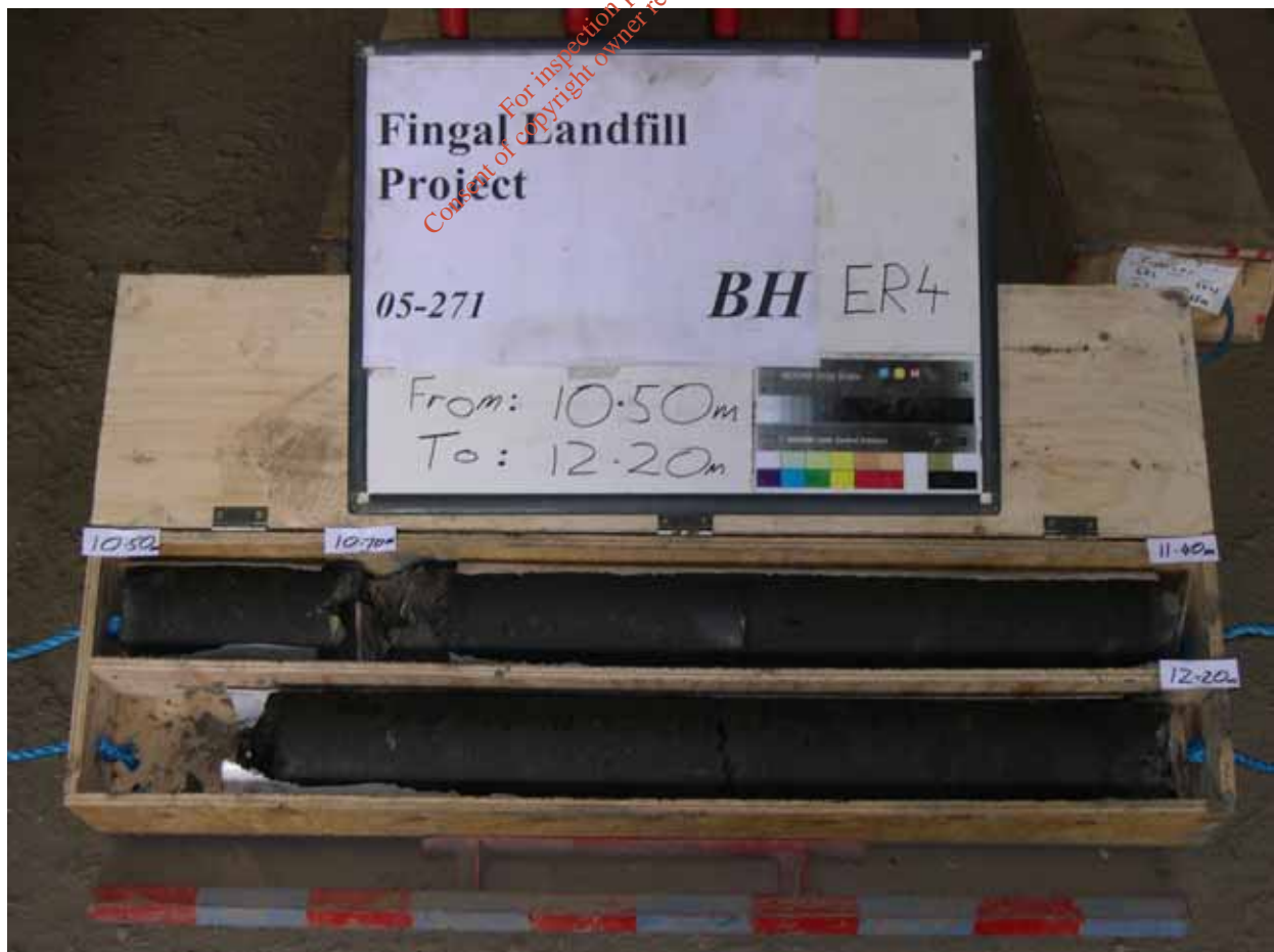
BH ER4: 10.50-12.20m