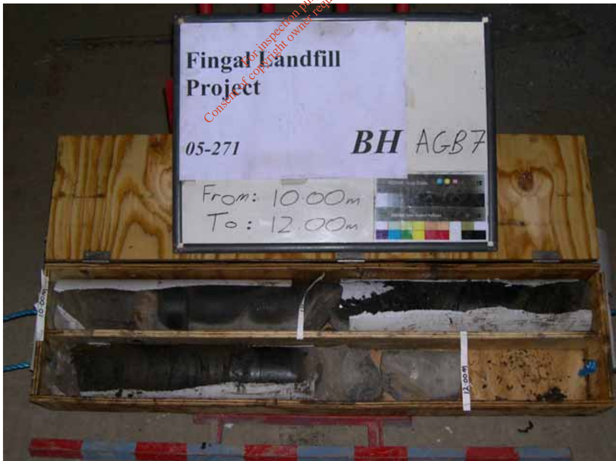
BH AGB7: 10.00-12.00