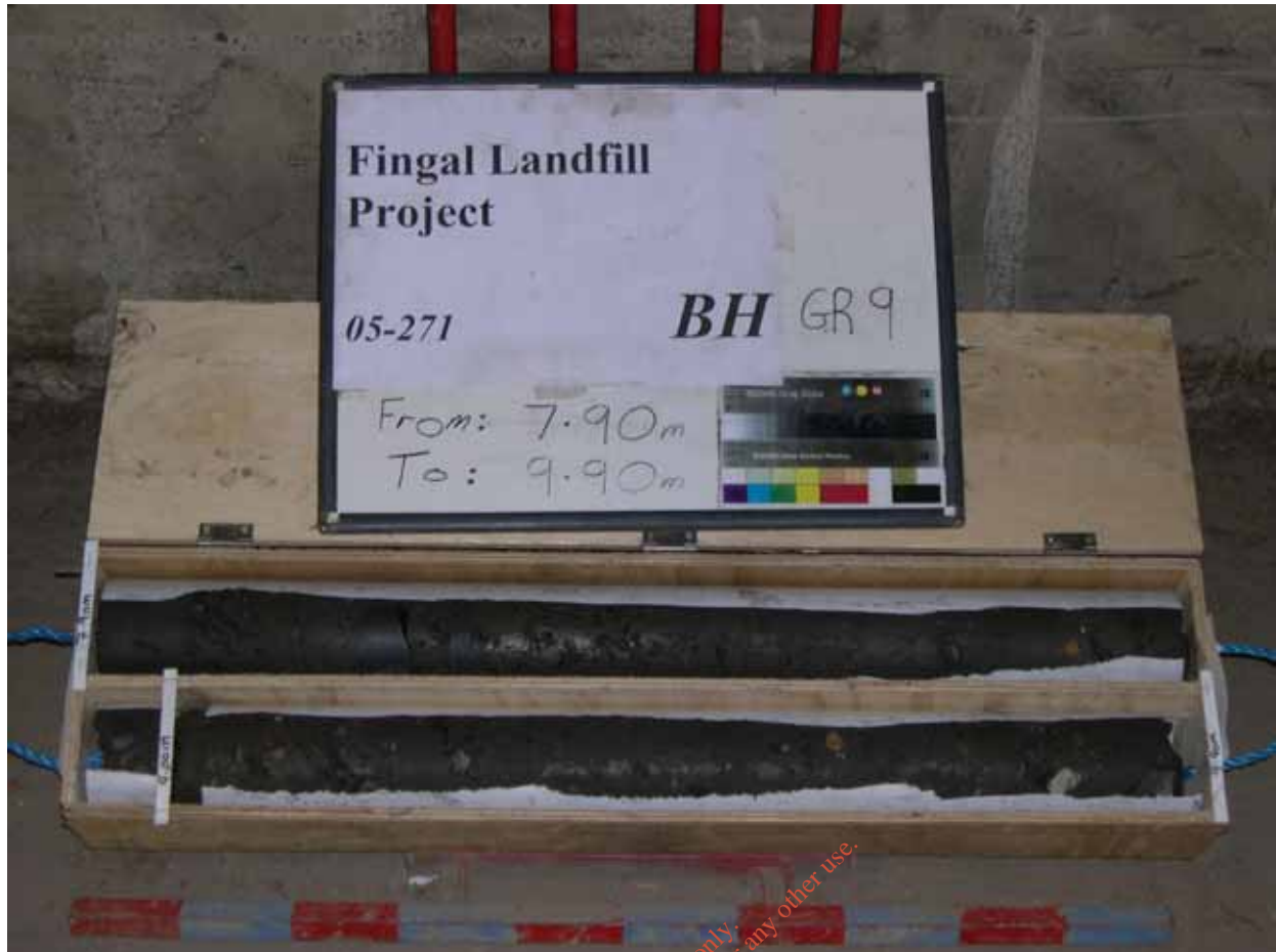
BH GR9: 7.90-9.90m