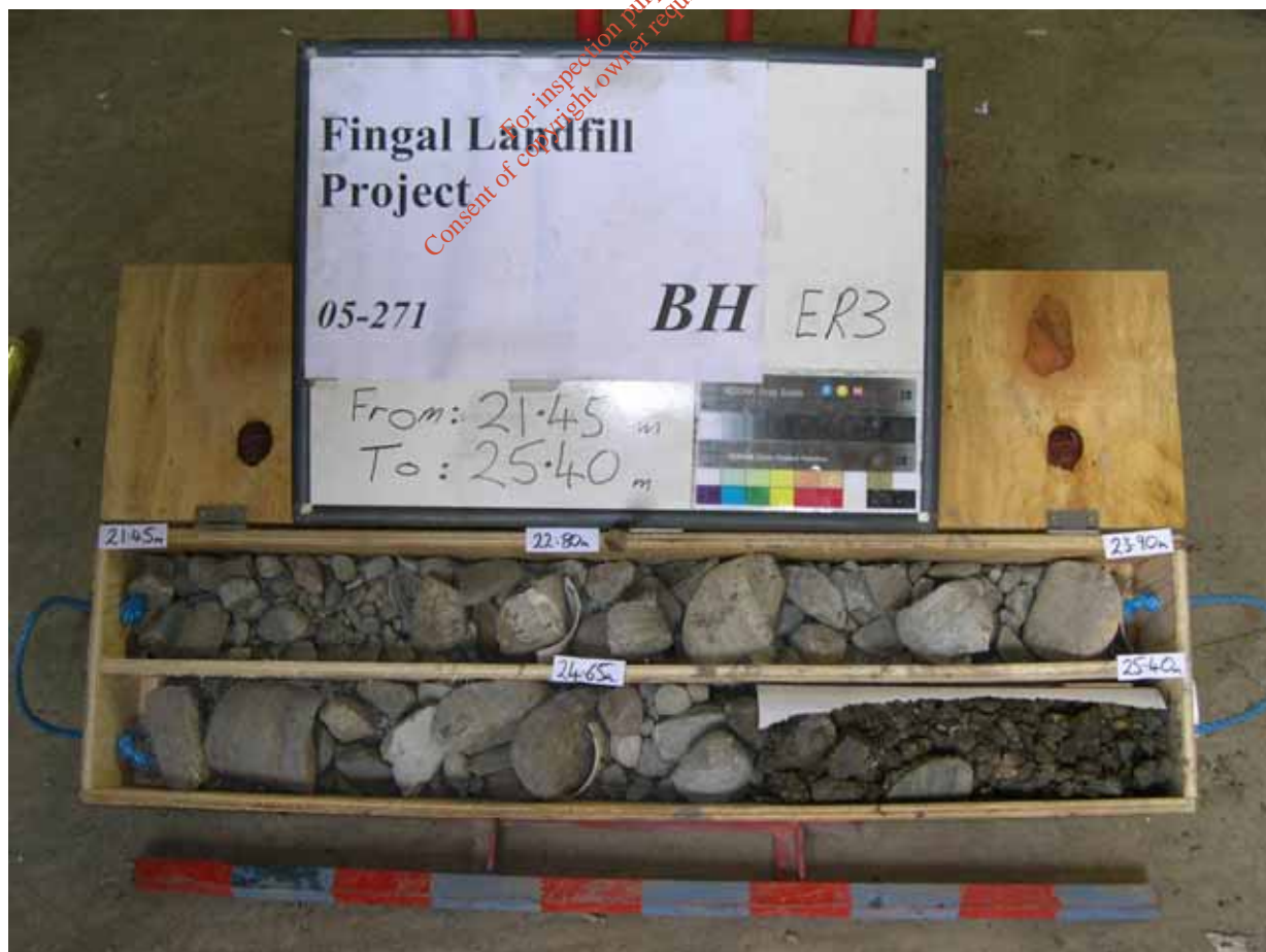
BH ER3: 19.21.45-25.40m