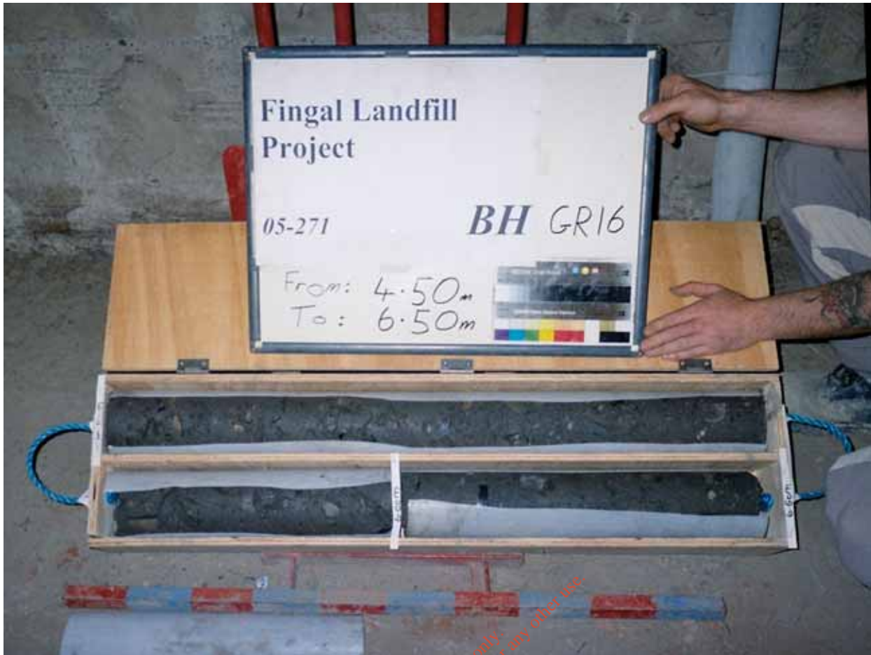
BH GR16: 4.50-6.50m