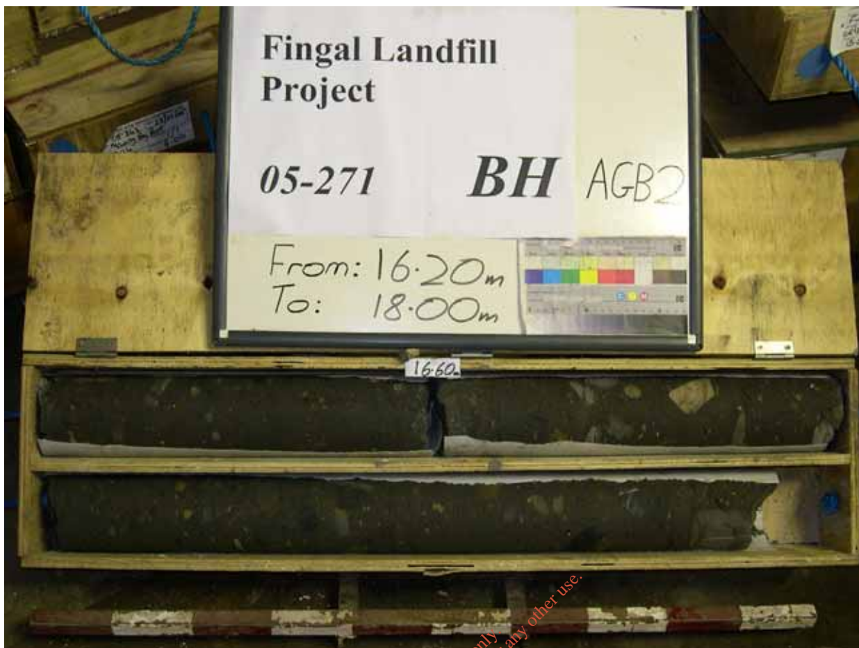
BH AGB2: 16.20-18.00m