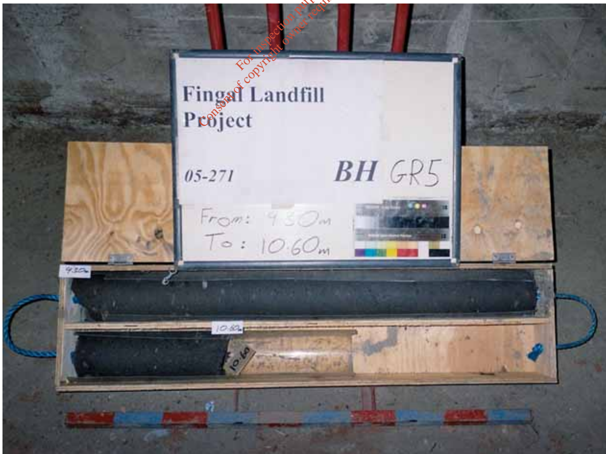
BH GR5: 9.30-10.60m