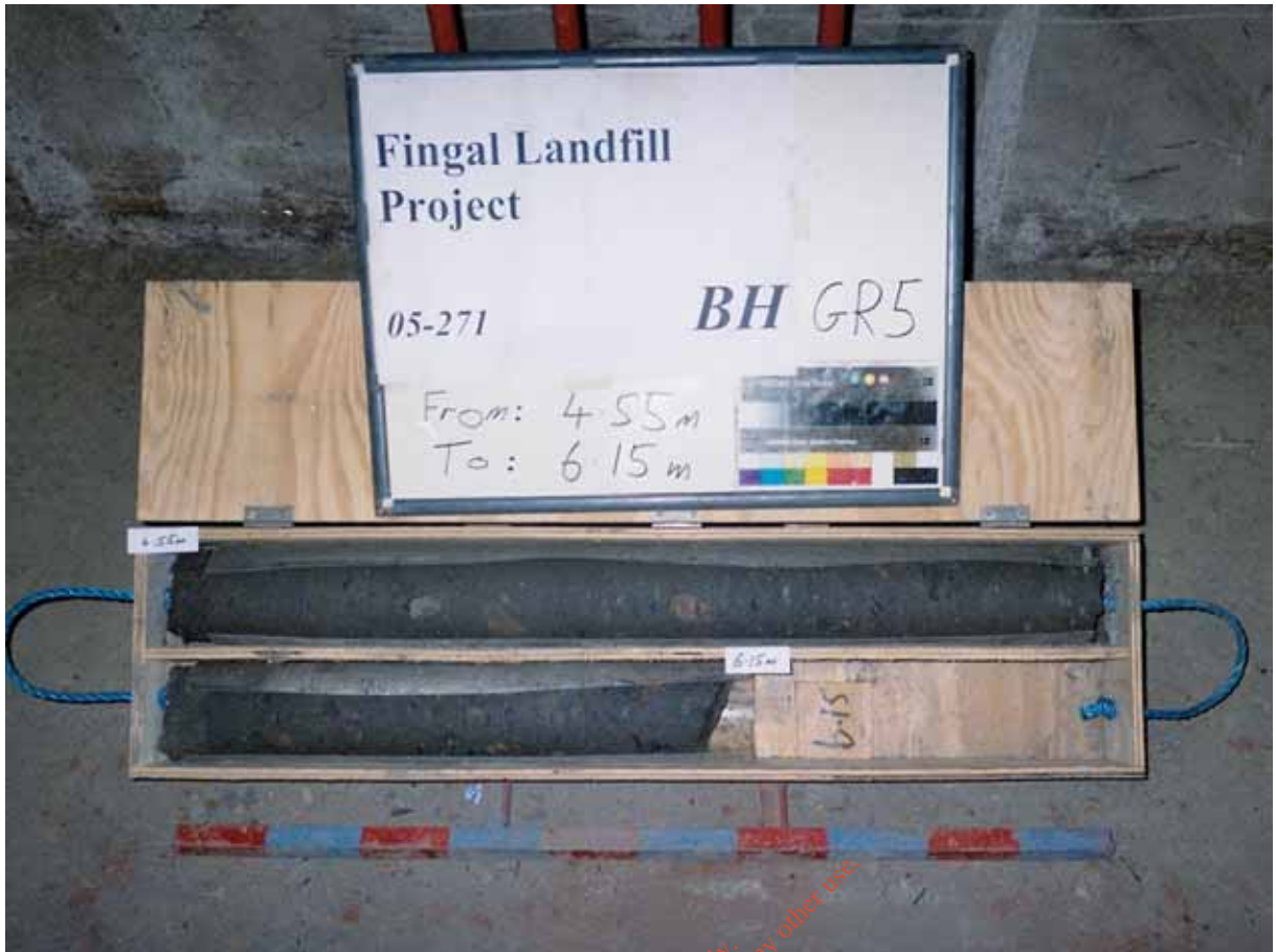
BH GR5: 4.55-6.15m