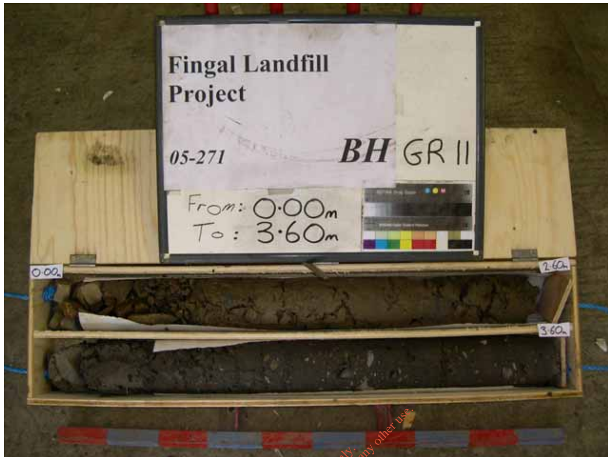
BH GR11: 0.00-3.60m