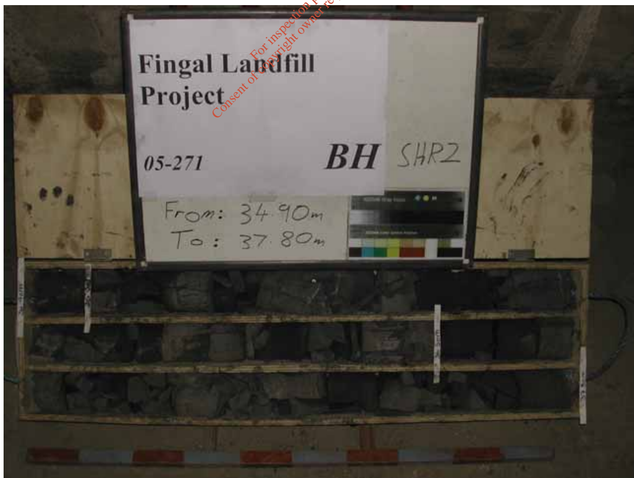
BH SHR2: 34.90-37.80m