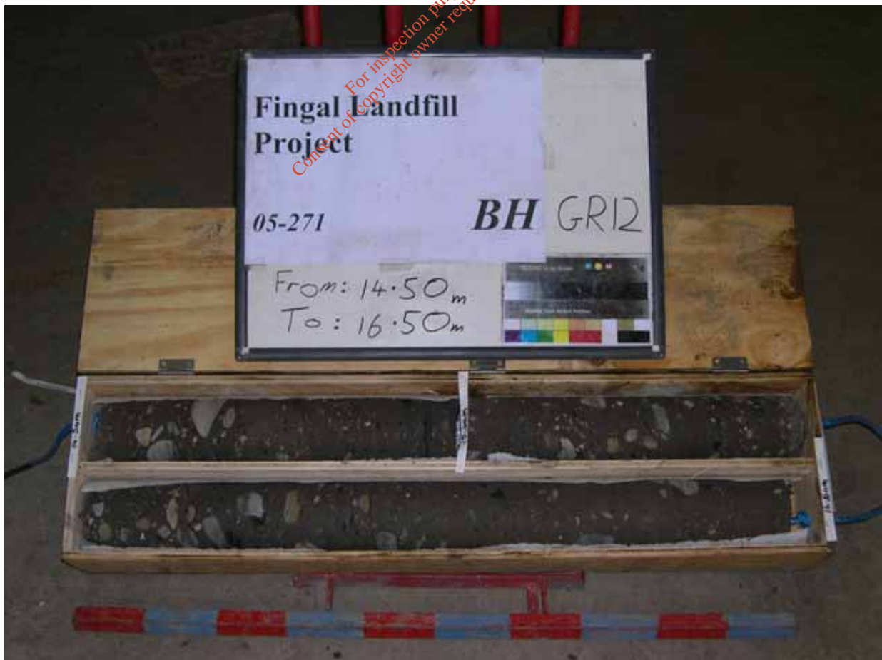
BH GR12: 14.50-16.50m