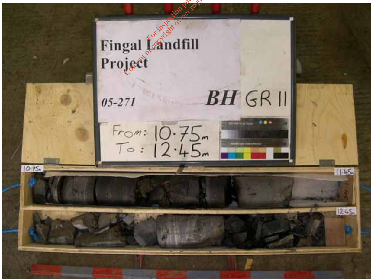
BH GR11: 10.75-12.45m