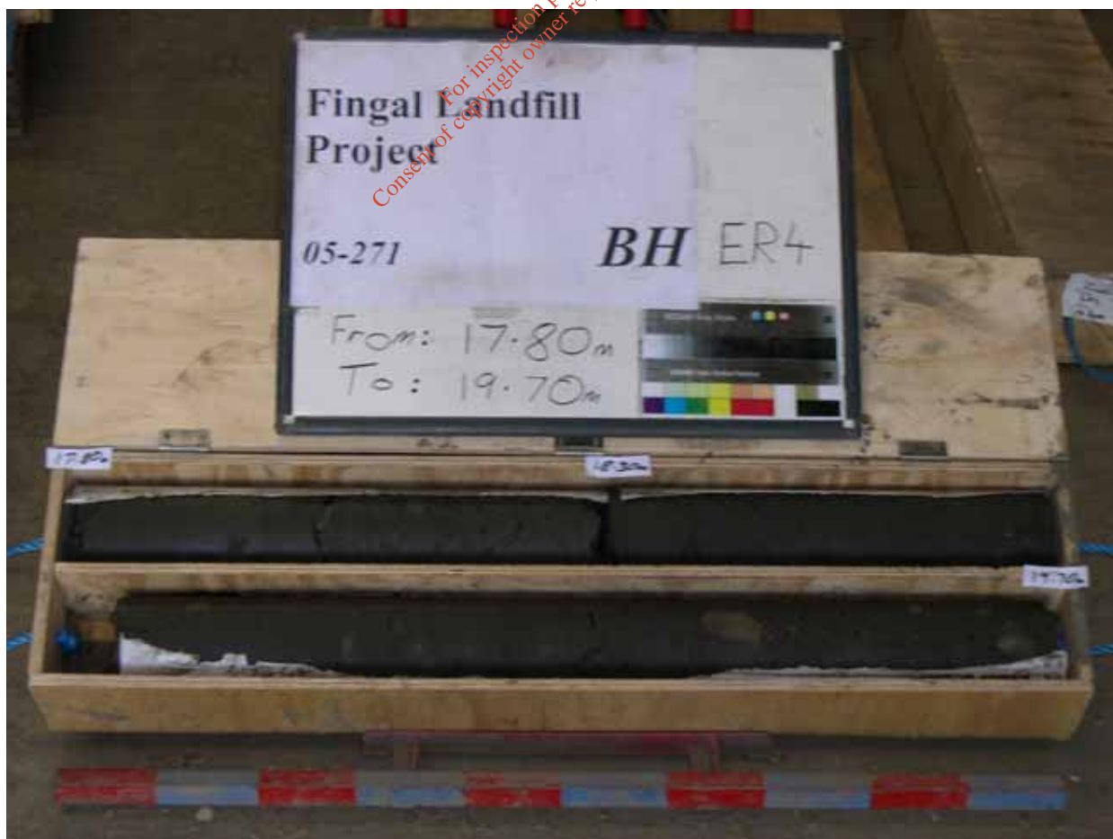
BH ER4: 17.80-19.70m