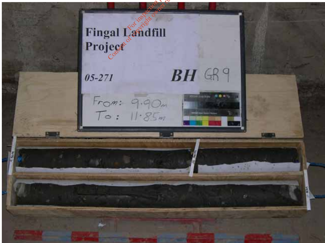
BH GR9: 9.90-11.85m