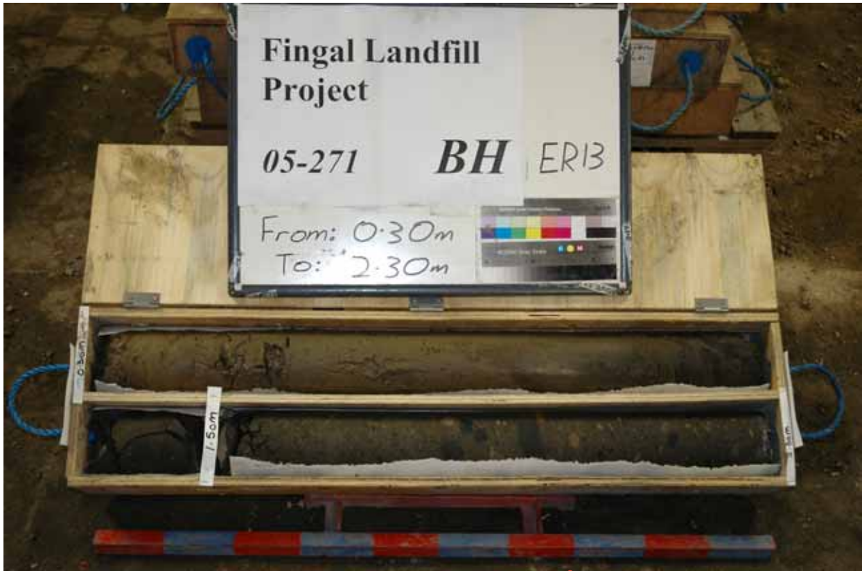
BH ER13: 0.30-2.30m