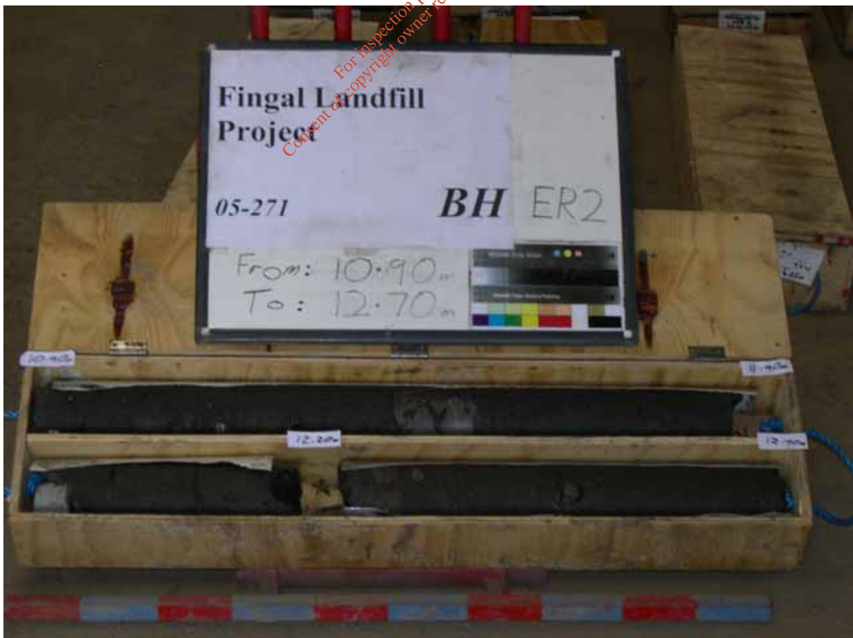
BH ER2: 10.90-12.70m