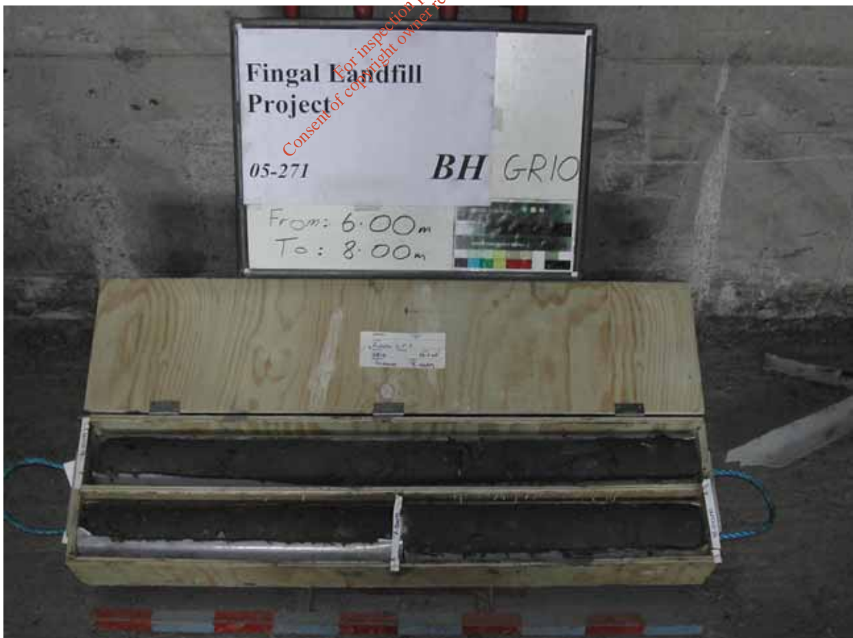
BH GR10: 6.00-8.00m