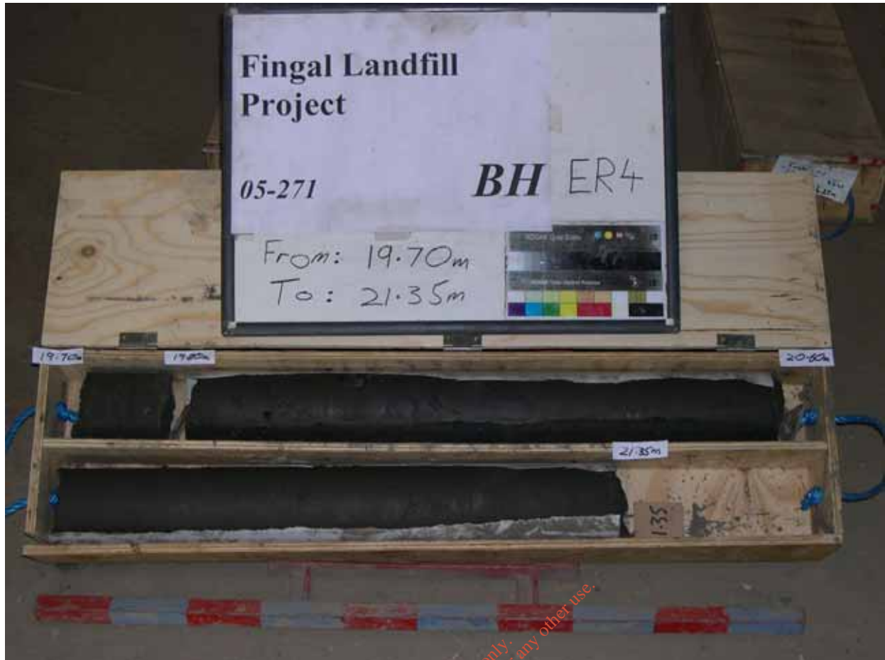
BH ER4: 19.70-21.35m