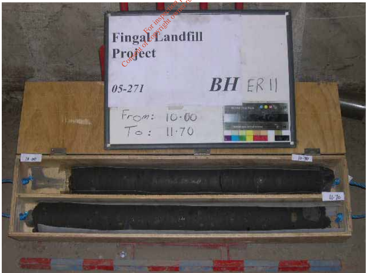
BH ER11: 10.00-11.70m