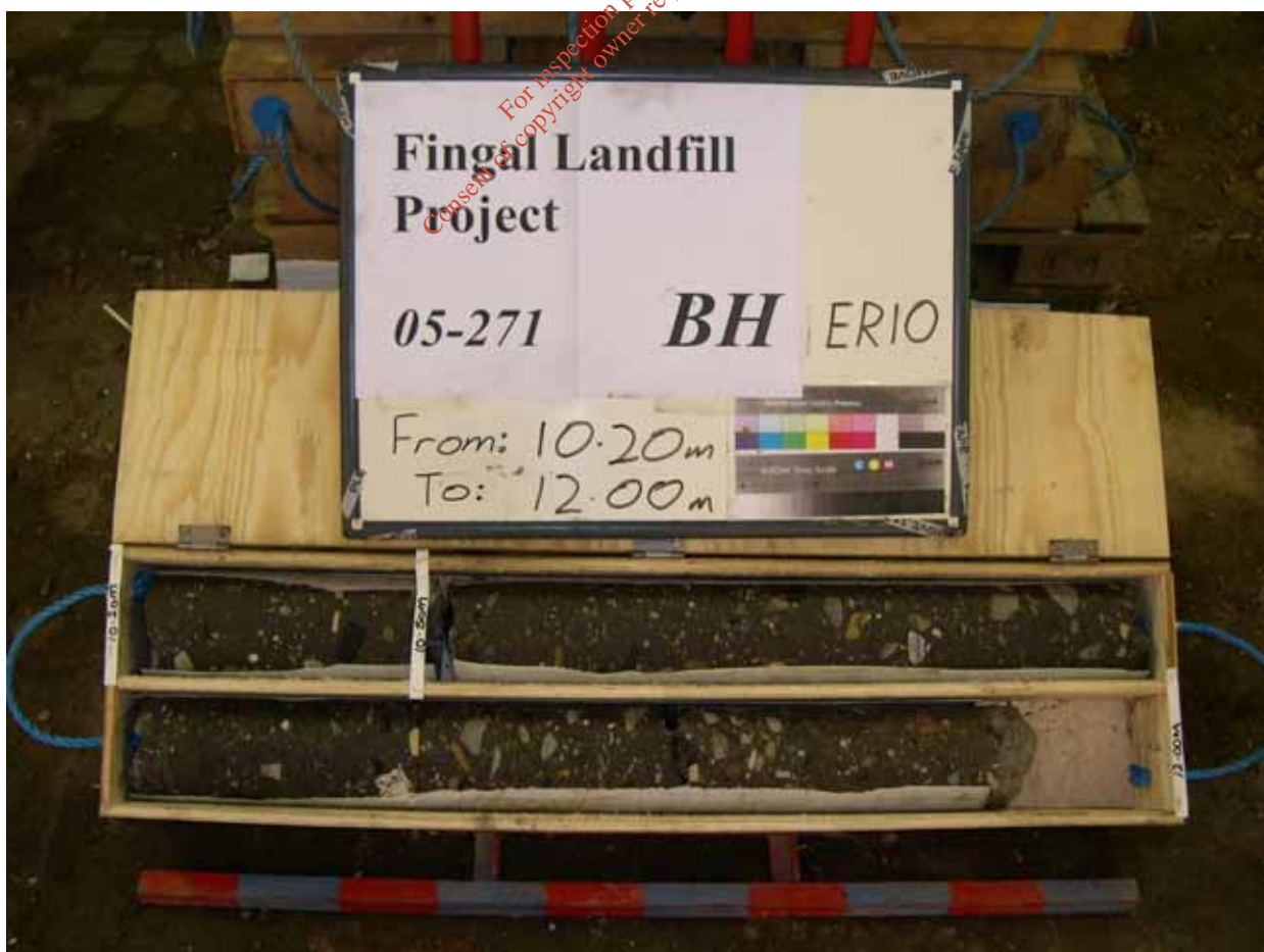
BH ER10: 10.20-12.00m