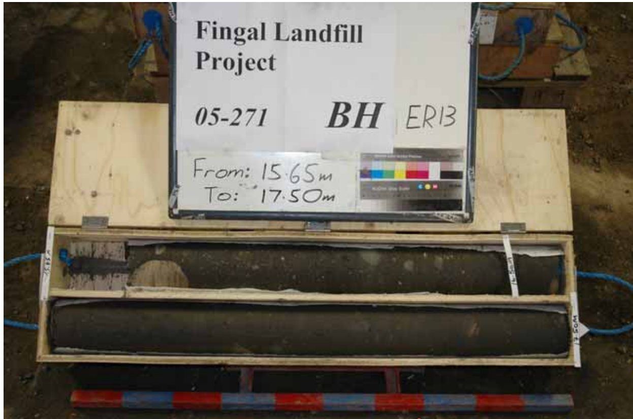
BH ER13: 15.65-17.50m