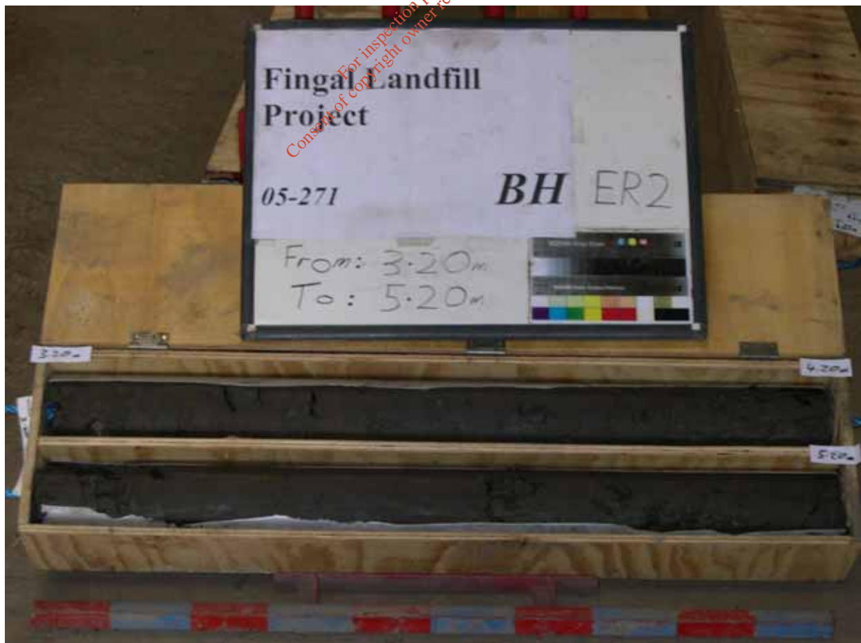
BH ER2: 3.20-5.20m