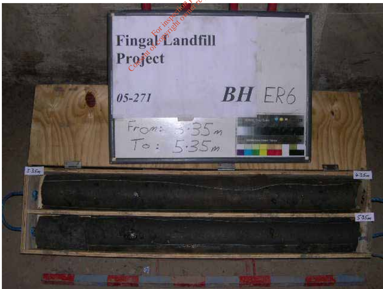
BH ER6: 3.35-5.35m