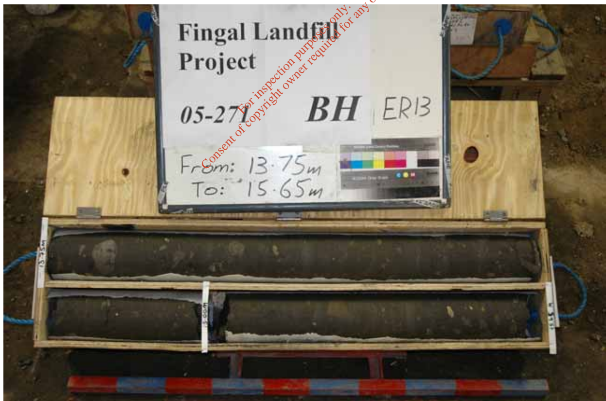
BH ER13: 13.75-15.65m