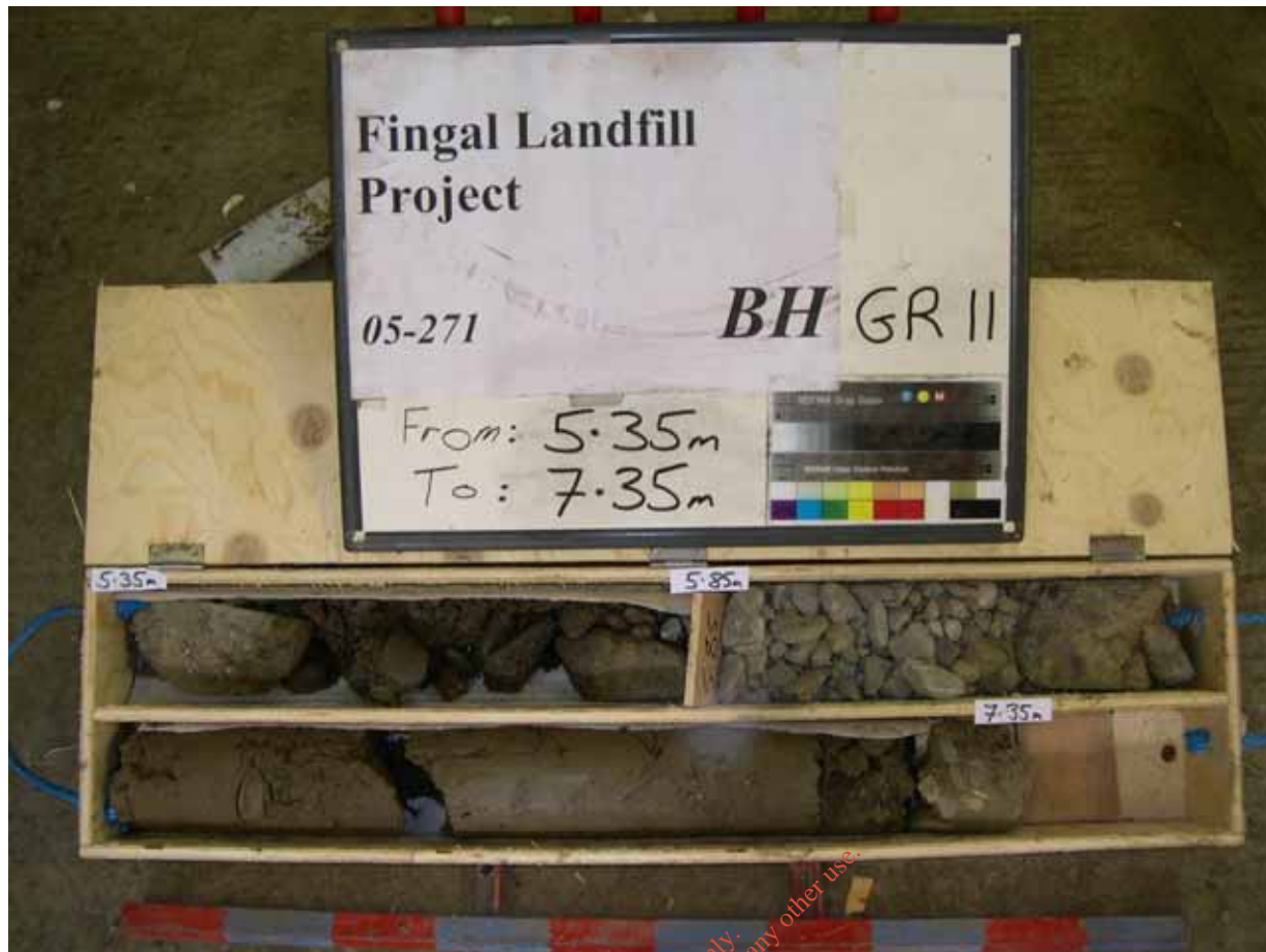
BH GR11: 5.35-7.35m