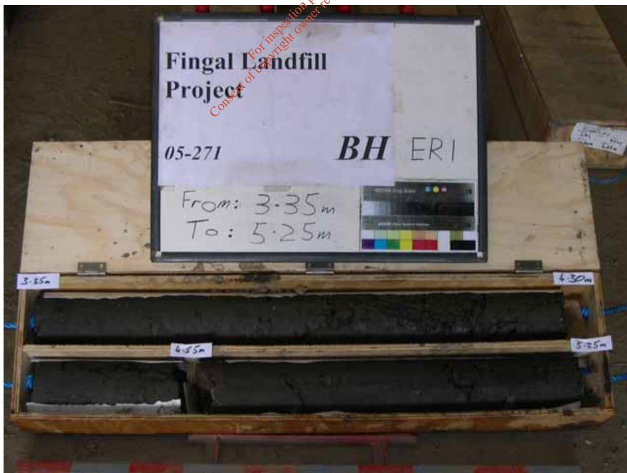
BH ER1: 3.35-5.25m