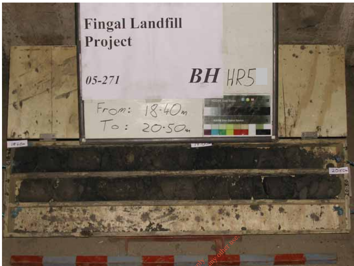
BH HR5: 18.40-20.50m