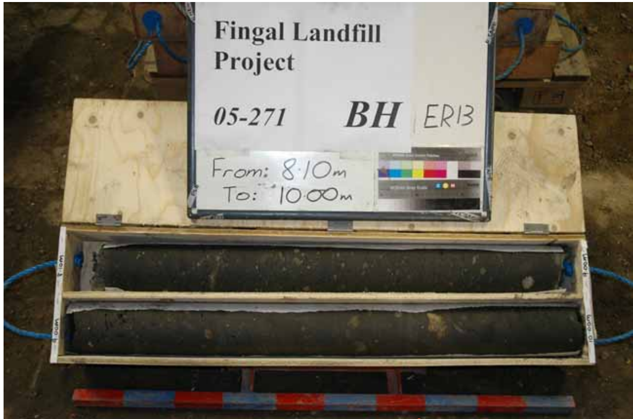
BH ER13: 8.10-10.00m