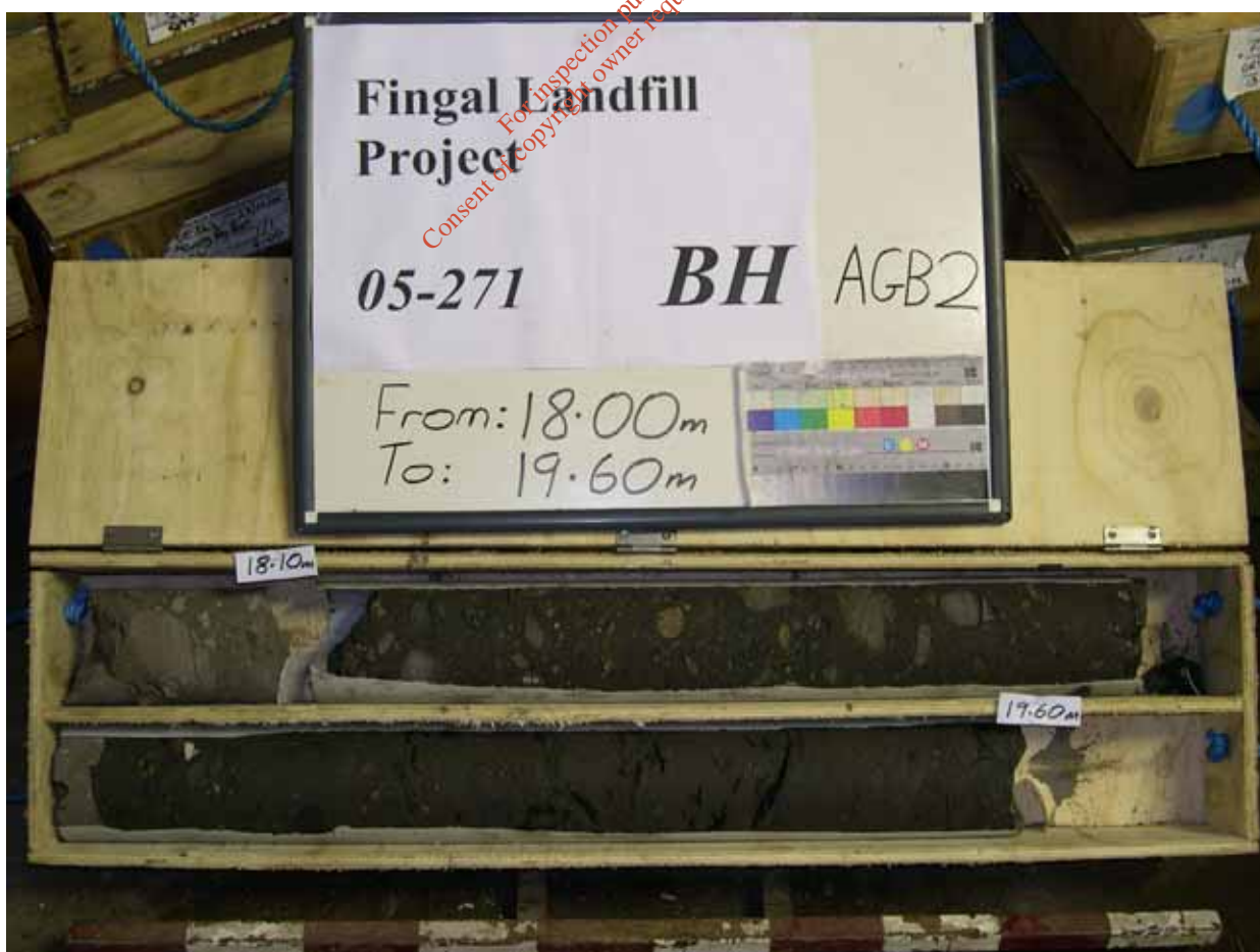
BH AGB2: 18.00-19.60m