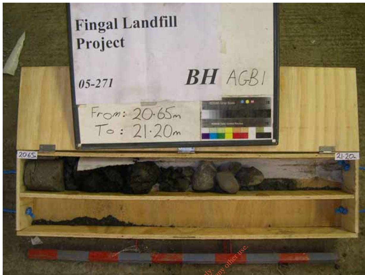
BH AGB1: 20.65-21.20m