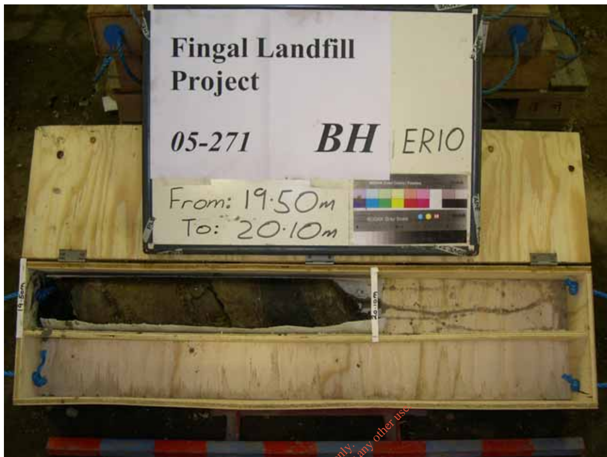
BH ER10: 19.50-20.10m

For inspection purposes only. Consent of copyright owner required for any other use.