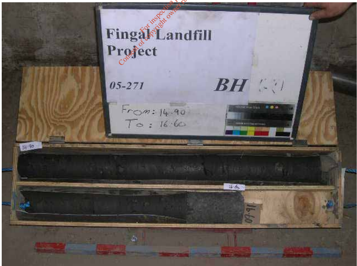
BH GR1: 14.90-16.60m