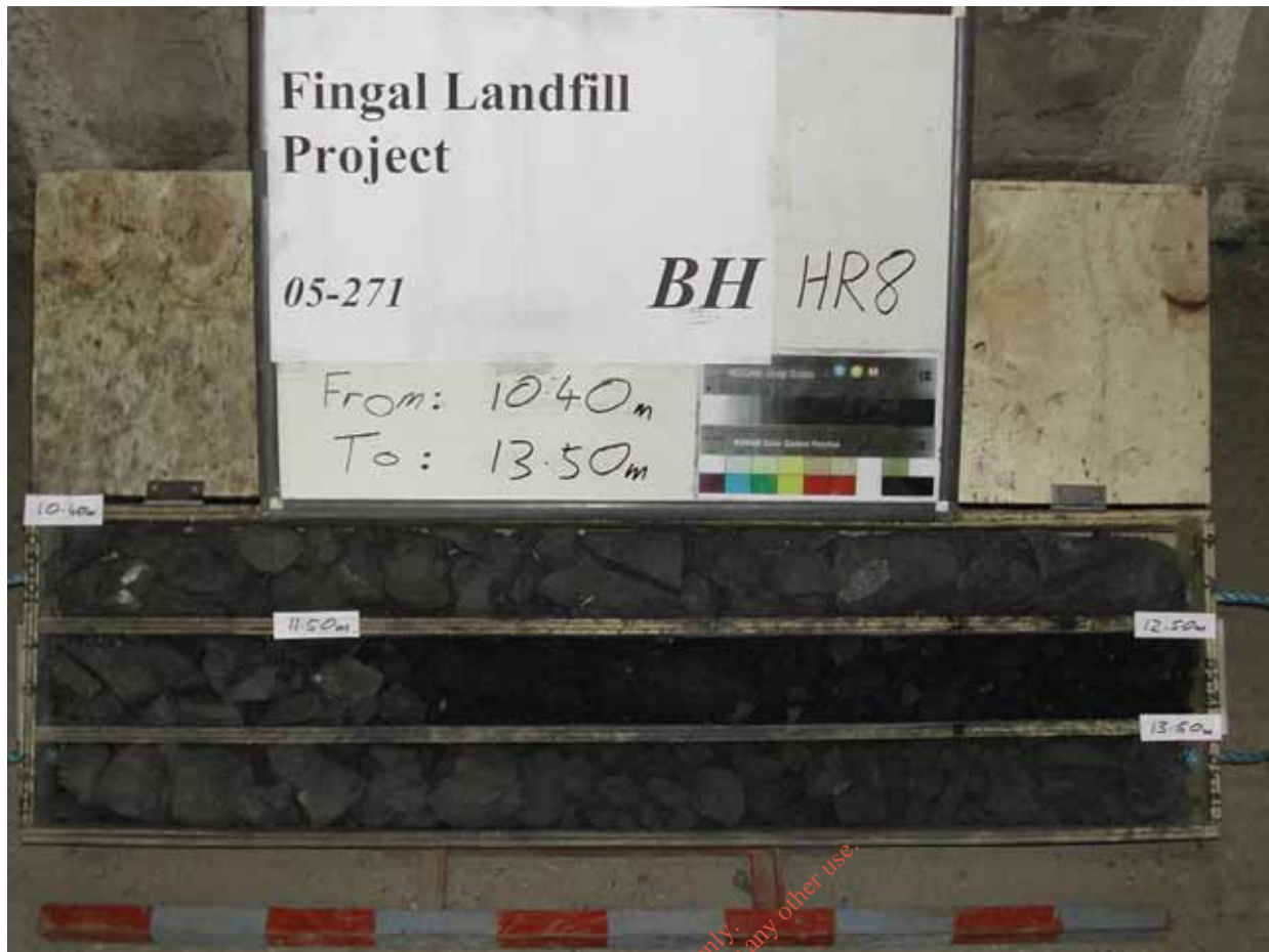
BH HR8: 10.40-13.50m