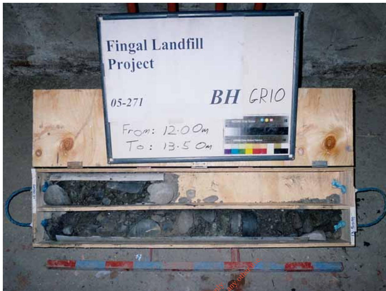
BH GR10: 12.00-13.50m

For inspection purposes only Consent of copyright owner required for any other use