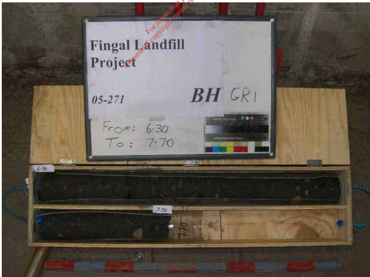
BH GR1: 6.30-7.70m