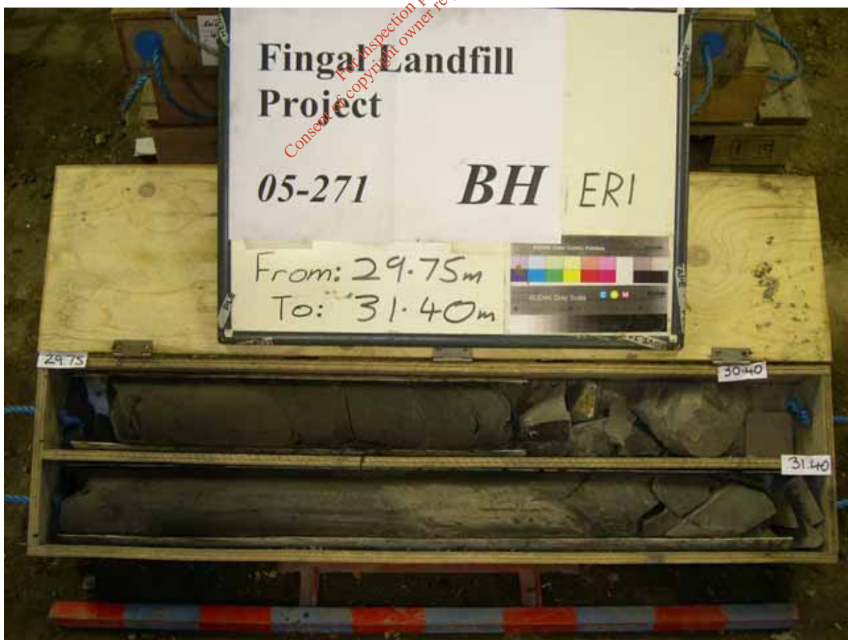
BH ER1: 29.75-31.40m