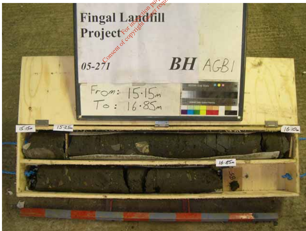
BH AGB1: 15.15-16.85m