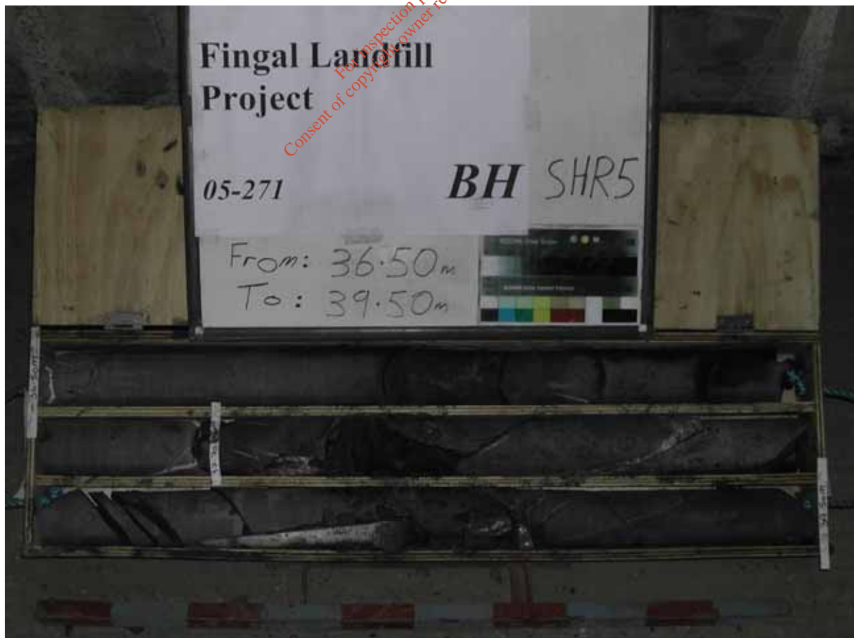
BH SHR5: 36.50-39.50m