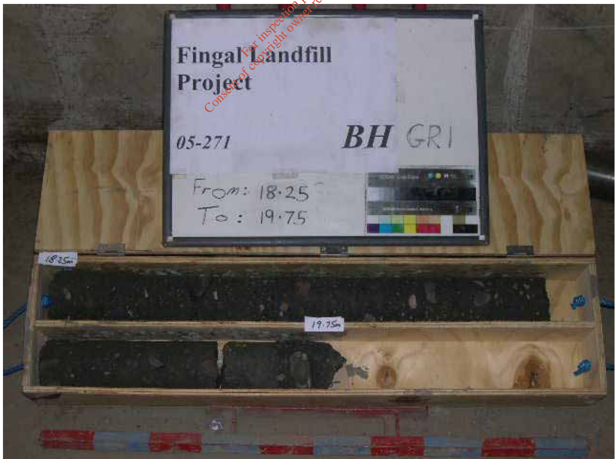
BH GR1: 18.25-19.75m