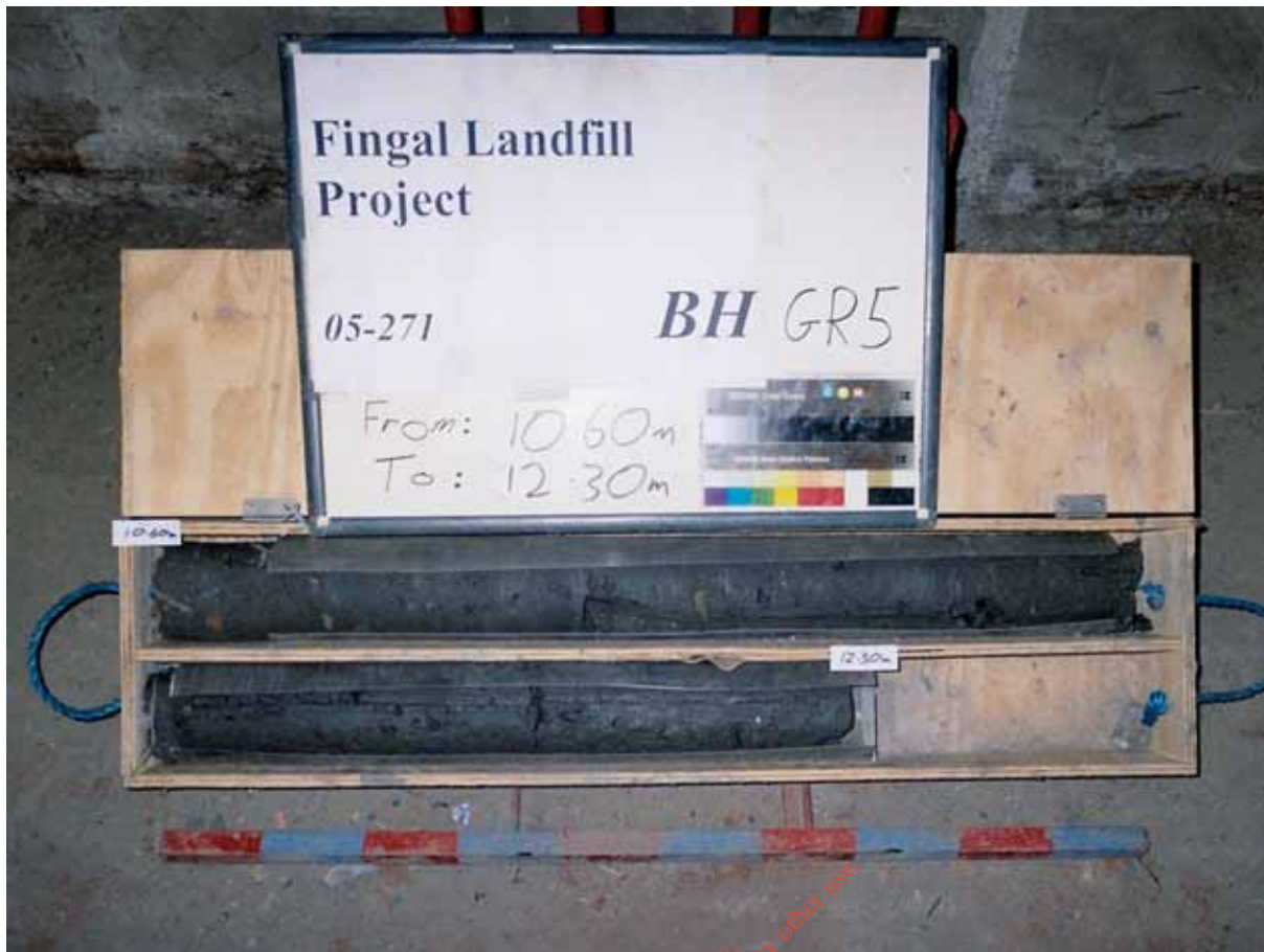
BH GR5: 10.60-12.30m