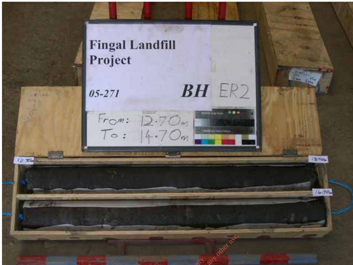
BH ER2: 12.70-14.70m