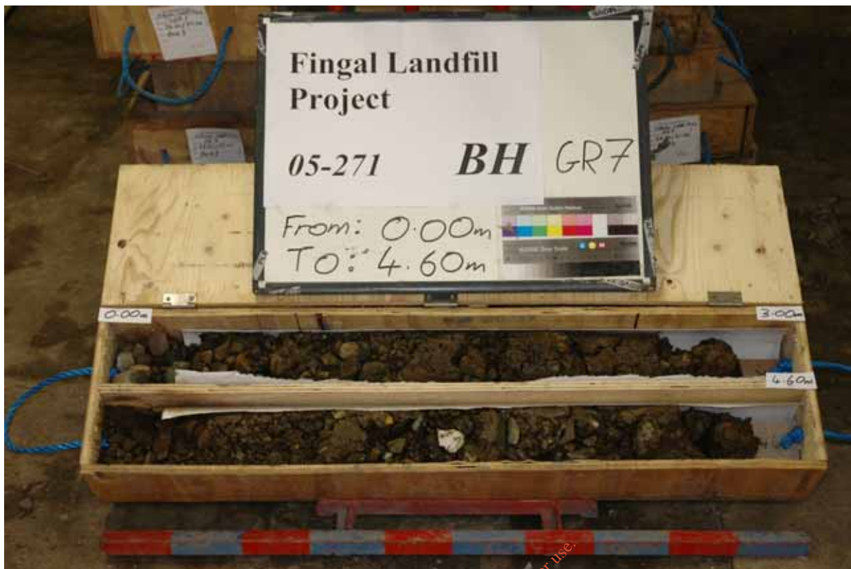
BH GR7: 0.00-4.60m