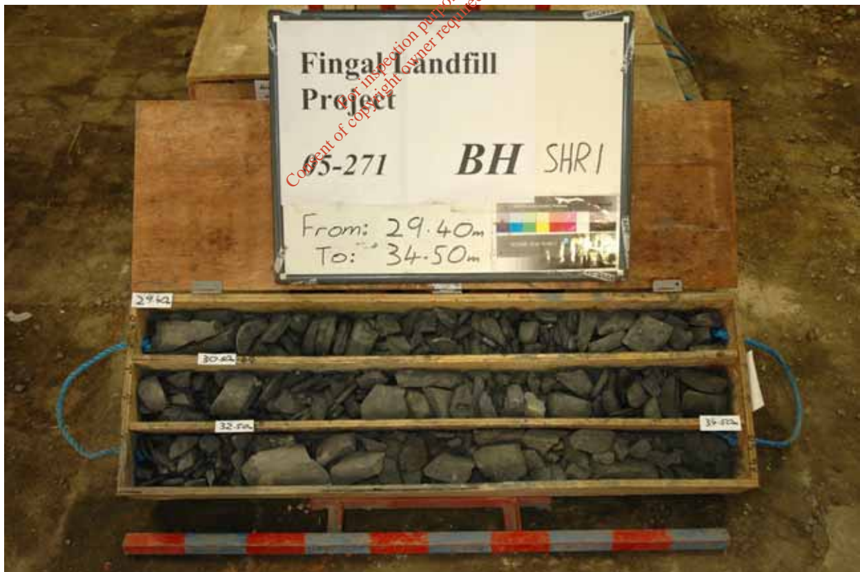
BH SHR1: 29.40-34.50m