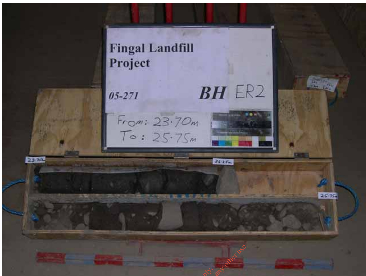
BH ER2: 23.70-25.75m

For inspection purposes only. Consent of copyright owner required for any other use.