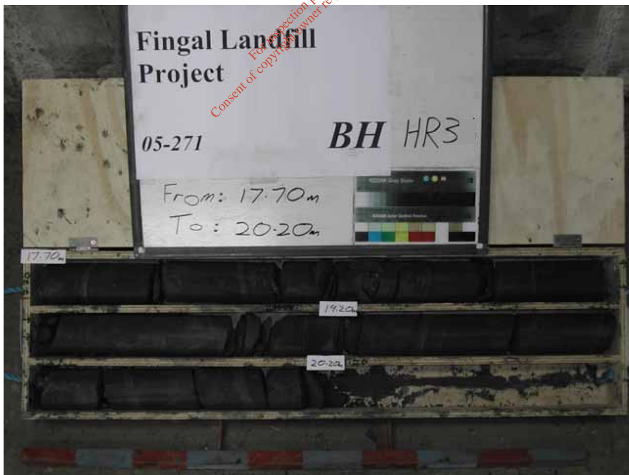
BH HR3: 17.70-20.20m