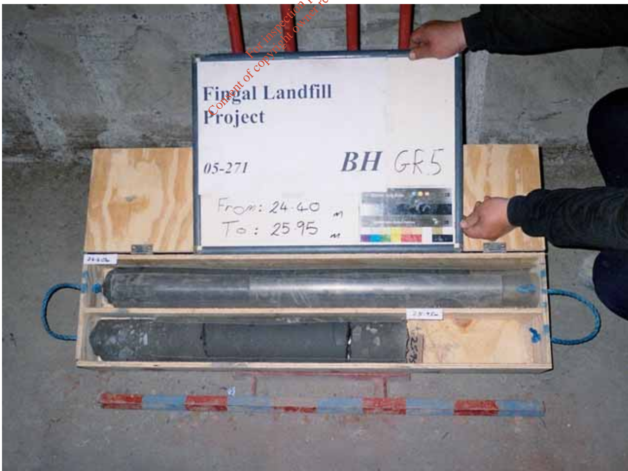
BH GR5: 24.40-25.95m