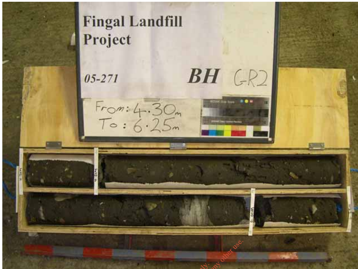
BH GR02: 4.30-6.25m