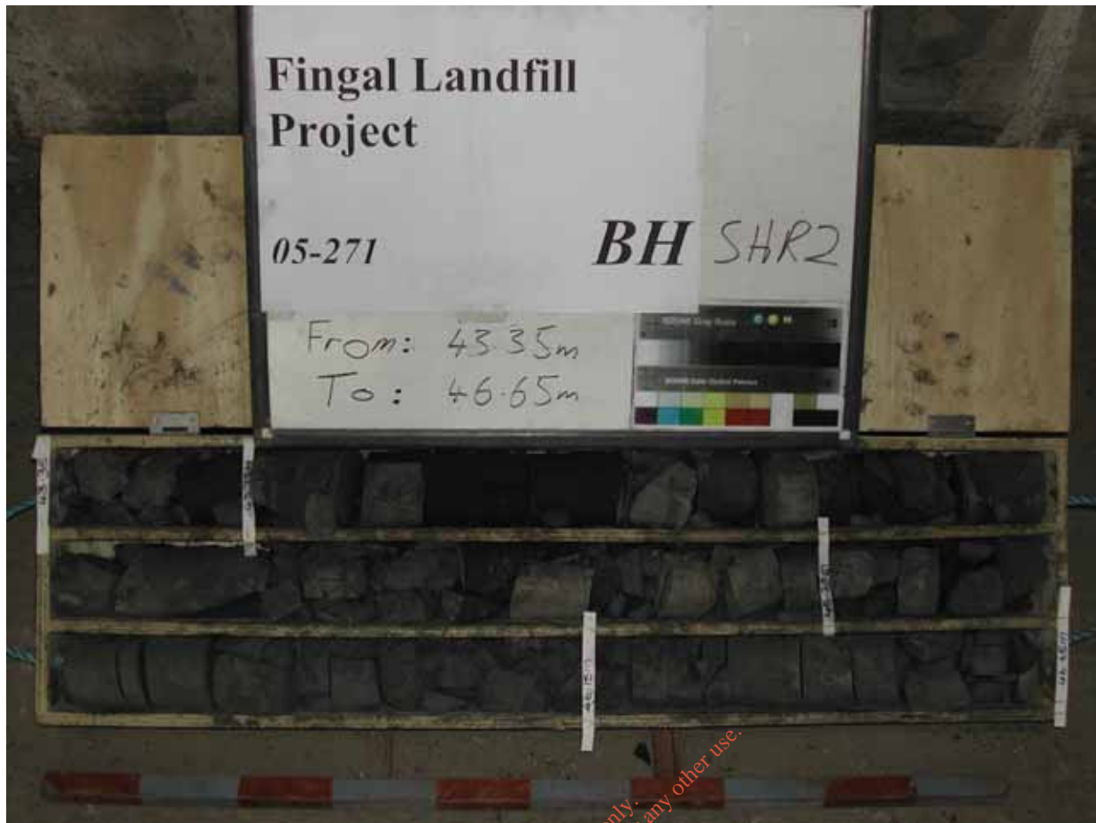
BH SHR2: 43.35-46.65m