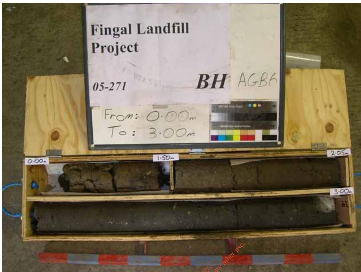
BH AGB6 0.00-3.00m