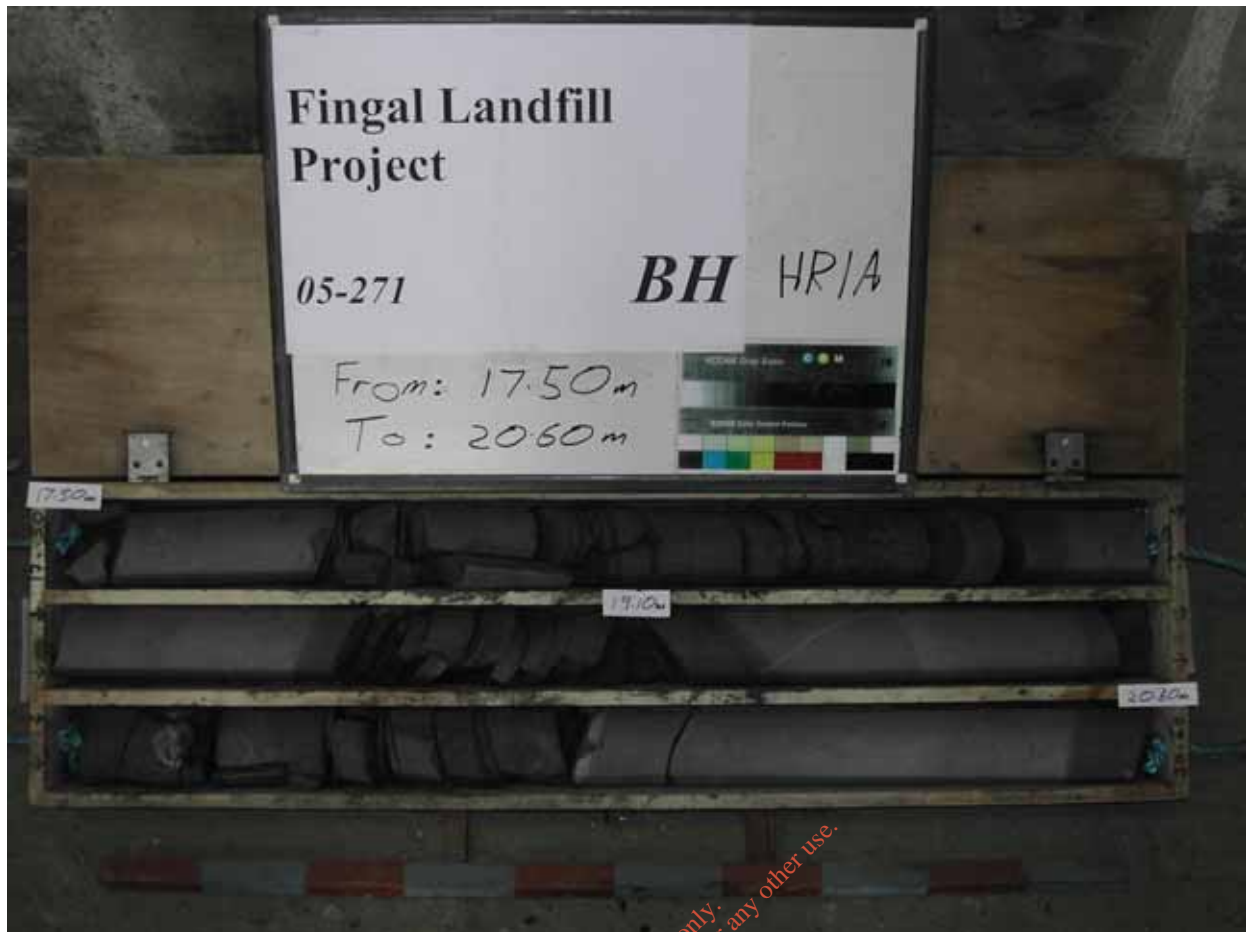
BH HR1A: 17.50-20.60m