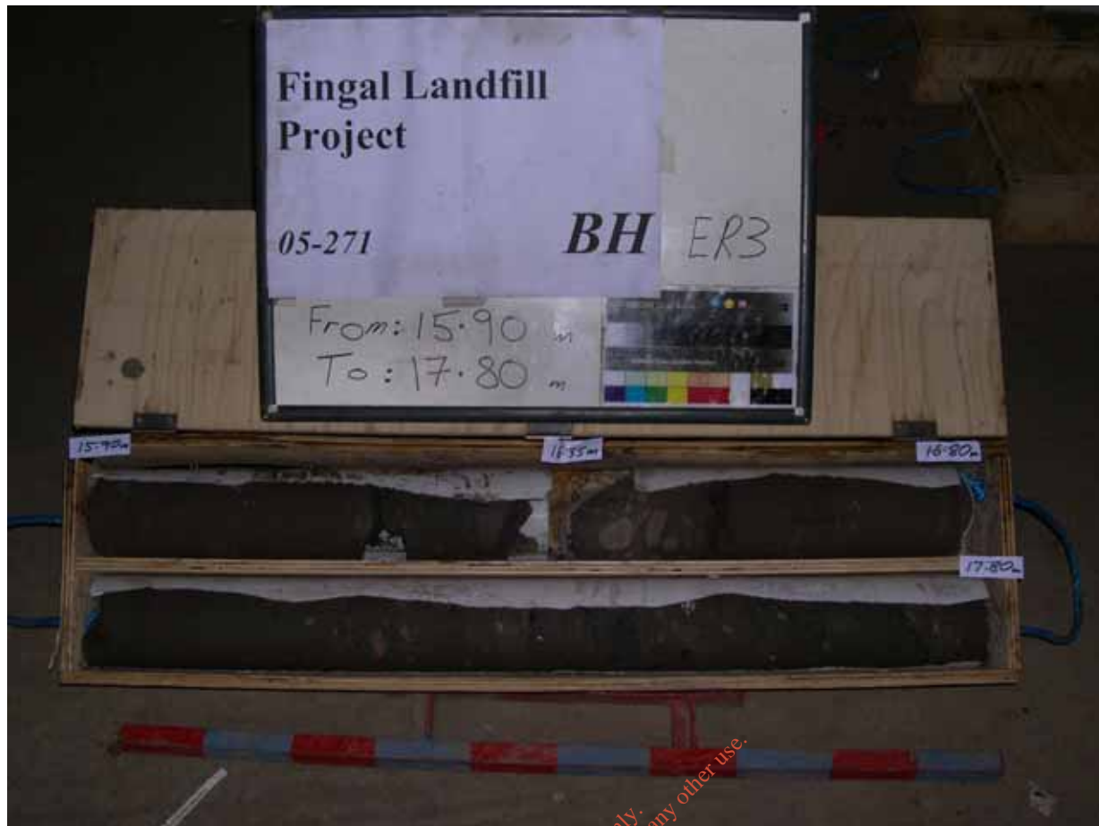
BH ER3: 15.90-17.80m