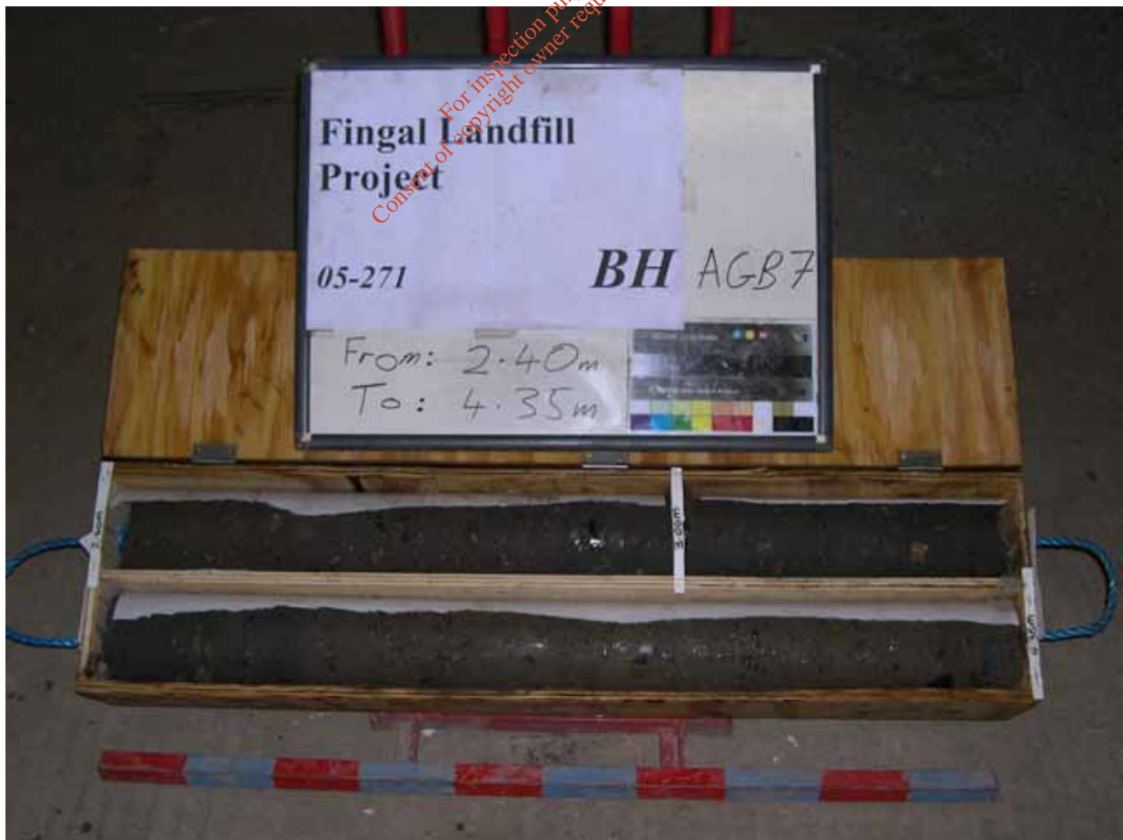
BH AGB7: 2.40-4.35m