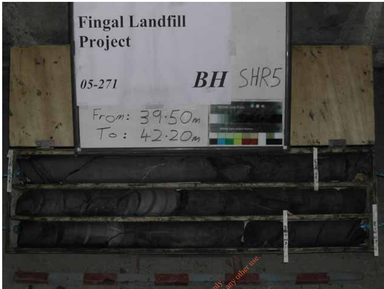
BH SHR5: 39.50-42.20m