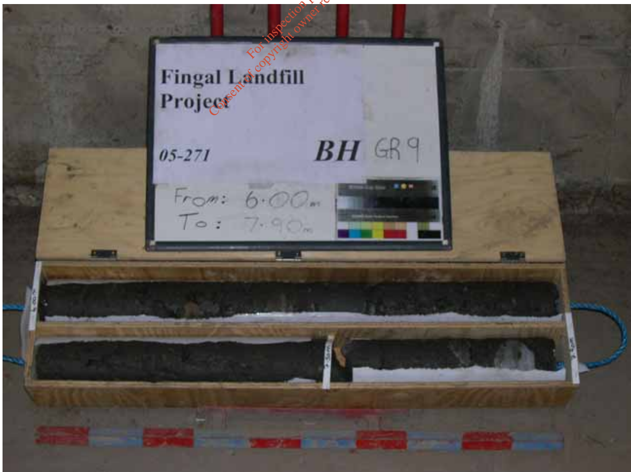
BH GR9: 6.00-7.90m