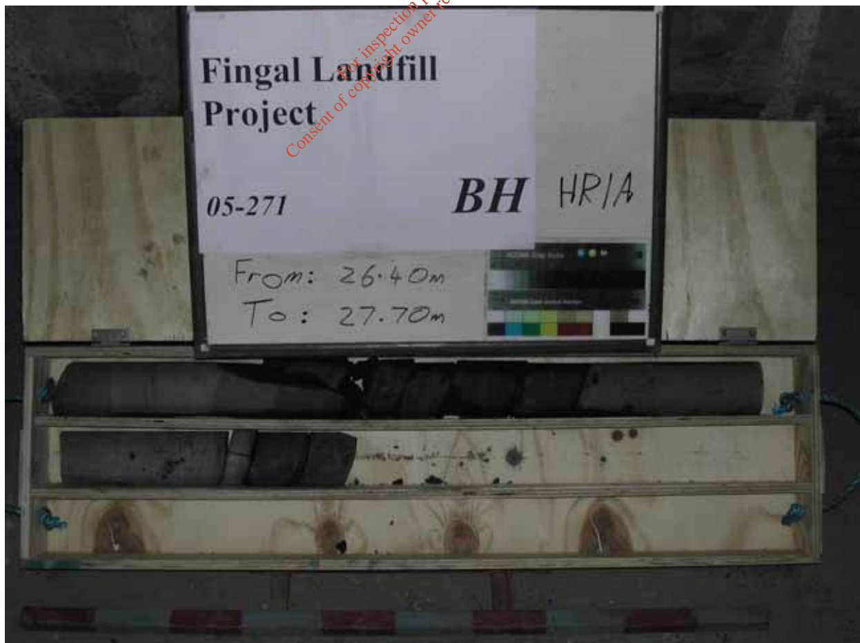
BH HR1A: 26.40-27.70m