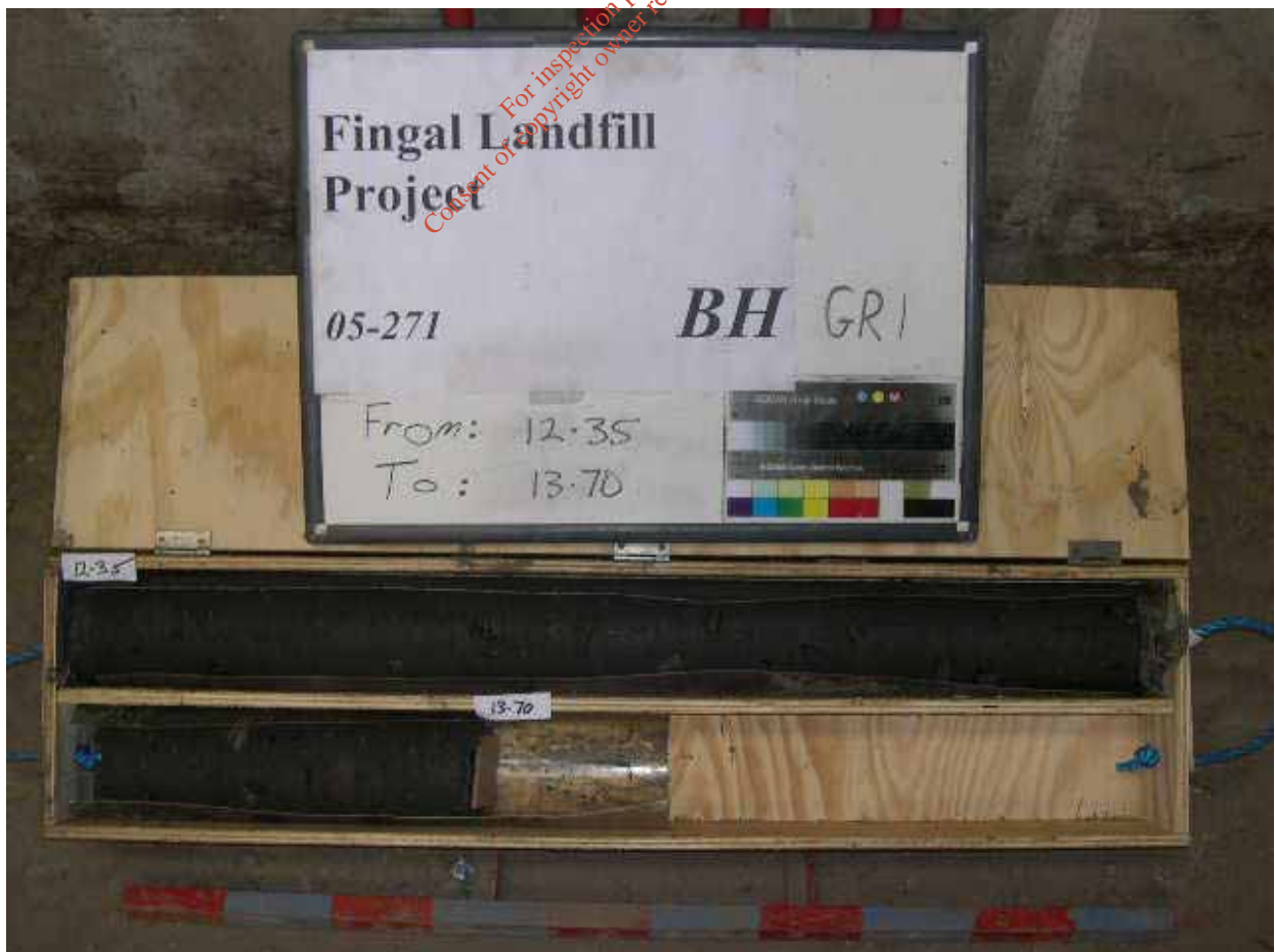
BH GR1: 12.35-13.70m