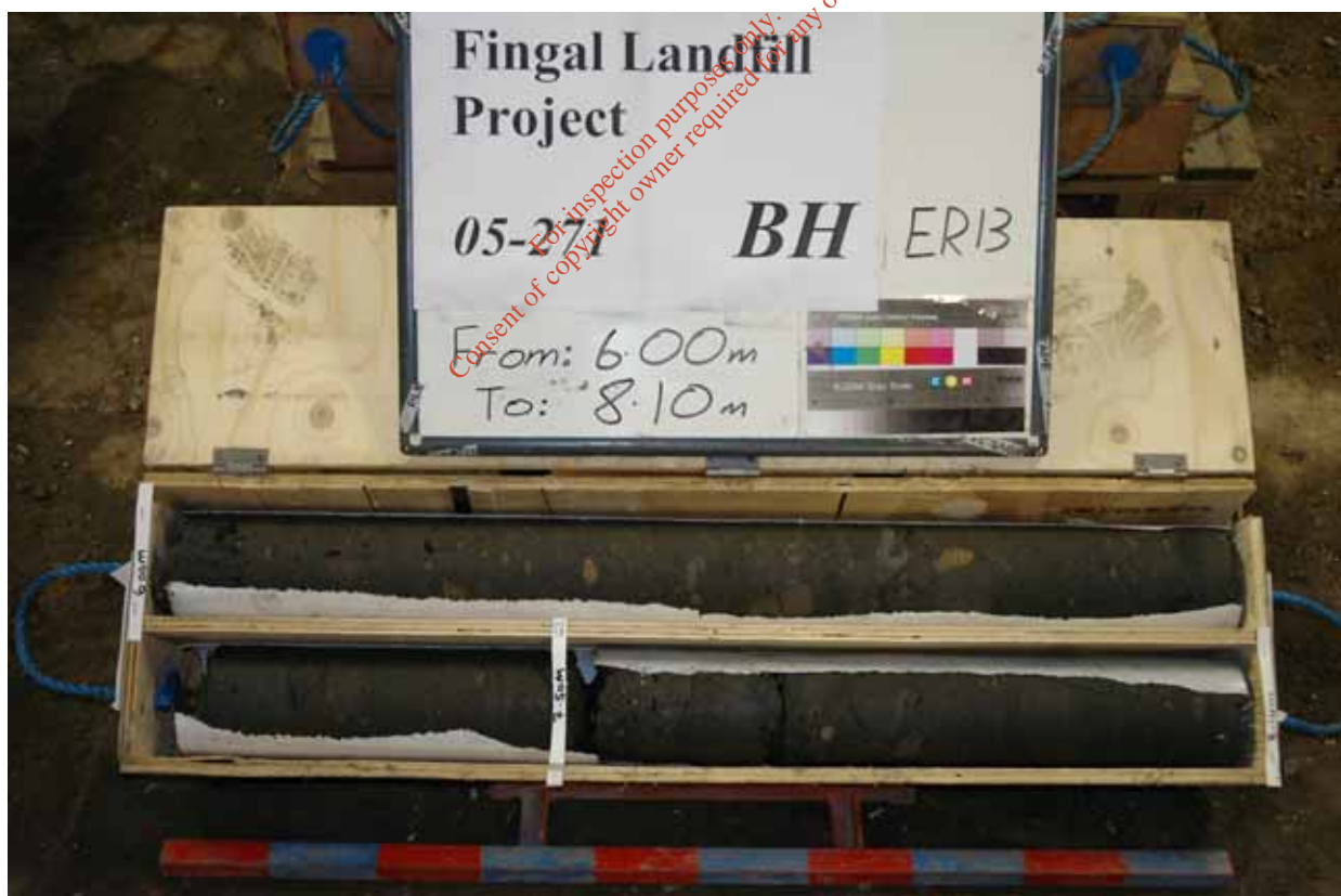
BH ER13: 6.00-8.10m