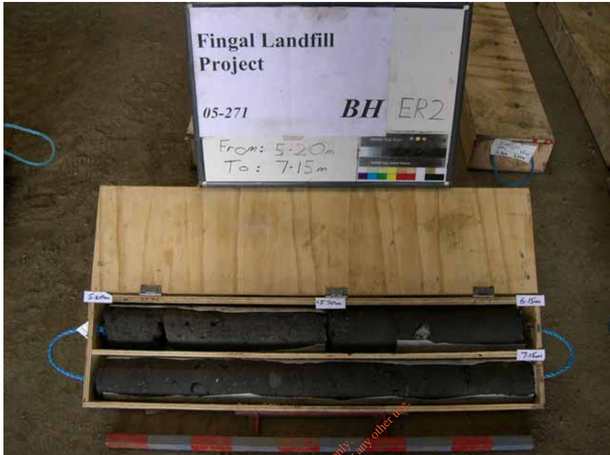
BH ER2: 5.20-7.15m