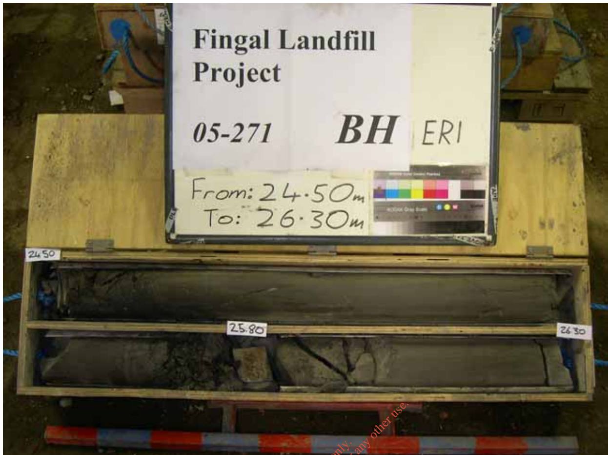
BH ER1: 24.50-26.30m