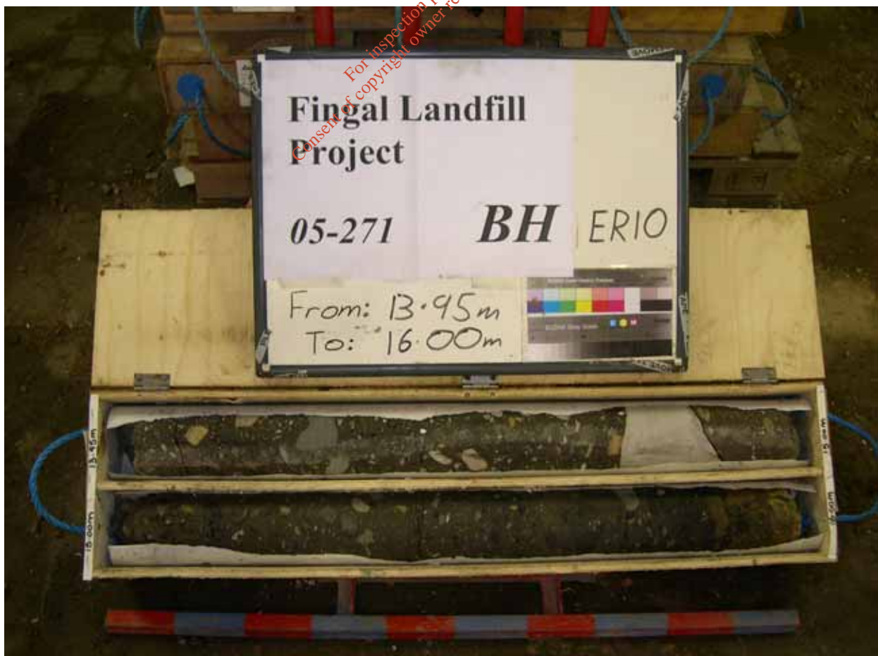
BH ER10: 13.95-16.00m