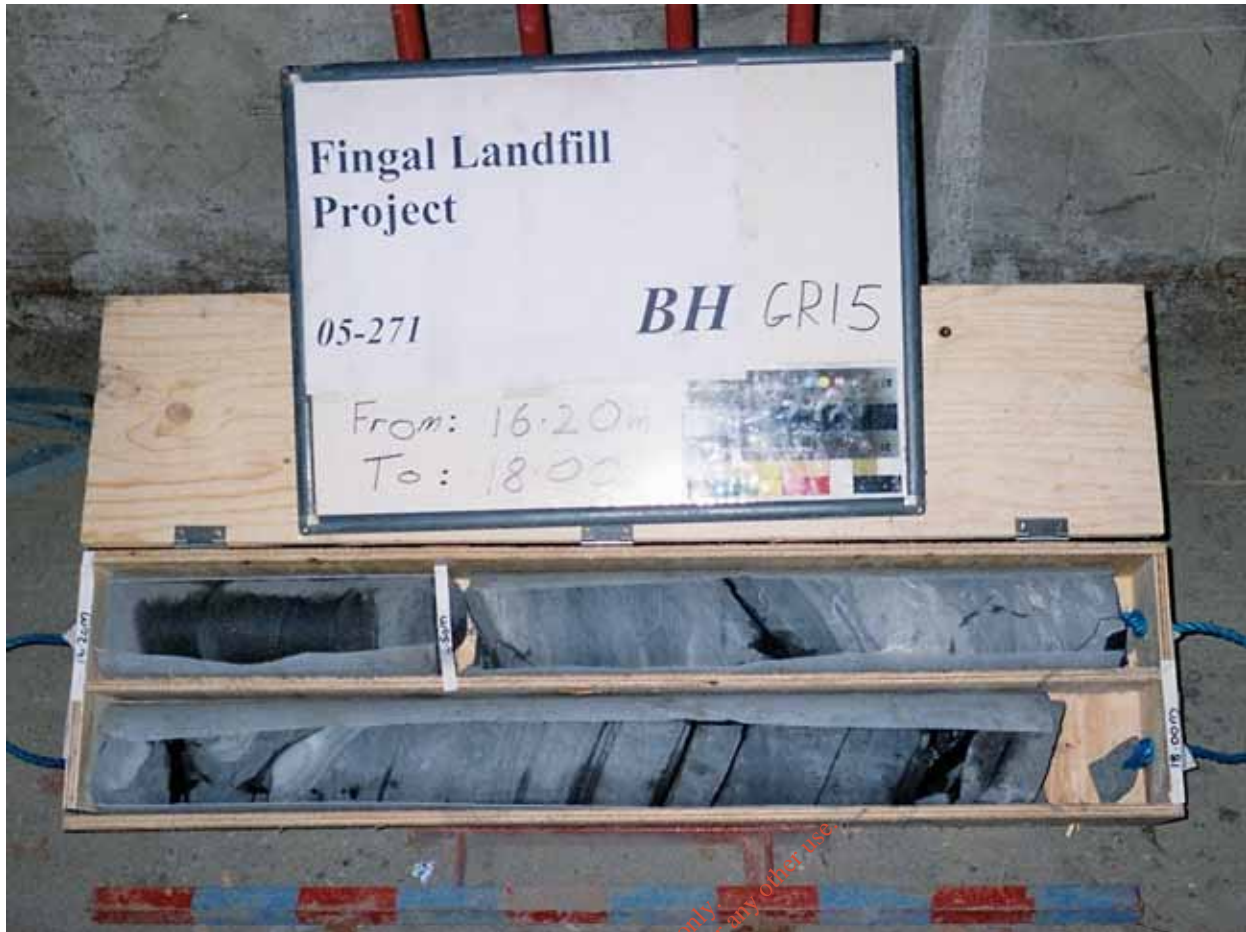
BH GR15: 16.20-18.00m