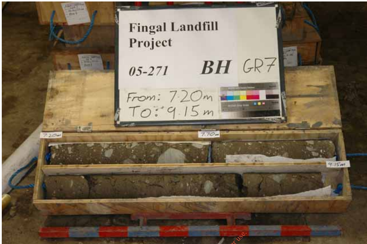
BH GR7: 7.20-9.15m