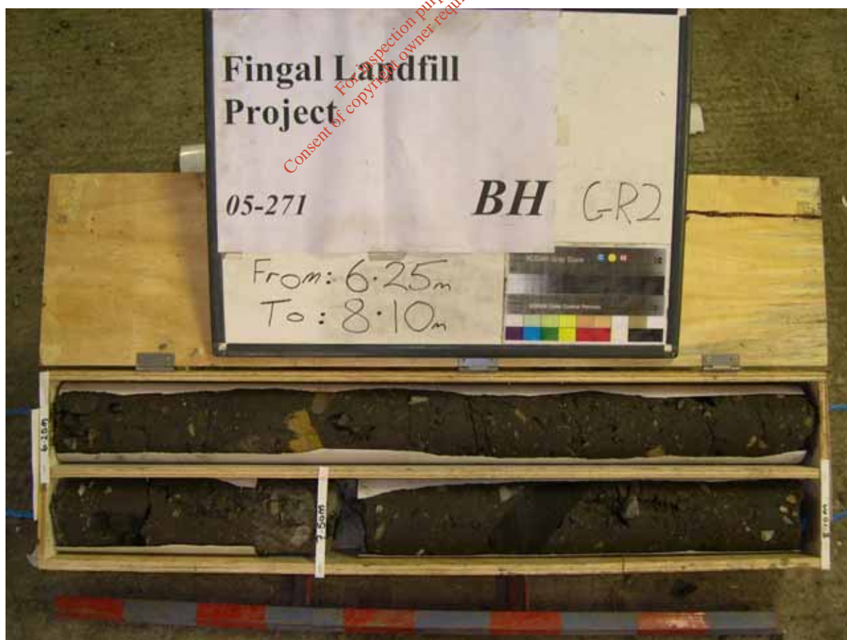
BH GR02: 6.25-8.10m