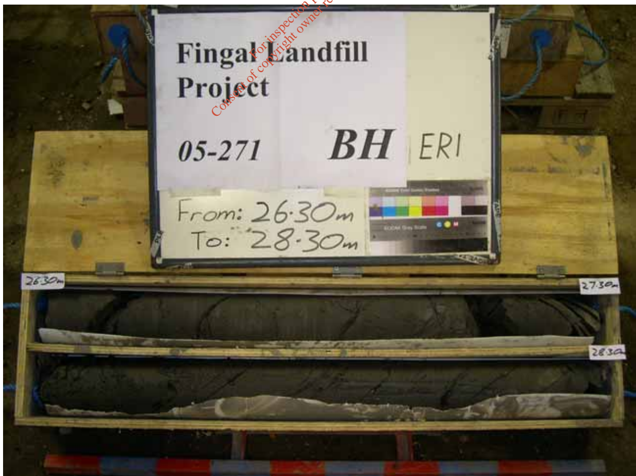
BH ER1: 26.30-28.30m