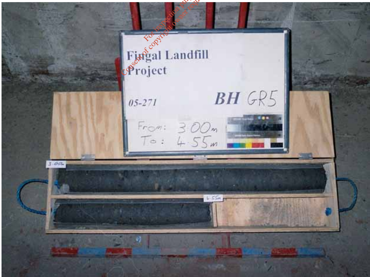
BH GR5: 3.00-4.55m