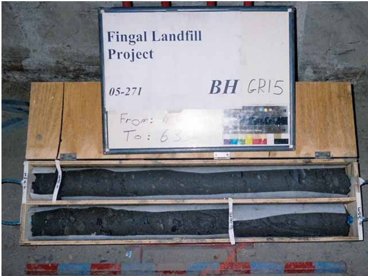
BH GR15: 4.45-6.35m