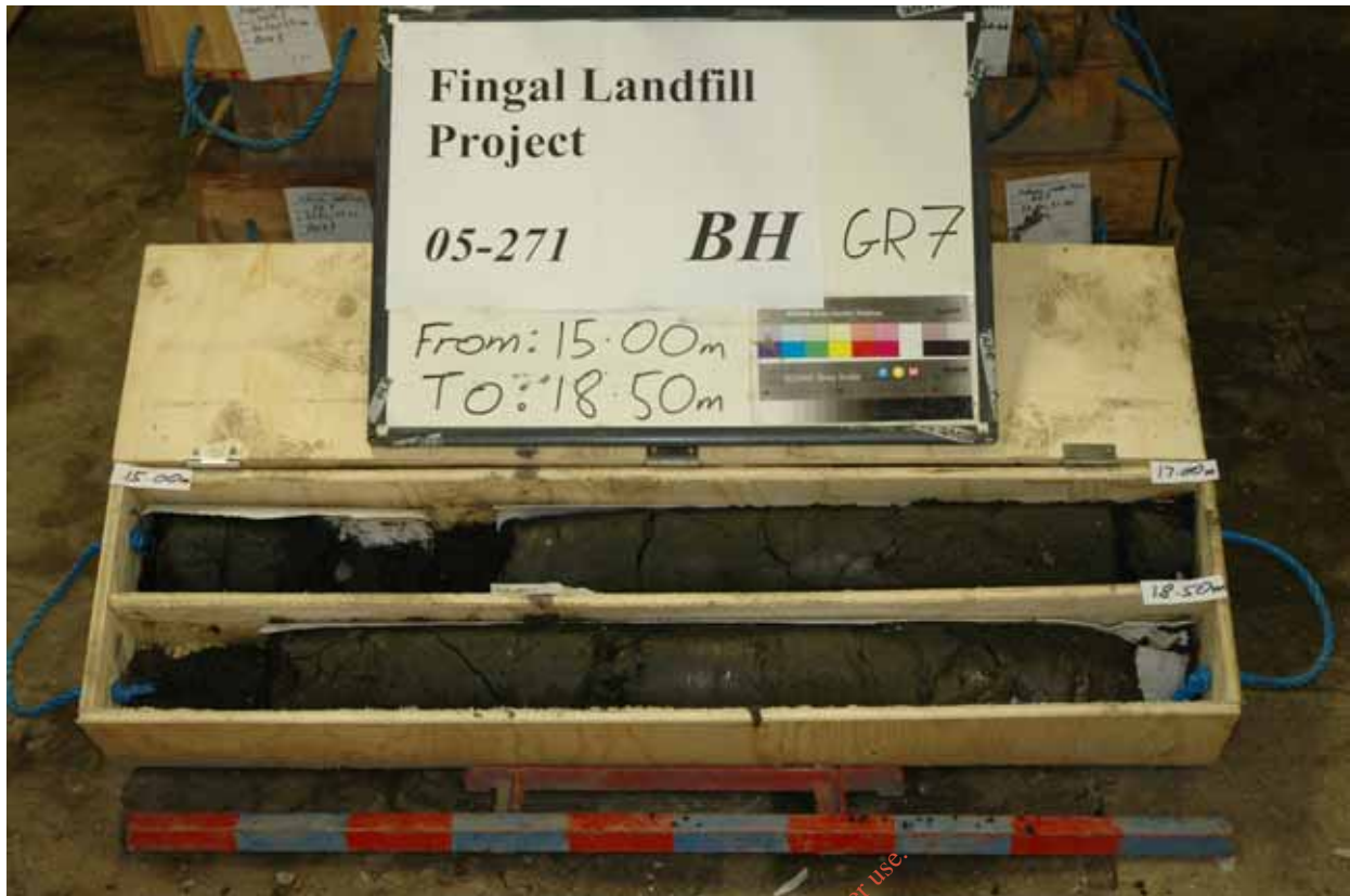
BH GR7: 15.00-18.50m