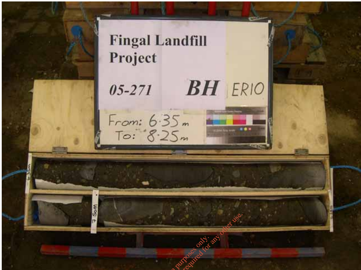
BH ER10 6.35-8.25m

For inspection purposes only. Consent of copyright owner required for any other use.