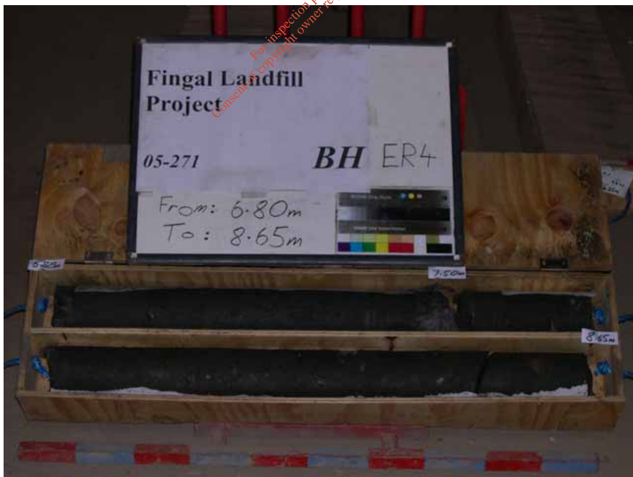
BH ER4: 6.80-8.65m