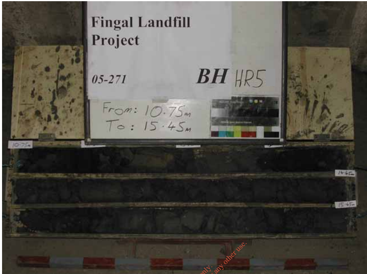
BH HR5: 10.75-15.45m