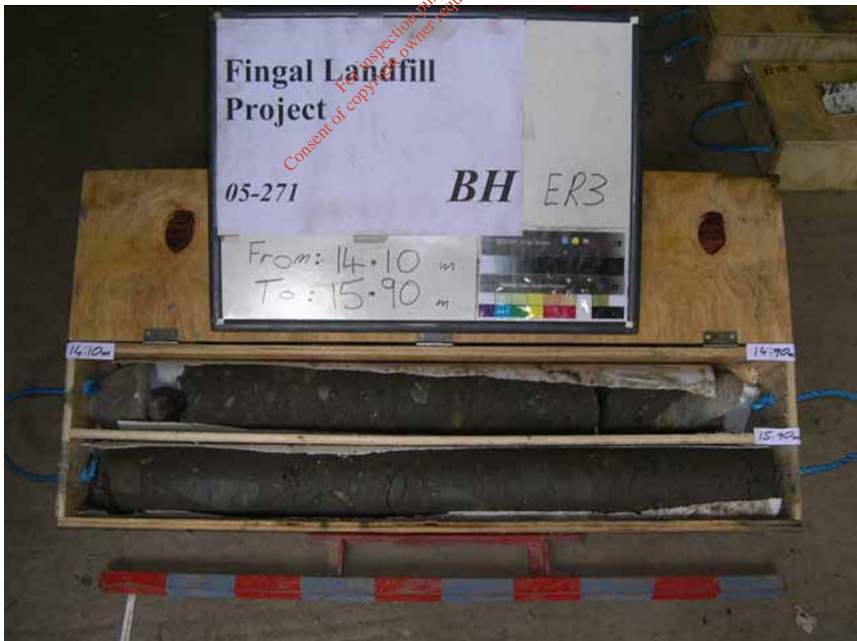
BH ER3: 14.10-15.90m