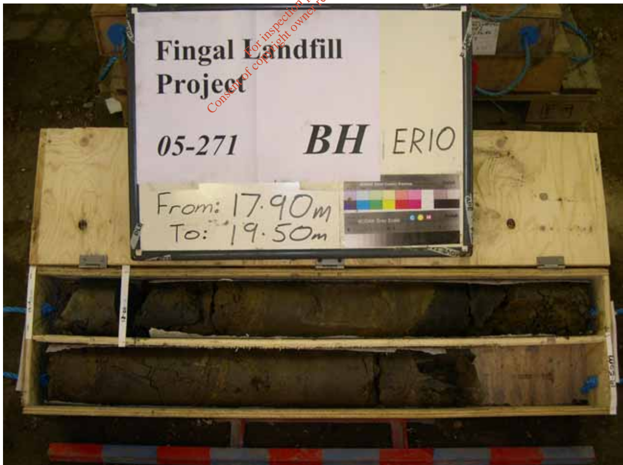
BH ER10: 17.90-19.50m