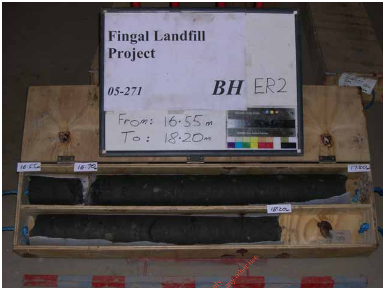
BH ER2: 16.55-18.20m