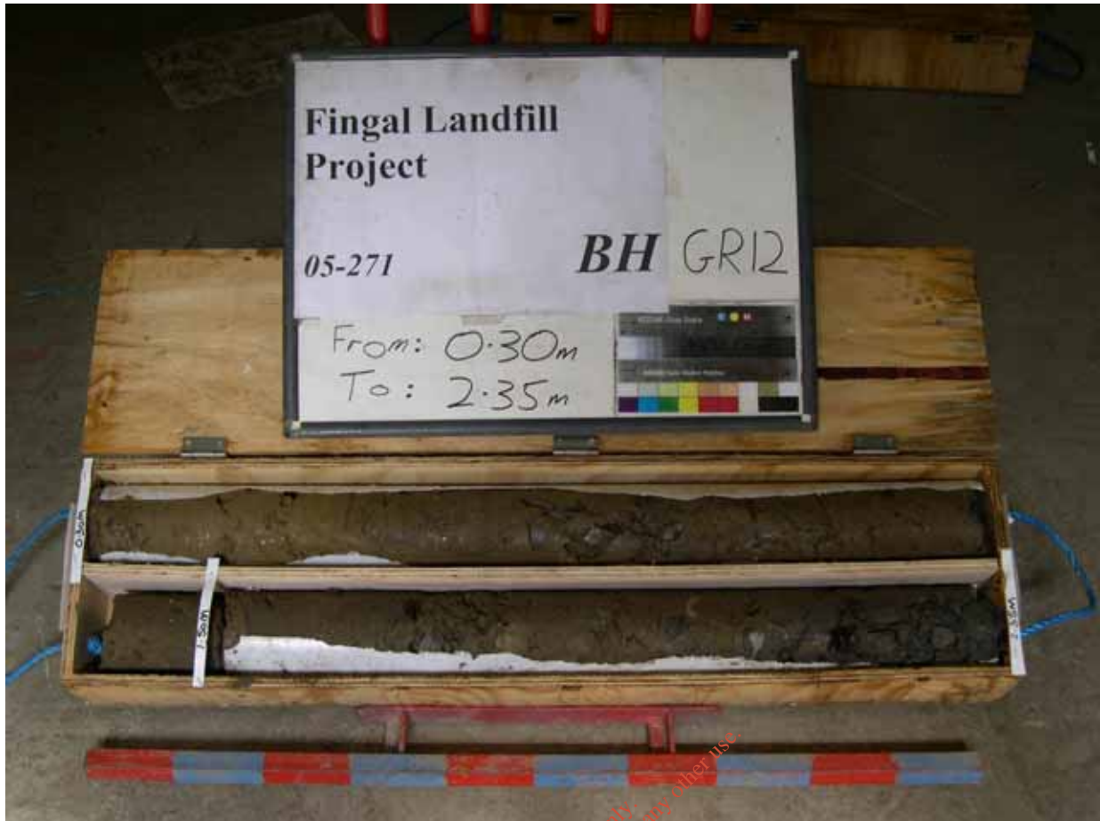
BH GR12: 0.30-2.35m