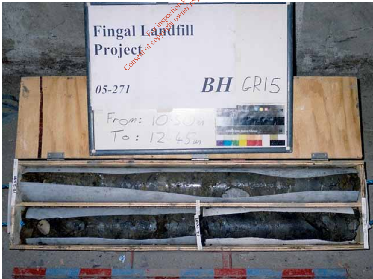
BH GR15: 10.50-12.45m