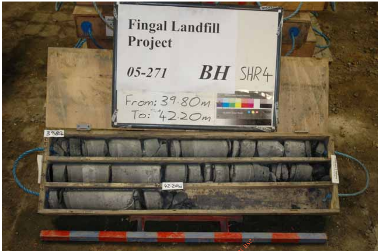
BH SHR4: 39.80-42.20m