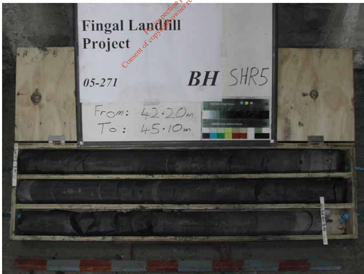
BH SHR5: 42.20-45.10m