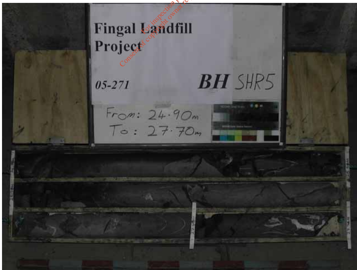
BH SHR5: 24.90-27.70m