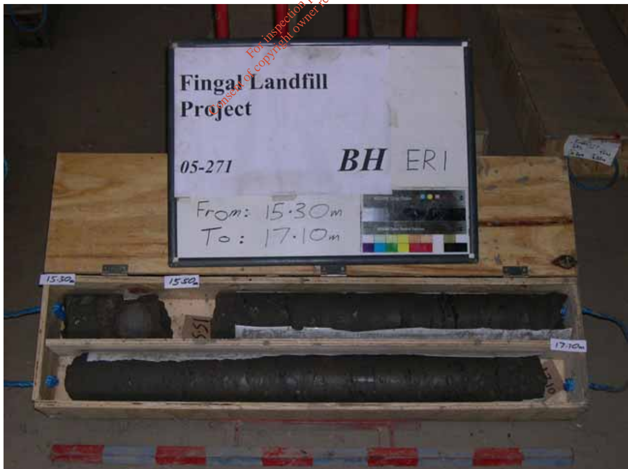
BH ER1: 15.30-17.10m