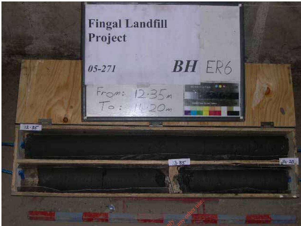
BH ER6: 12.35-14.20m