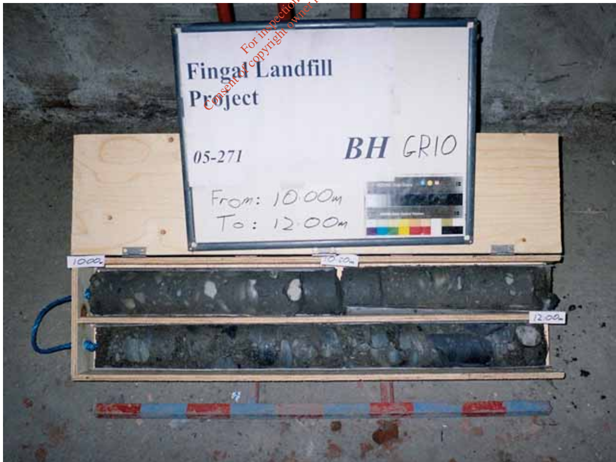
BH GR10: 10.00-12.00m