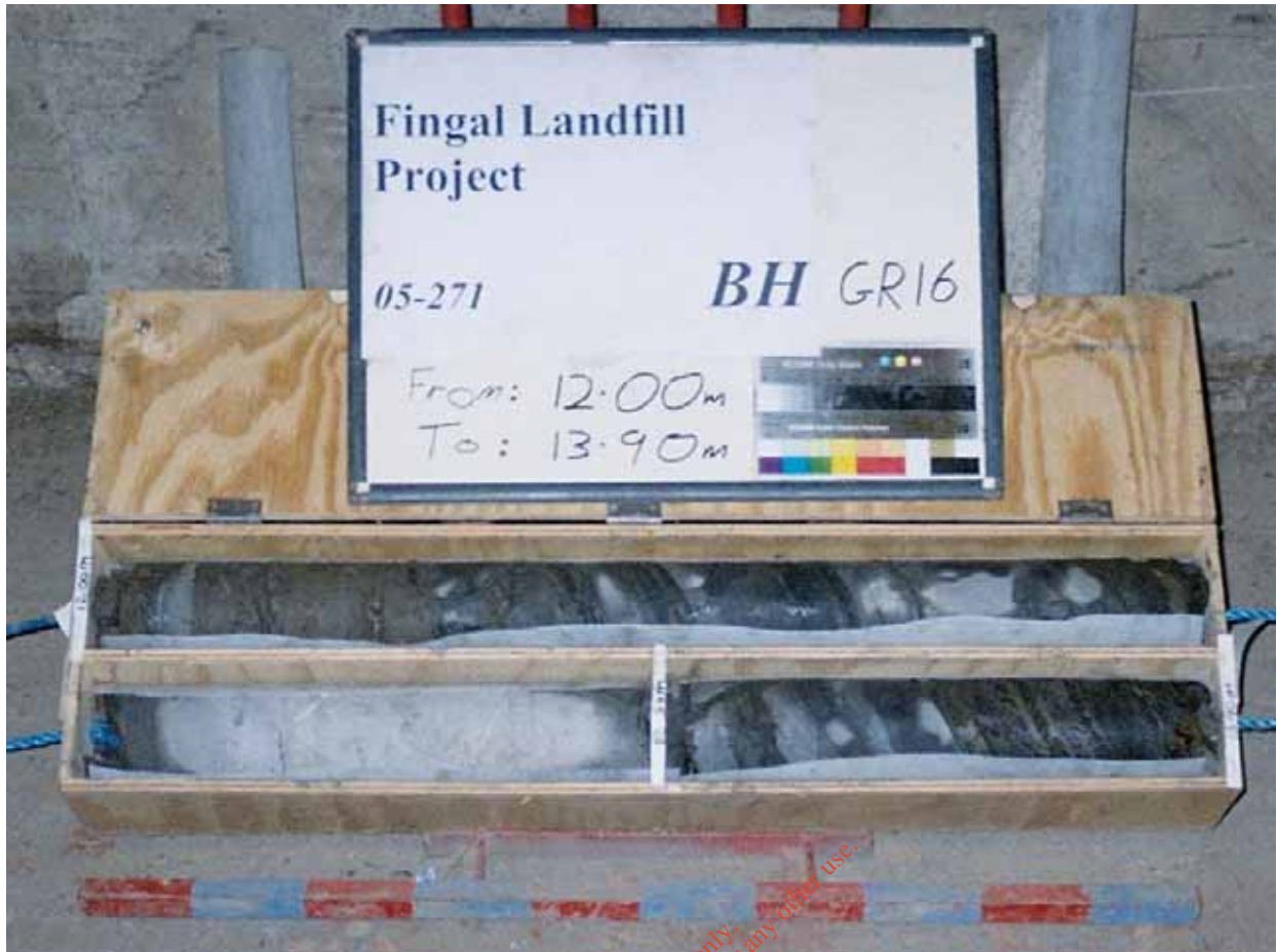
BH GR16: 12.00-13.90m