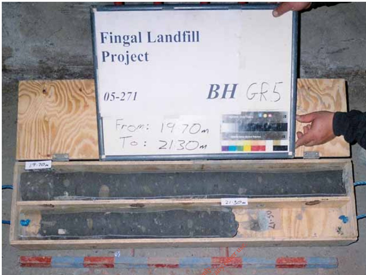
BH GR5: 19.70-21.30m