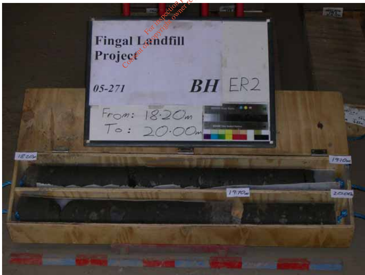
BH ER2: 18.20-20.00m