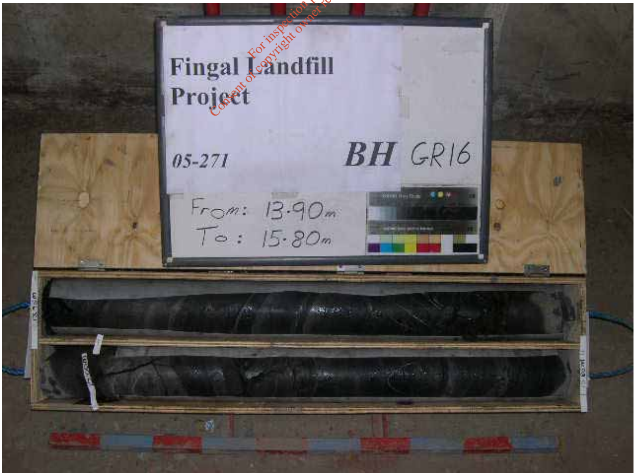
BH GR16: 13.90-15.80m