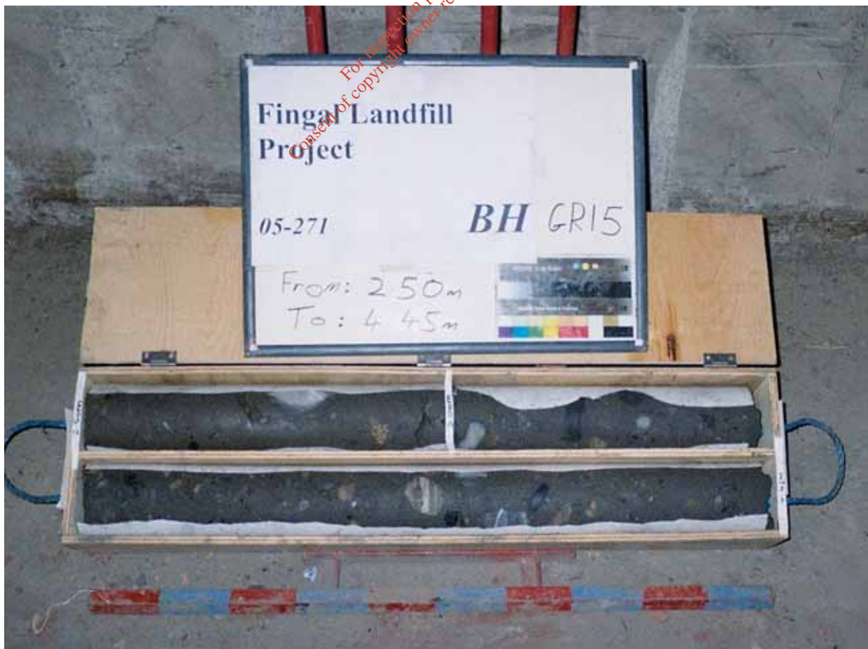
BH GR15: 2.50-4.45m