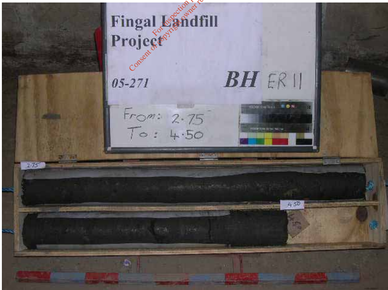
BH ER11: 2.75-4.50m