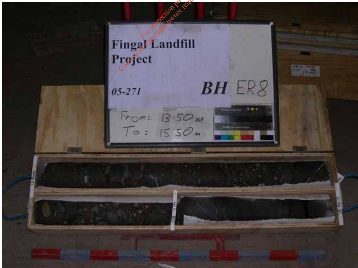
BH ER08: 13.50-15.50m