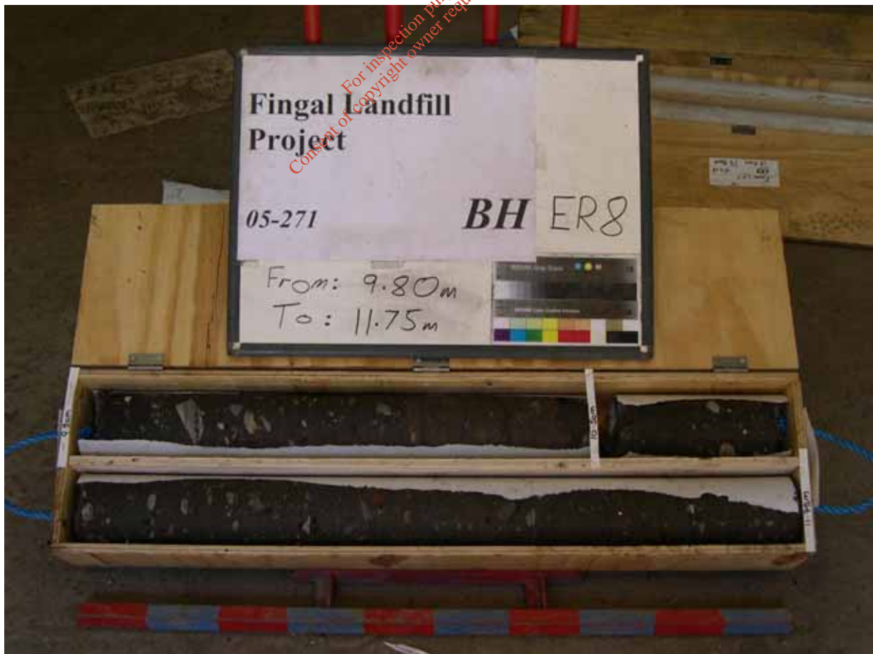
BH ER08: 9.80-11.75m