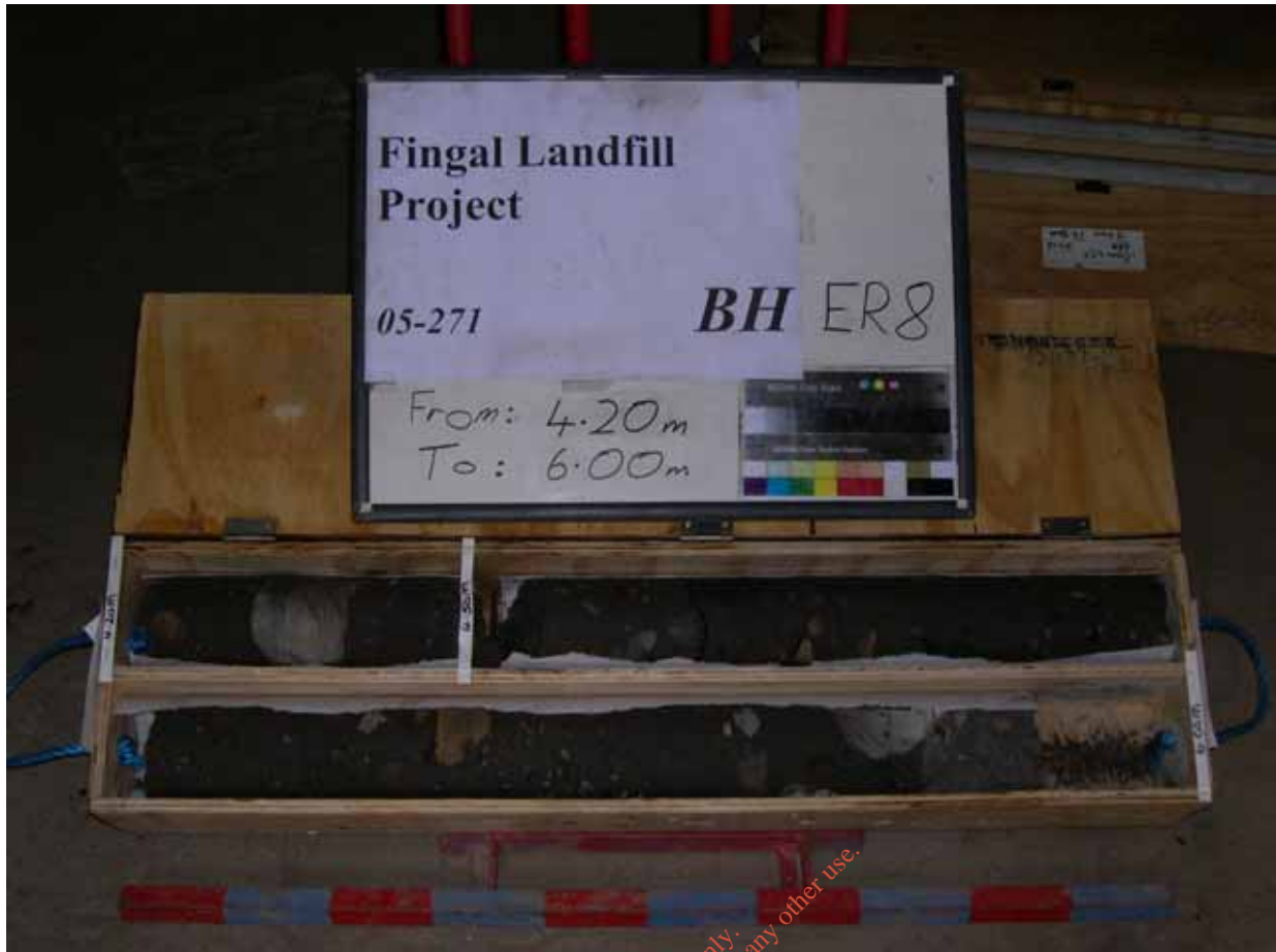
BH ER08: 4.20-6.00m