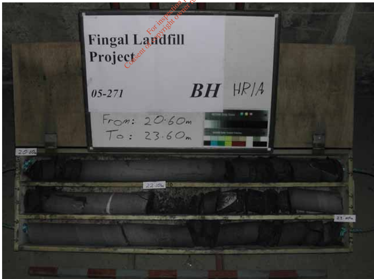
BH HR1A: 20.60-23.60m