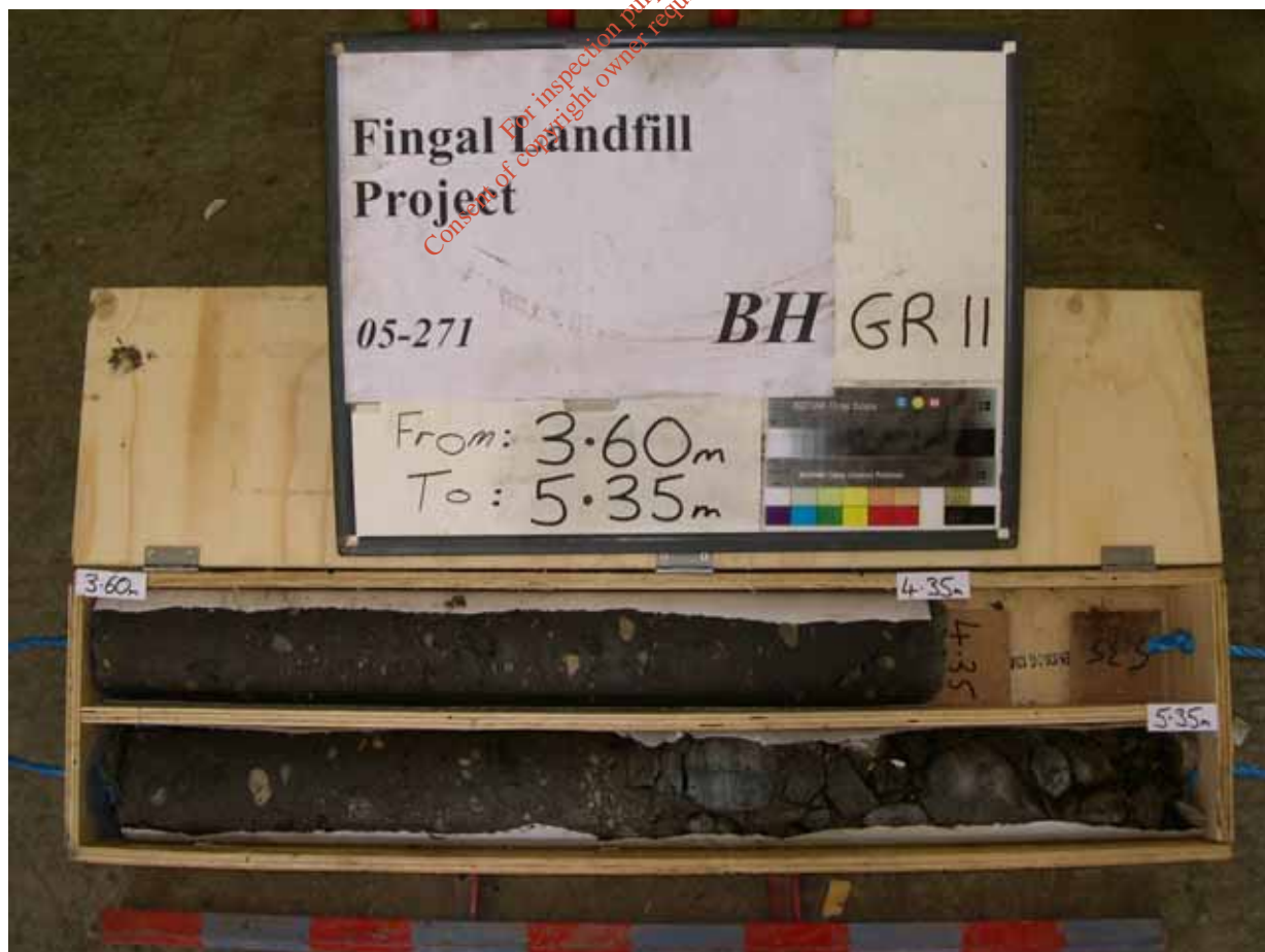
BH GR11: 3.60-5.35m