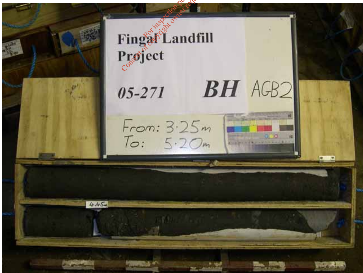
BH AGB2: 3.25-5.20m