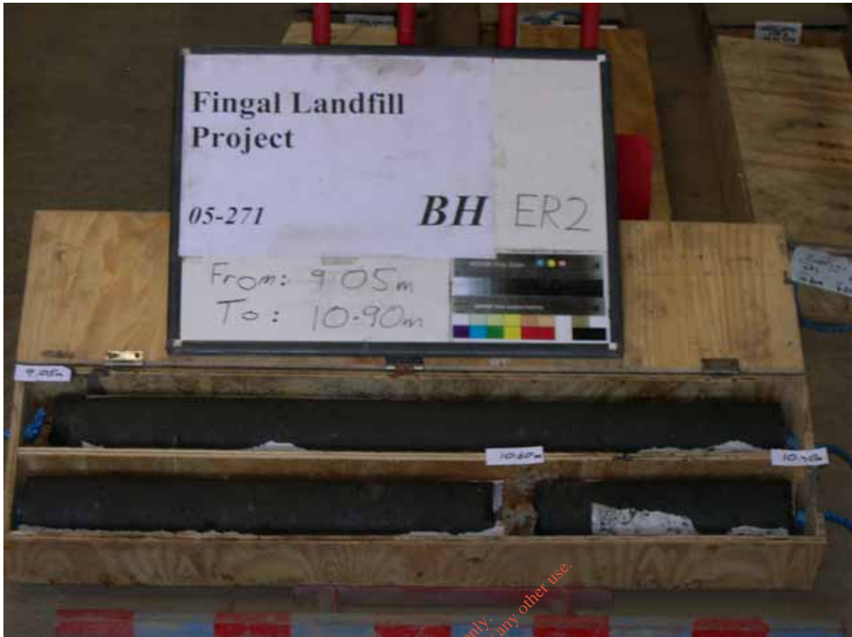
BH ER2: 9.05-10.90m