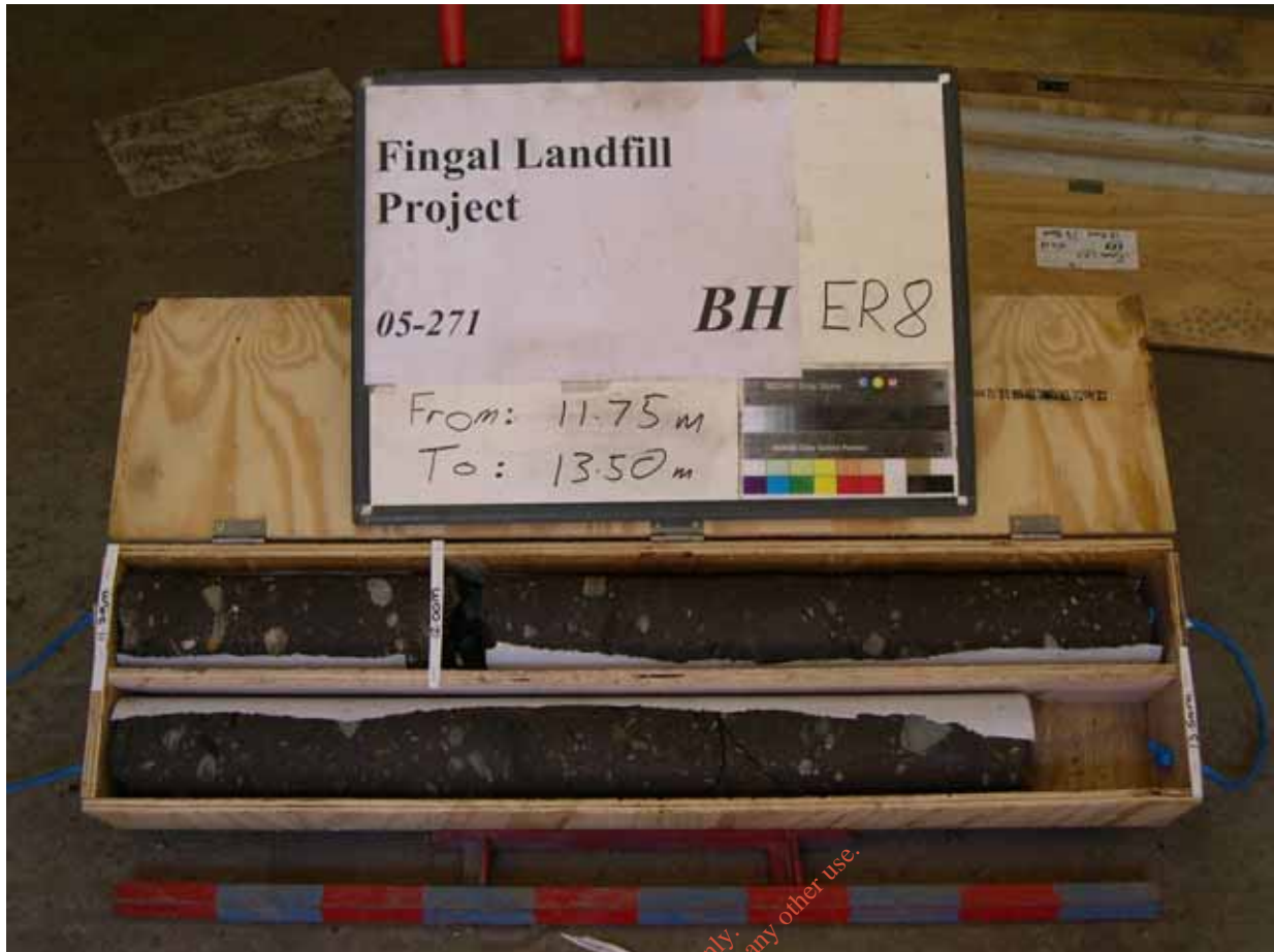
BH ER08: 11.75-13.50m