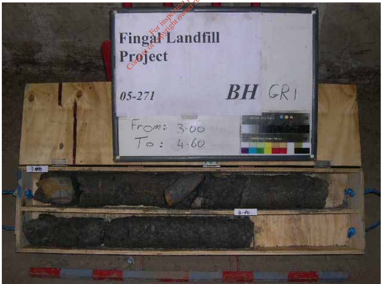
BH GR1: 3.00-4.60m