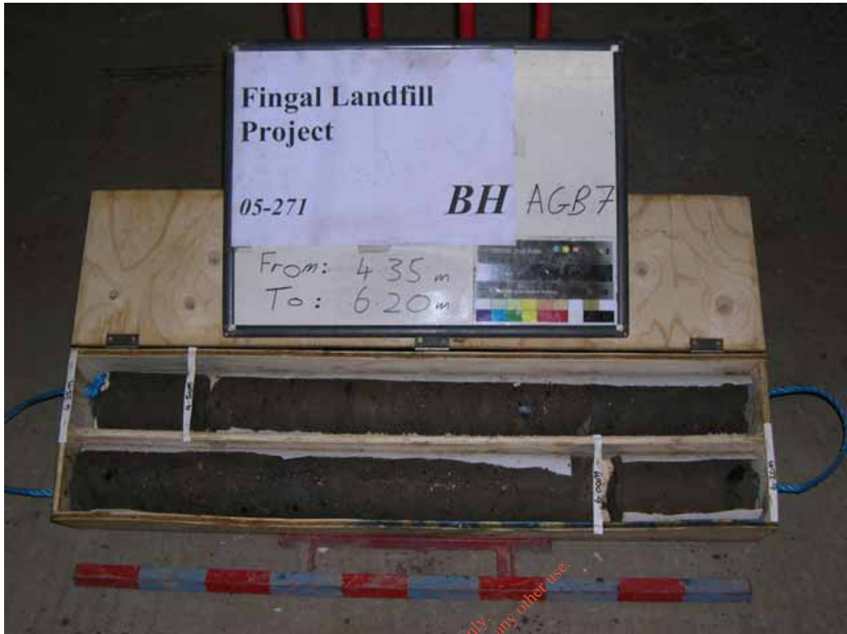
BH AGB7: 4.35-6.20m