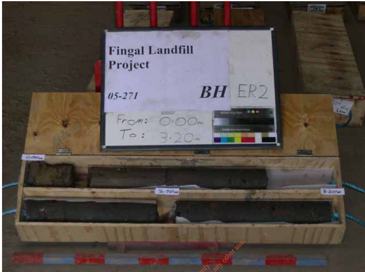
BH ER2: 0.00-3.20m