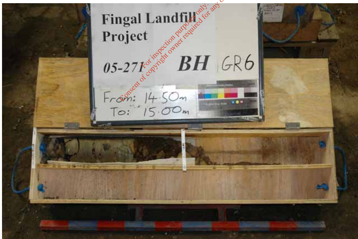
BH GR6: 14.50-15.00m