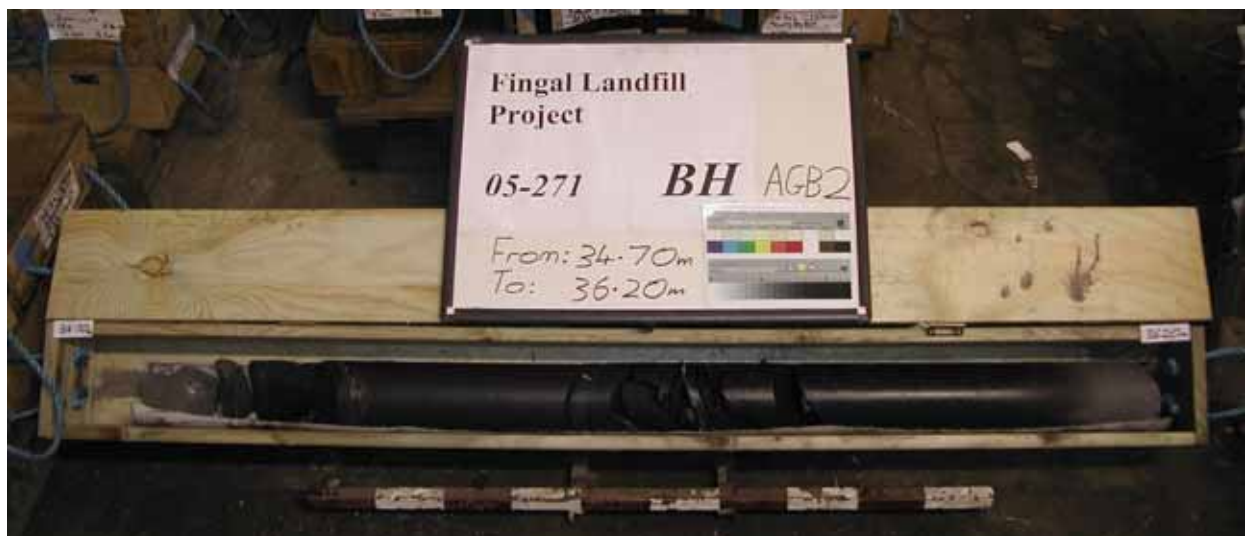
BH AGB2: 34.70-36.20m