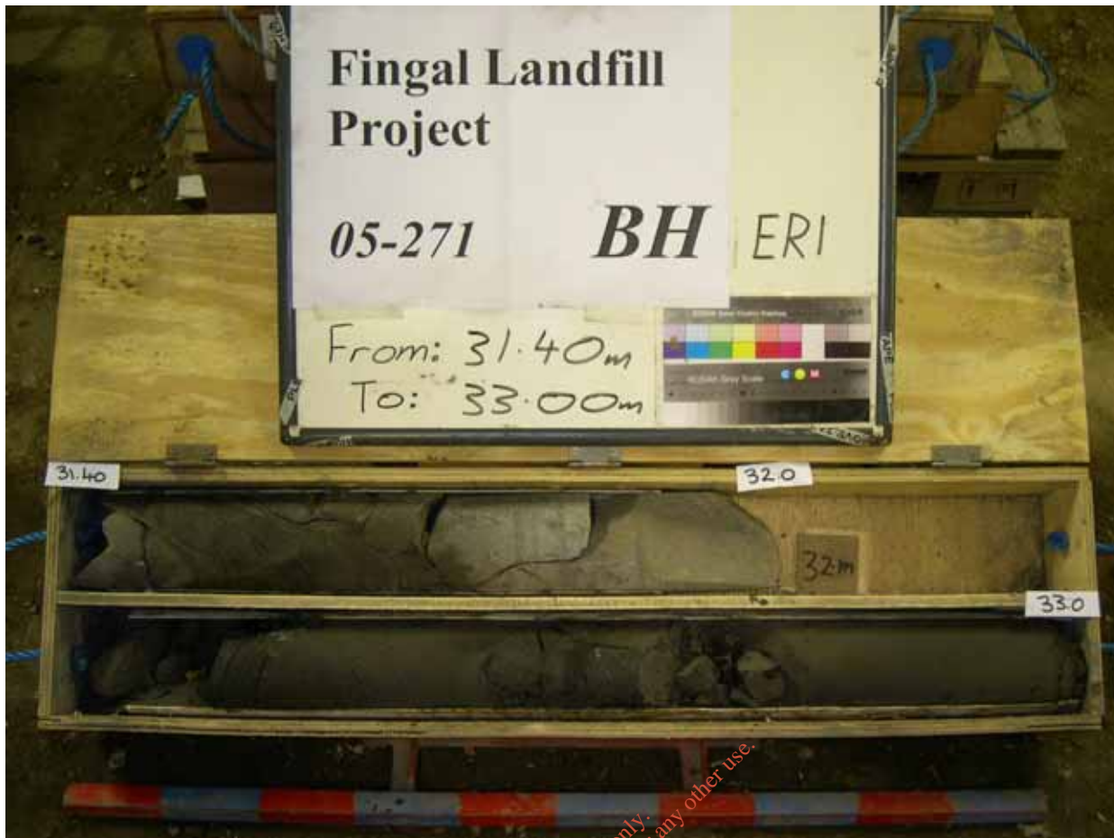
BH ER1: 31.40-33.00m