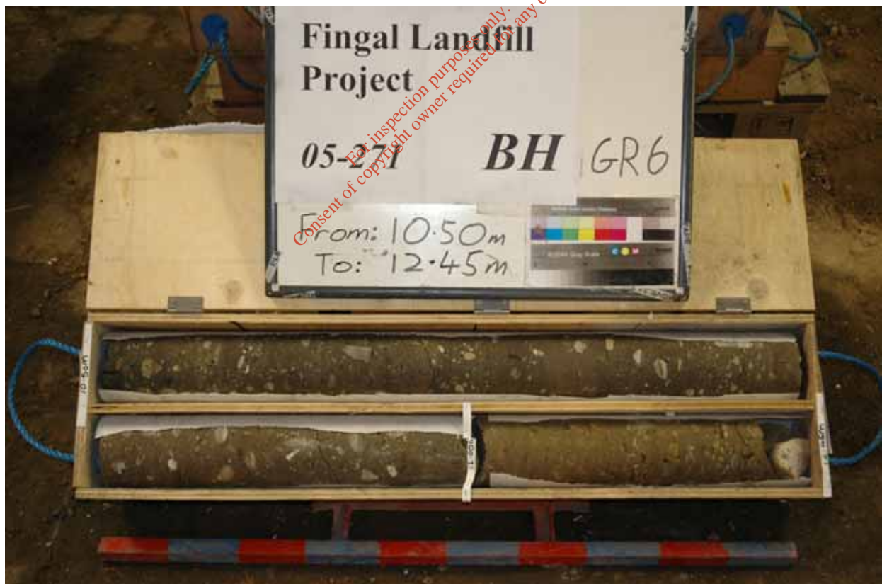
BH GR6: 10.50-12.45m