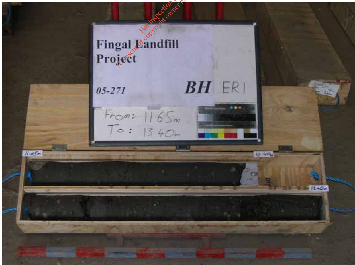
BH ER1: 11.65-13.40m