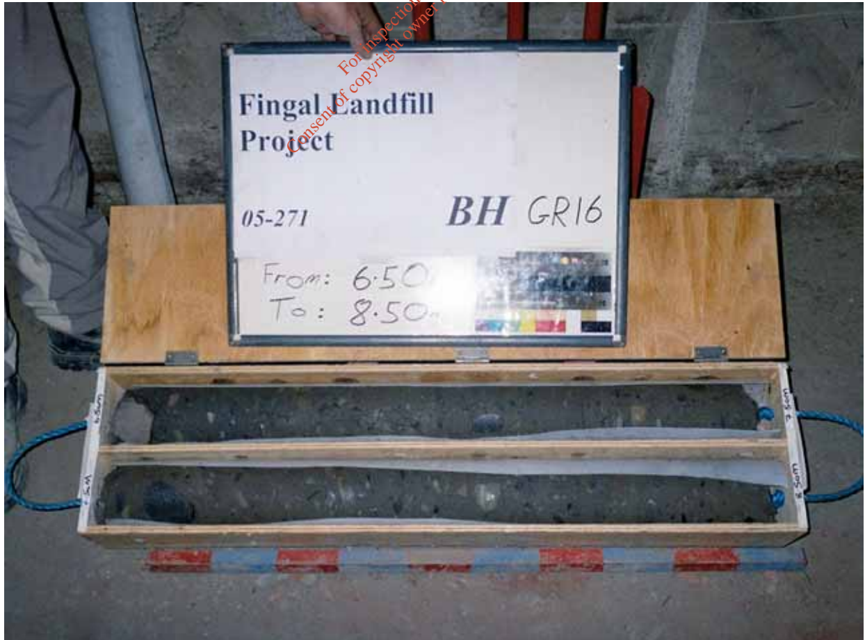
BH GR16: 6.50-8.50m