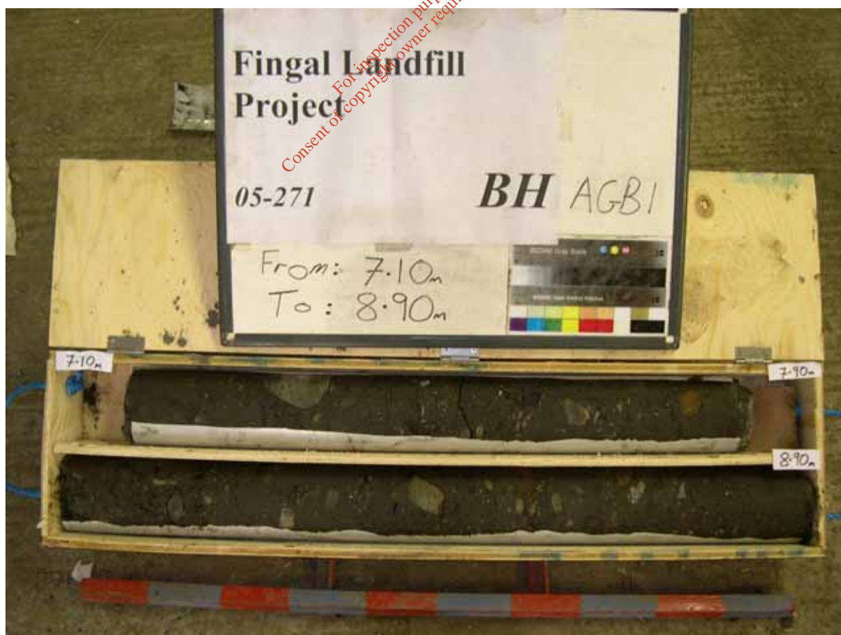
BH AGB1: 7.10-8.90m