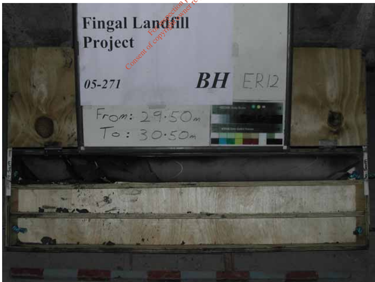
BH ER12: 29.50-30.50m