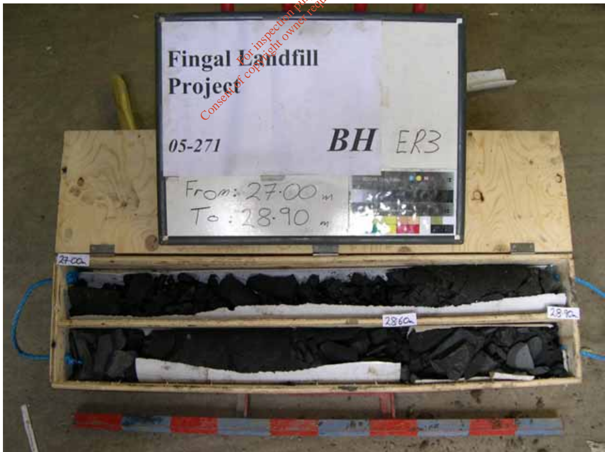
BH ER3: 27.00-28.90m