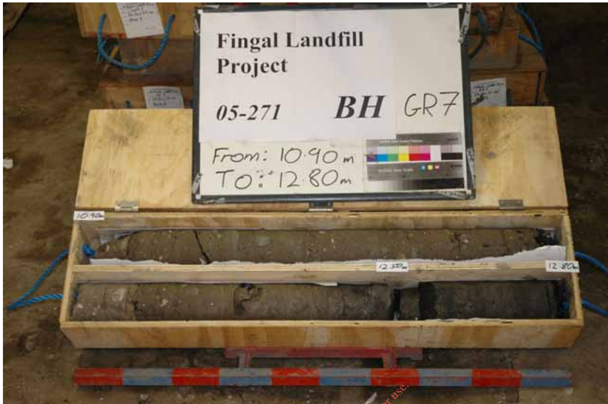
BH GR7: 10.90-12.80m