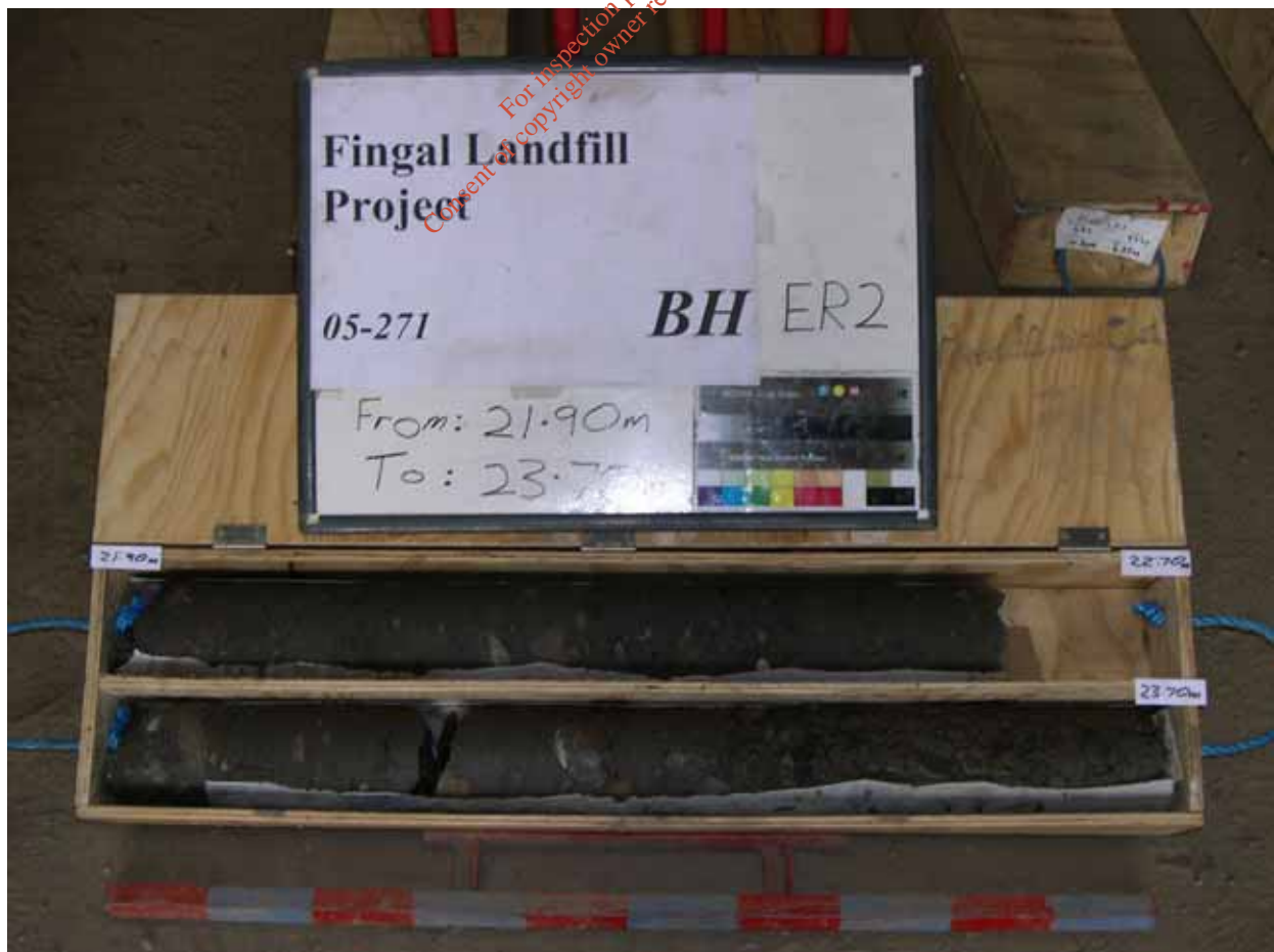
BH ER2: 21.90-23.70m