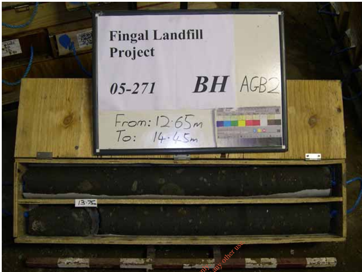
BH AGB2: 12.65-14.45m