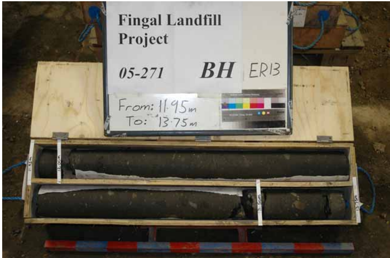
BH ER13: 11.95-13.75m