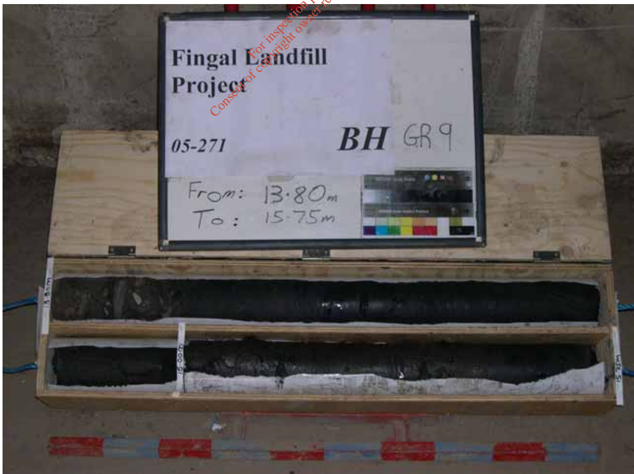
BH GR9: 13.80-15.75m