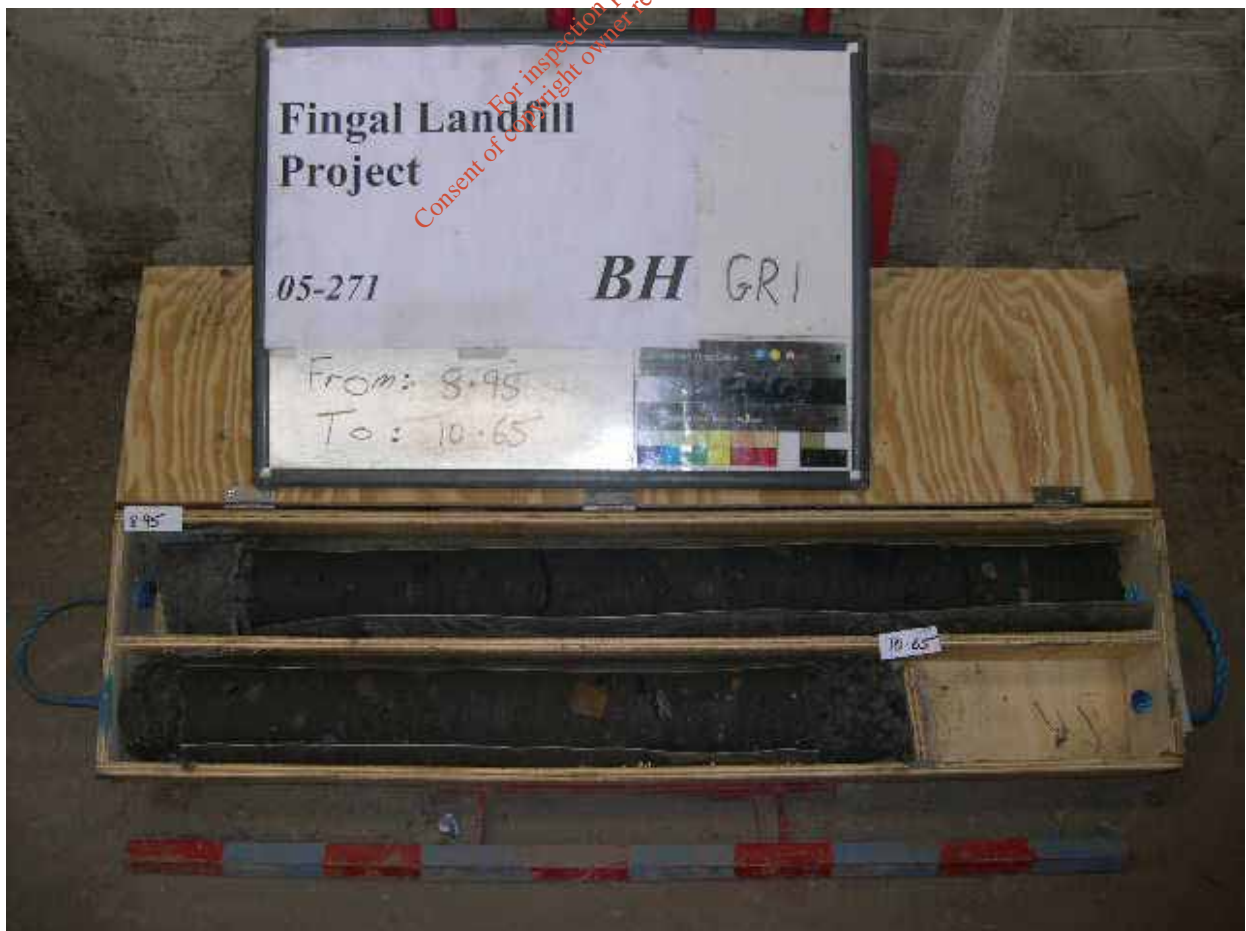
BH GR1: 8.95-10.65m