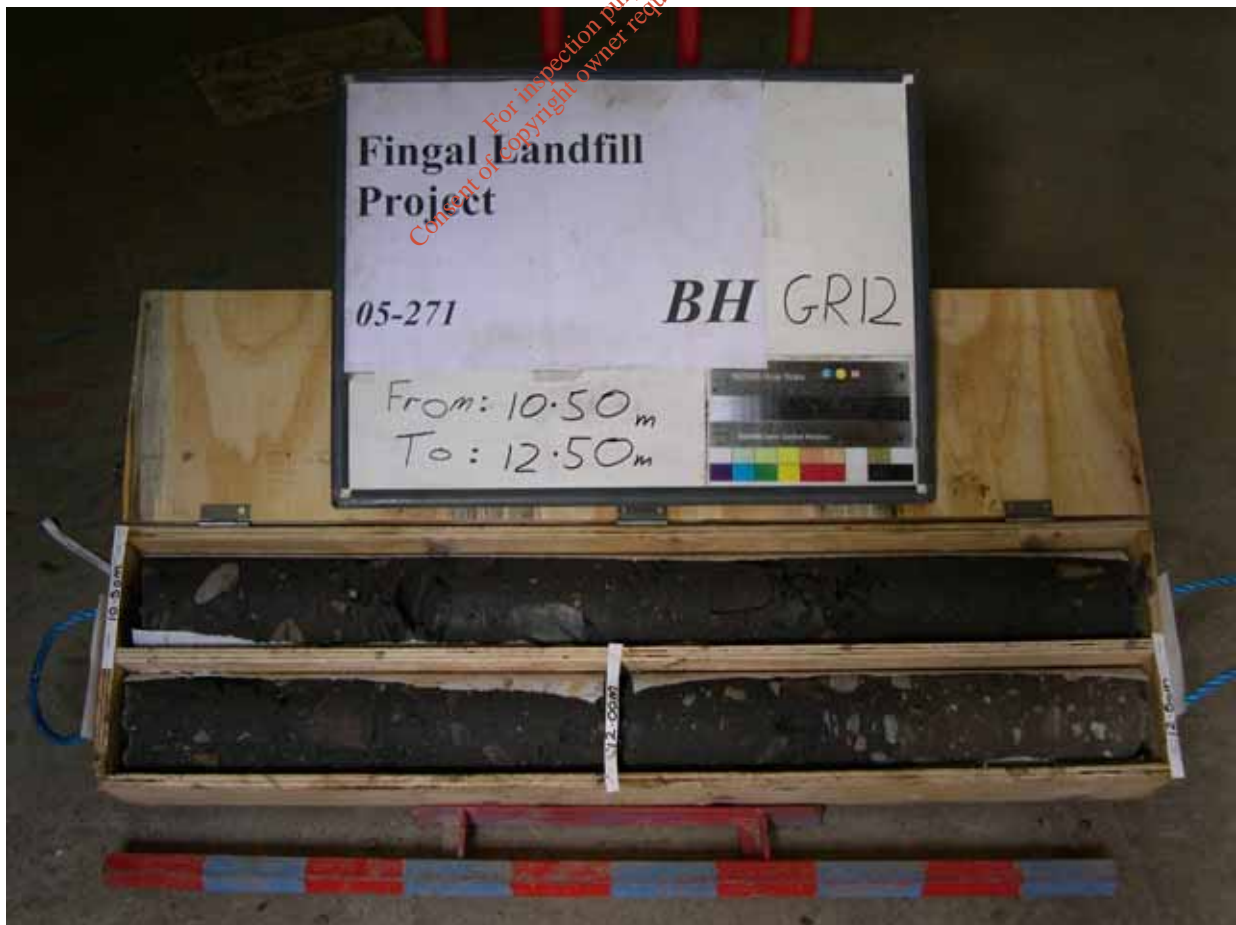
BH GR12: 10.50-12.50m