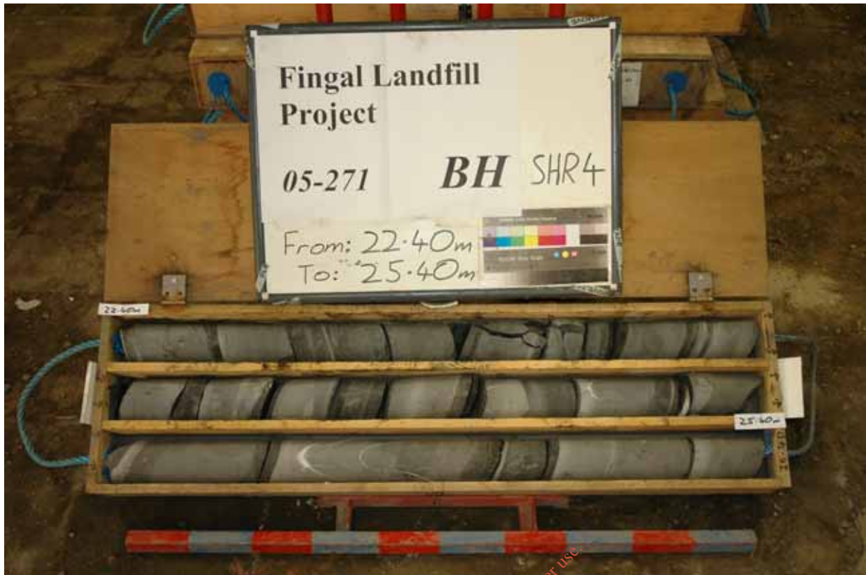
BH SHR4: 22.40-25.40m