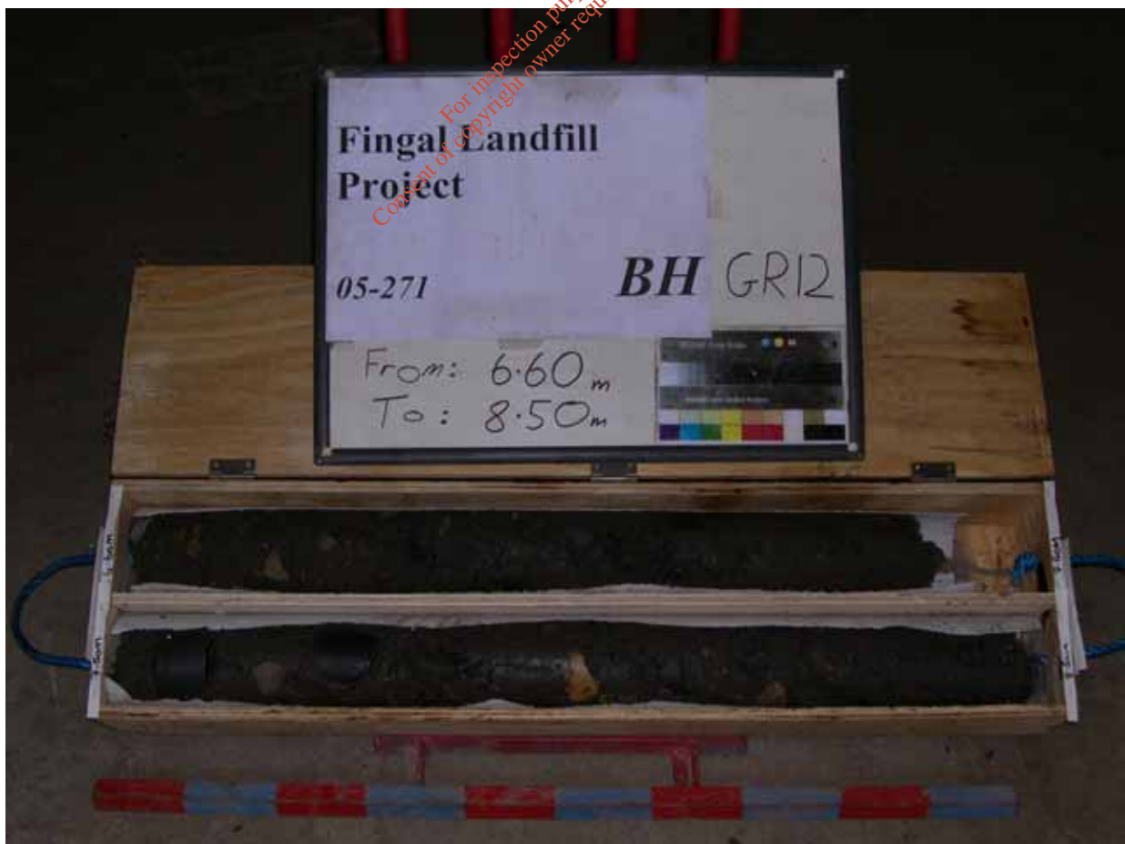
BH GR12: 6.60-8.50m