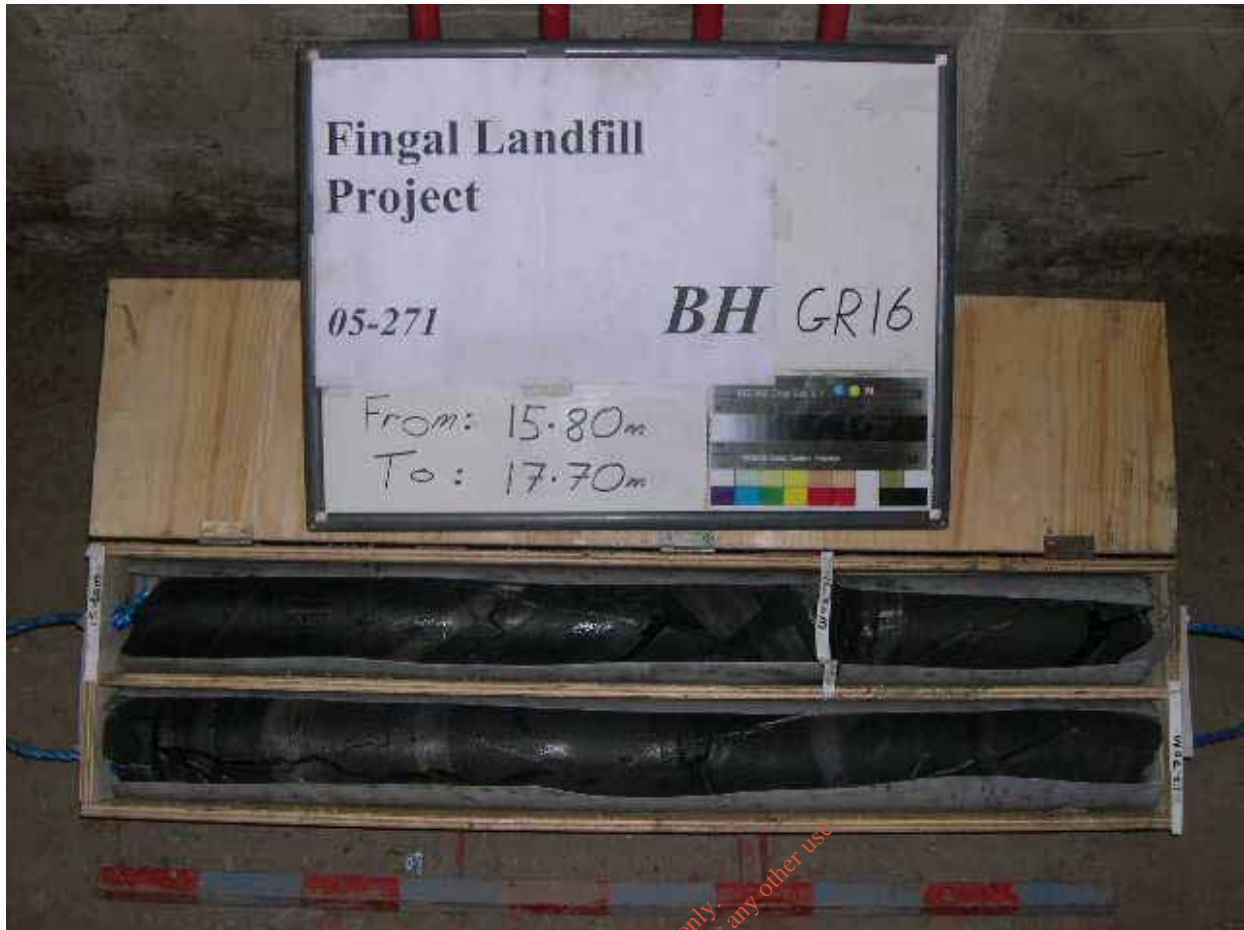
BH GR16: 15.80-17.70m