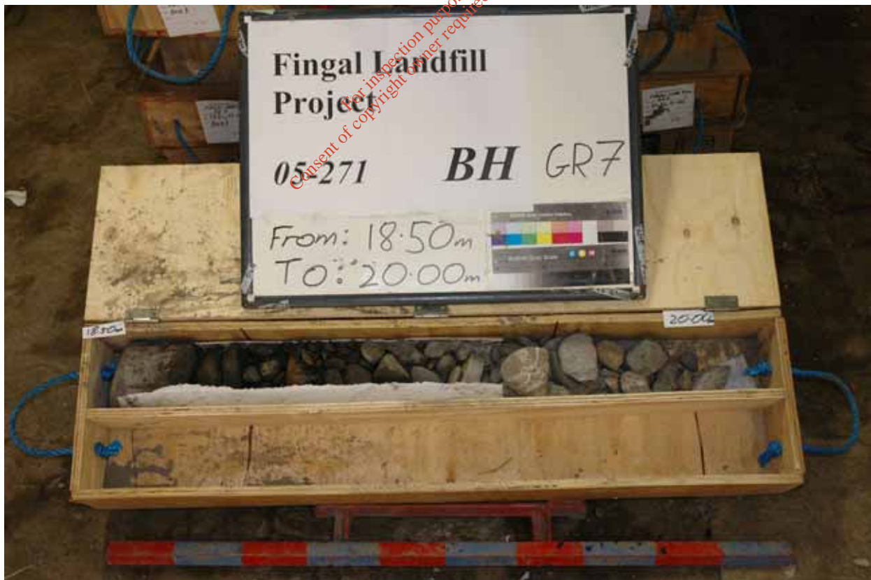
BH GR7: 18.50-20.00m