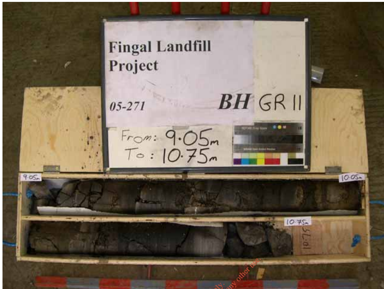
BH GR11: 9.05-10.75m