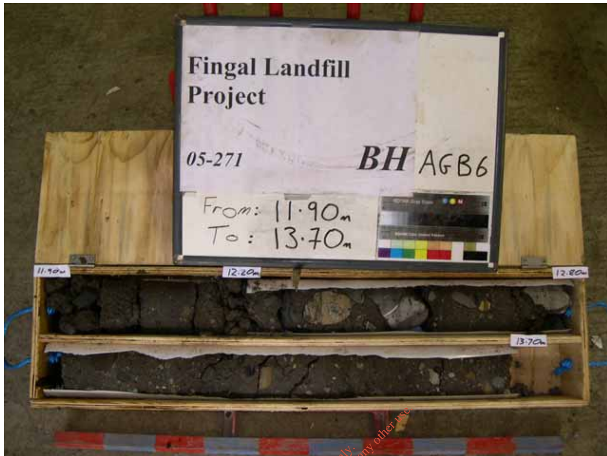
BH AGB6 11.90-13.70m