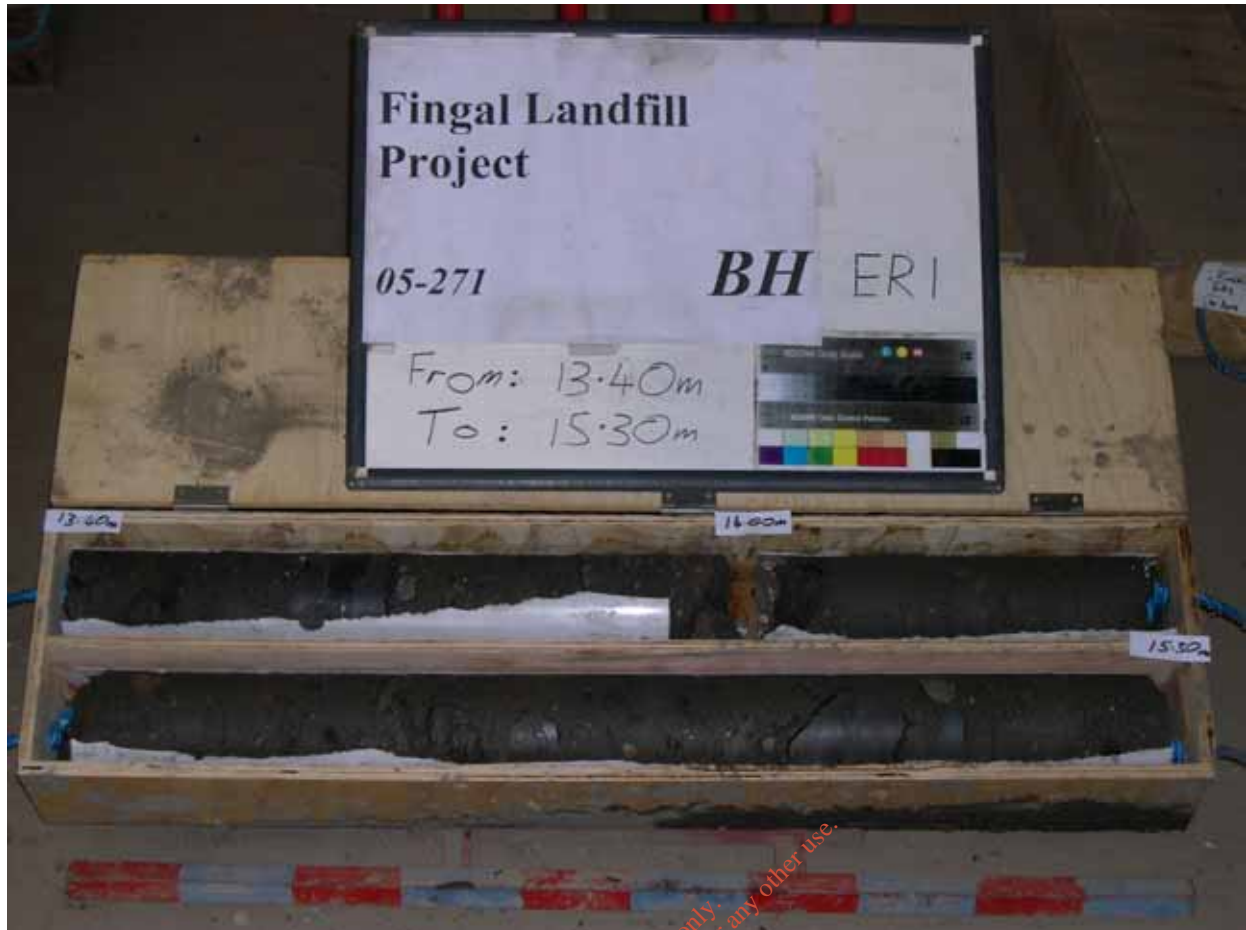
BH ER1: 13.40-15.30m