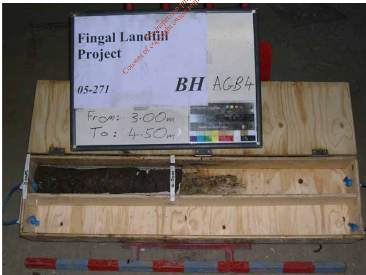
BH AGB4: 3.00-4.50m