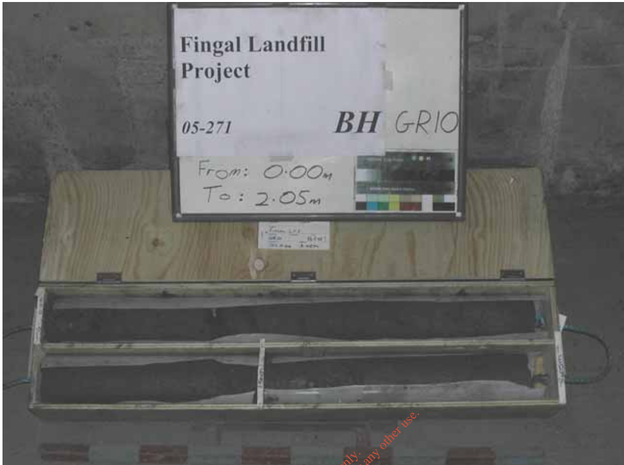
BH GR10: 0.00-2.05m