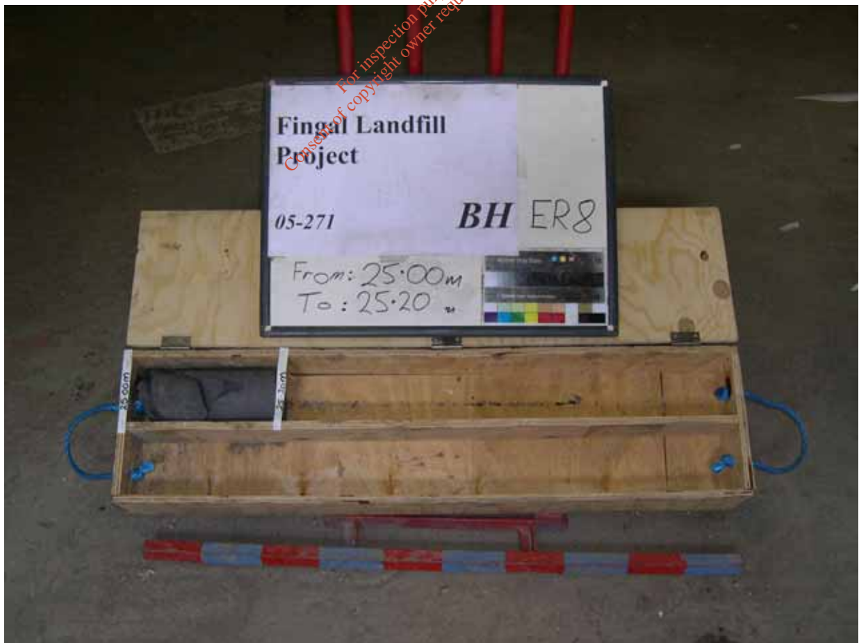
BH ER08: 25.00-25.20m