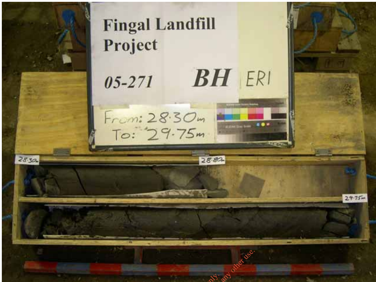
BH ER1: 28.30-29.75m