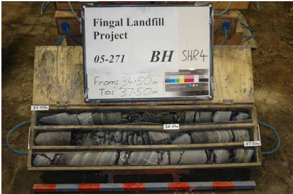
BH SHR4: 34.50-37.50m