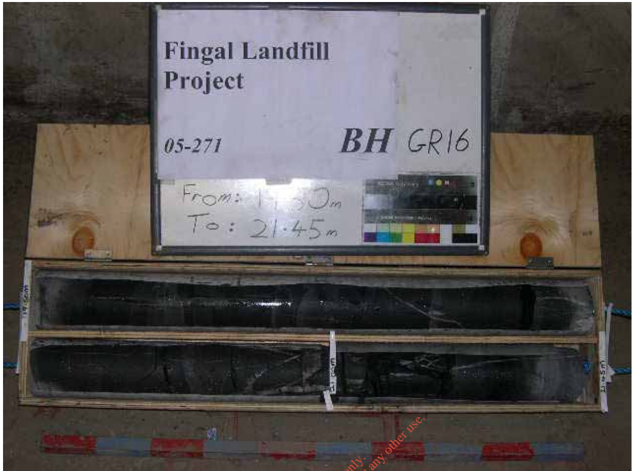
BH GR16: 19.50-21.45m