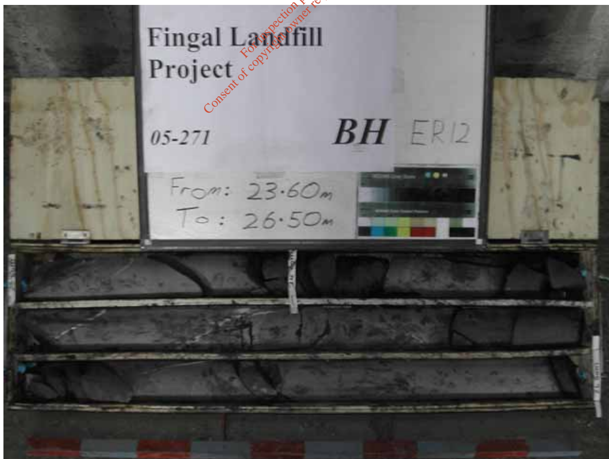
BH ER12: 23.60-26.50m