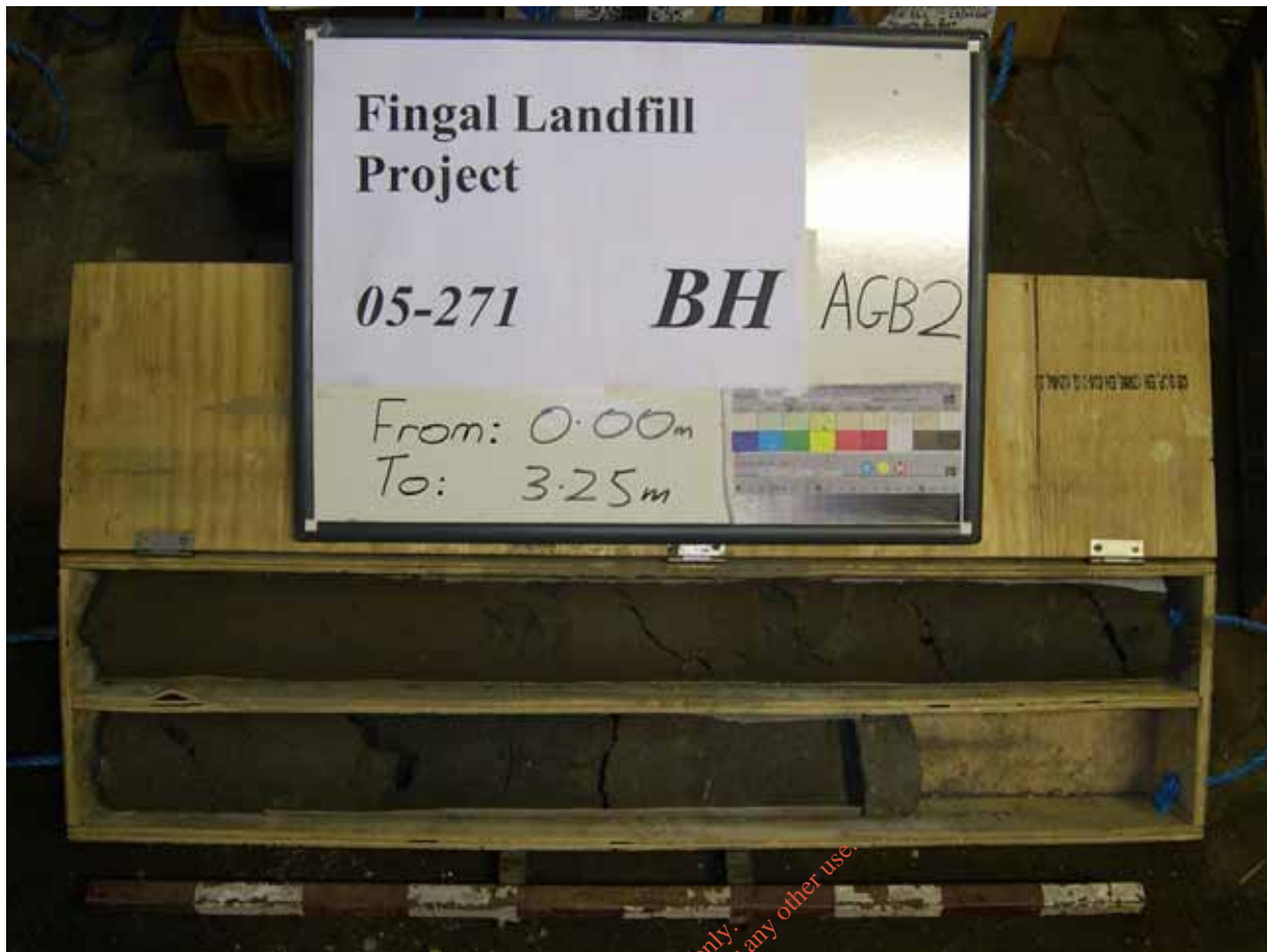
BH AGB2: 0.00-3.25m