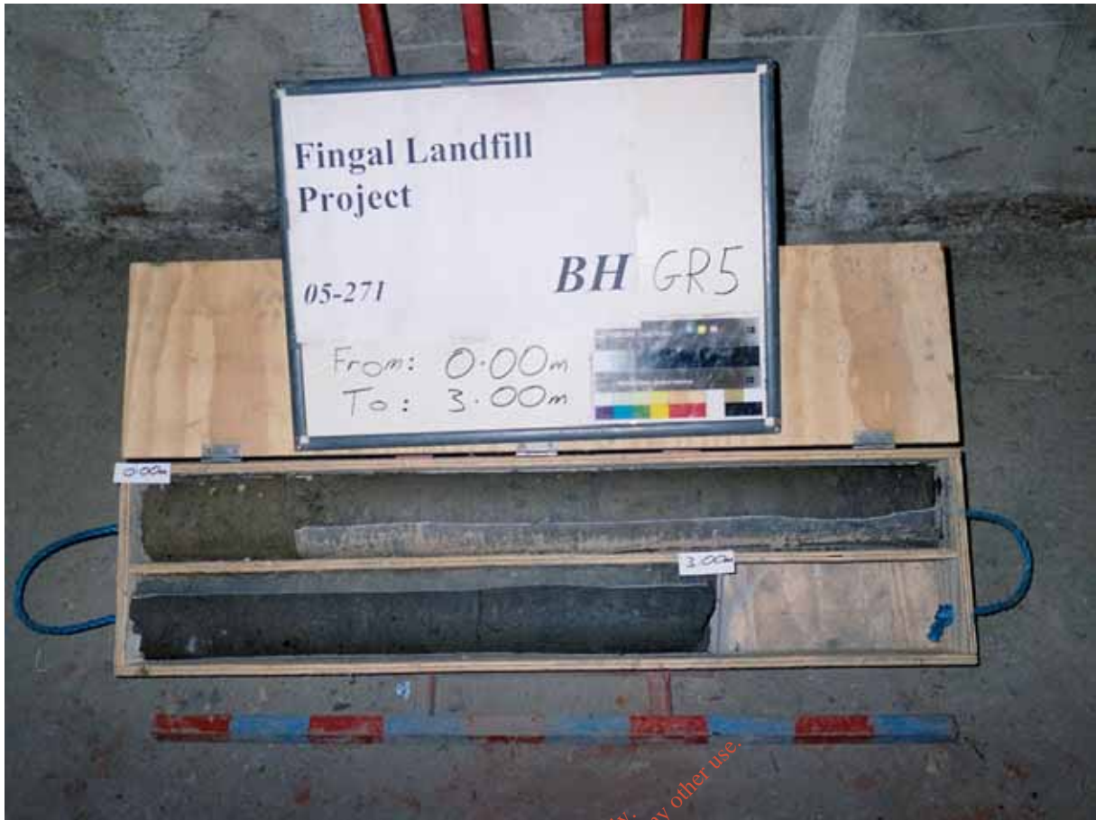
BH GR5: 0.00-3.00m