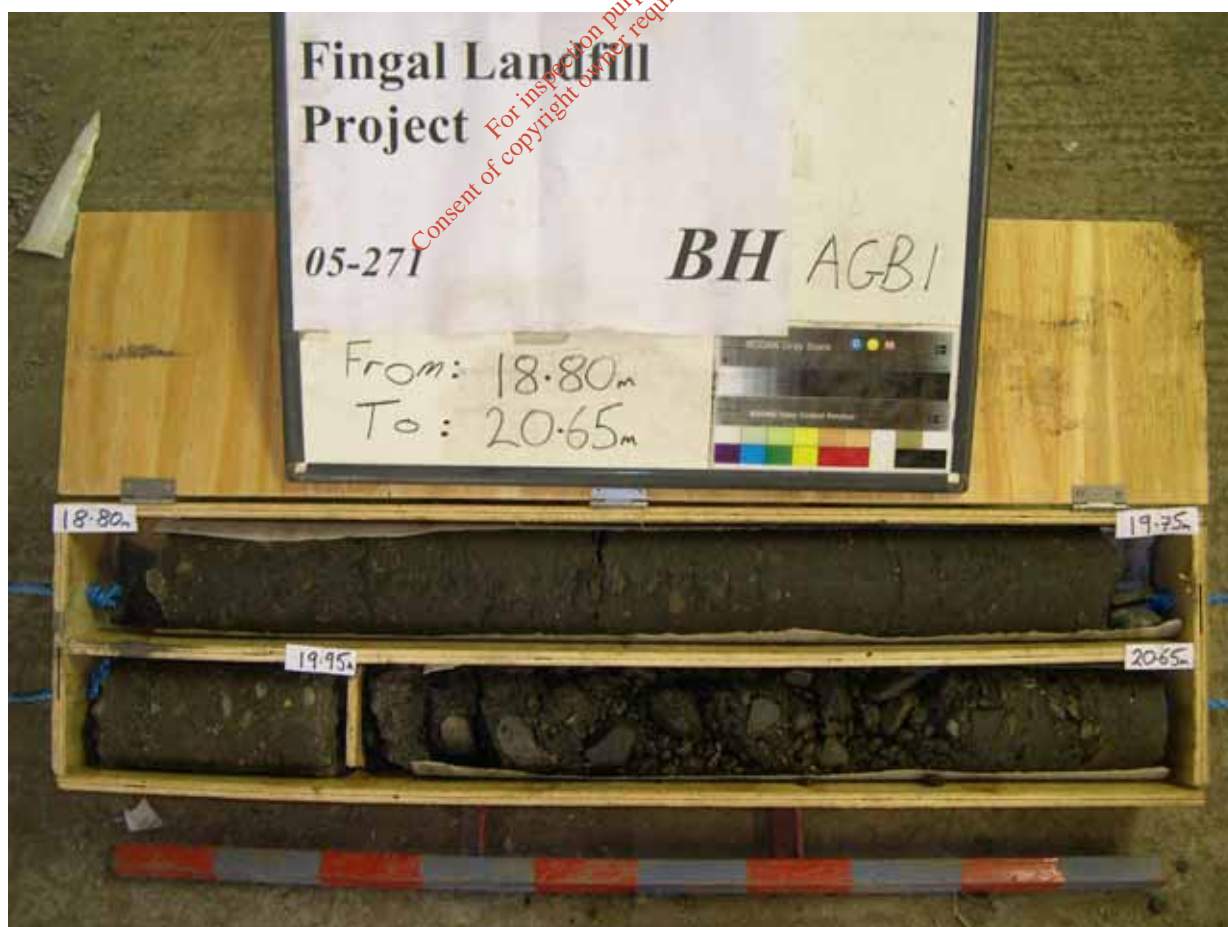
BH AGB1: 18.80-20.65m