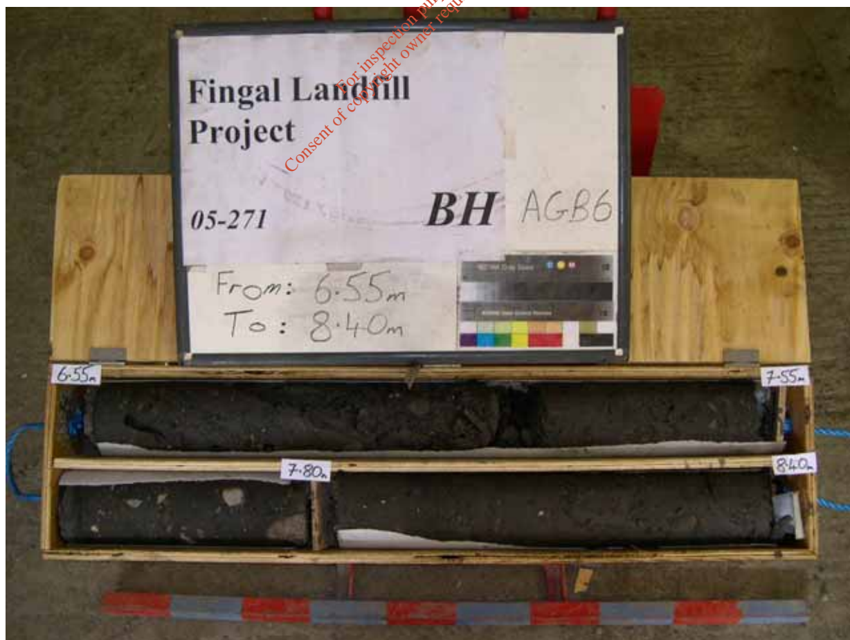
BH AGB6 6.55-8.40m