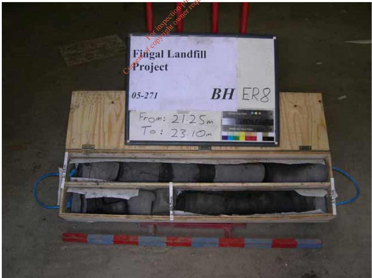
BH ER08: 21.25-23.10m