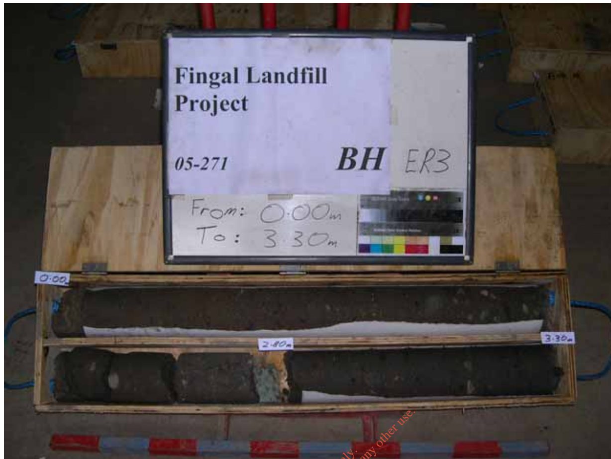
BH ER3: 0.00-3.30m