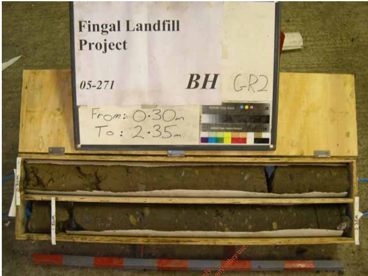
BH GR02: 0.30-2.35m