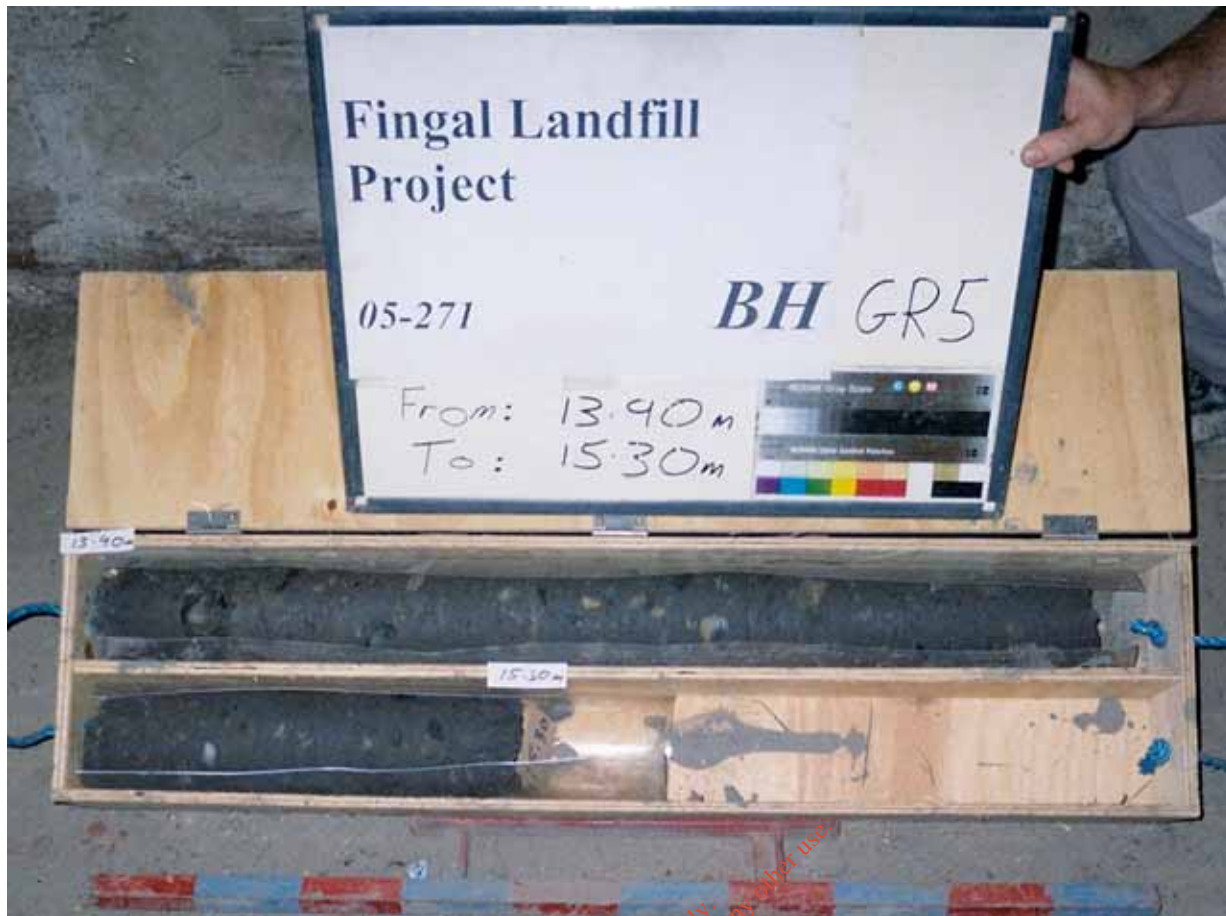
BH GR5: 13.90-15.30m