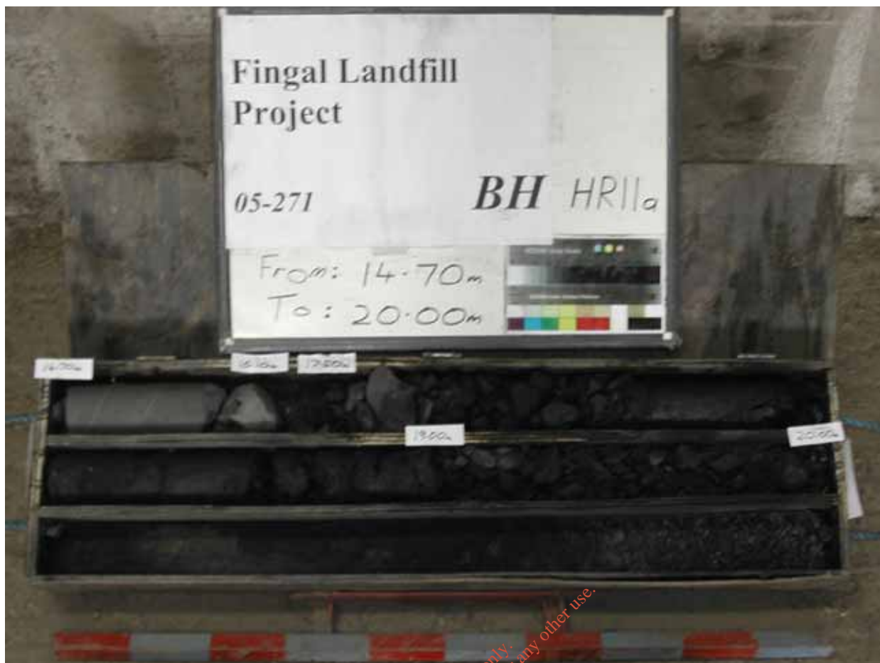
BH HR11a: 14.70-20.00m

For inspection purposes only. Consent of copyright owner required for any other use.