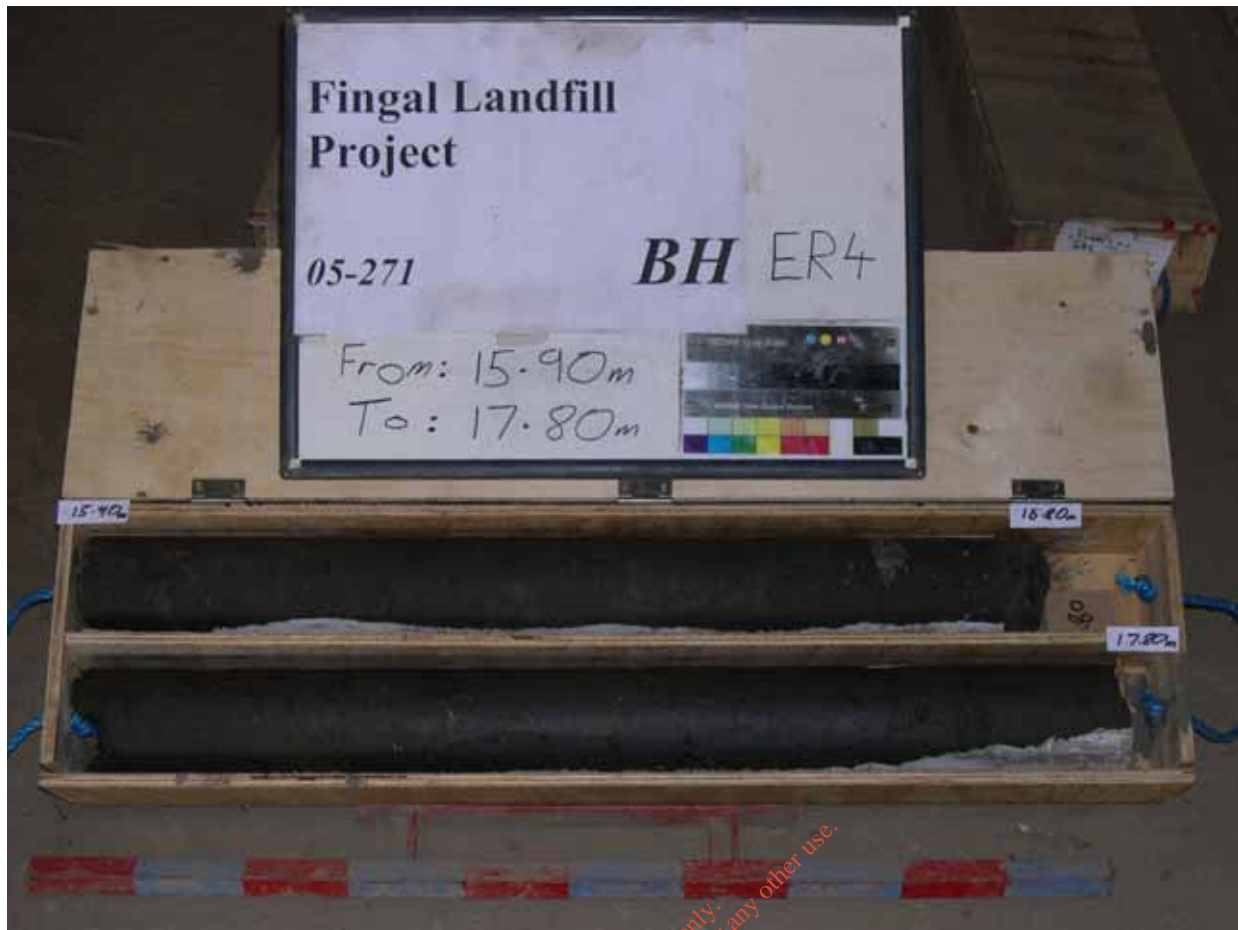
BH ER4: 15.90-17.80m