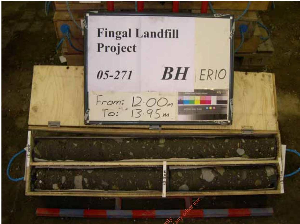
BH ER10: 12.00-13.95m