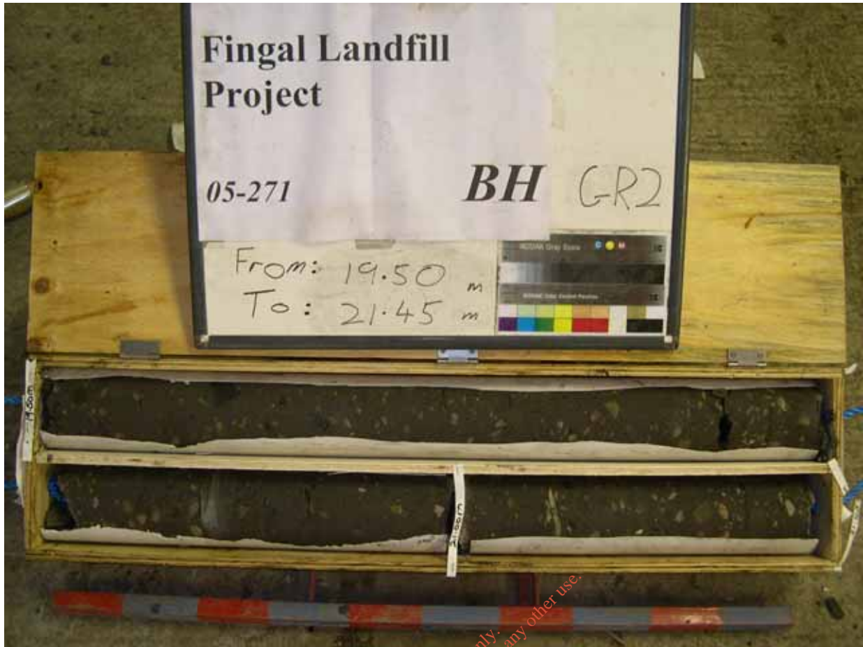
BH GR02: 19.50-21.45m