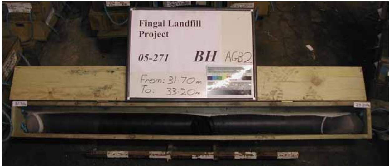
BH AGB2: 31.70-33.20m