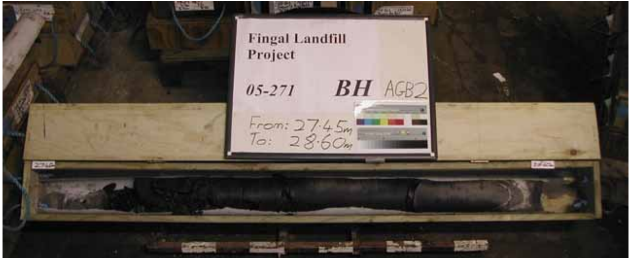
BH AGB2: 27.45-28.60m