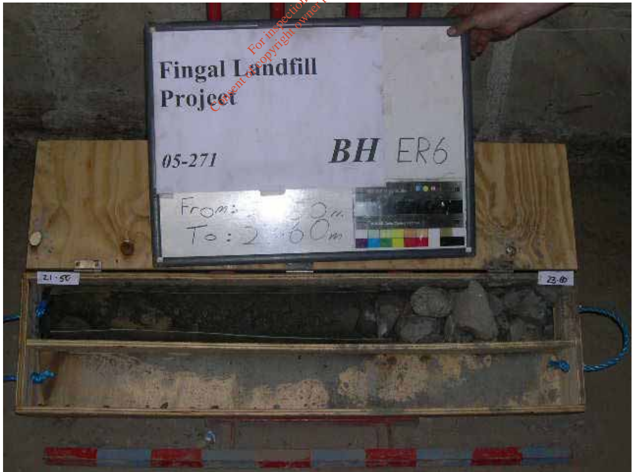
BH ER6: 21.50-23.60m