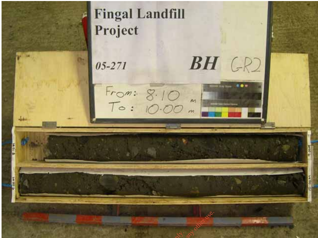
BH GR02: 8.10-10.00m