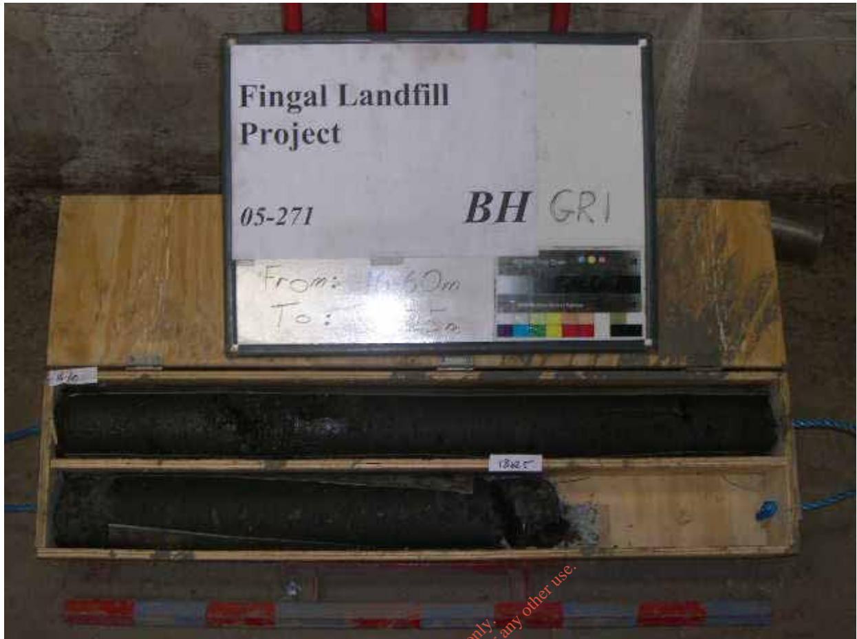
BH GR1: 16.60-18.25m