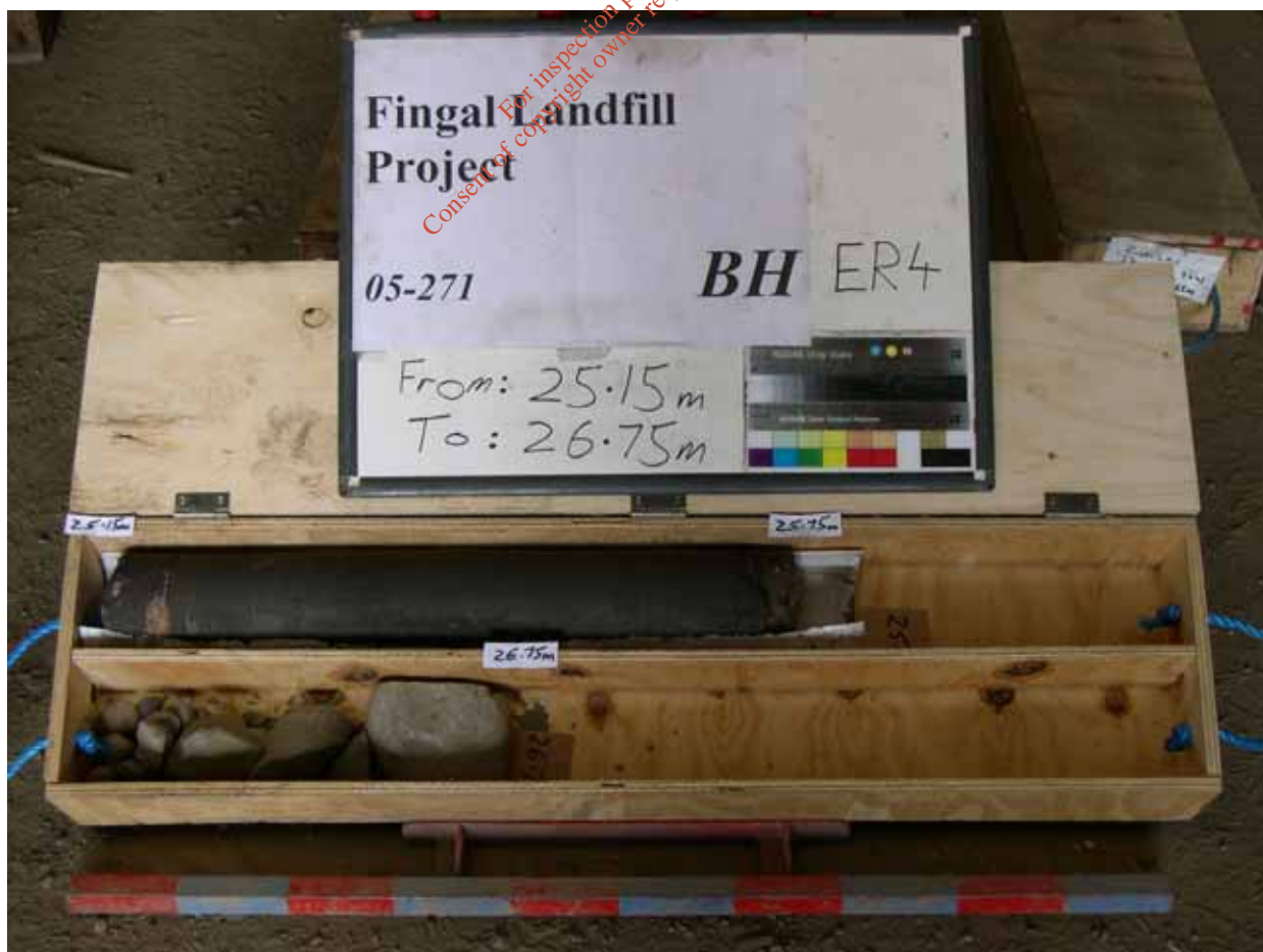
BH ER4: 25.15-26.75m