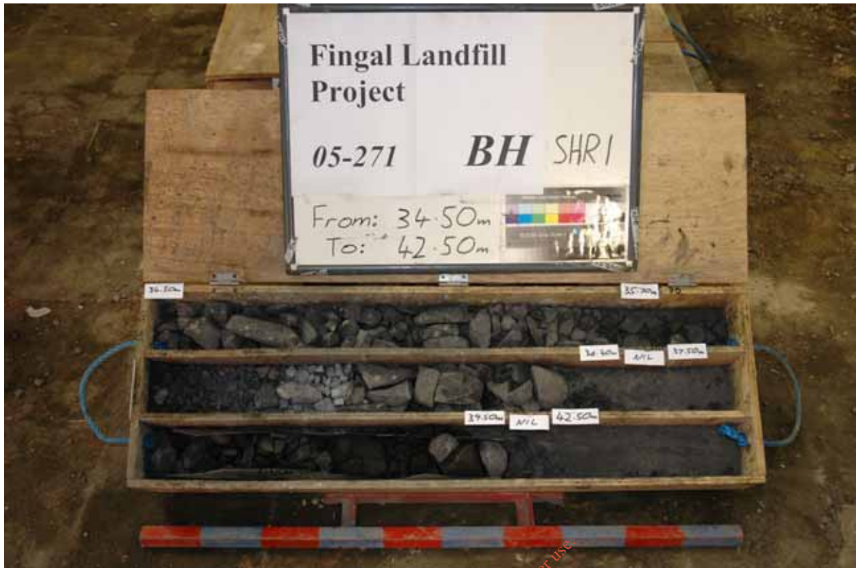
BH SHR1: 34.50-42.50m