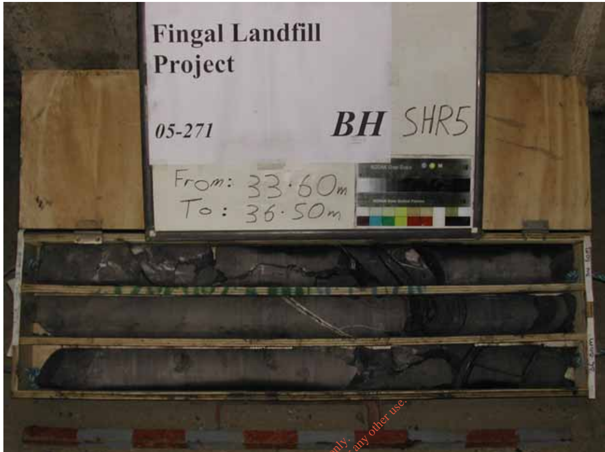
BH SHR5: 33.60-36.50m