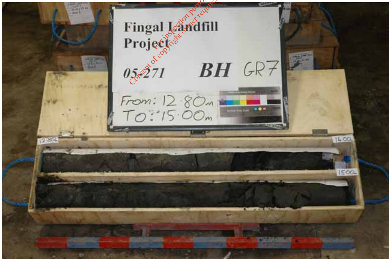
BH GR7: 12.80-15.00m