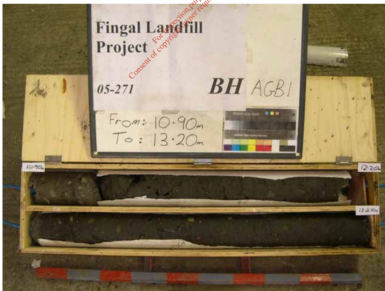
BH AGB1: 10.90-13.20m