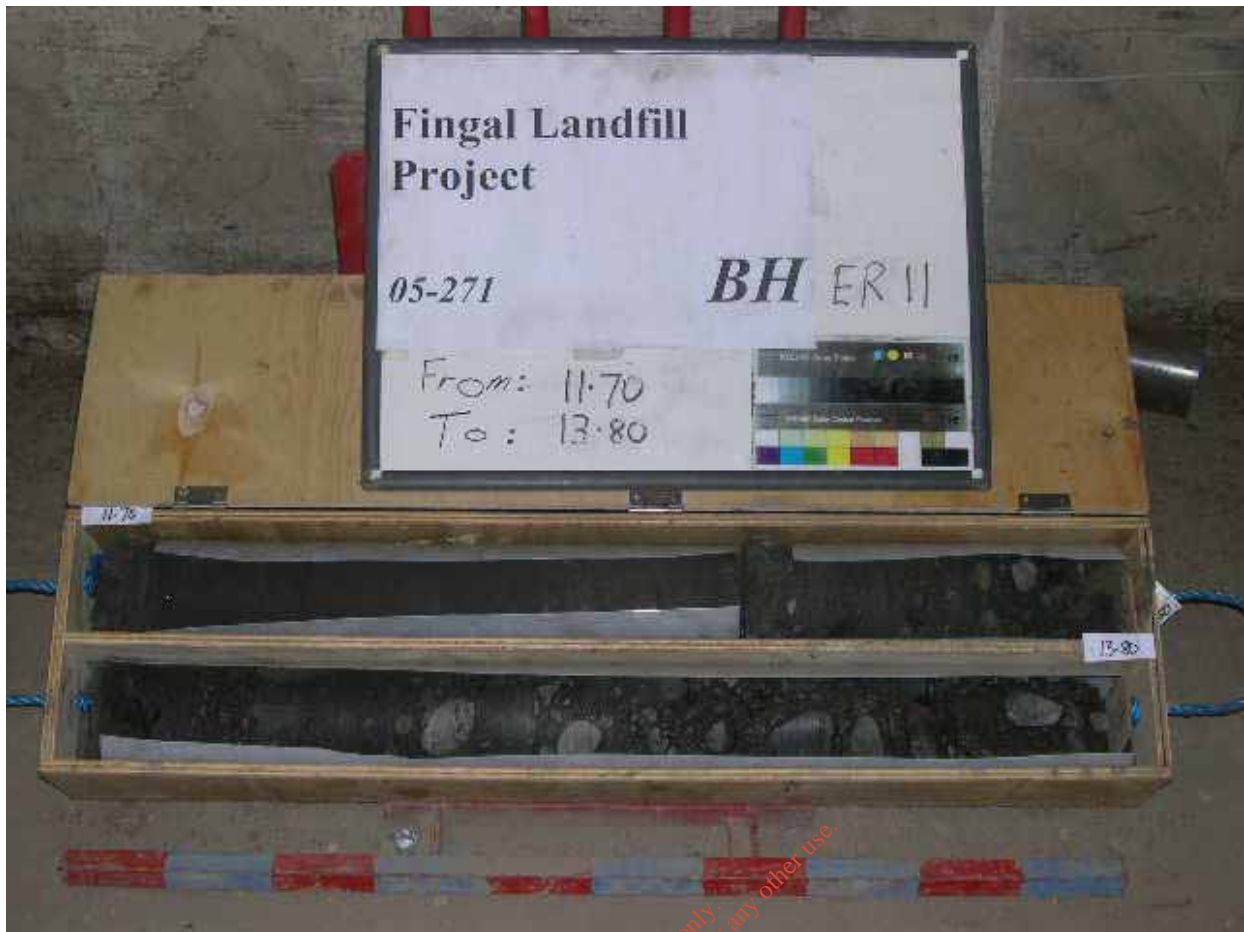
BH ER11: 11.70-13.80m

For inspection purposes only. Consent of copyright owner required for any other use.