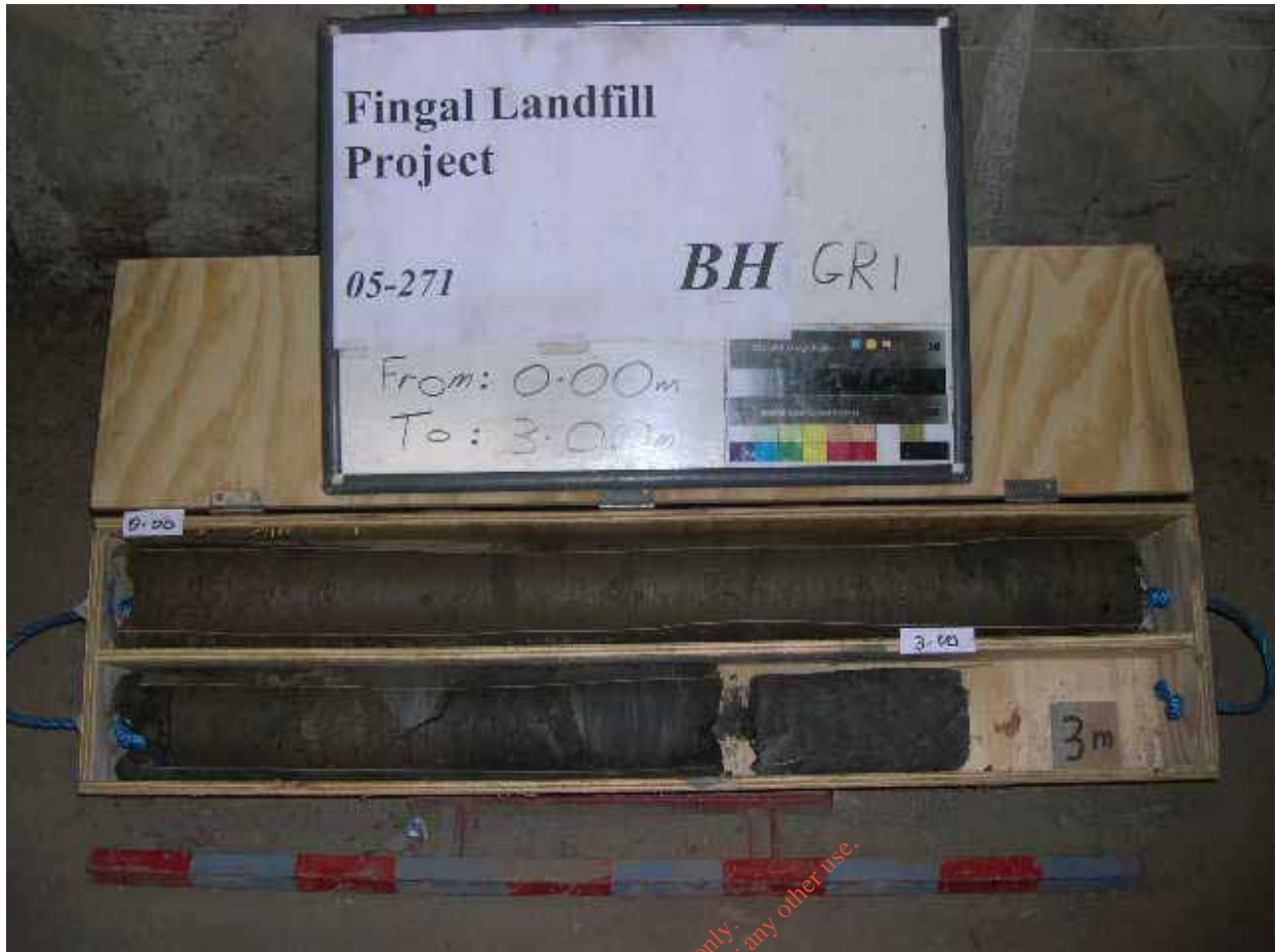
BH GR1: 0.00-3.00m