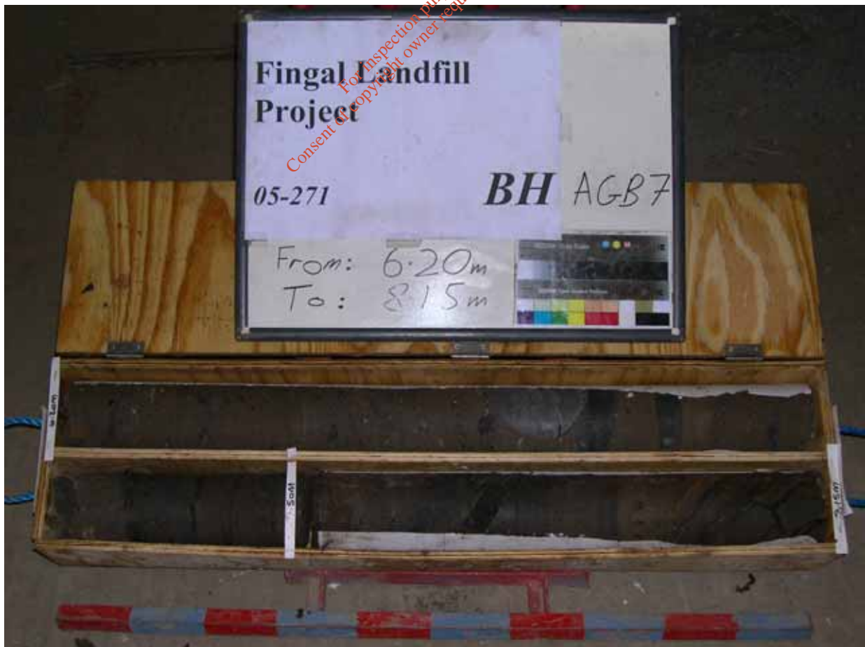
BH AGB7: 6.20-8.15m