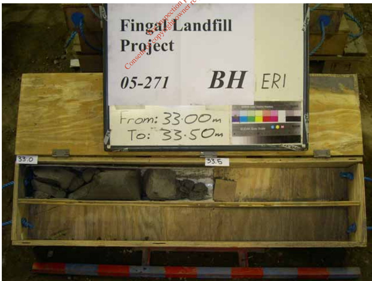
BH ER1: 33.00-33.50m