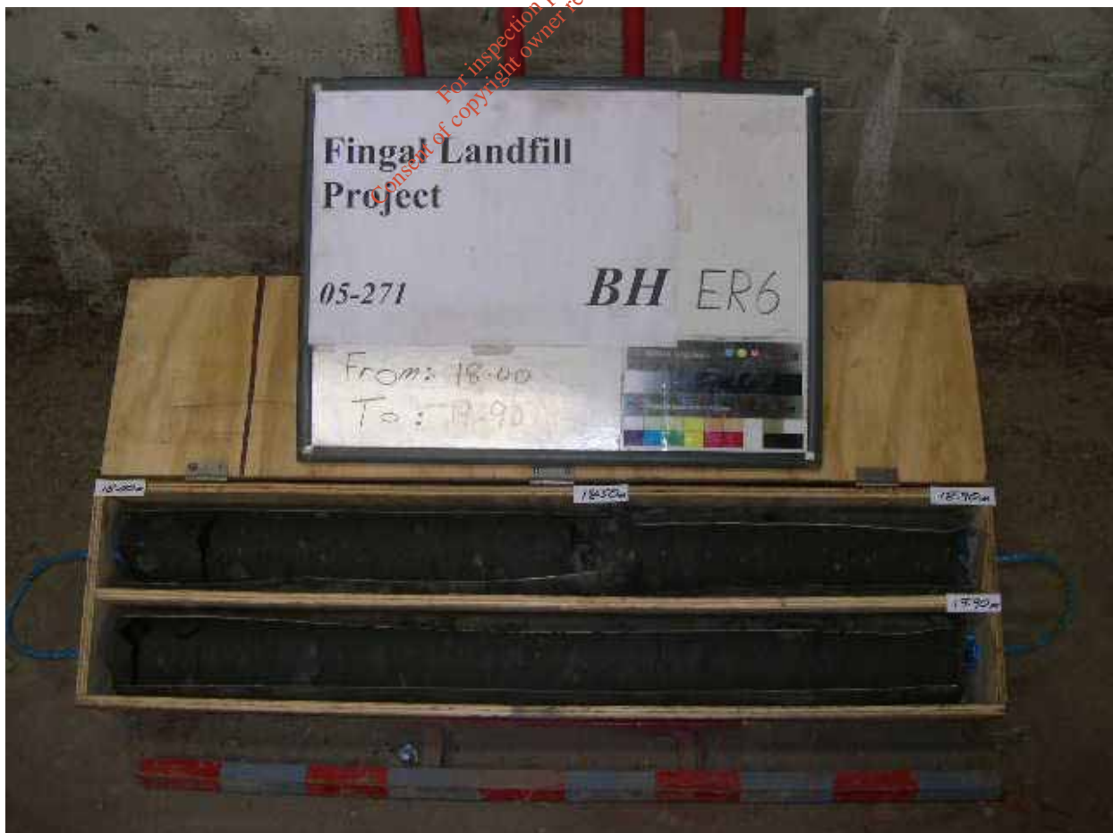
BH ER6: 18.00-19.90m