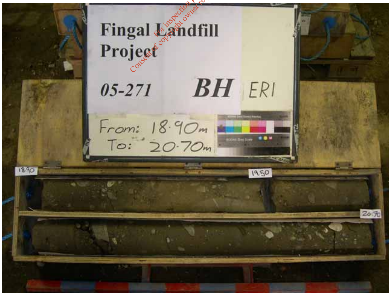
BH ER1: 18.90-20.70m