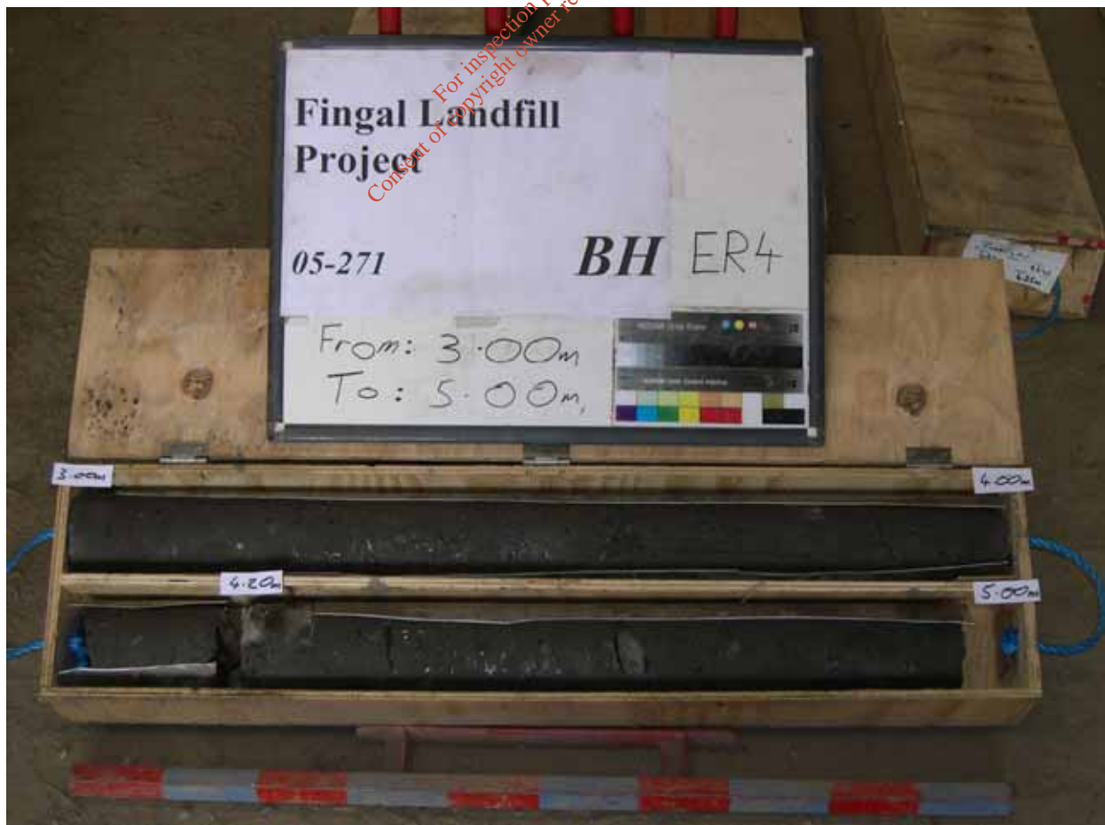
BH ER4: 3.00-5.00m