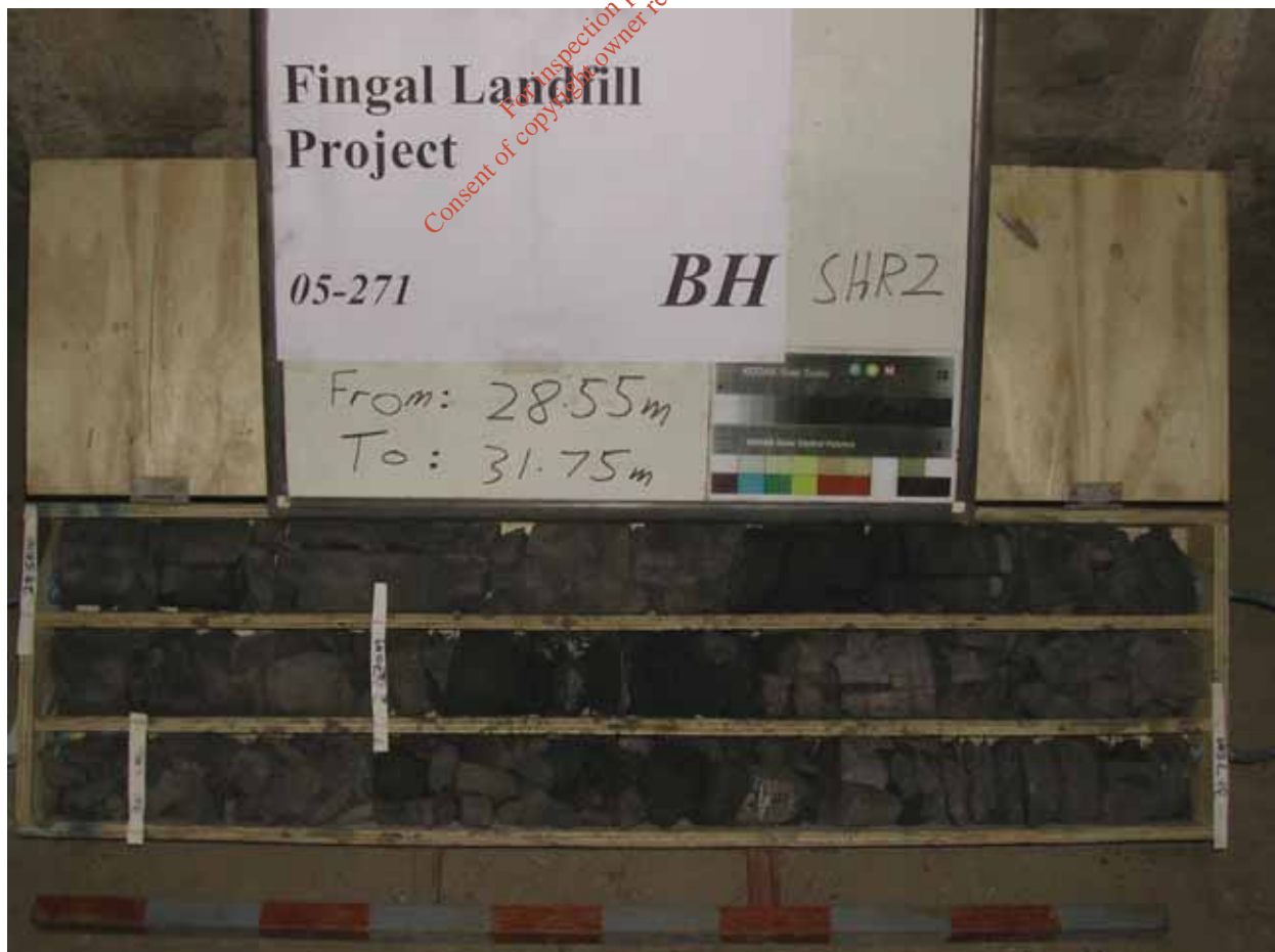
BH SHR2: 28.55-31.75m