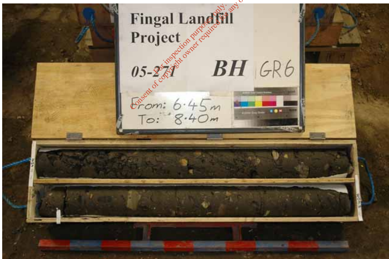
BH GR6: 6.45-8.40m