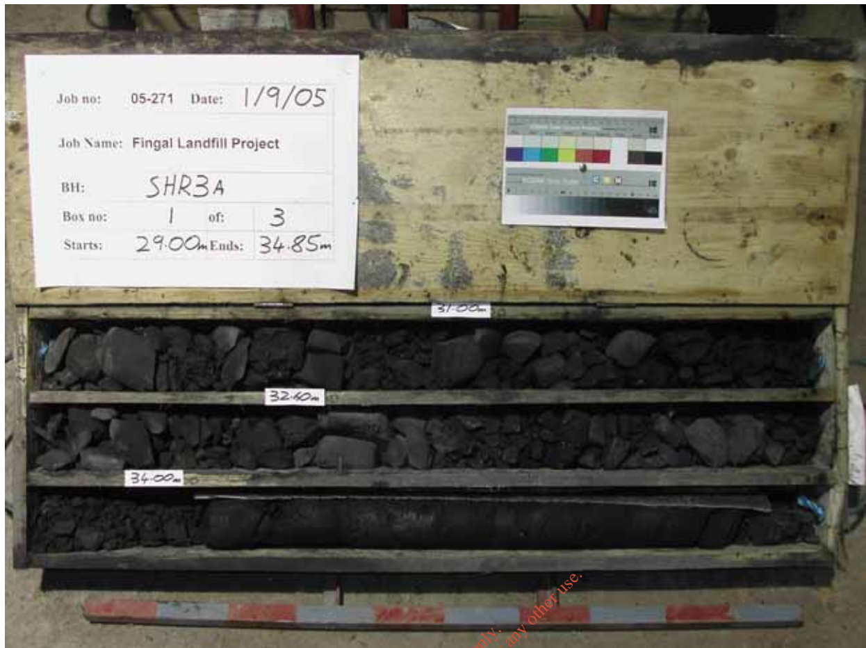
BH SHR3a: 29.00-34.85m