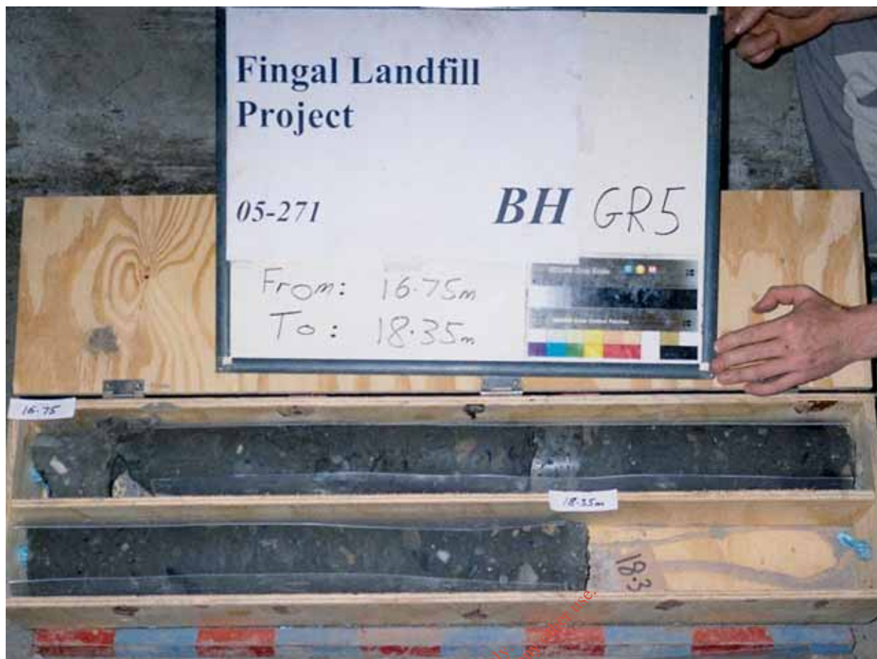
BH GR5: 16.75-18.35m