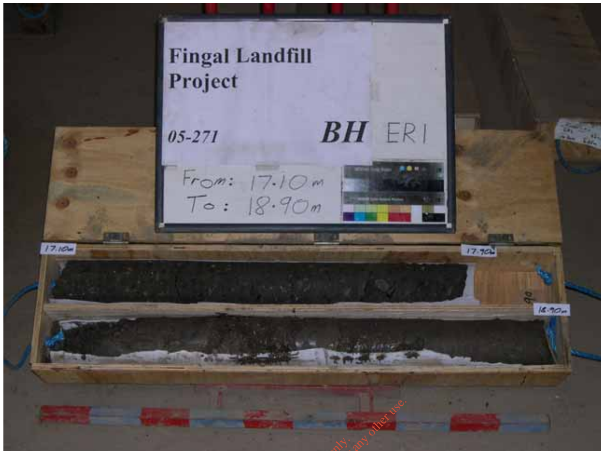
BH ER1: 17.10-18.90m