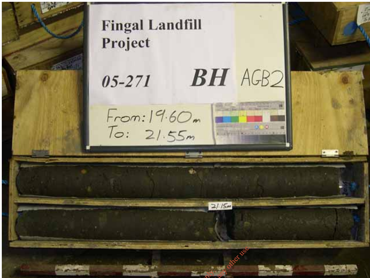
BH AGB2: 19.60-21.55m