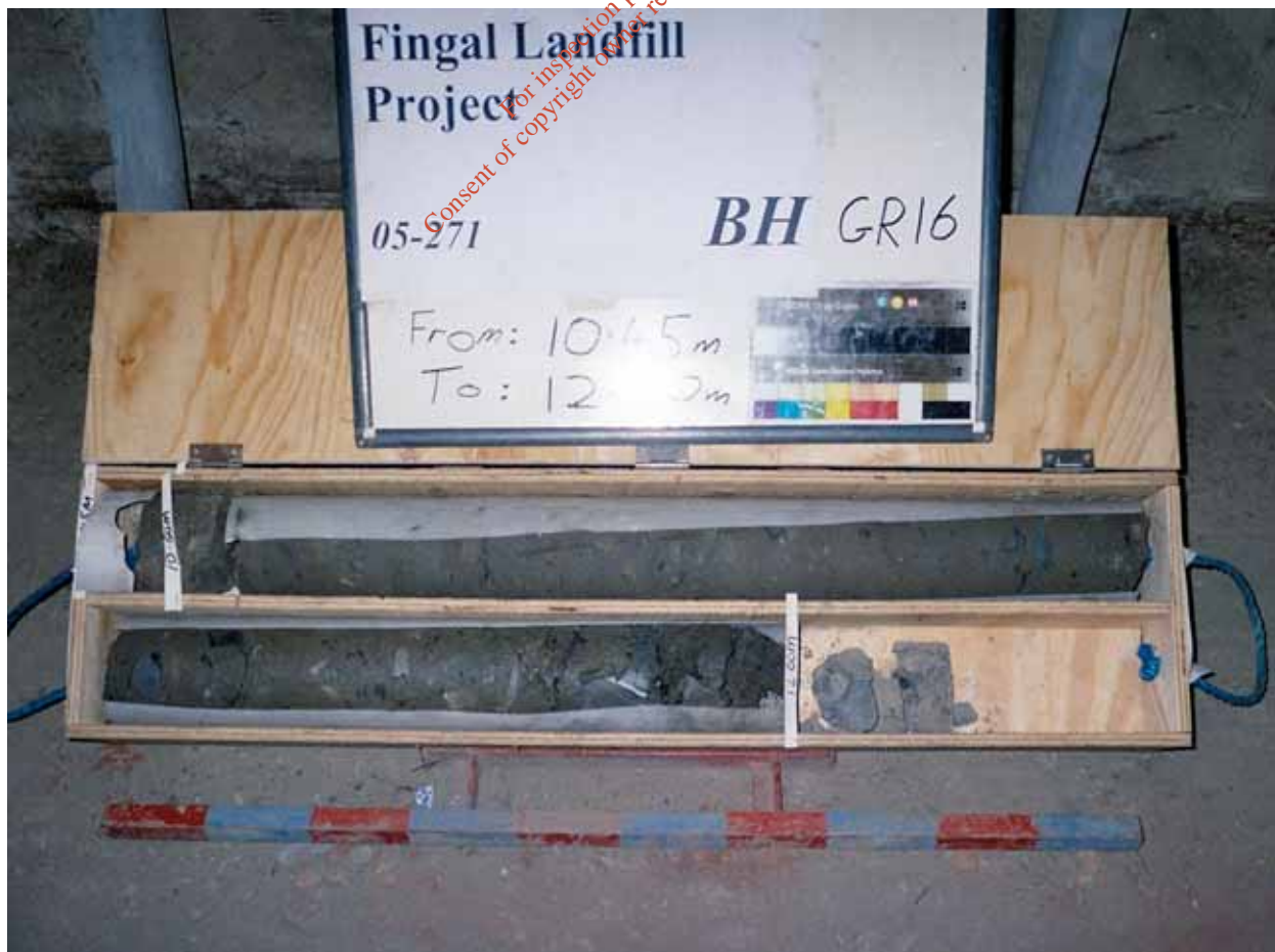
BH GR16: 10.45-12.00m