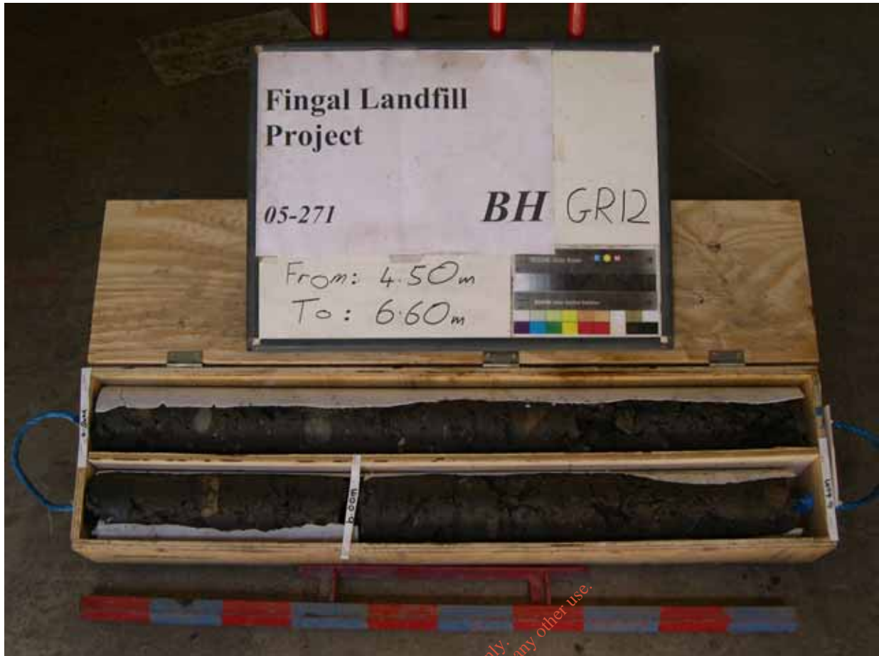
BH GR12: 4.50-6.60m