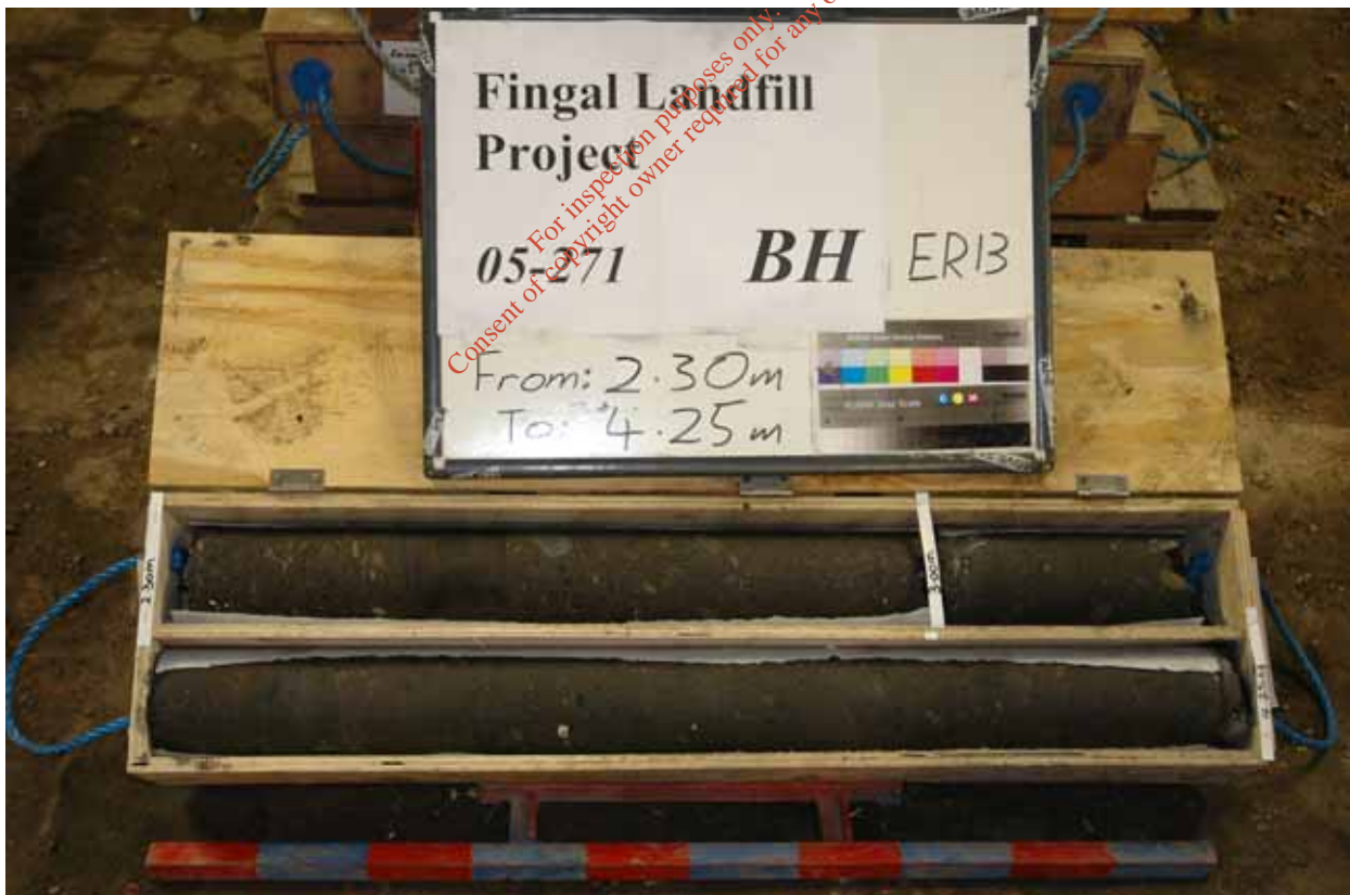
BH ER13: 2.30-4.25m