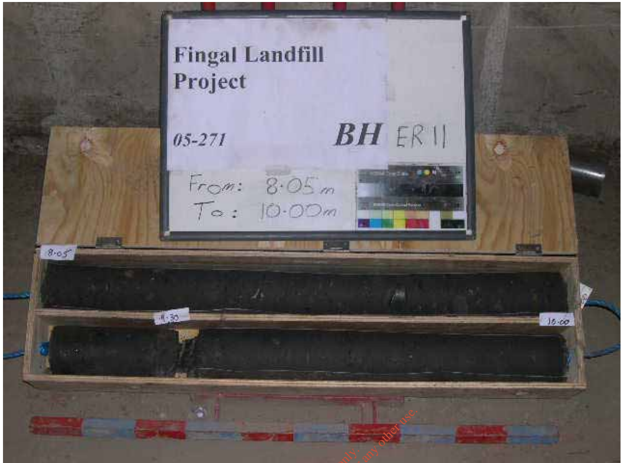
BH ER11: 8.05-10.00m