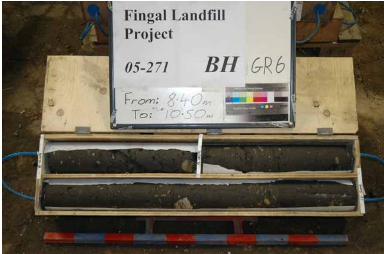
BH GR6: 8.40-10.50m