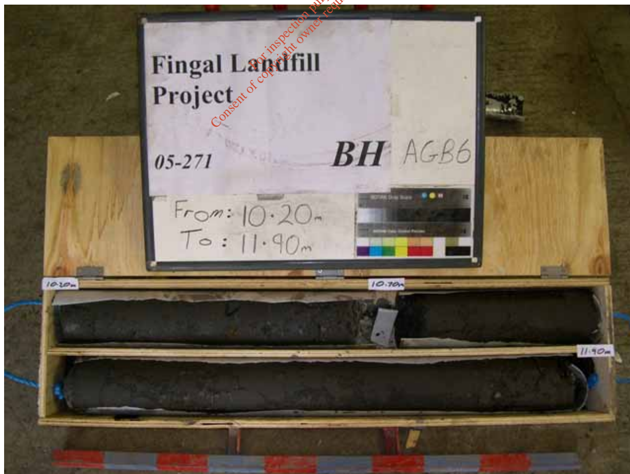
BH AGB6 10.20-11.90m