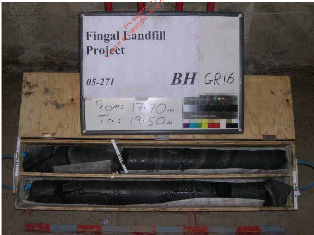
BH GR16: 17.70-19.50m