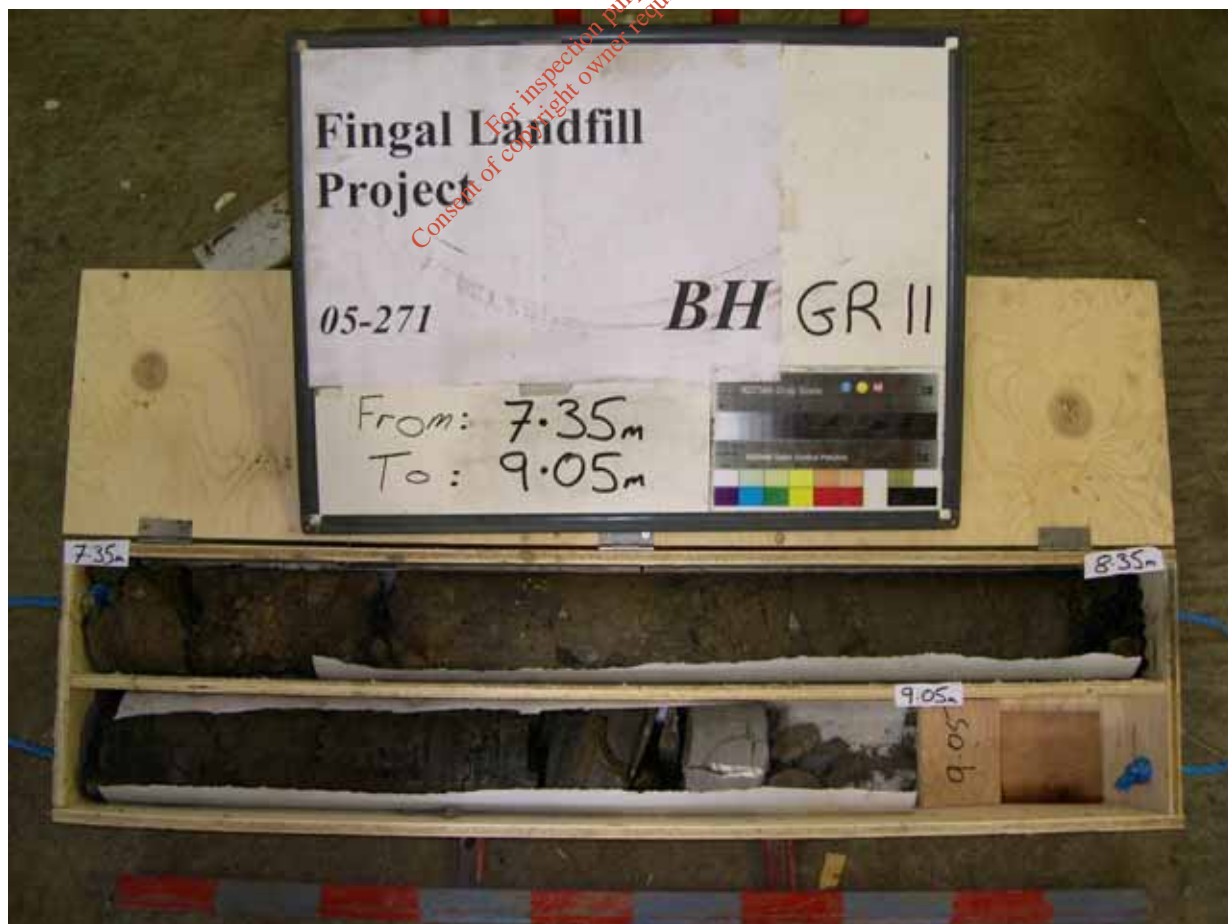
BH GR11: 7.35-9.05m