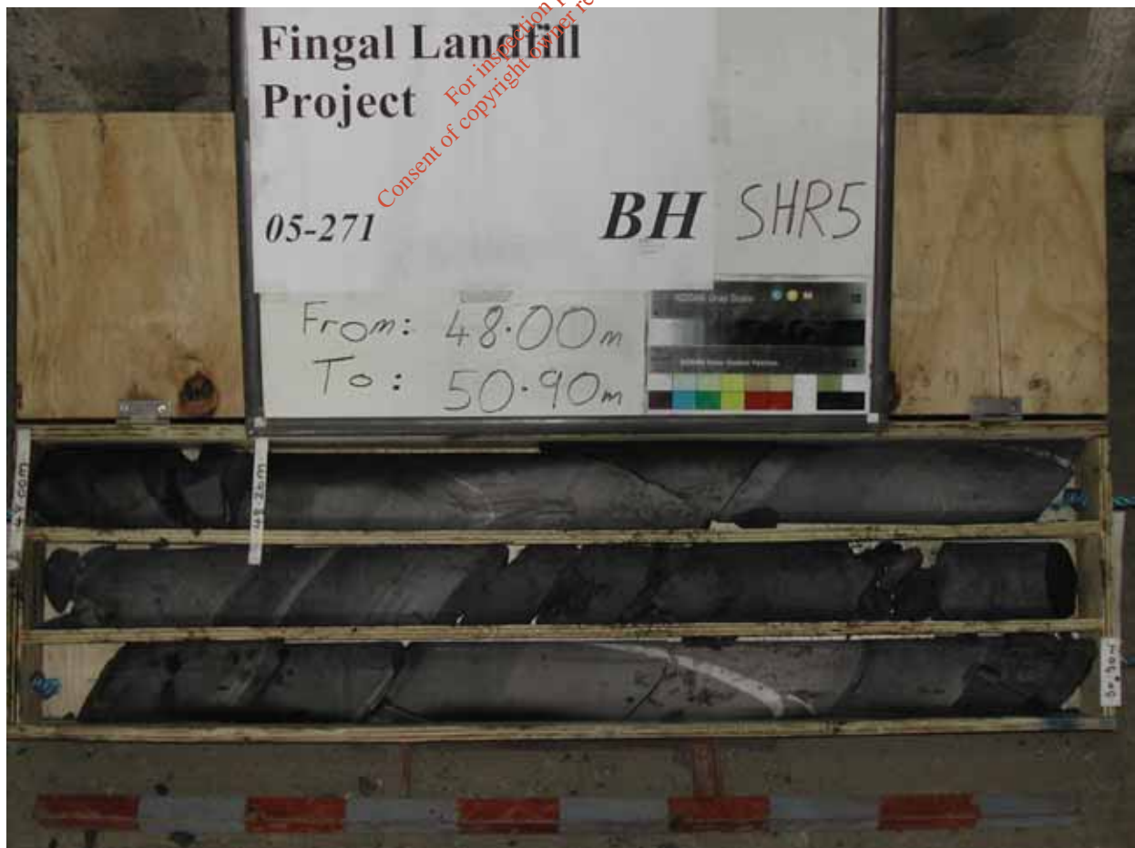
BH SHR5: 48.00-50.90m