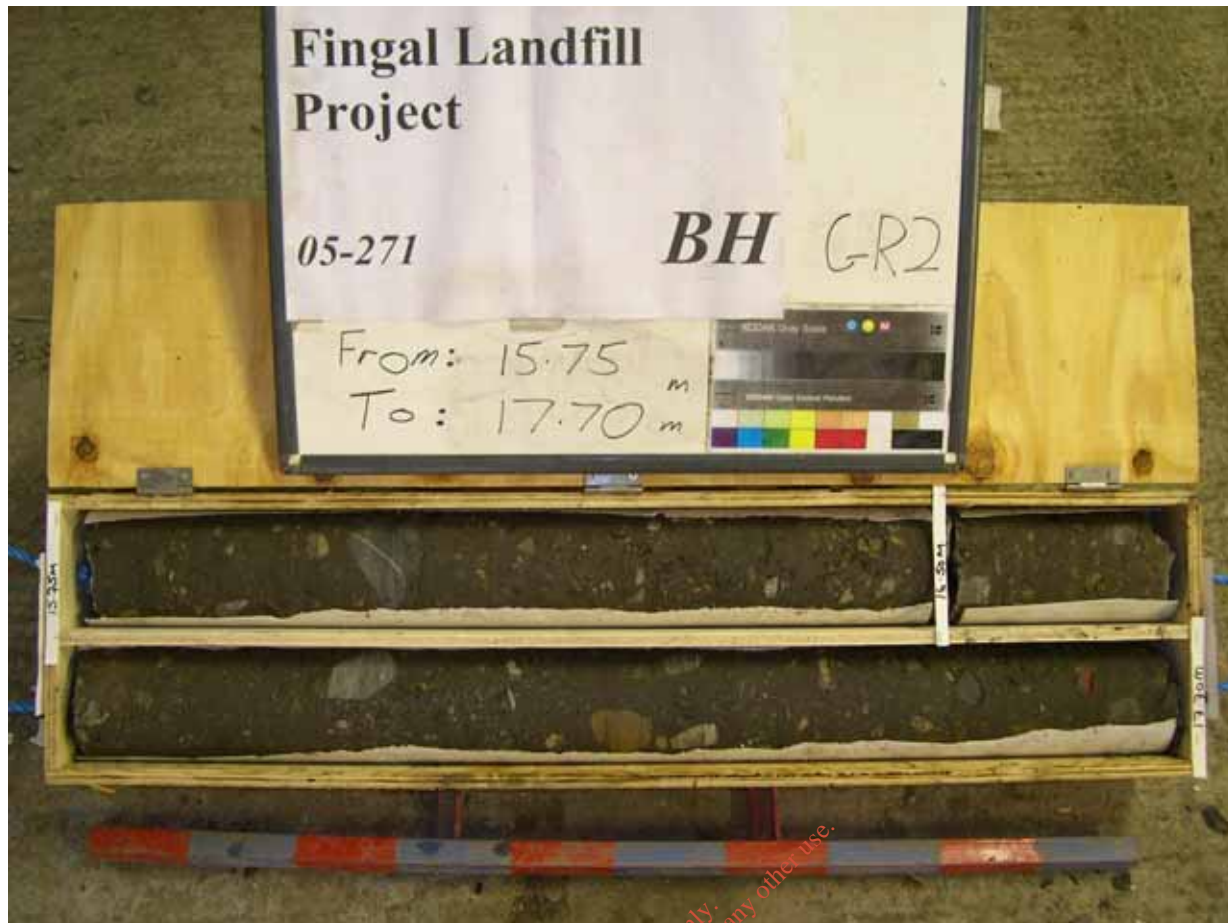
BH GR02: 15.75-17.70m