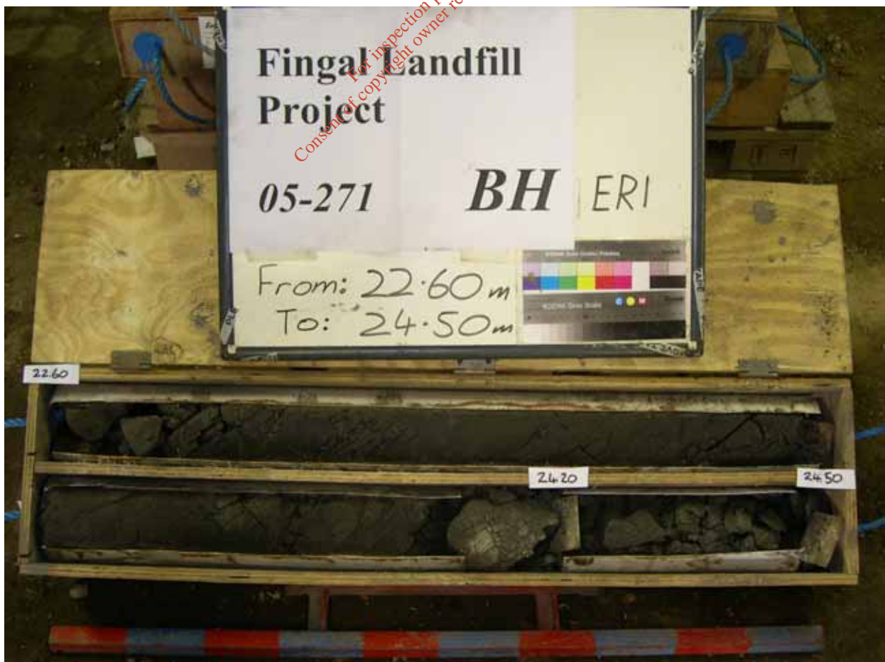
BH ER1: 22.60-24.50m