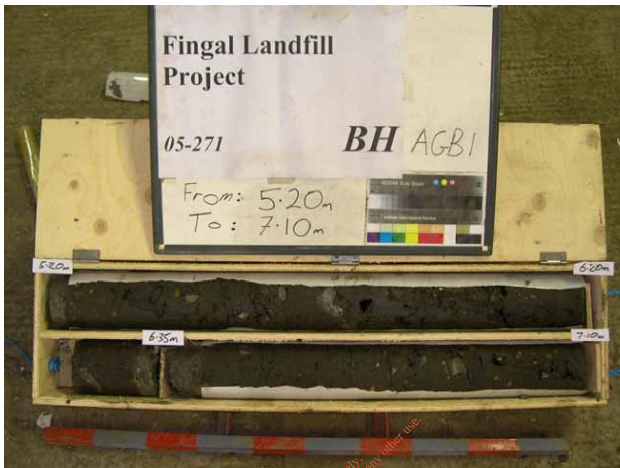
BH AGB1: 5.20-7.10m