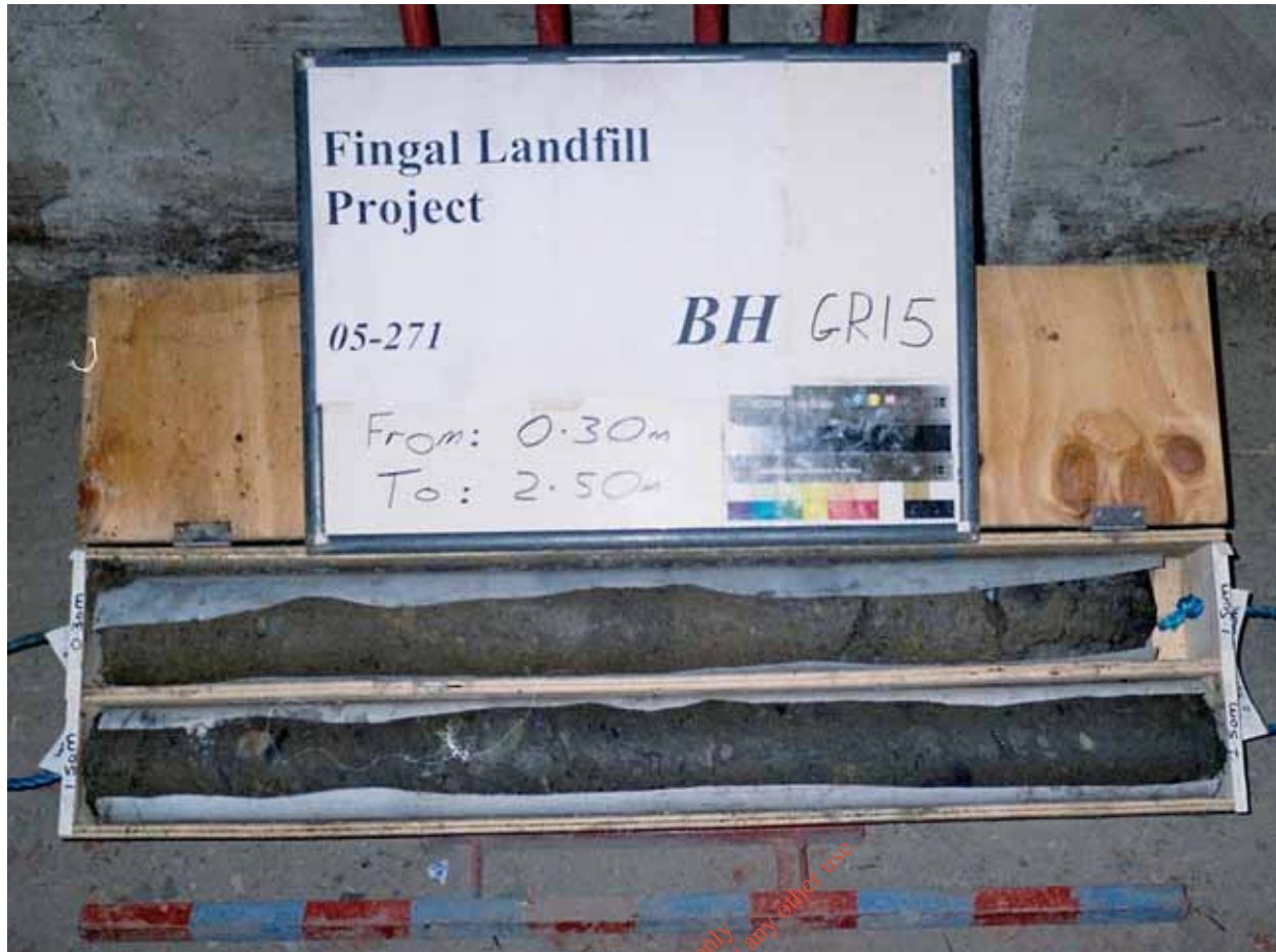
BH GR15: 0.30-2.50m