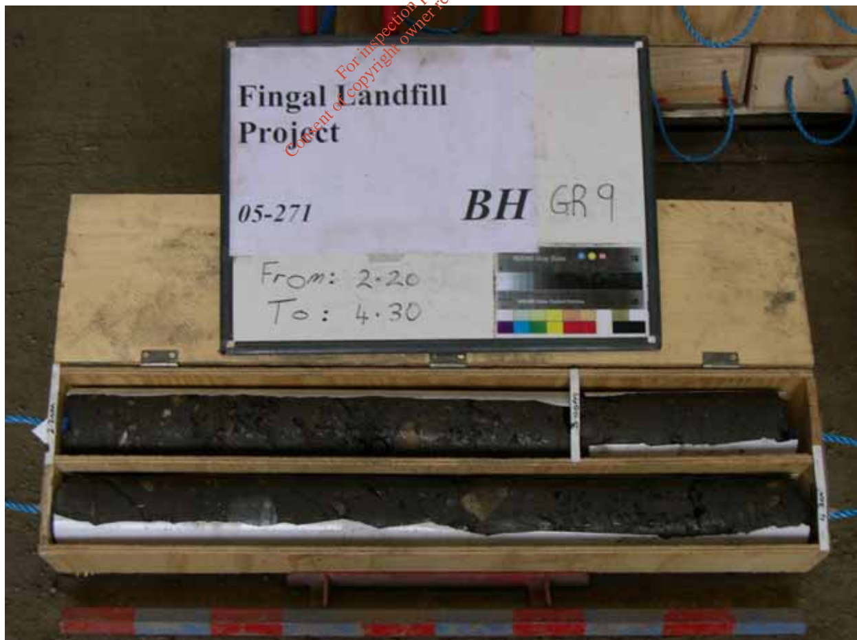
BH GR9: 2.20-4.30m