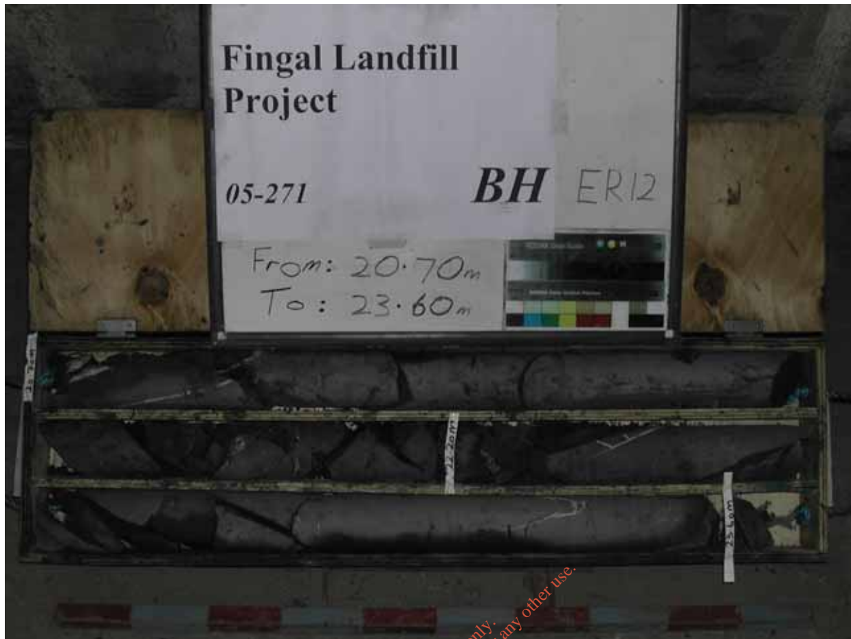
BH ER12: 20.70-23.60m