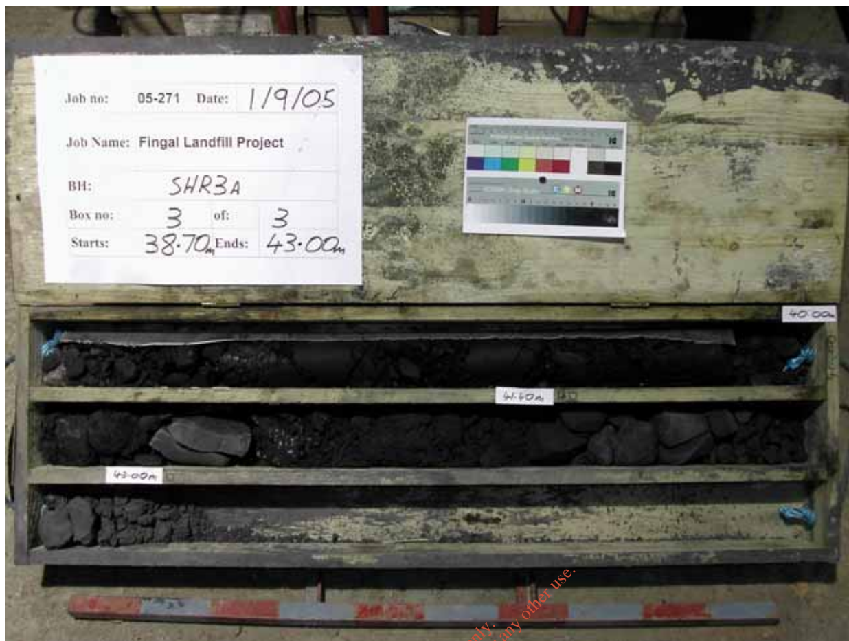
BH SHR3a: 38.70-43.00m

For inspection purposes only. Consent of copyright owner required for any other use.