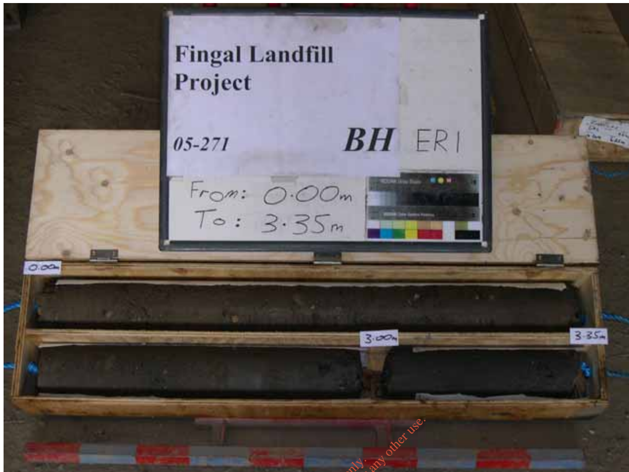
BH ER1: 0.00-3.35m