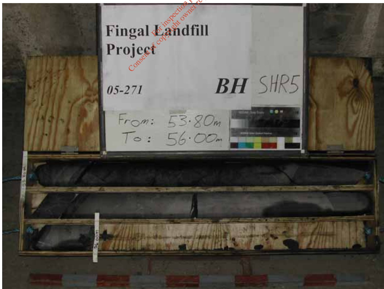
BH SHR5: 53.80-56.00m