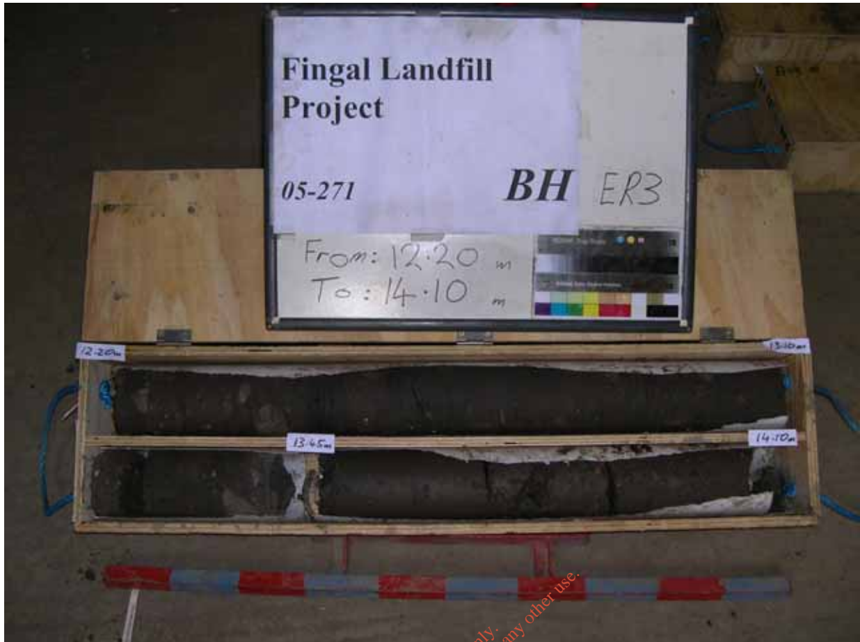
BH ER3: 12.20-14.10m