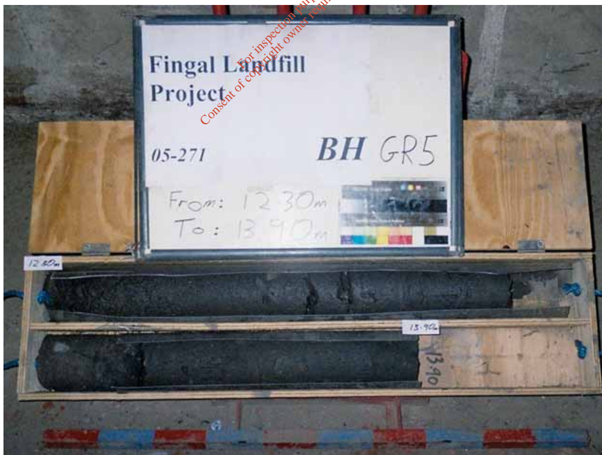
BH GR5: 12.30-13.90m