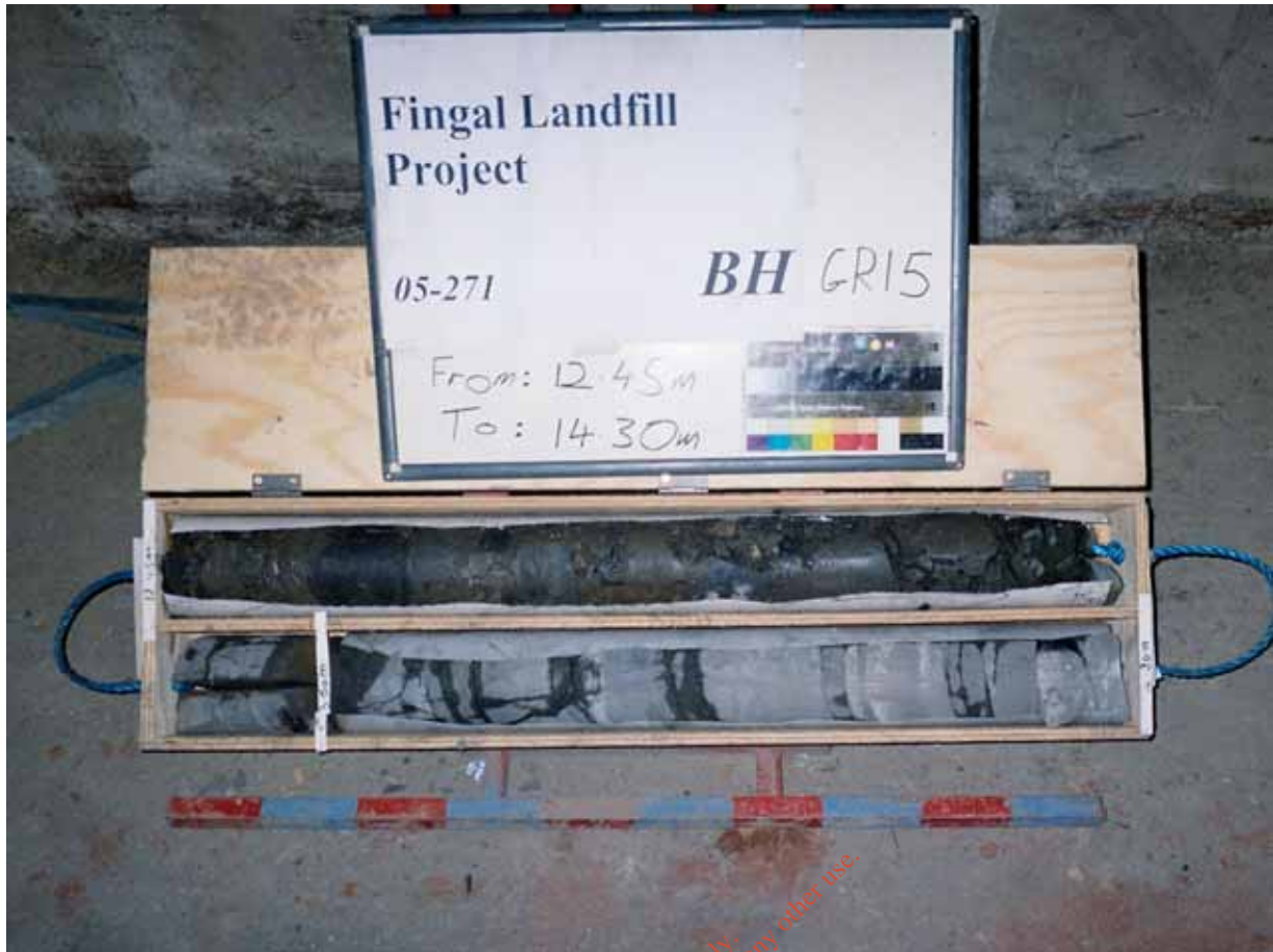
BH GR15: 12.45-14.30m