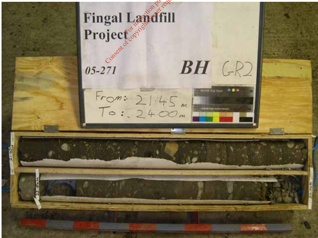
BH GR02: 21.45-24.00m