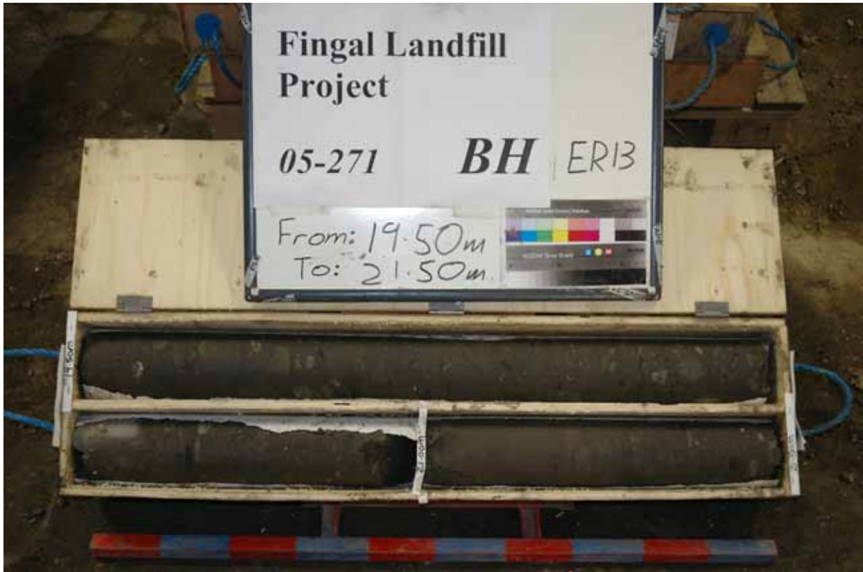
BH ER13: 19.50-21.50m