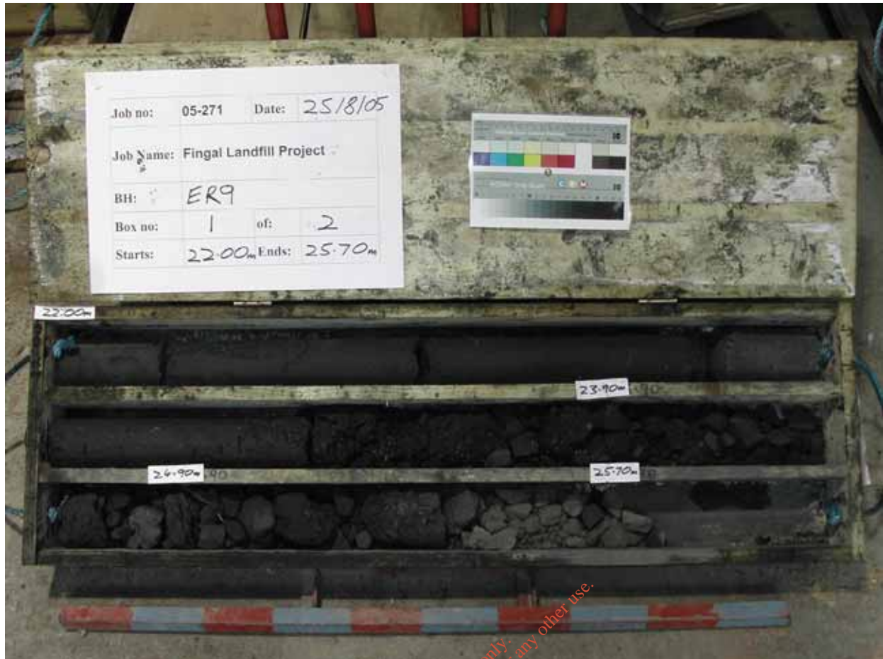
BH ER9: 22.00-25.70m