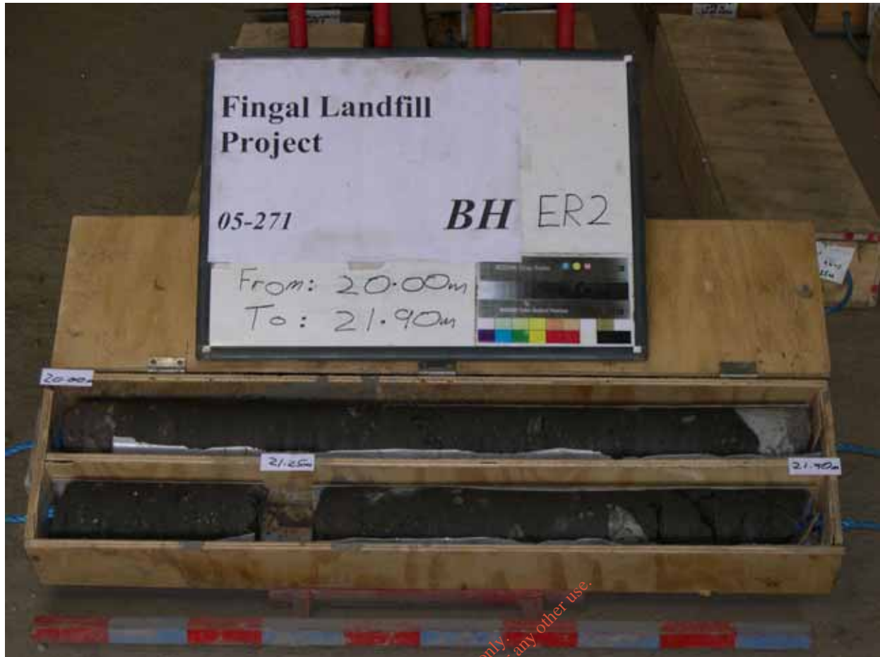
BH ER2: 20.00-21.90m