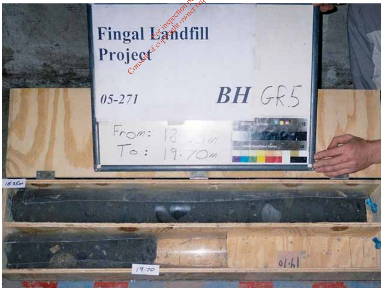
BH GR5: 18.35-19.70m