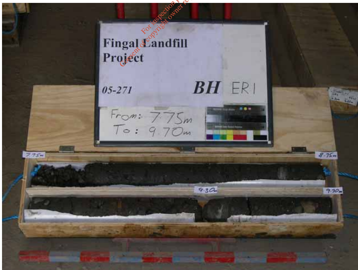
BH ER1: 7.75-9.70m