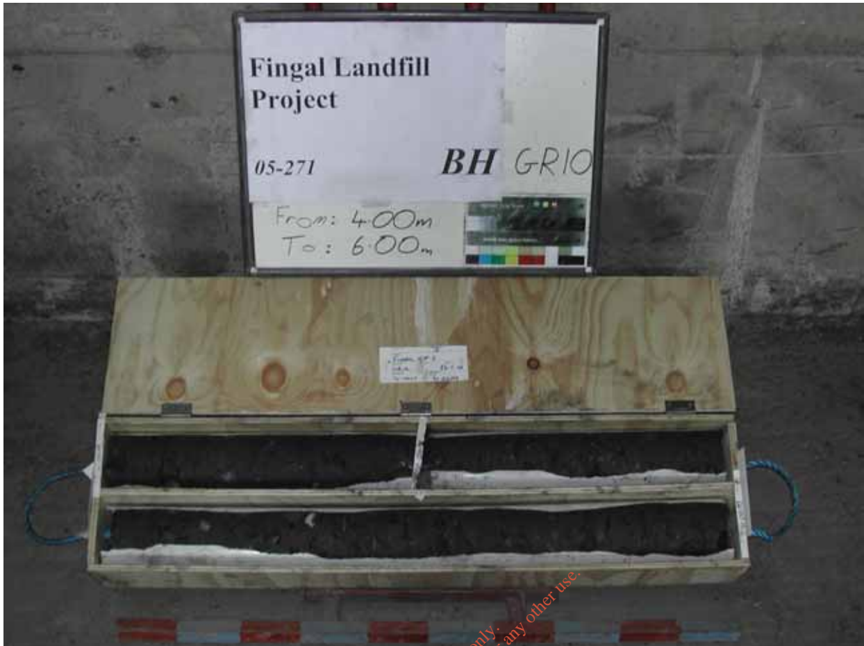
BH GR10: 4.00-6.00m