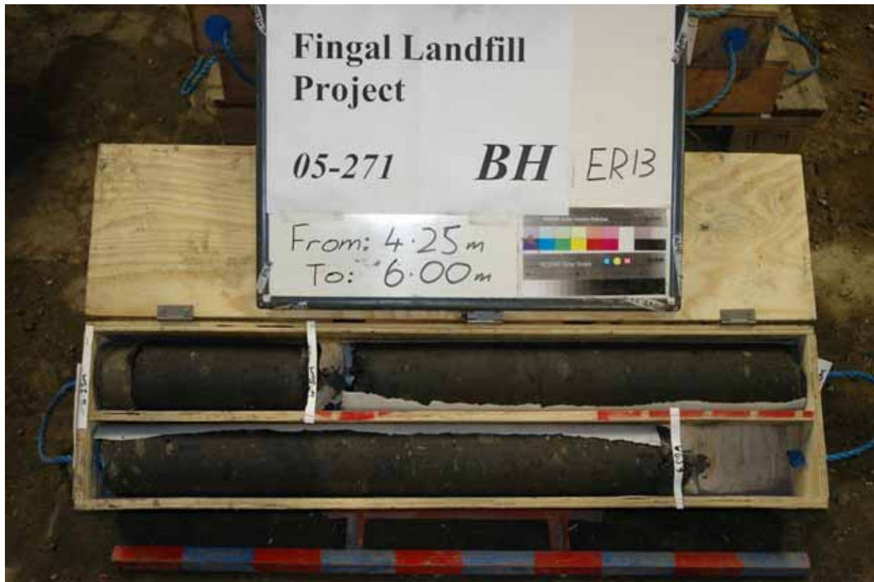
BH ER13: 4.25-6.00m