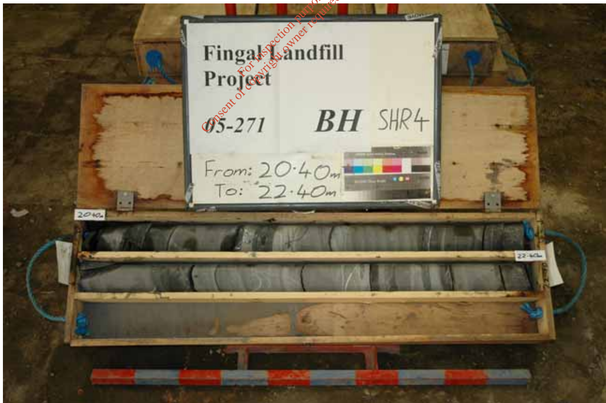
BH SHR4: 20.40-22.40m