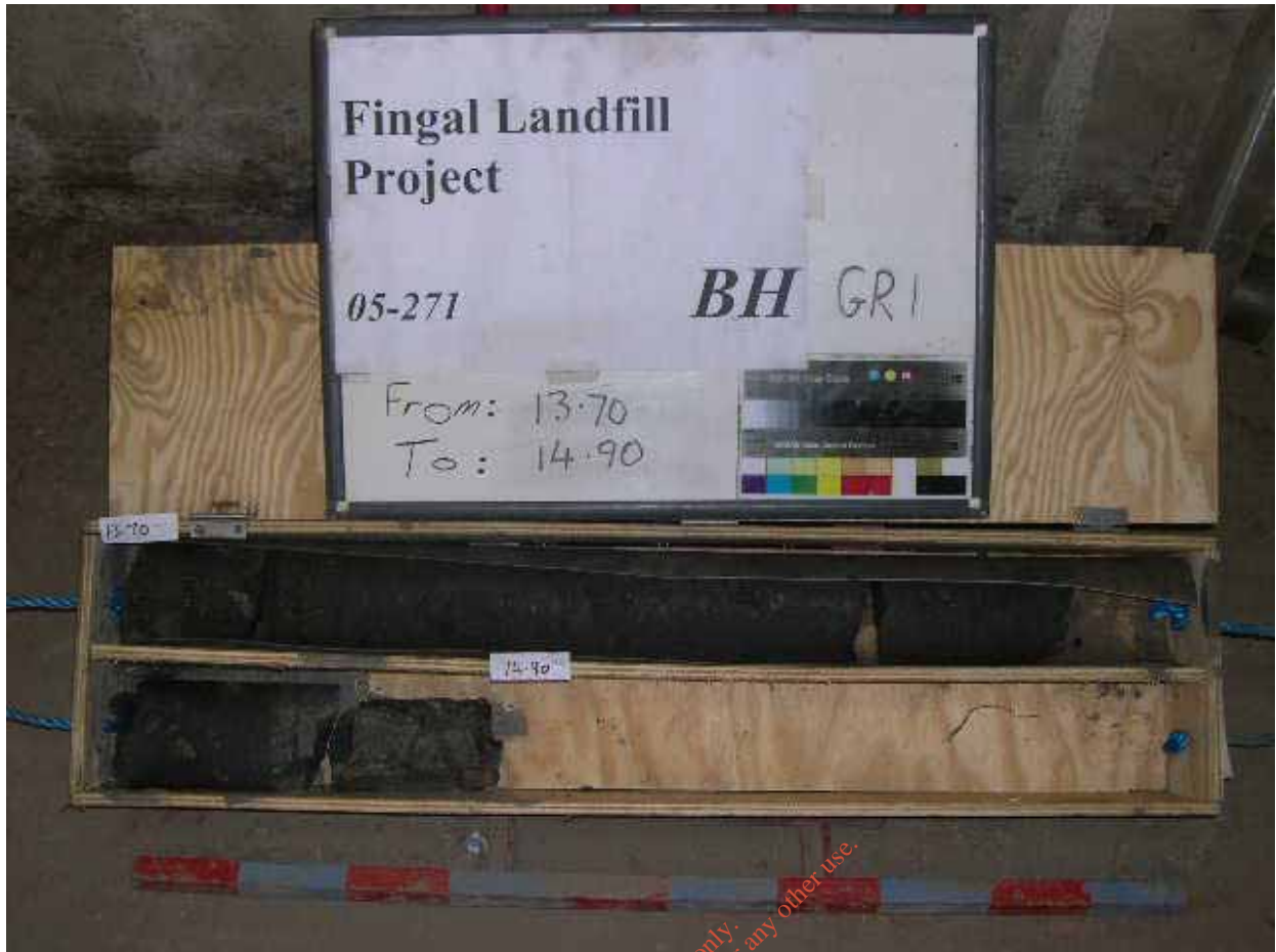
BH GR1: 13.70-14.90m