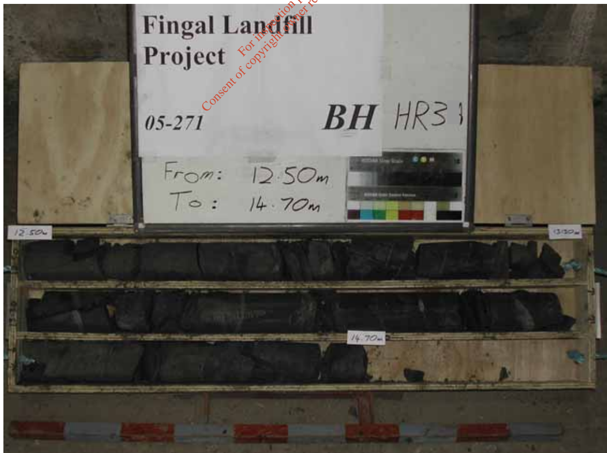
BH HR3: 12.50-14.70m