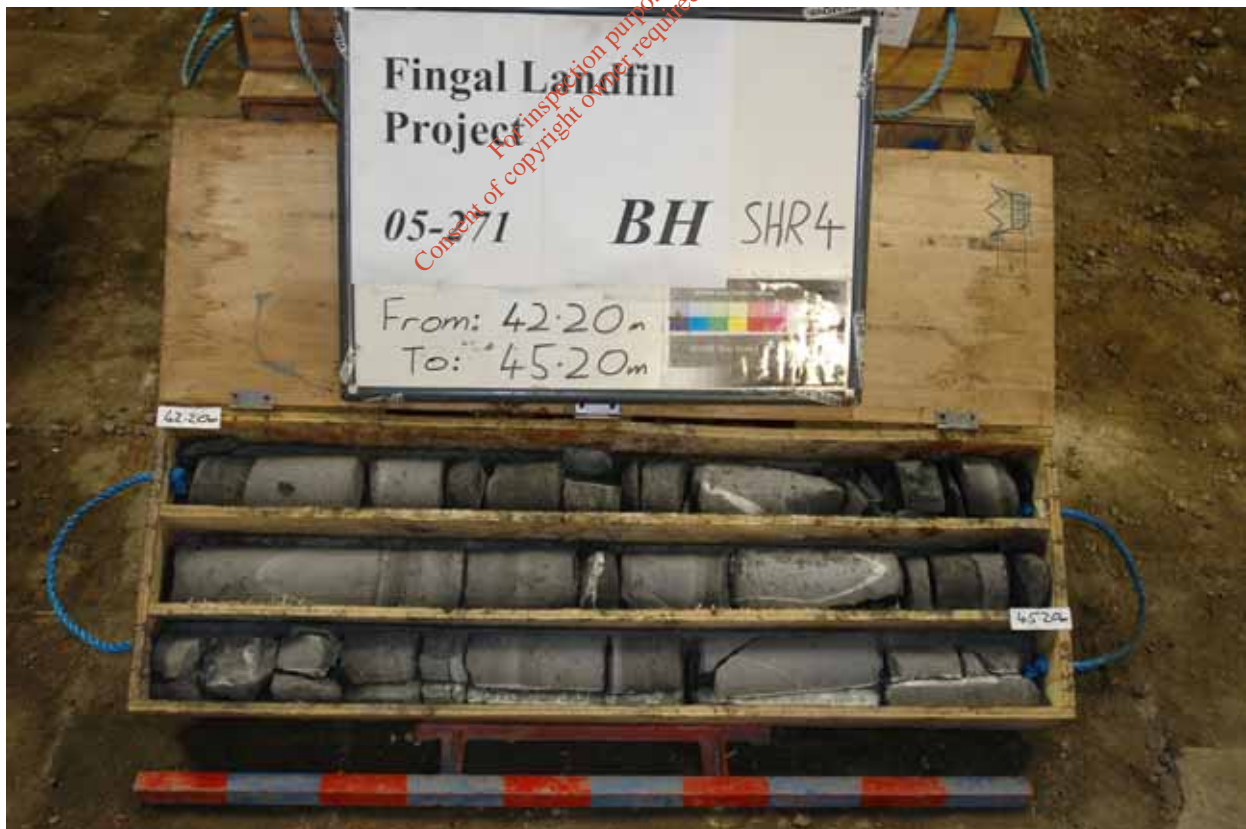
BH SHR4: 42.20-45.20m