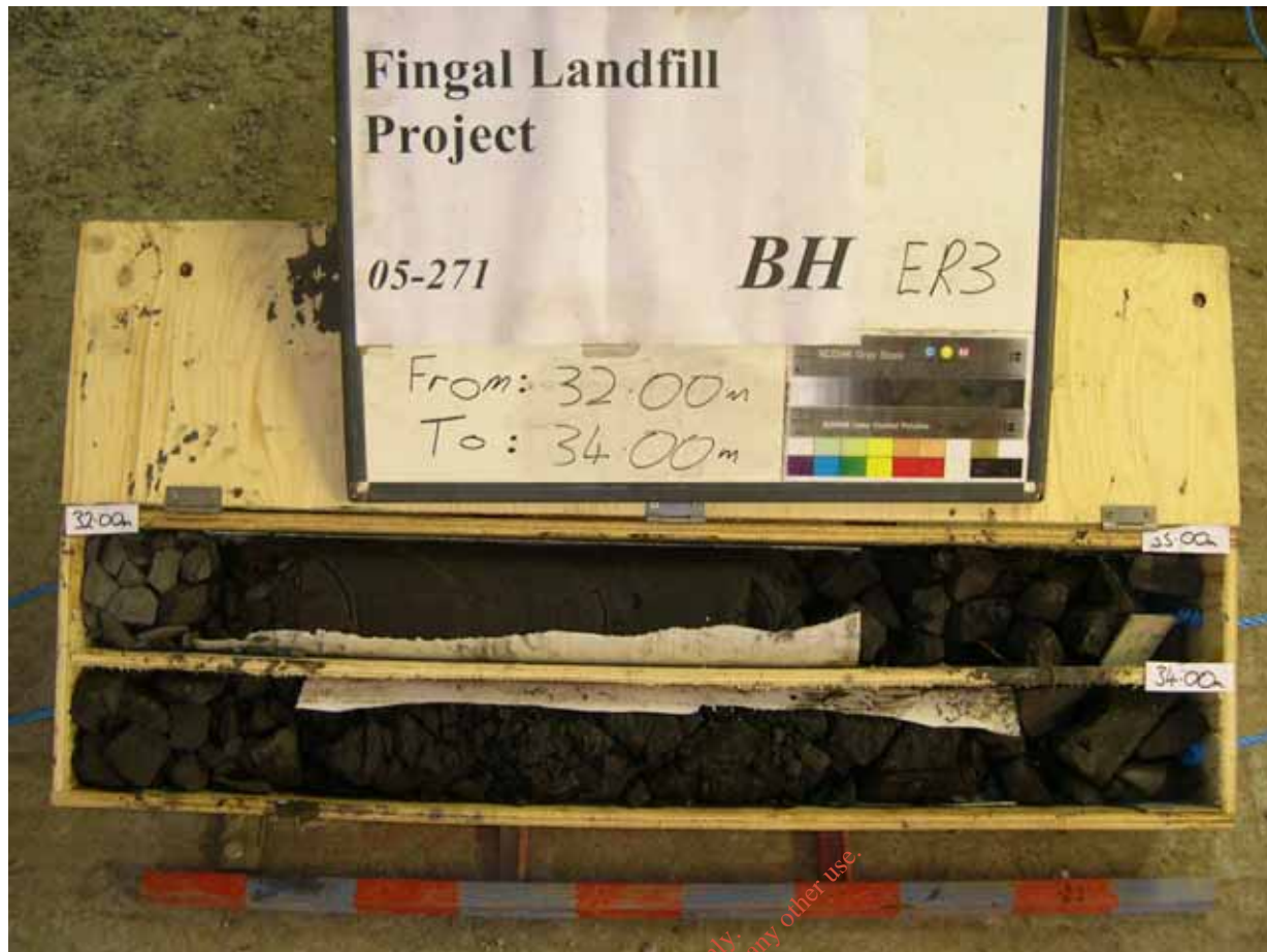
BH ER3: 32.00-34.00m