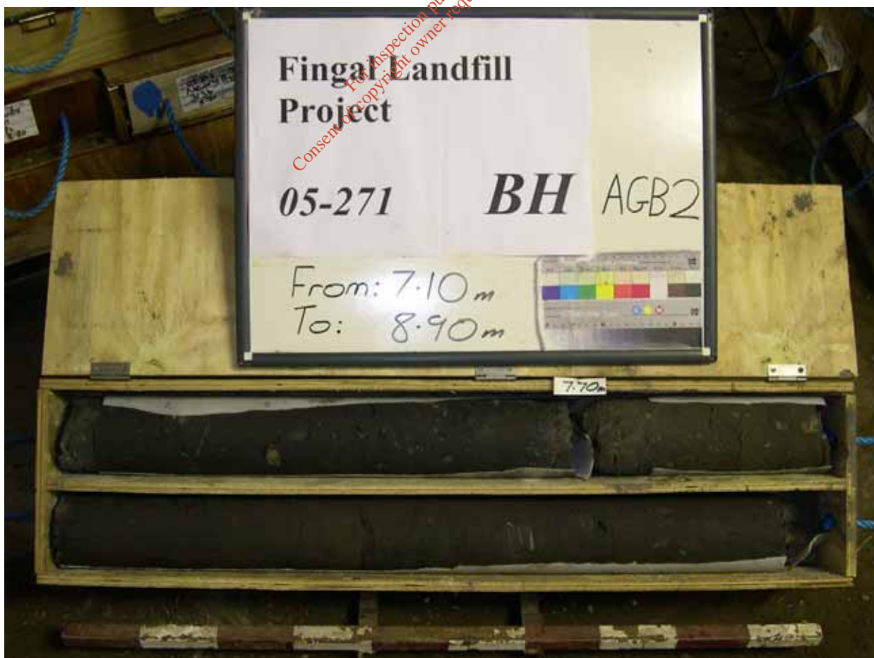
BH AGB2: 7.10-8.90m