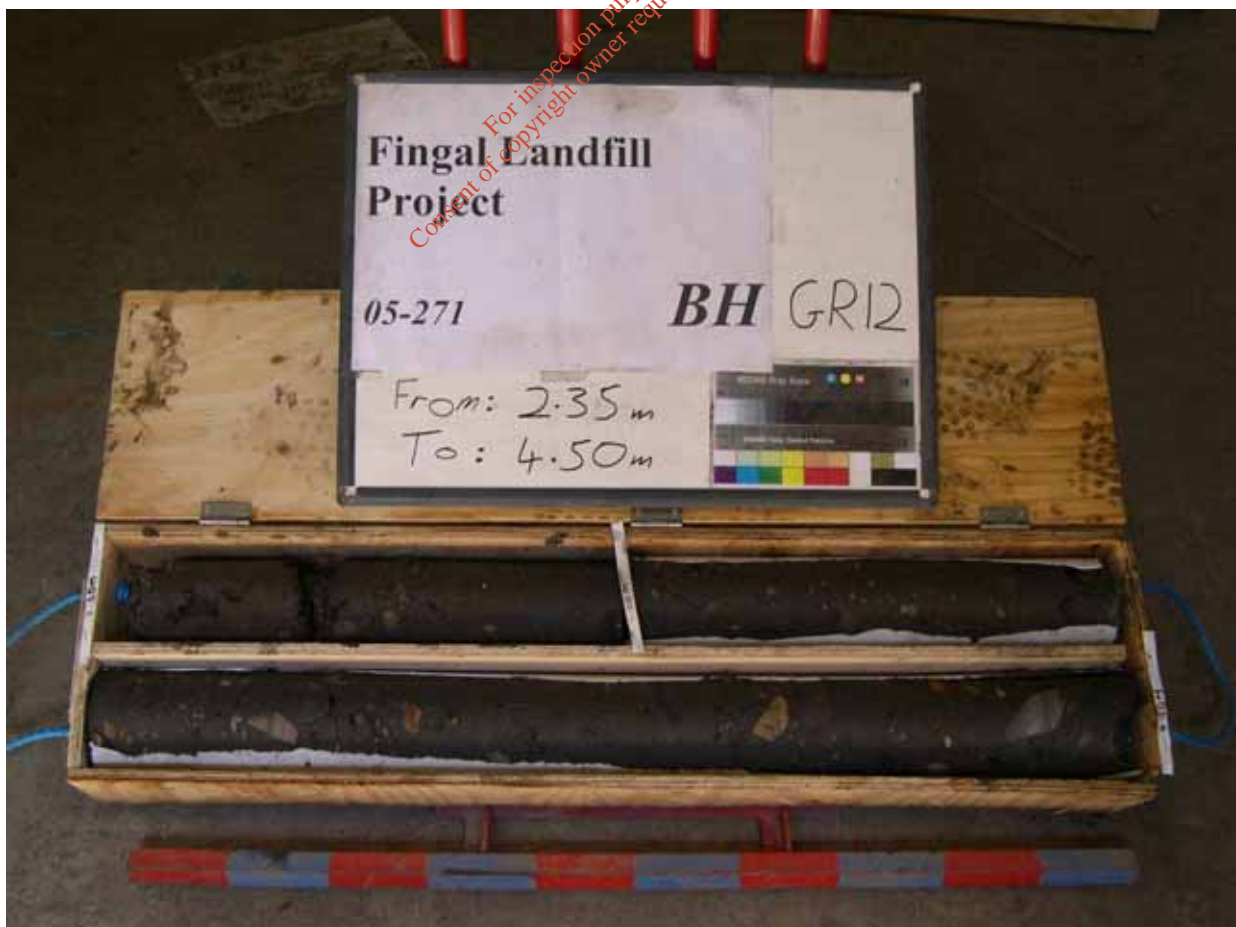
BH GR12: 2.35-4.50m