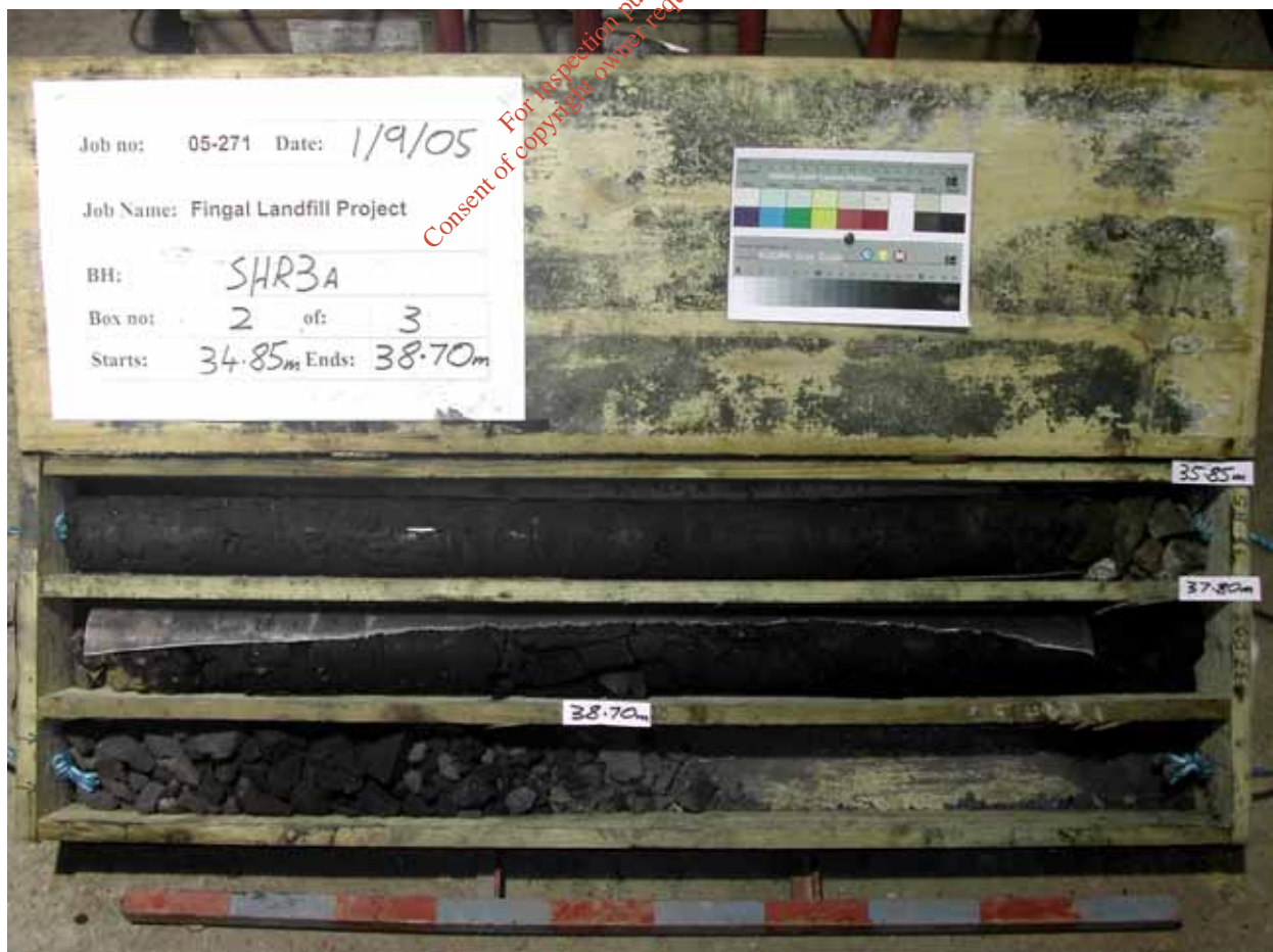
BH SHR3a: 34.85-38.70m