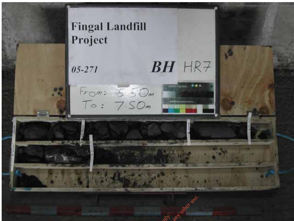
BH HR7: 5.50-7.50m

For inspection purposes only. Consent of copyright owner required for any other use.