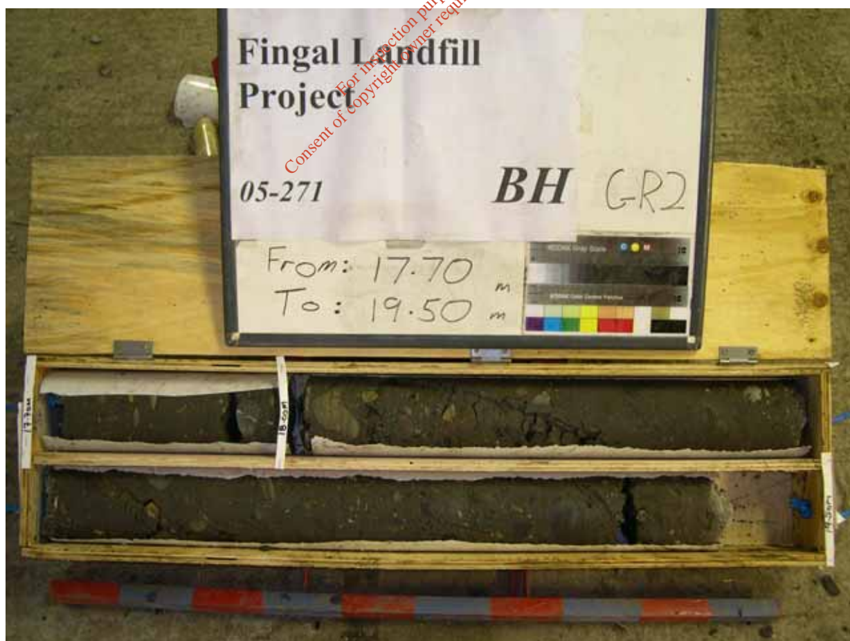
BH GR02: 17.70-19.50m