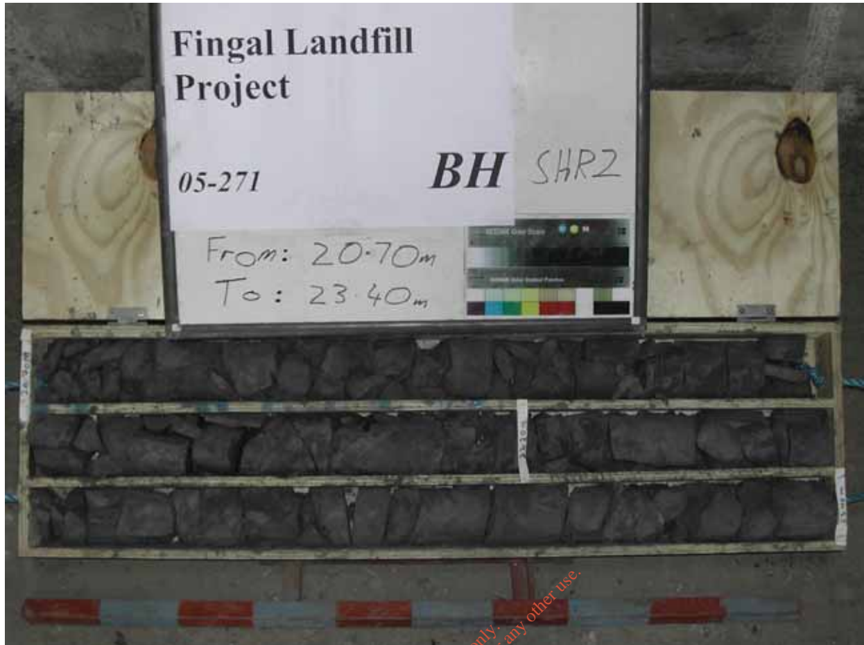
BH SHR2: 20.70-23.40m