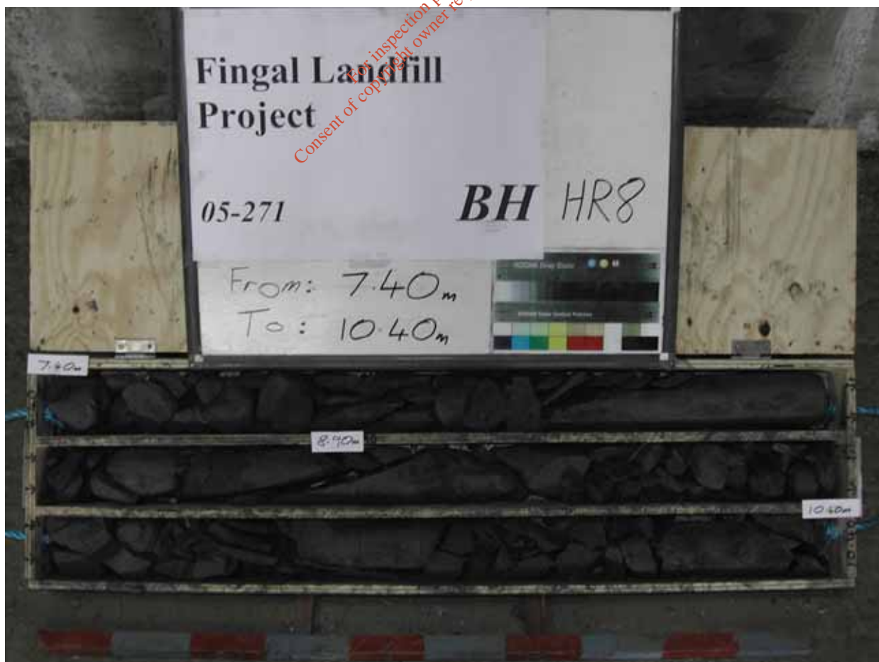
BH HR8: 7.40-10.40m