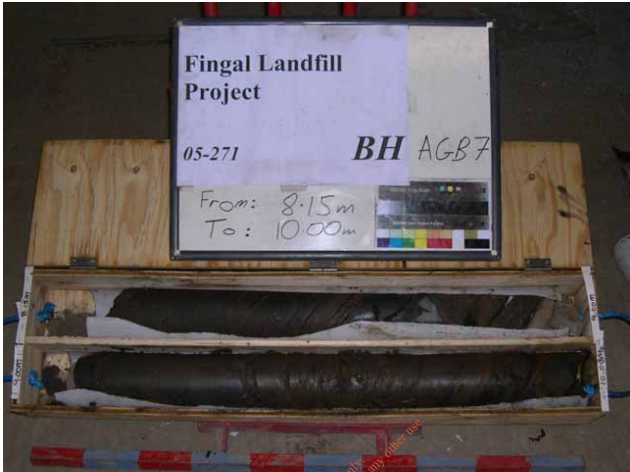
BH AGB7: 8.15-10.00m