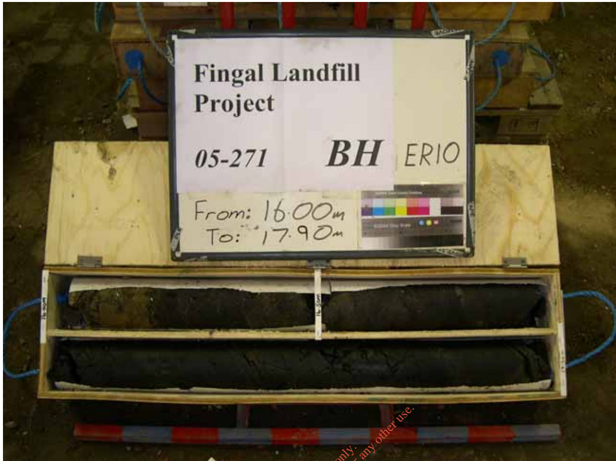
BH ER10: 16.00-17.90m