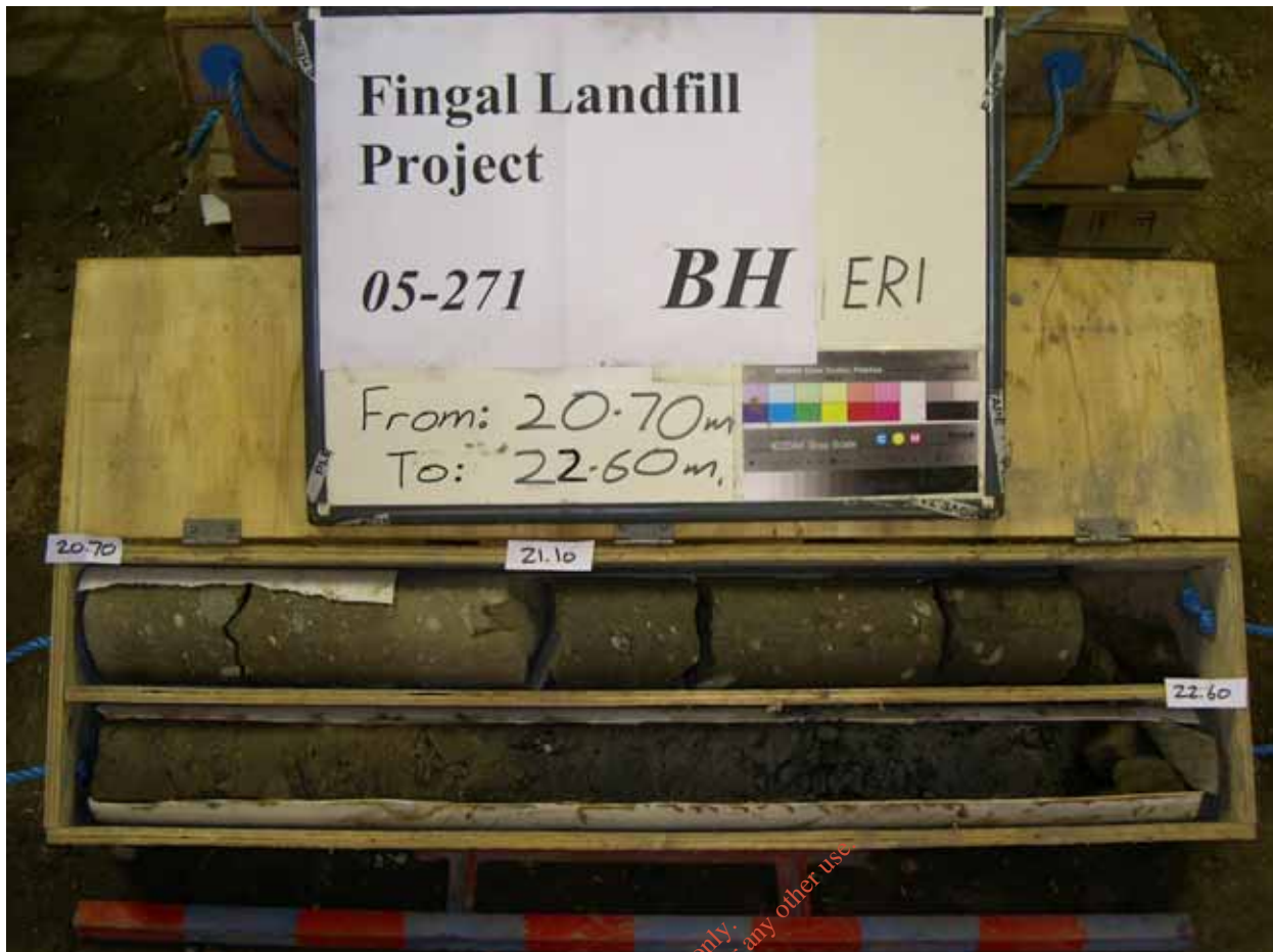
BH ER1: 20.70-22.60m