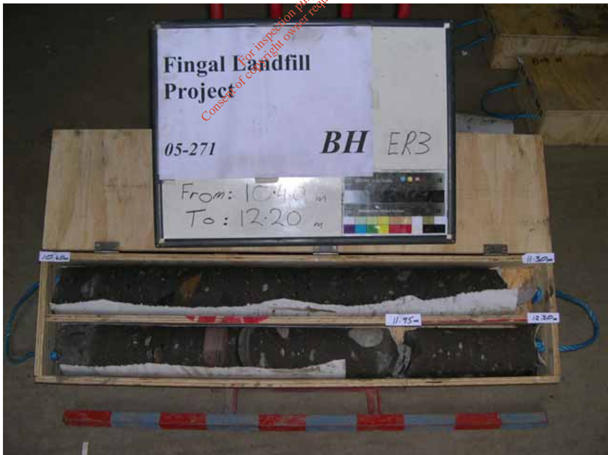
BH ER3: 10.40-12.20m