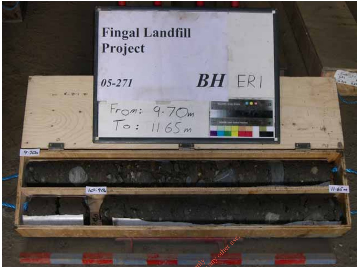
BH ER1: 9.70-11.65m