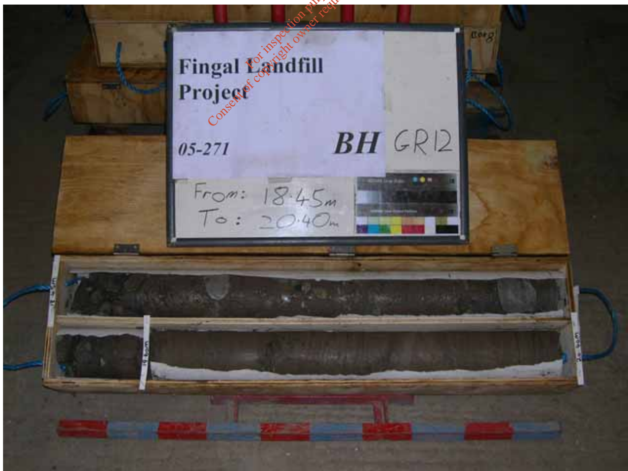
BH GR12: 18.45-20.40m