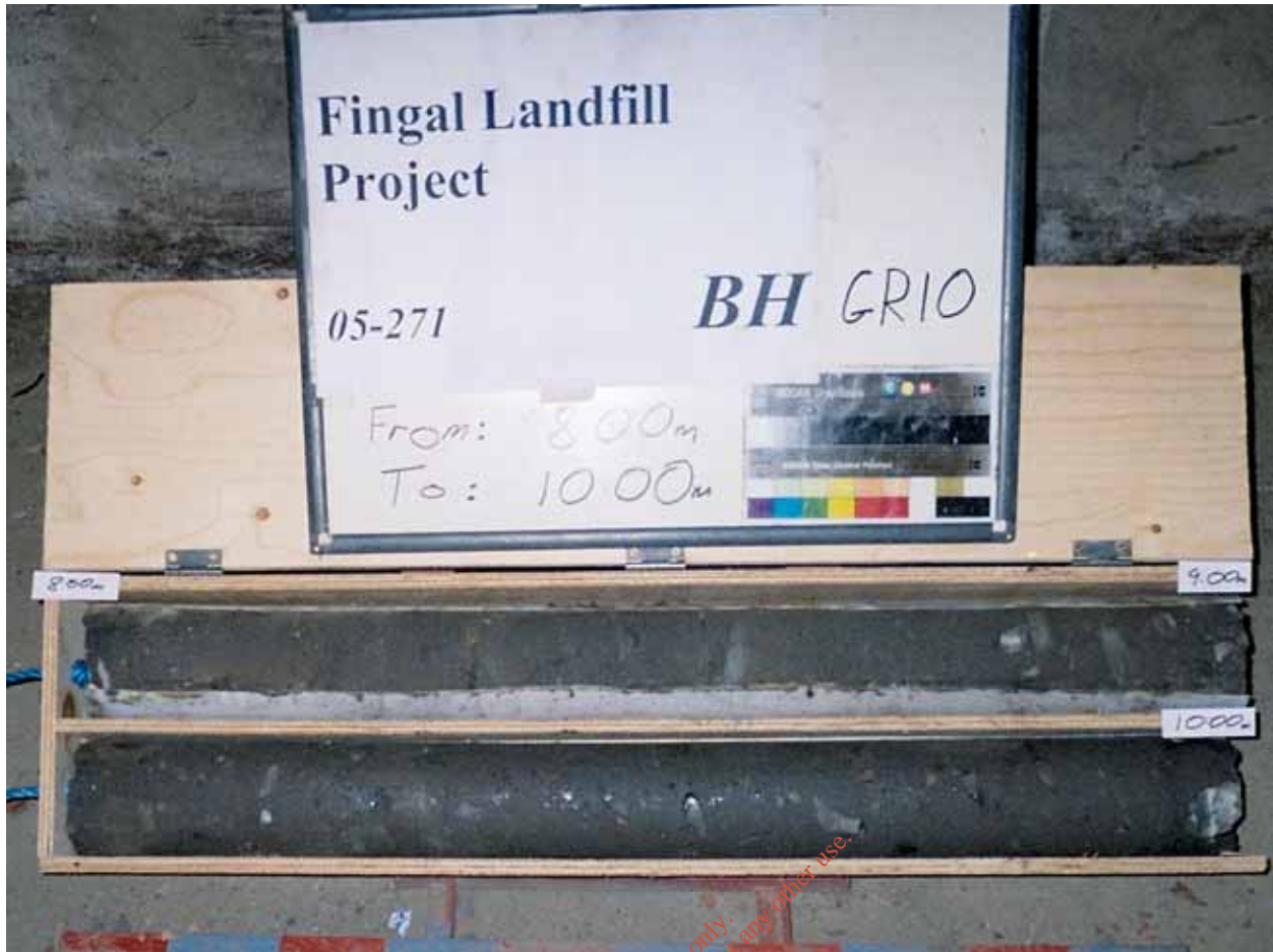
BH GR10: 8.00-10.00m