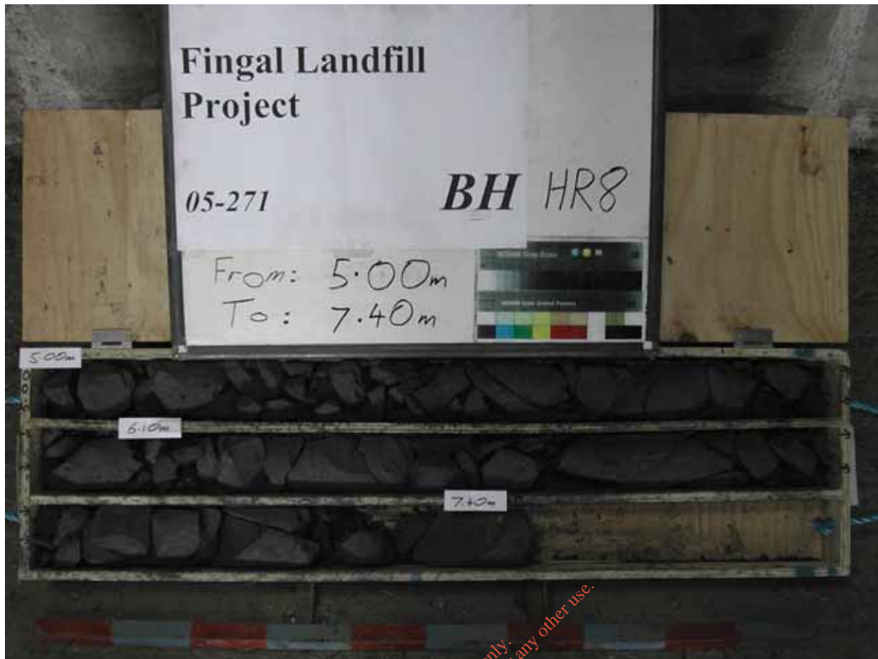
BH HR8: 5.00-7.40m