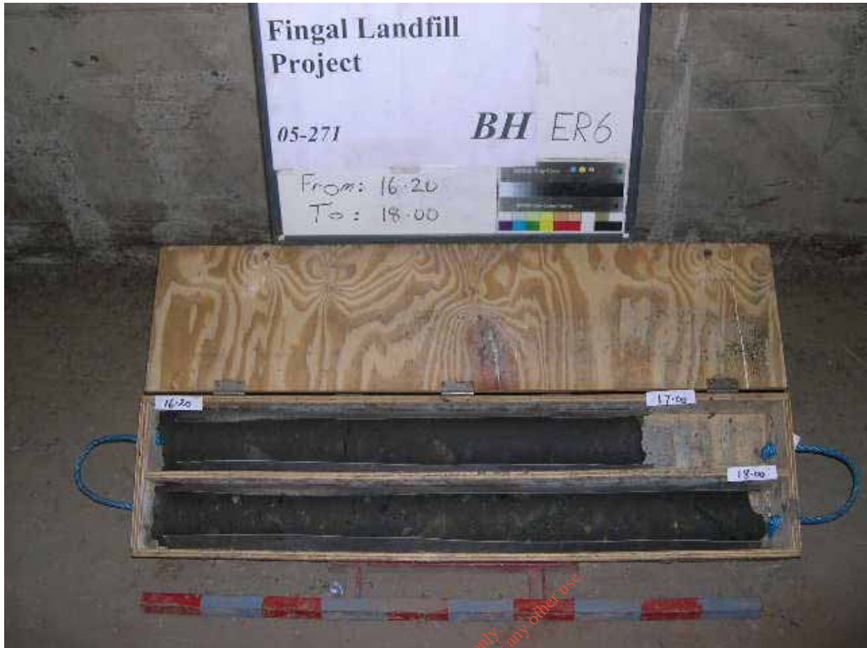
BH ER6: 16.20-18.00m