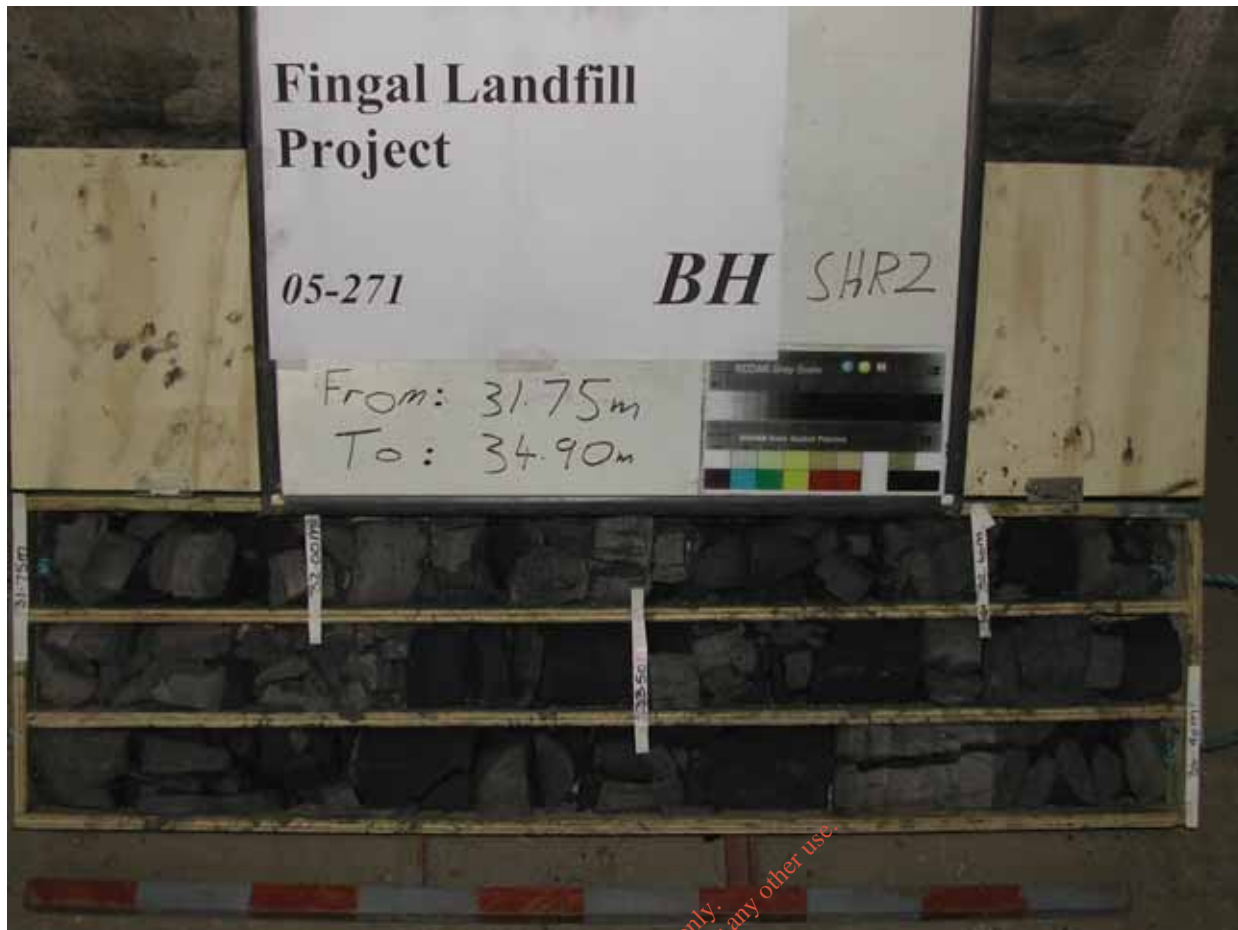
BH SHR2: 31.75-34.90m