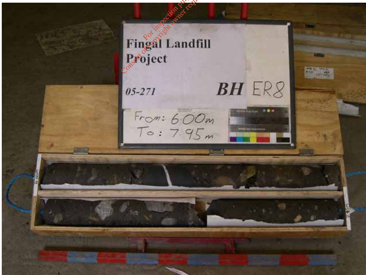
BH ER08: 6.00-7.95m