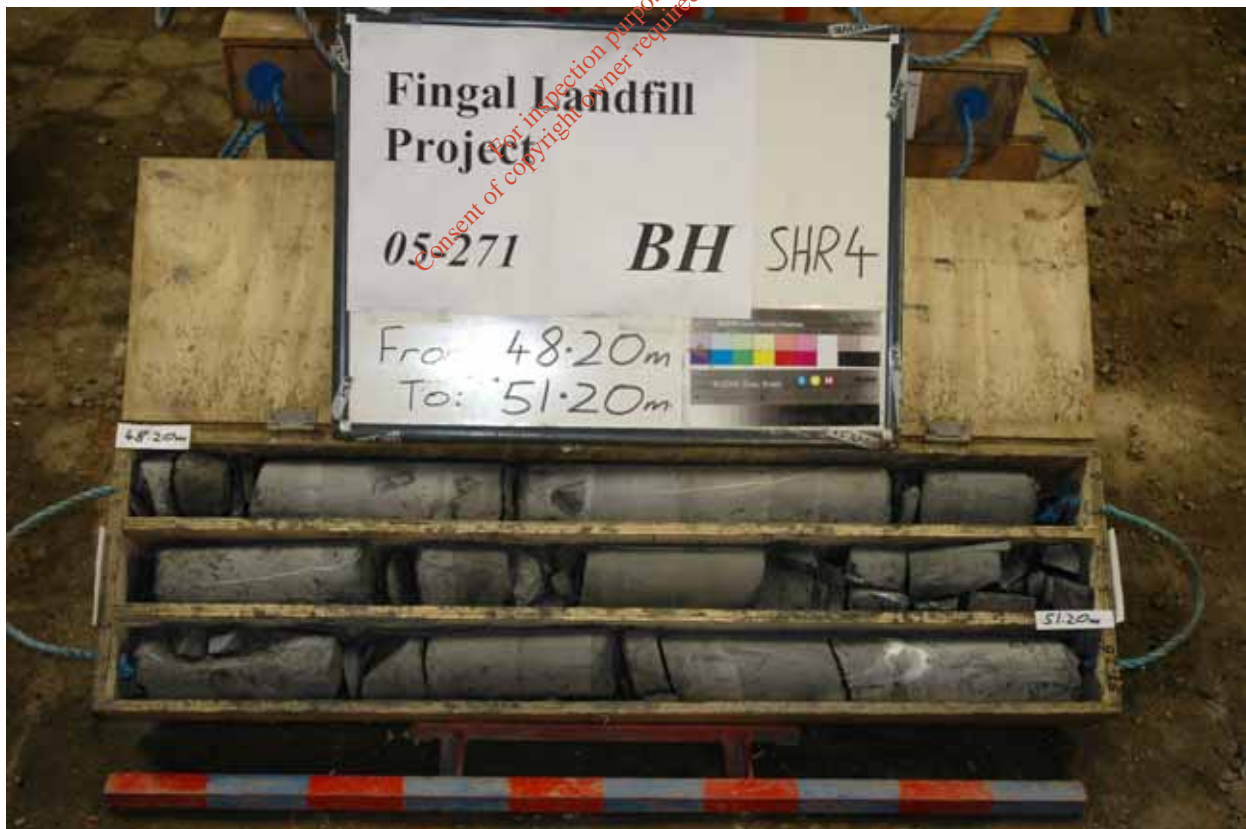
BH SHR4: 48.20-51.20m