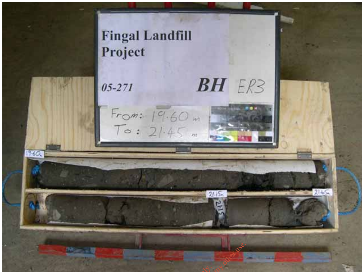
BH ER3: 19.60-21.45m