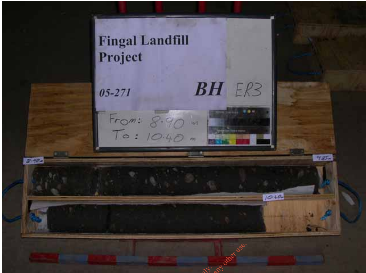
BH ER3: 8.90-10.40m