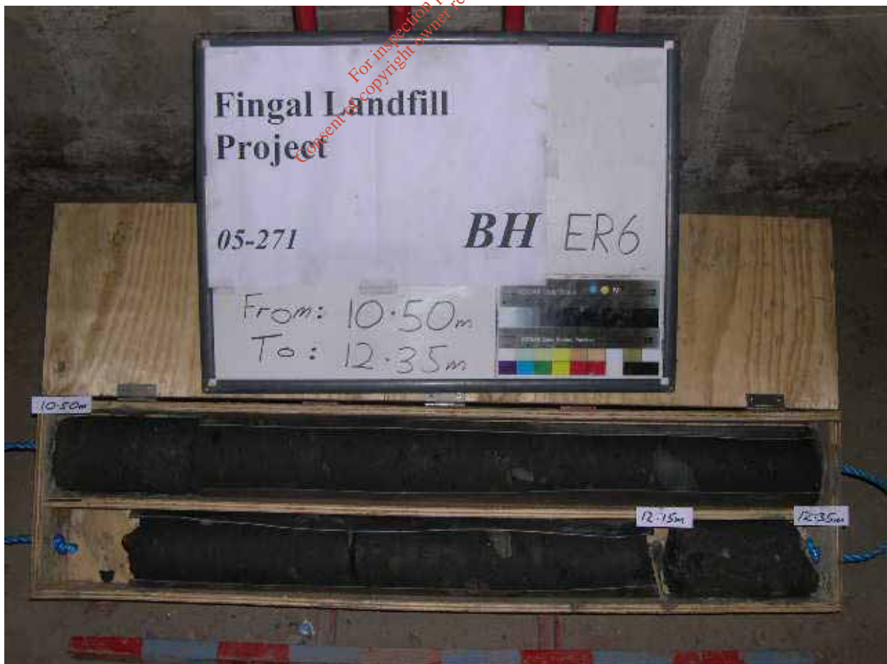
BH ER6: 10.50-12.35m