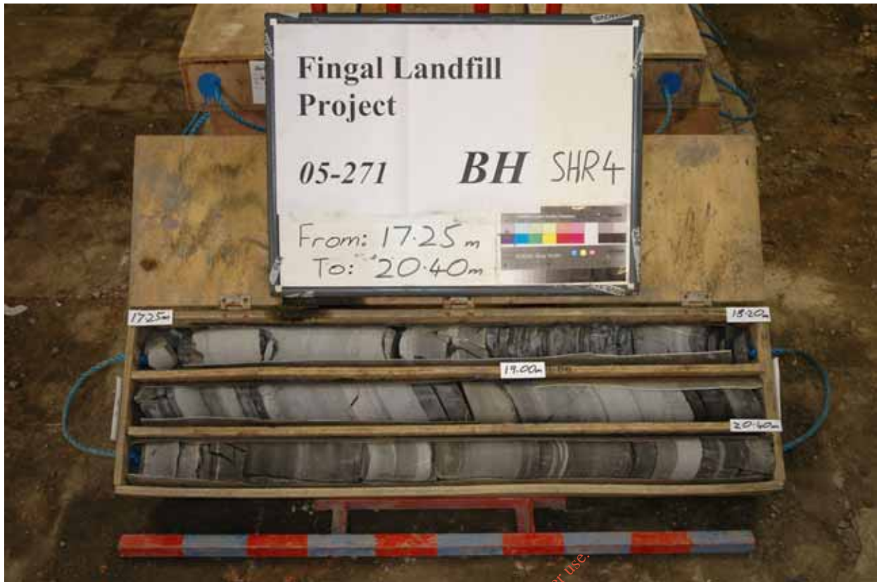
BH SHR4: 17.25-20.40m