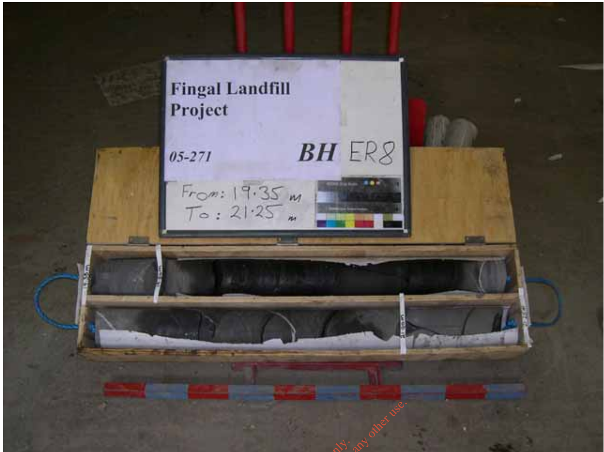
BH ER08: 19.35-21.25m