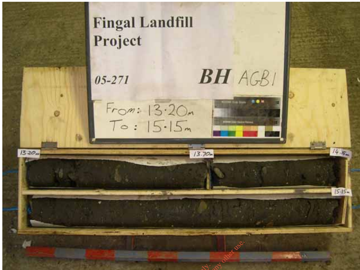
BH AGB1: 13.20-15.15m