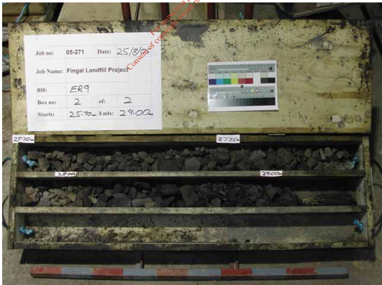
BH ER9: 25.70-29.00m