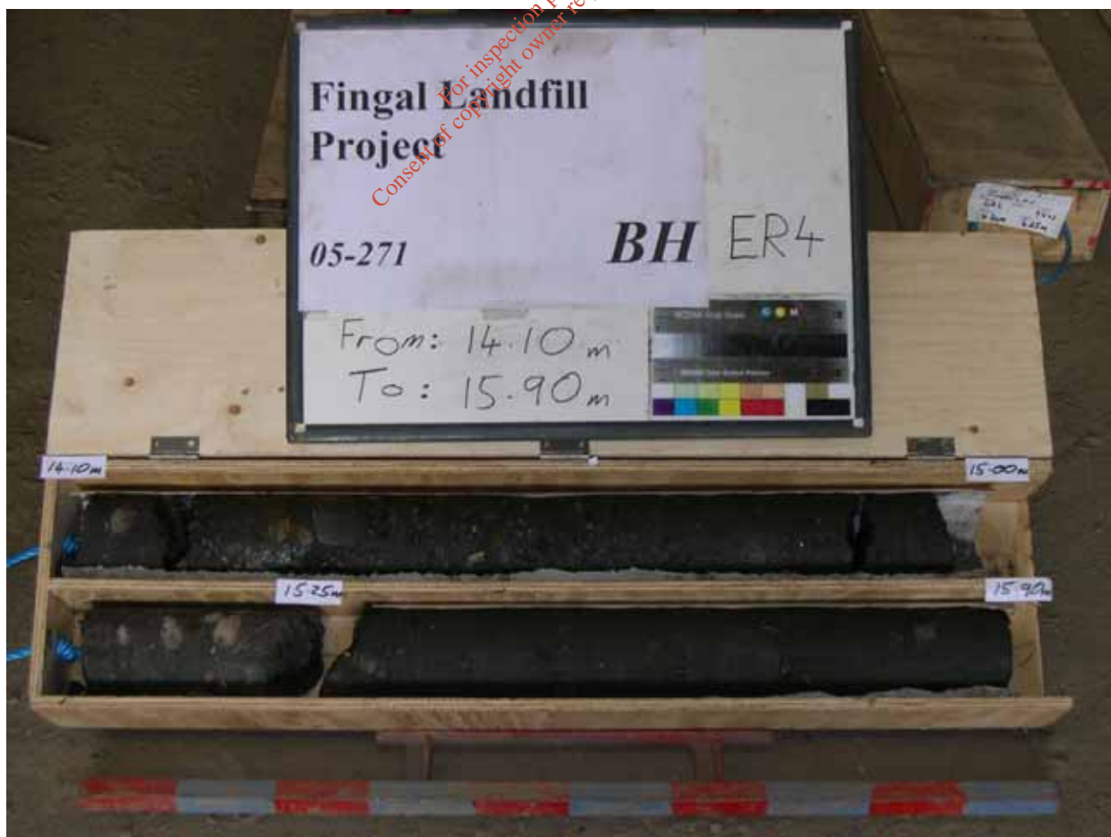
BH ER4: 14.10-15.90m