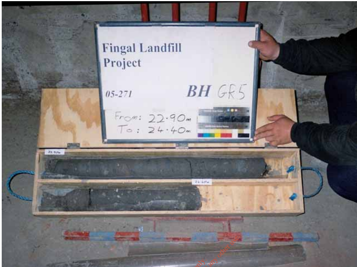
BH GR5: 22.90-24.40m