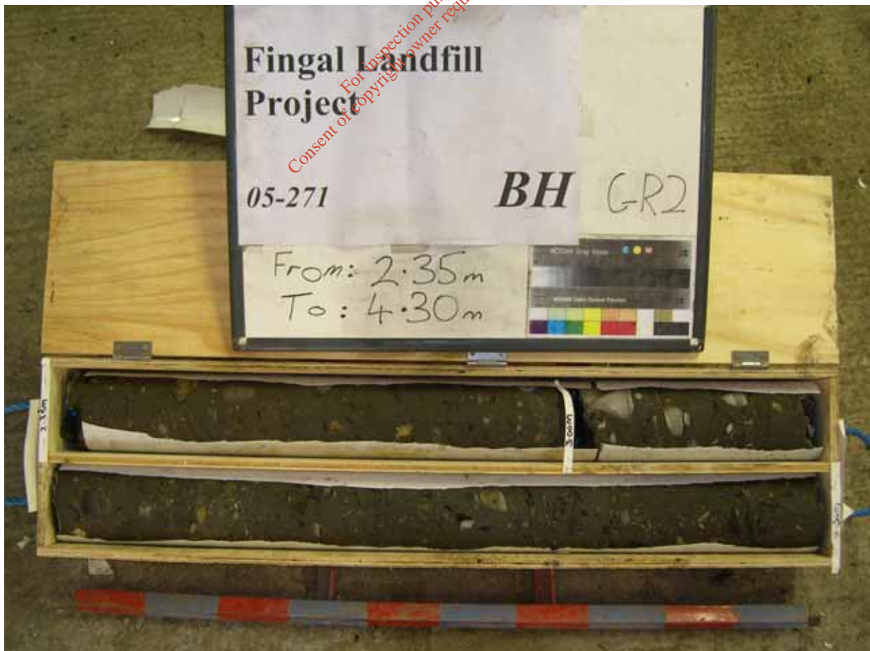
BH GR02: 2.35-4.30m