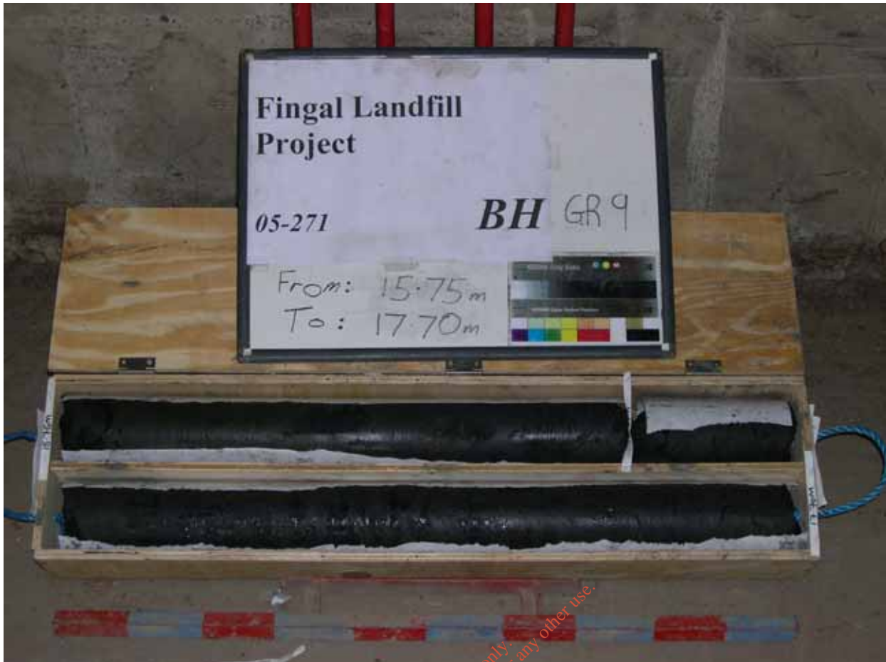
BH GR9: 15.75-17.70m