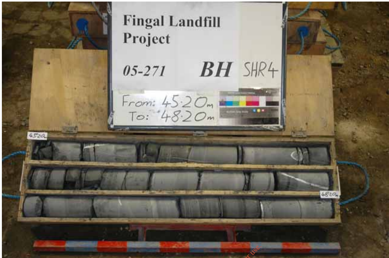
BH SHR4: 45.20-48.20m