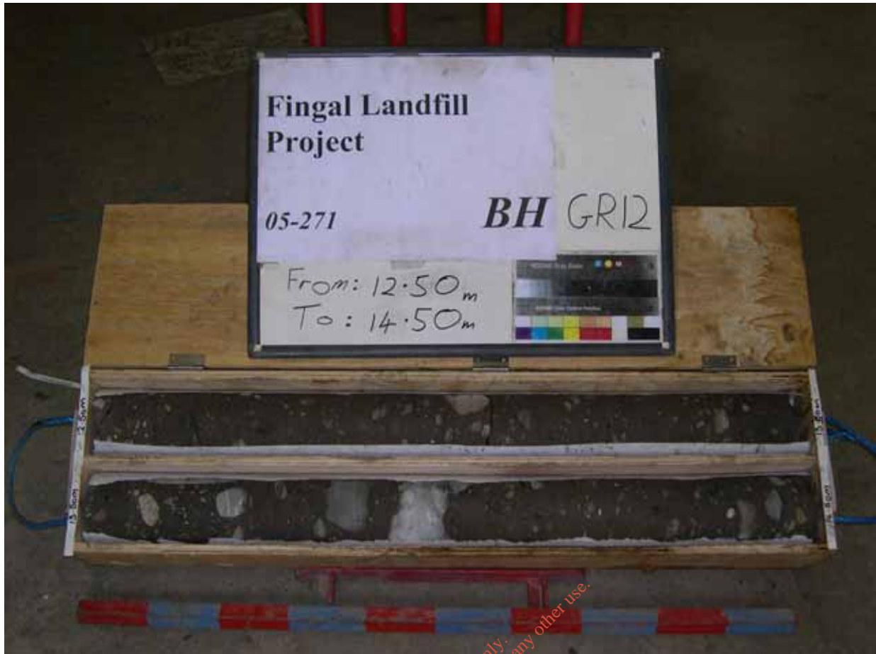
BH GR12: 12.50-14.50m