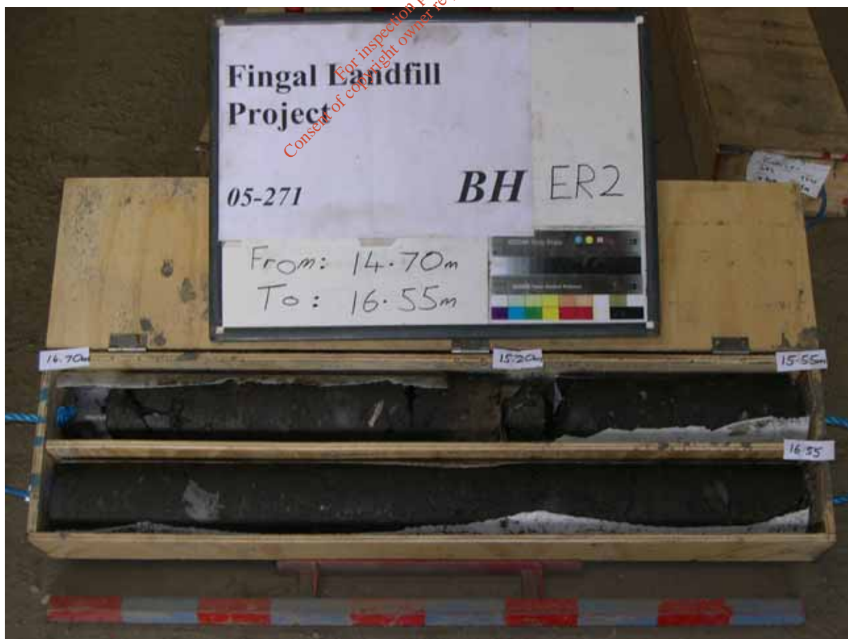
BH ER2: 14.70-16.55m