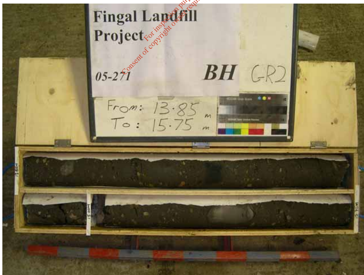
BH GR02: 13.85-15.75m