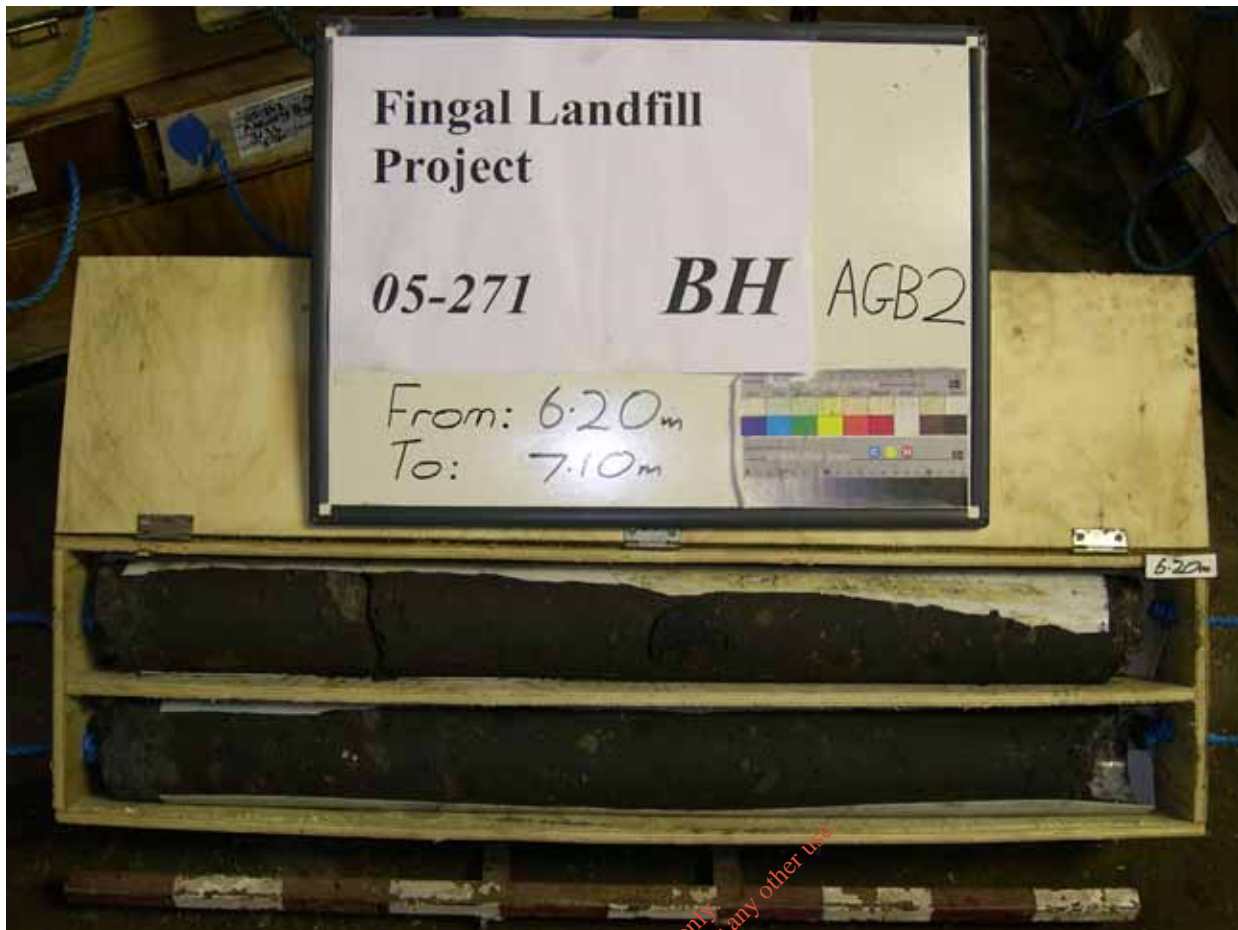
BH AGB2: 6.20-7.10m