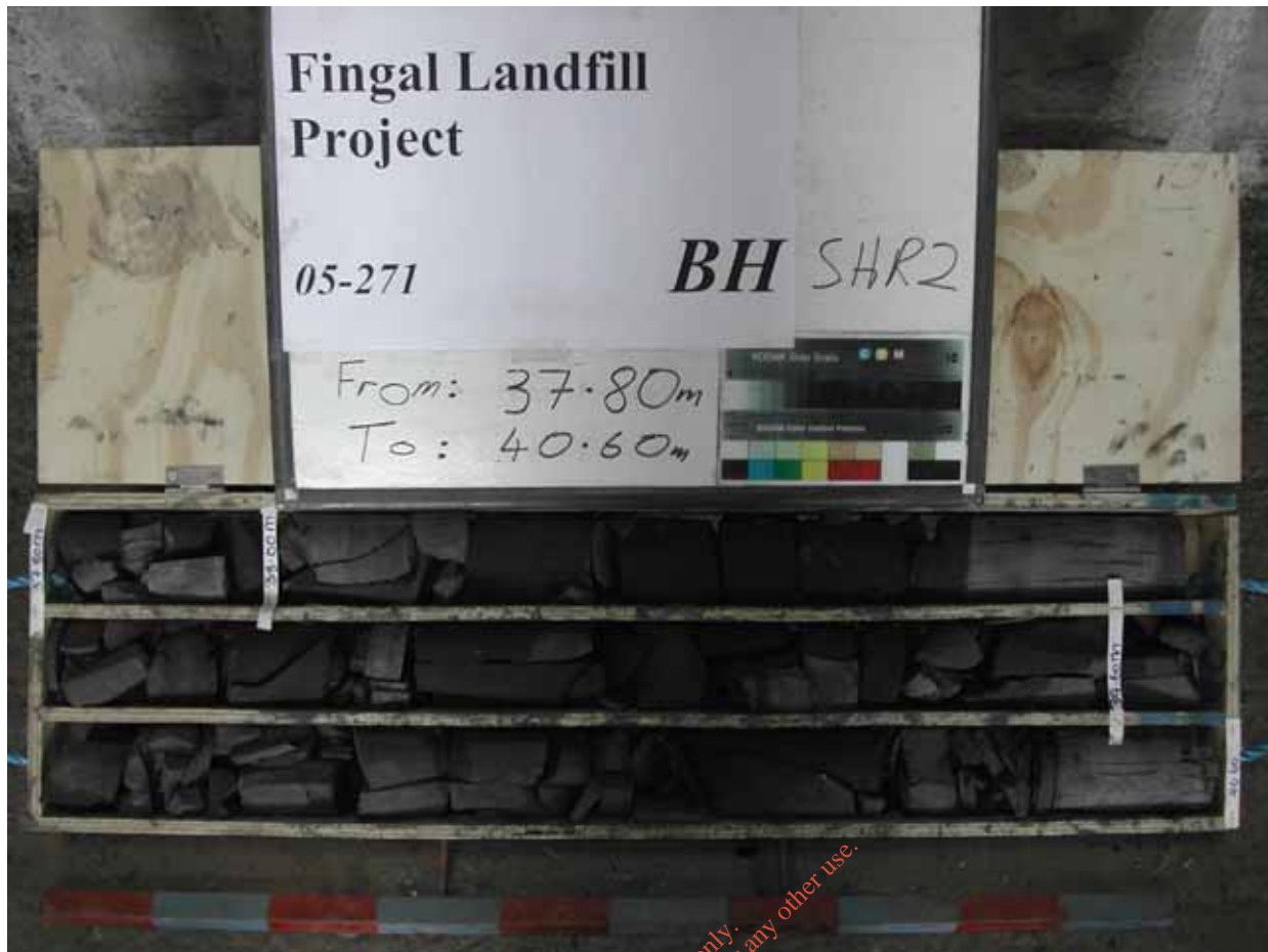
BH SHR2: 37.80-40.60m