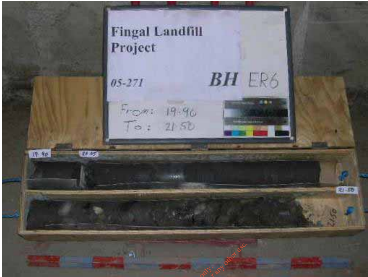
BH ER6: 19.90-21.50m