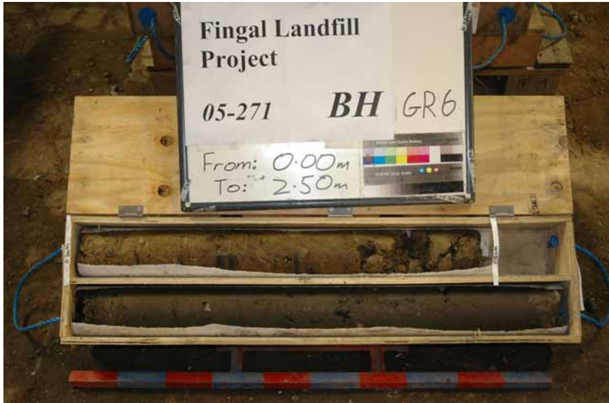
BH GR6: 0.00-2.50m