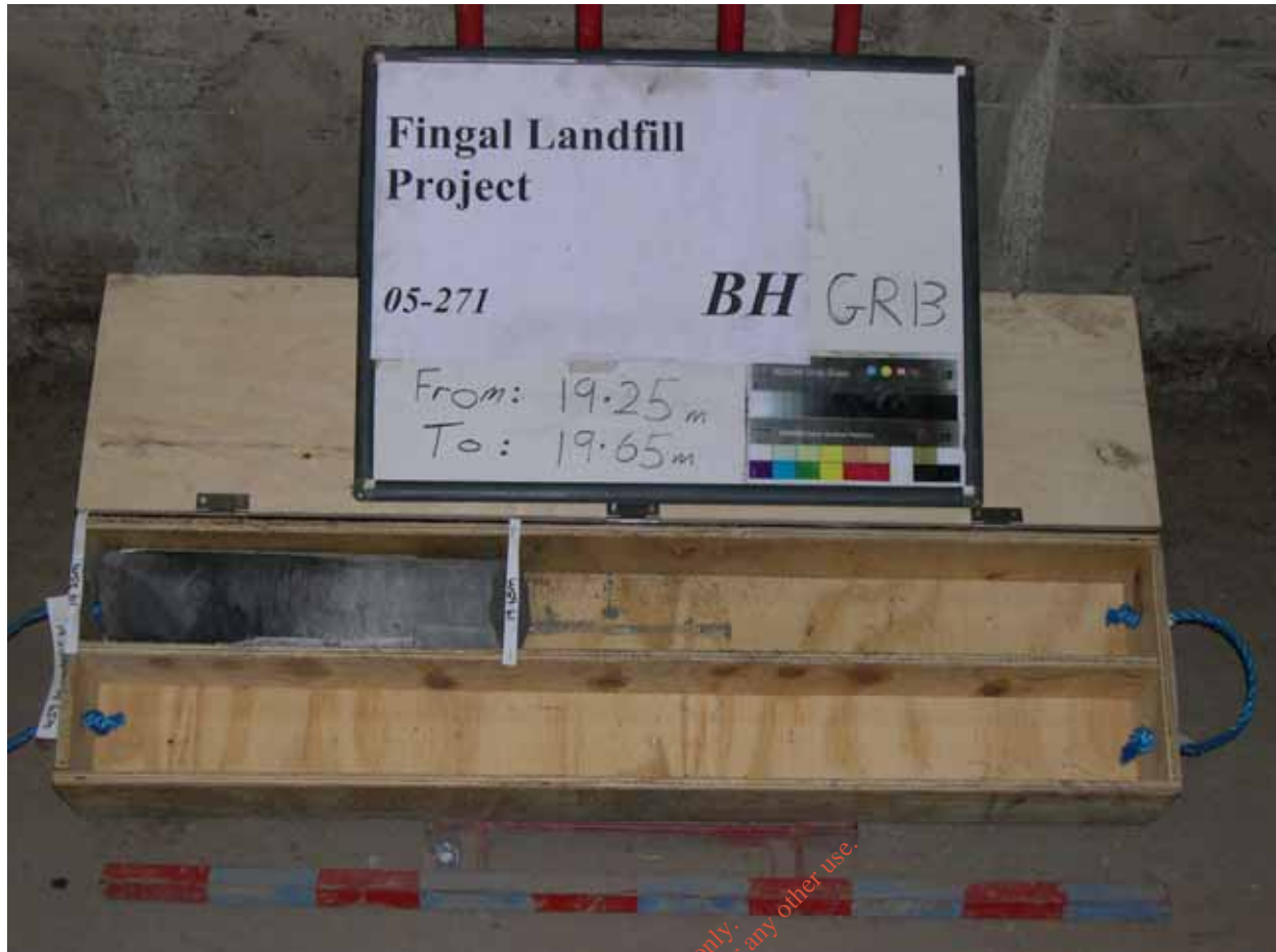
BH GR13: 19.25-19.65m

For inspection purposes only. Consent of copyright owner required for any other use.