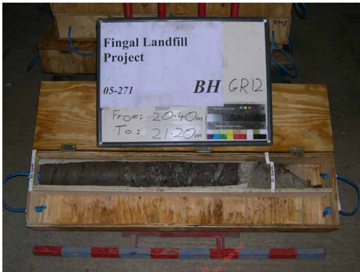
BH GR12: 20.40-21.20m

For inspection purposes only. Consent of copyright owner required for any other use.