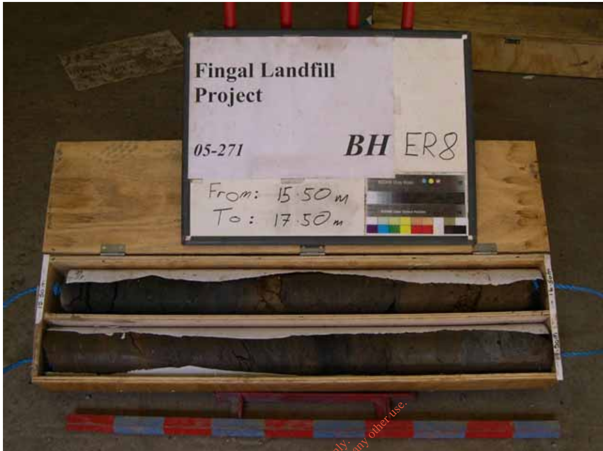
BH ER08: 15.50-17.50m