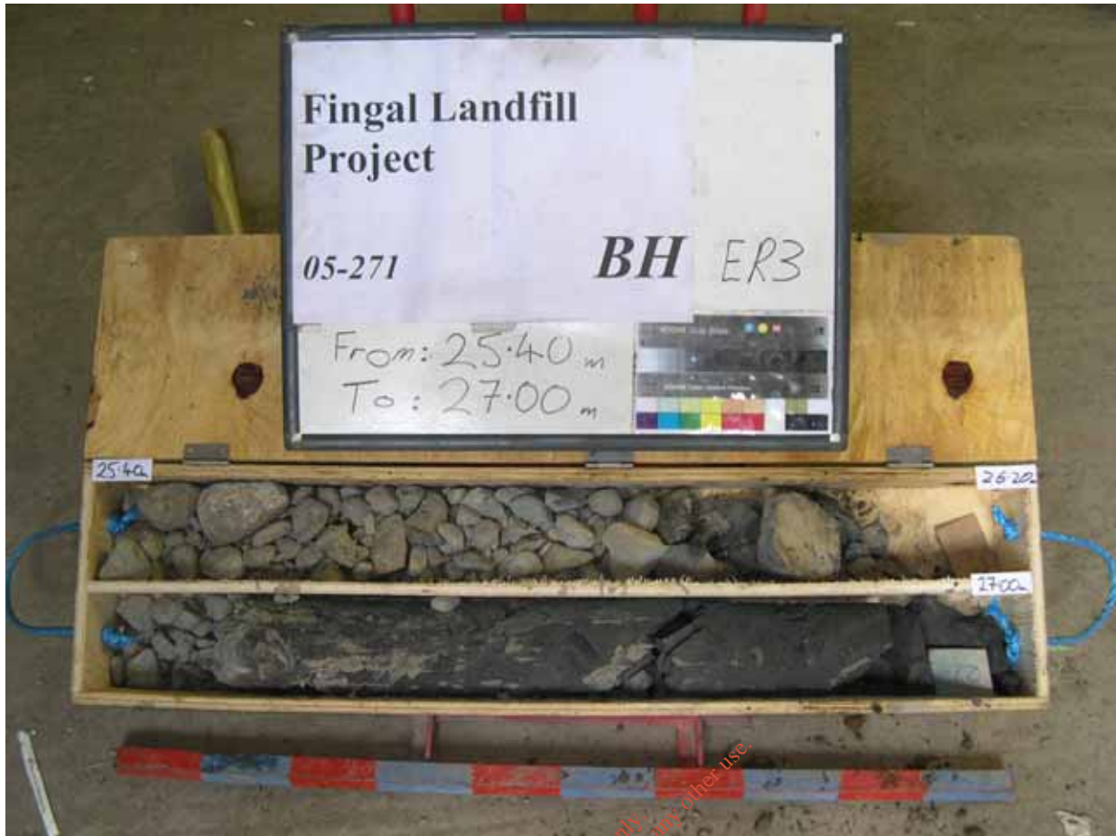
BH ER3: 25.4-27.00m