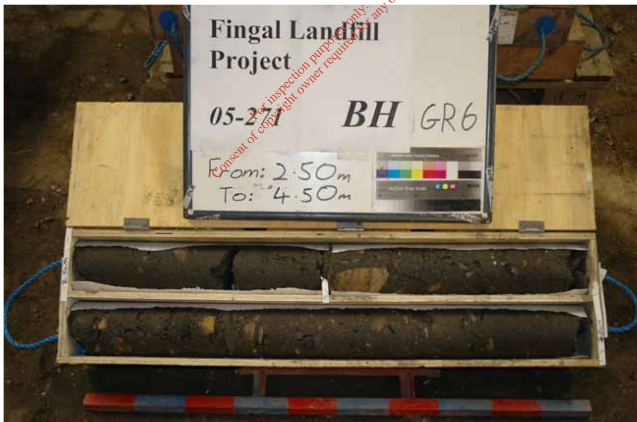
BH GR6: 2.50-4.50m