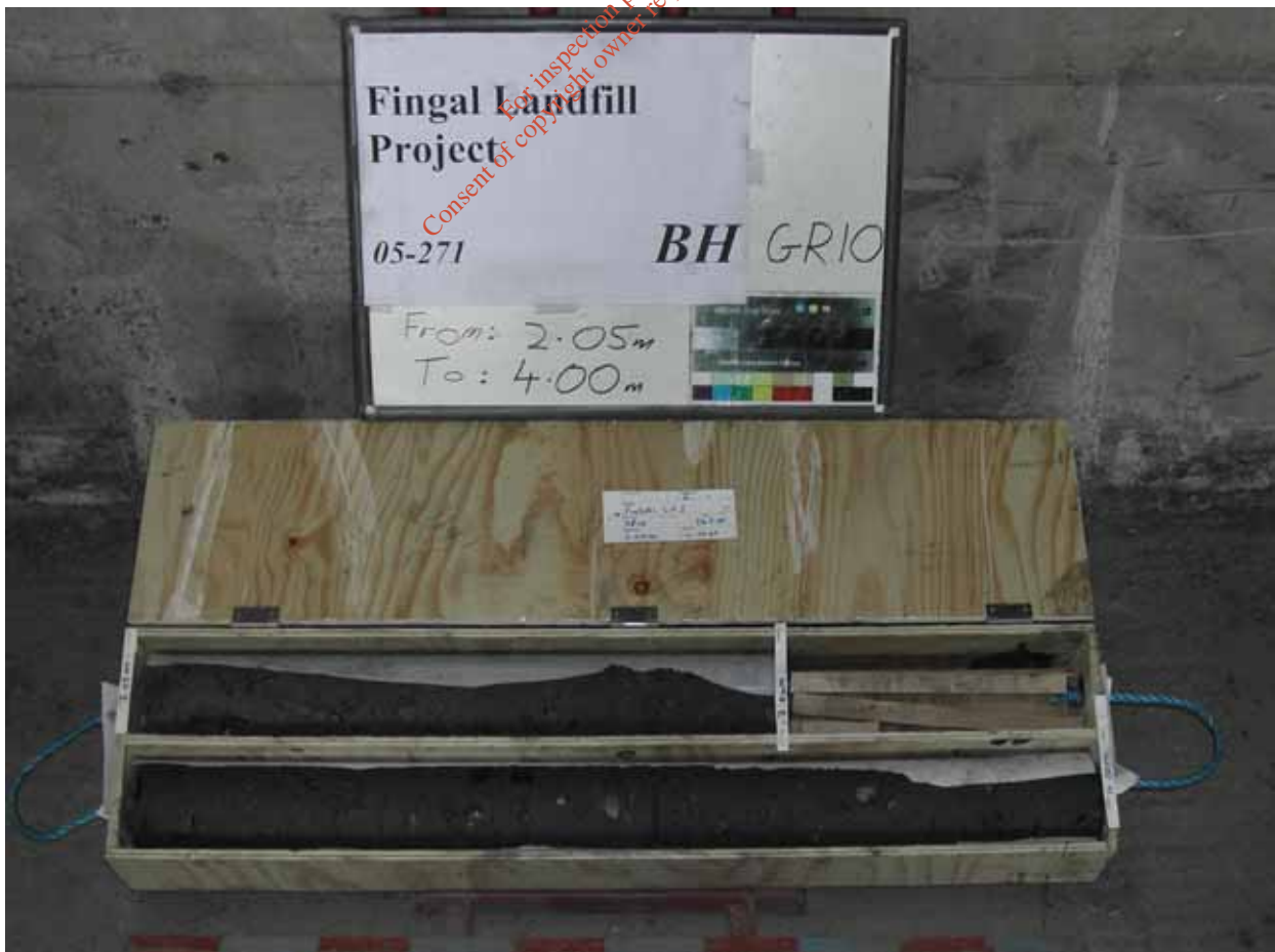
BH GR10: 2.05-4.00m