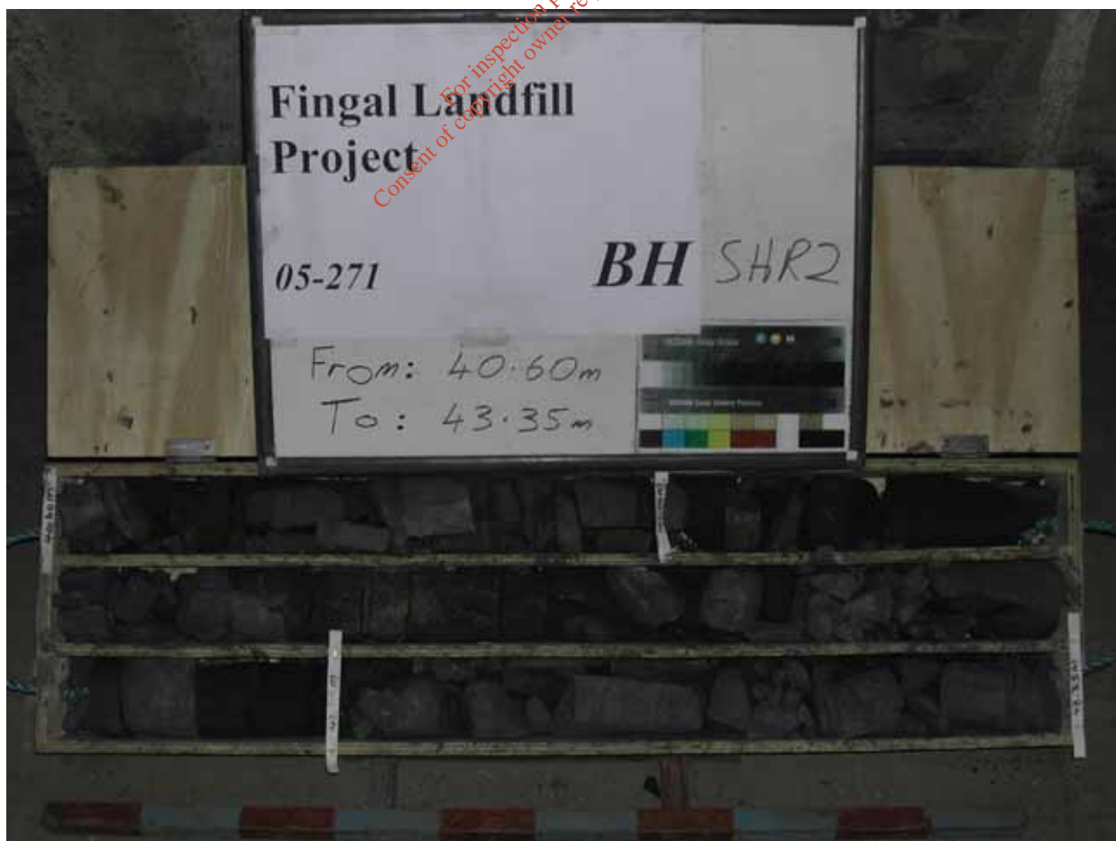
BH SHR2: 40.60-43.35m