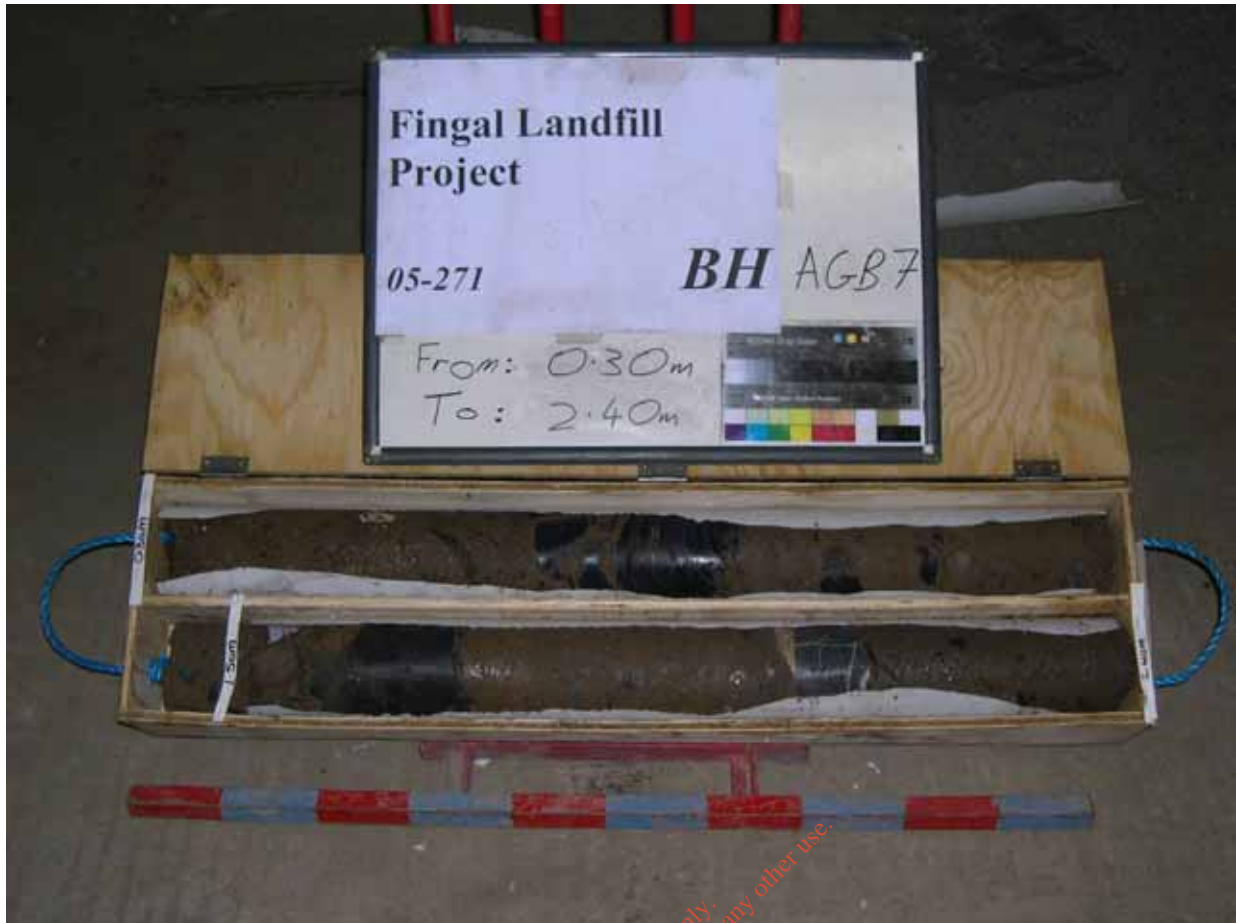
BH AGB7: 0.30-2.40m