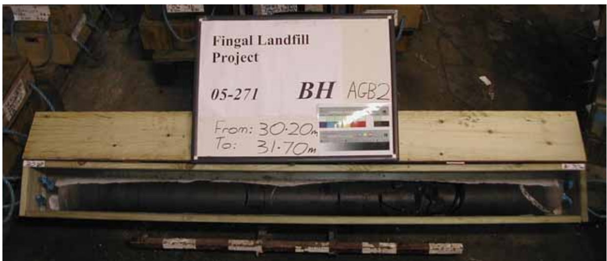
BH AGB2: 30.20-31.70m