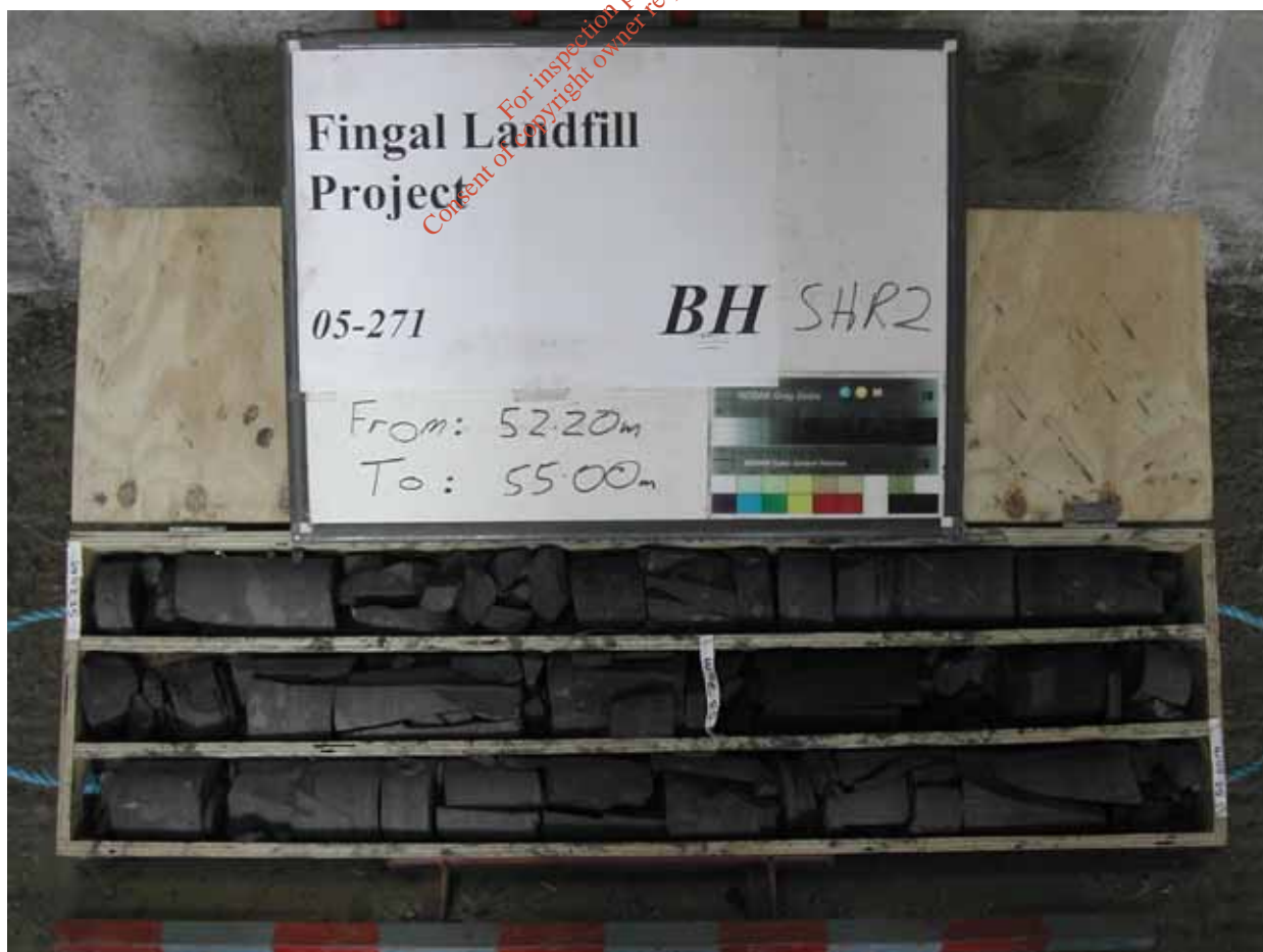
BH SHR2: 52.20-55.00m