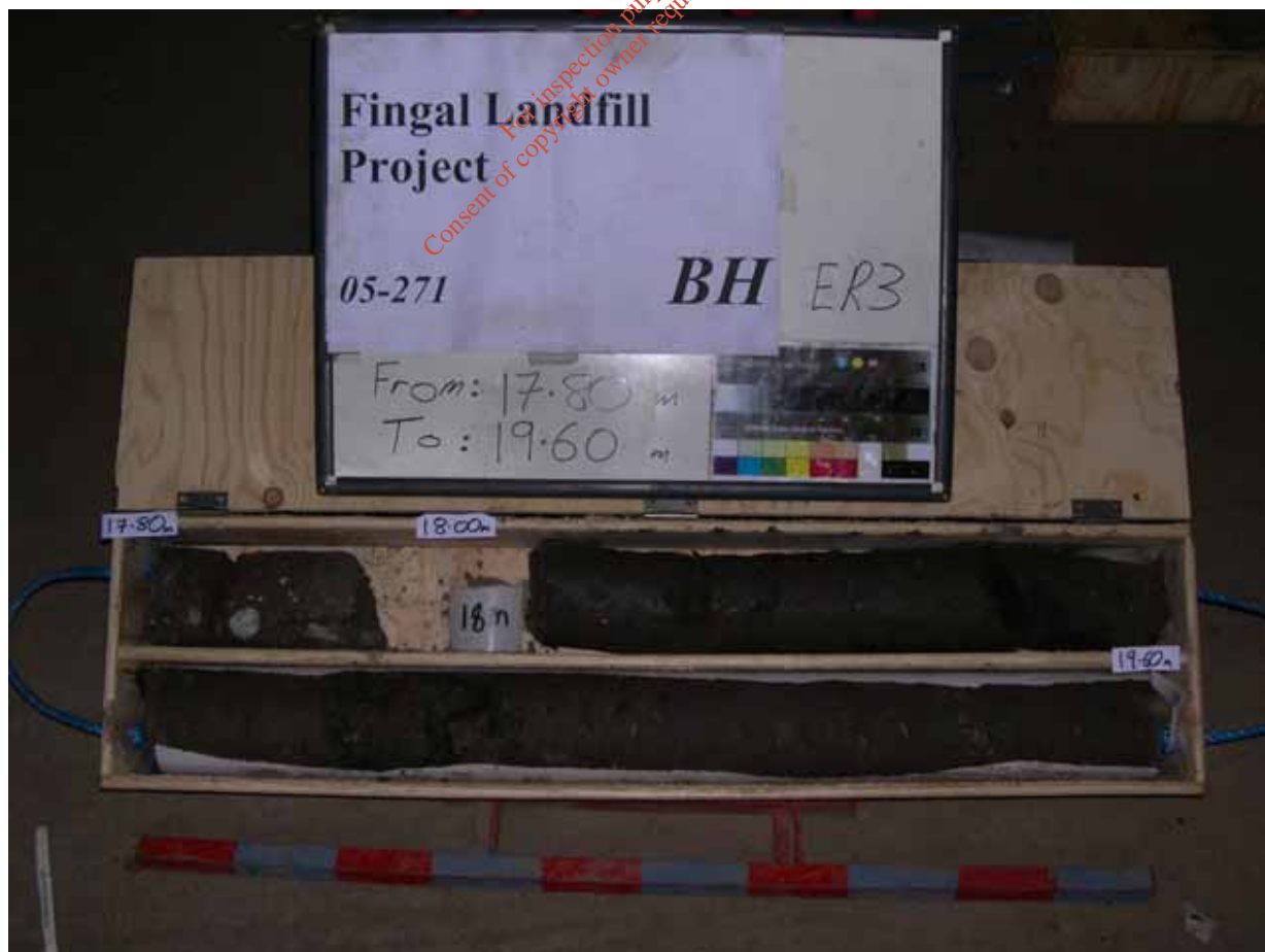
BH ER3: 17.80-19.60m