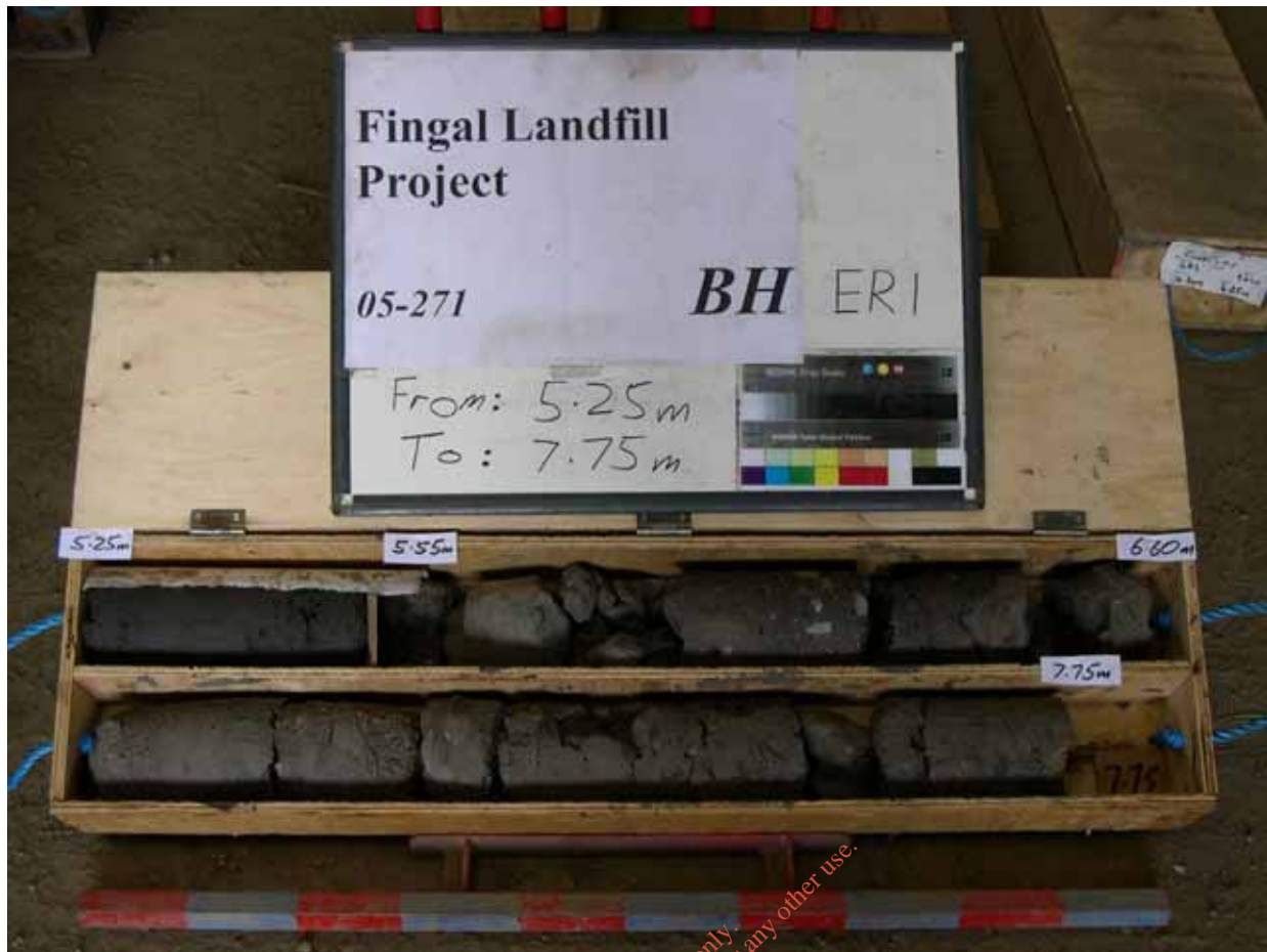
BH ER1: 5.25-7.75m