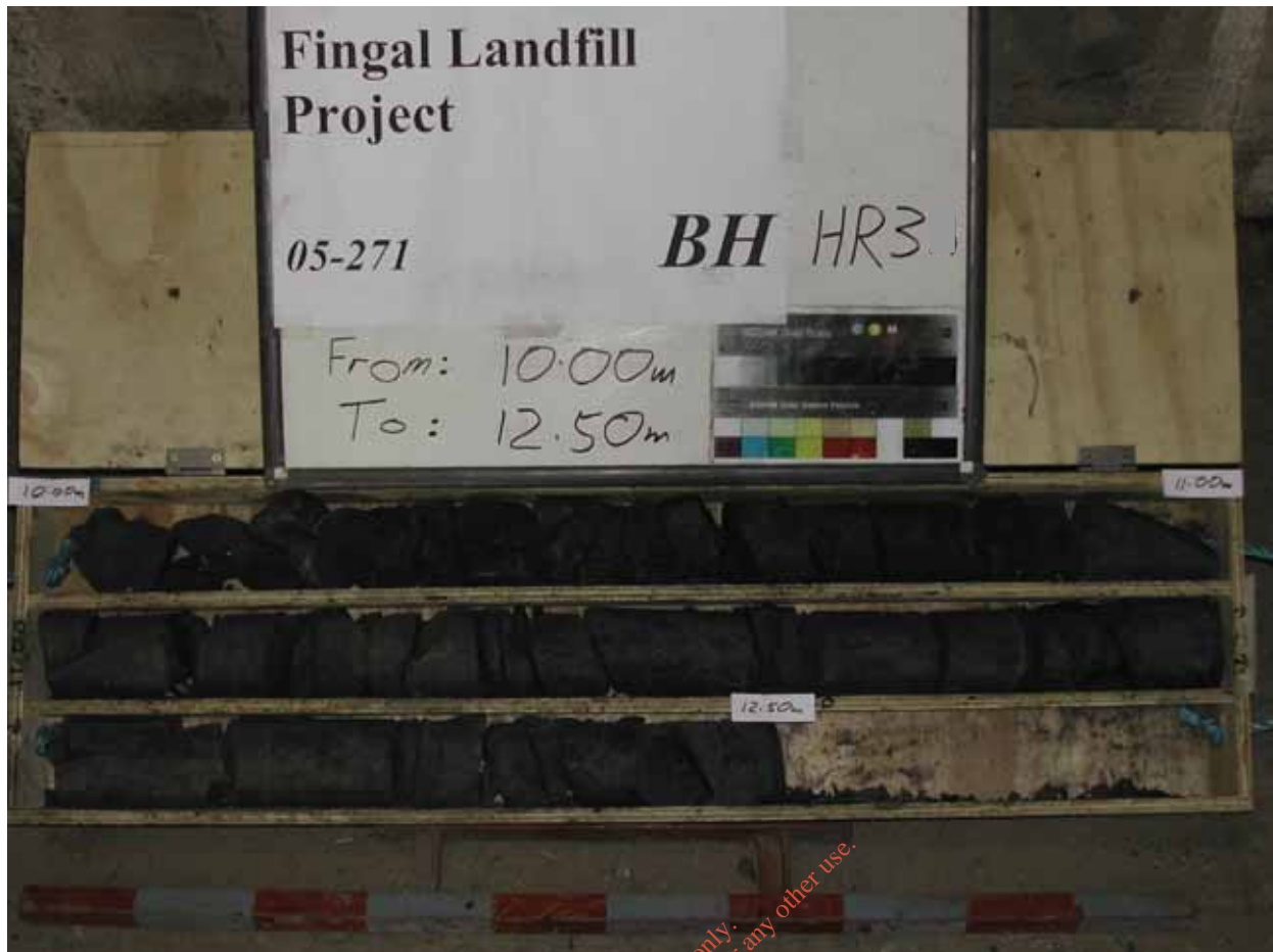
BH HR3: 10.00-12.50m