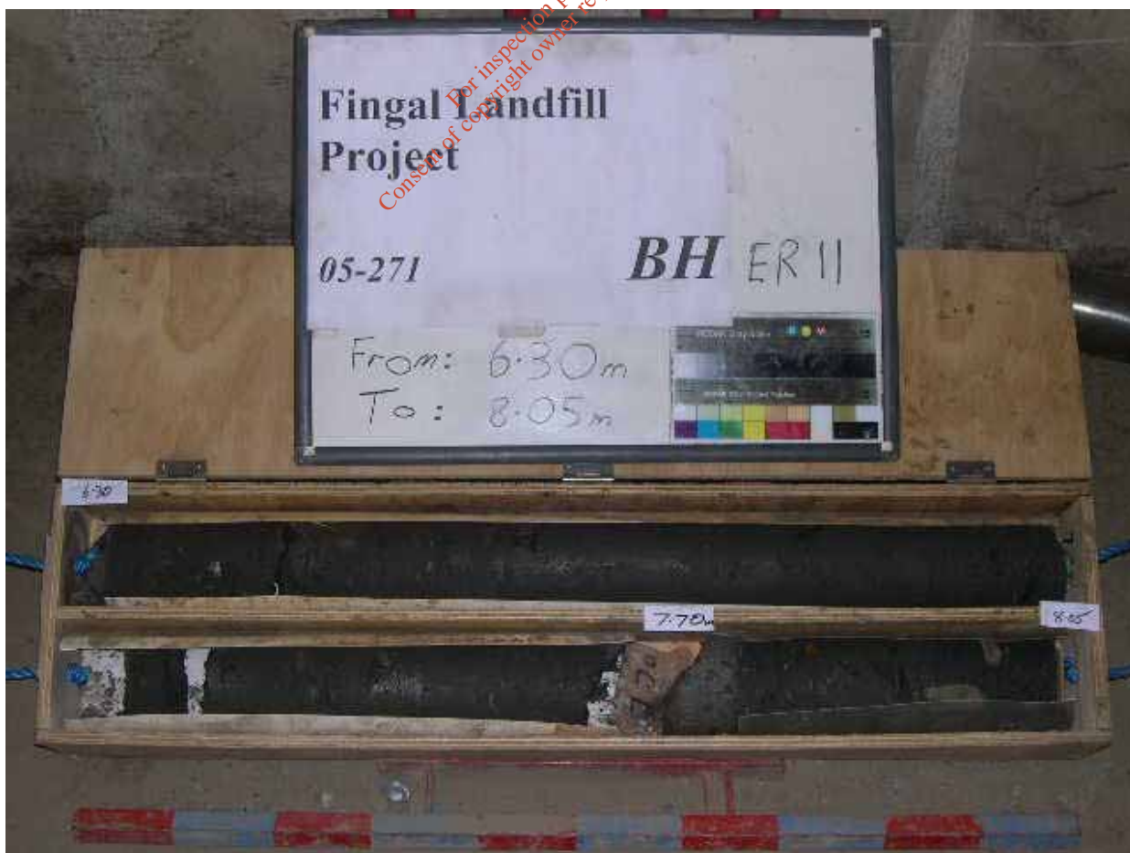
BH ER11: 6.30-8.05m