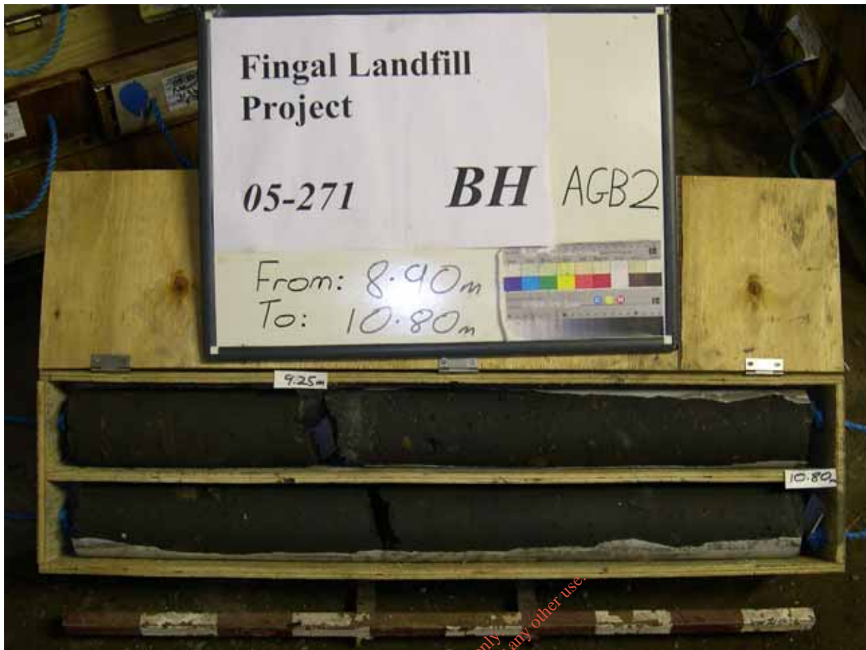
BH AGB2: 8.90-10.80m