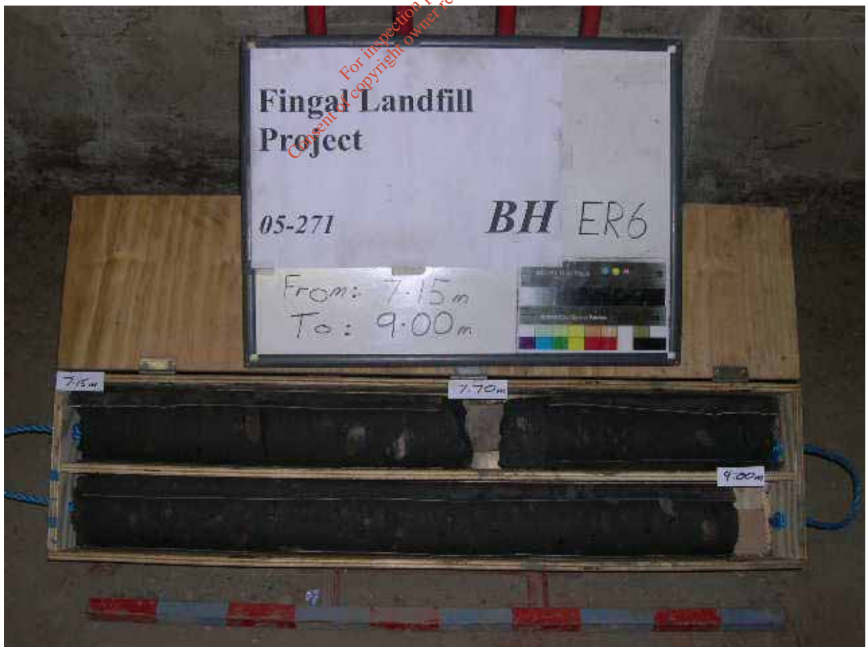
BH ER6: 7.15-9.00m