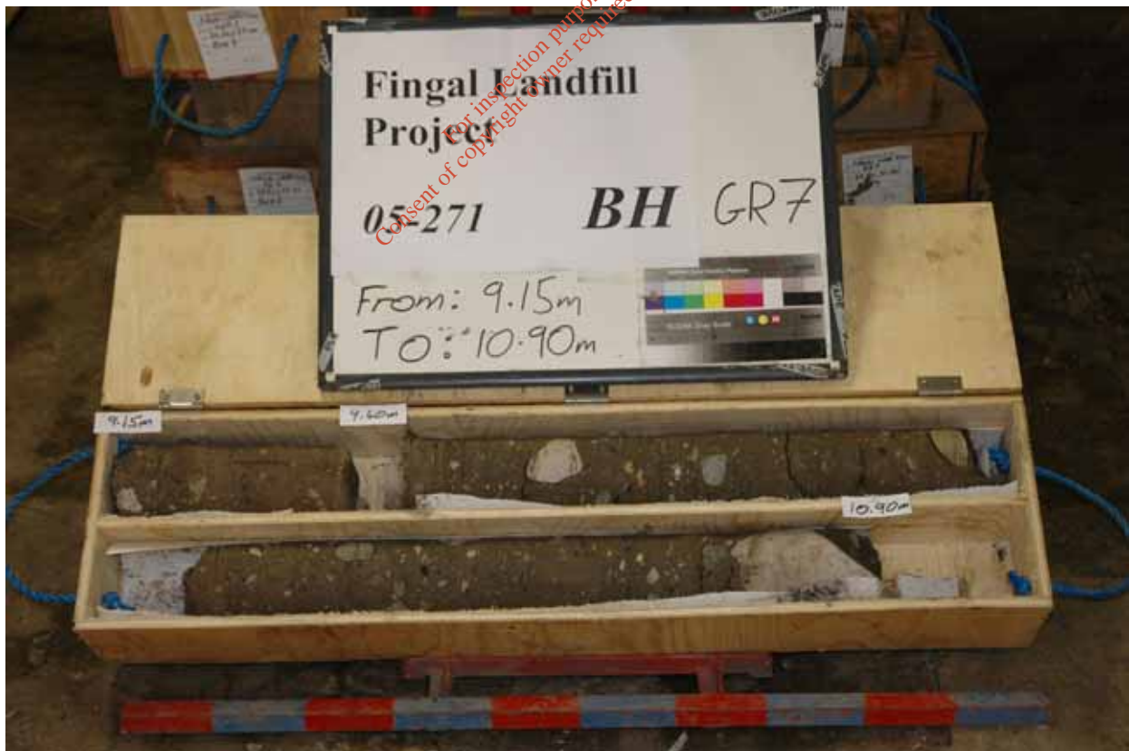
BH GR7: 9.15-10.90m