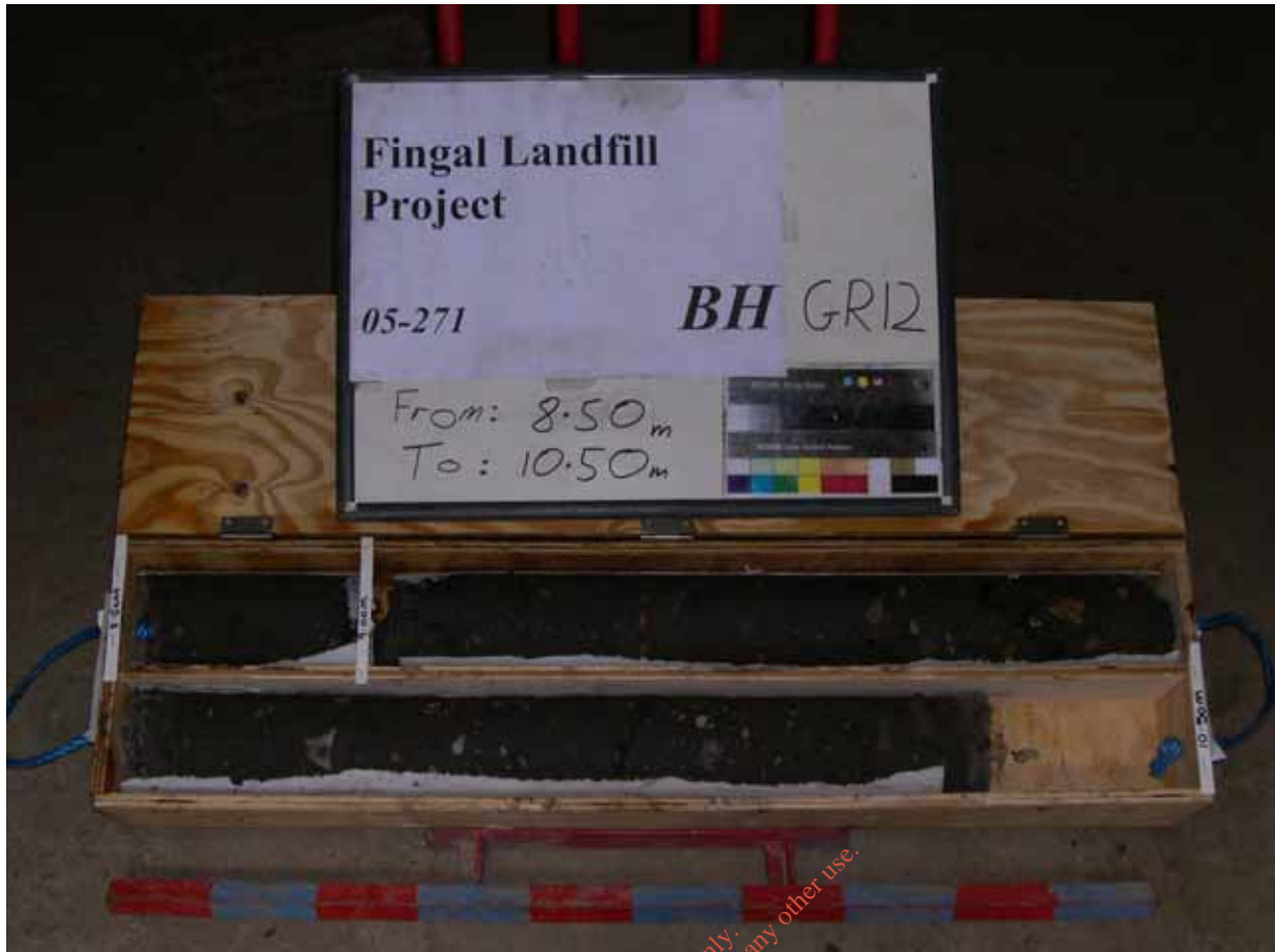
BH GR12: 8.50-10.50m