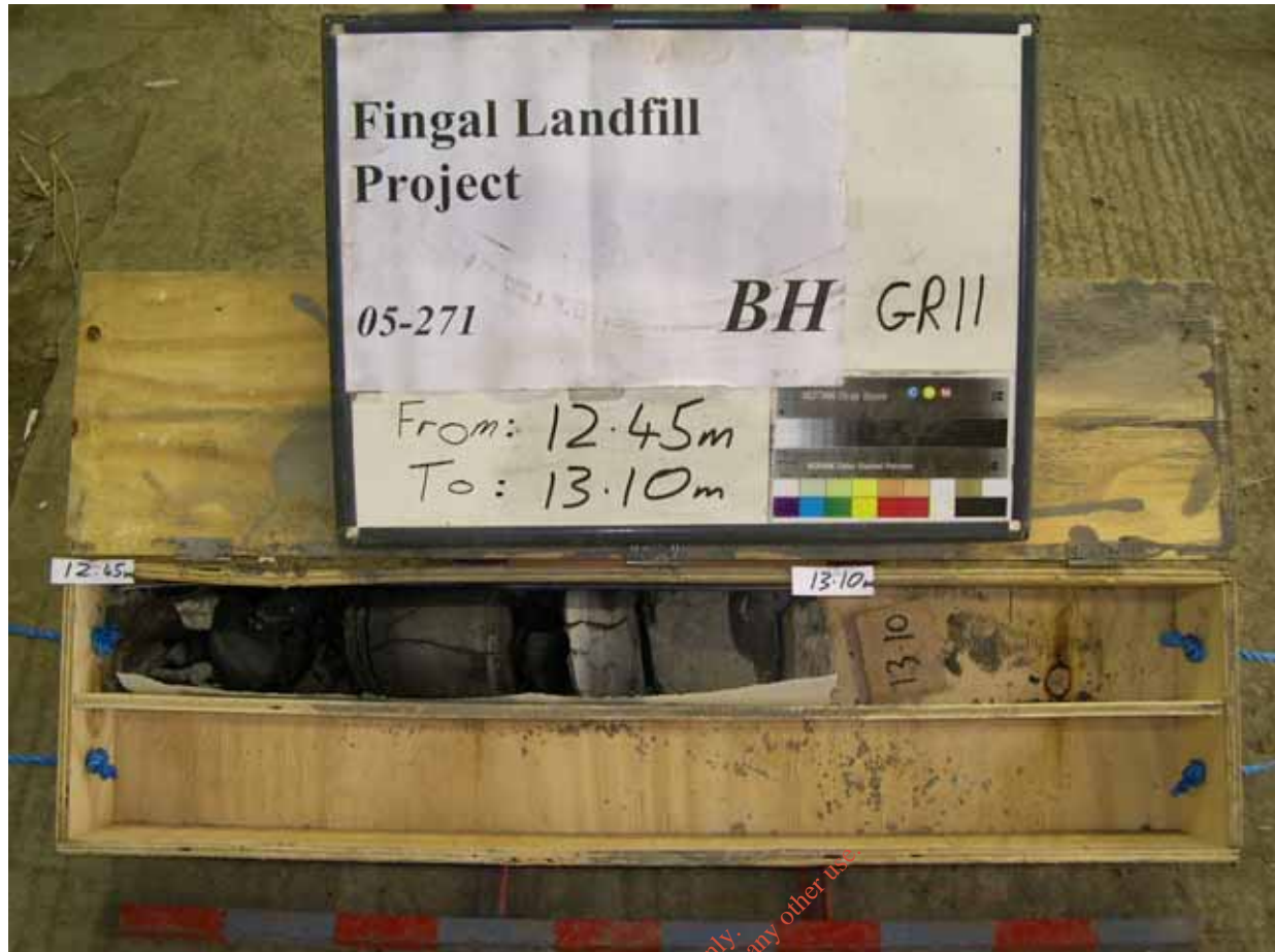
BH GR11: 12.45-13.10m

For inspection purposes only. Consent of copyright owner required for any other use.