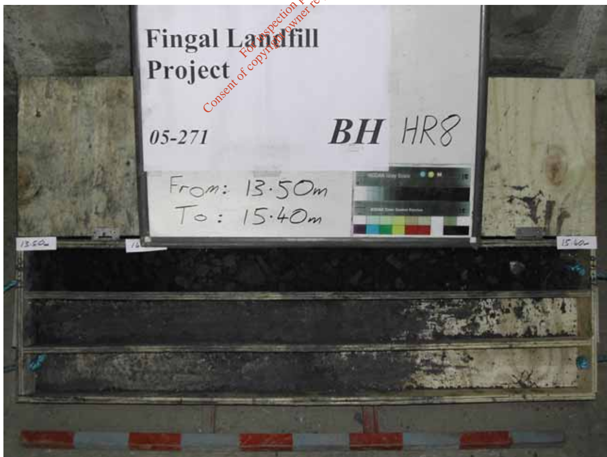
BH HR8: 13.50-15.40m