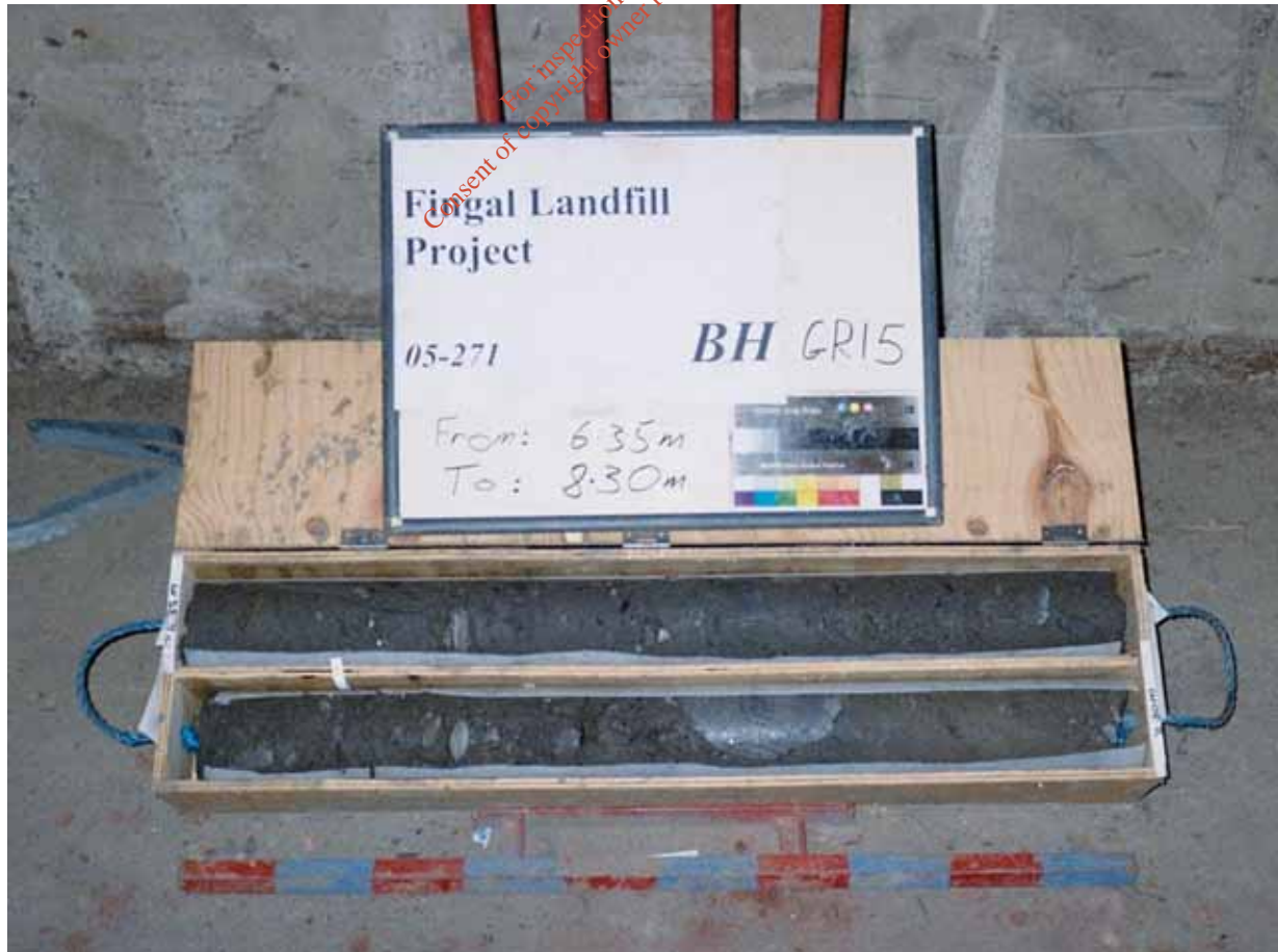
BH GR15: 6.35-8.30m