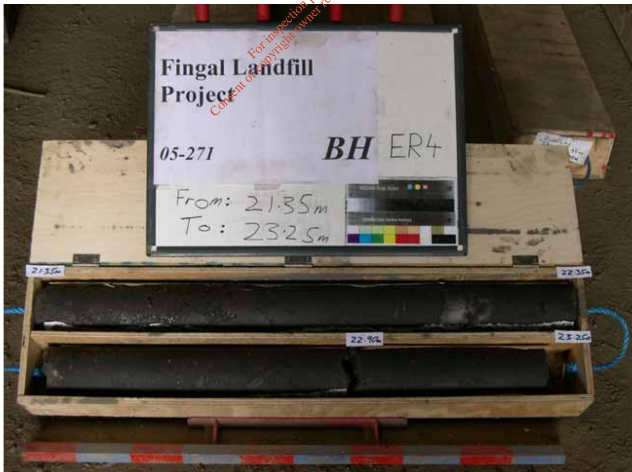
BH ER4: 21.35-23.25m