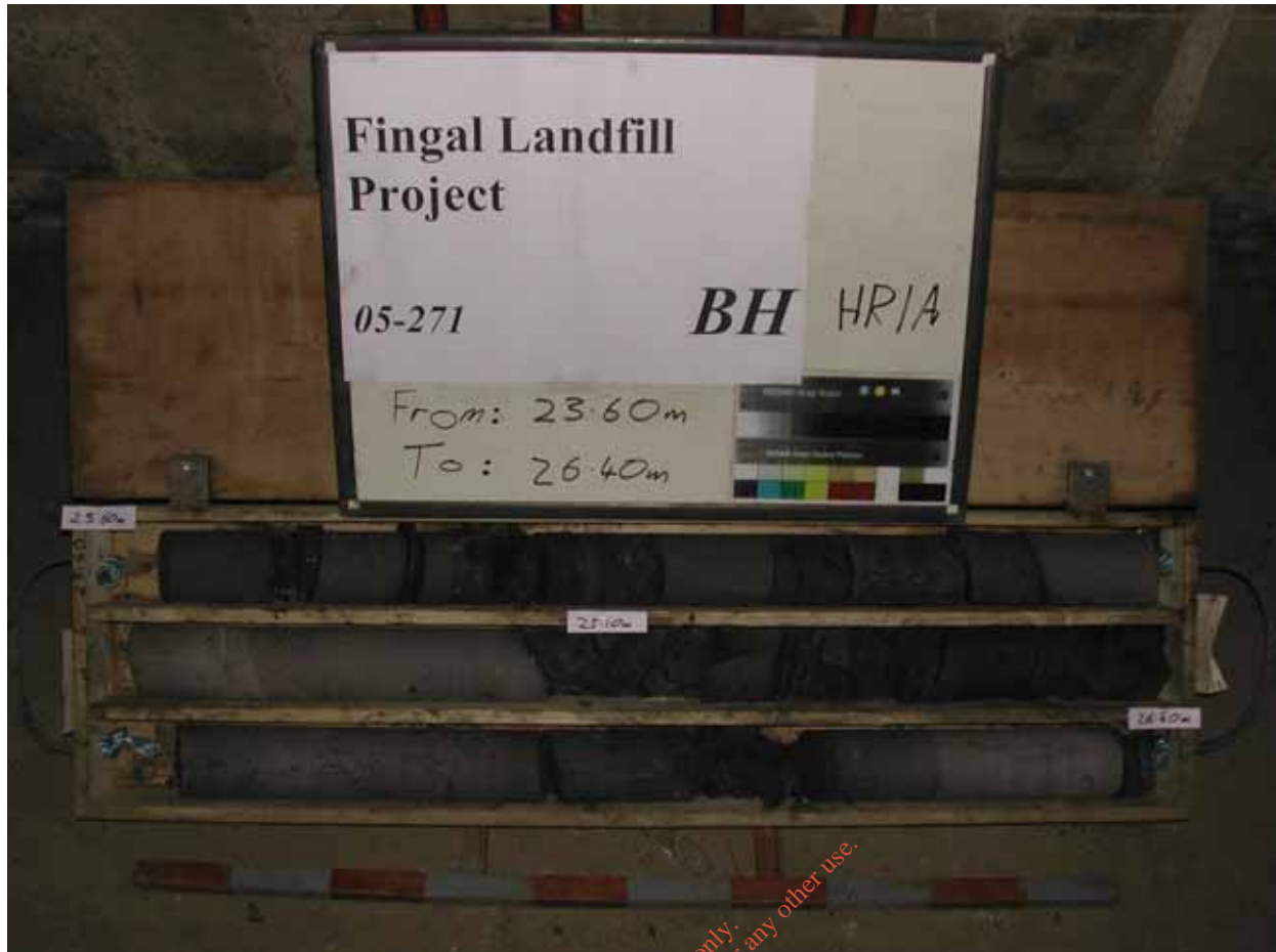
BH HR1A: 23.60-26.40m