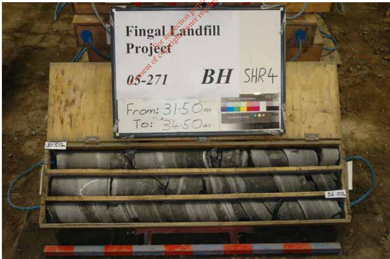
BH SHR4: 31.50-34.50m