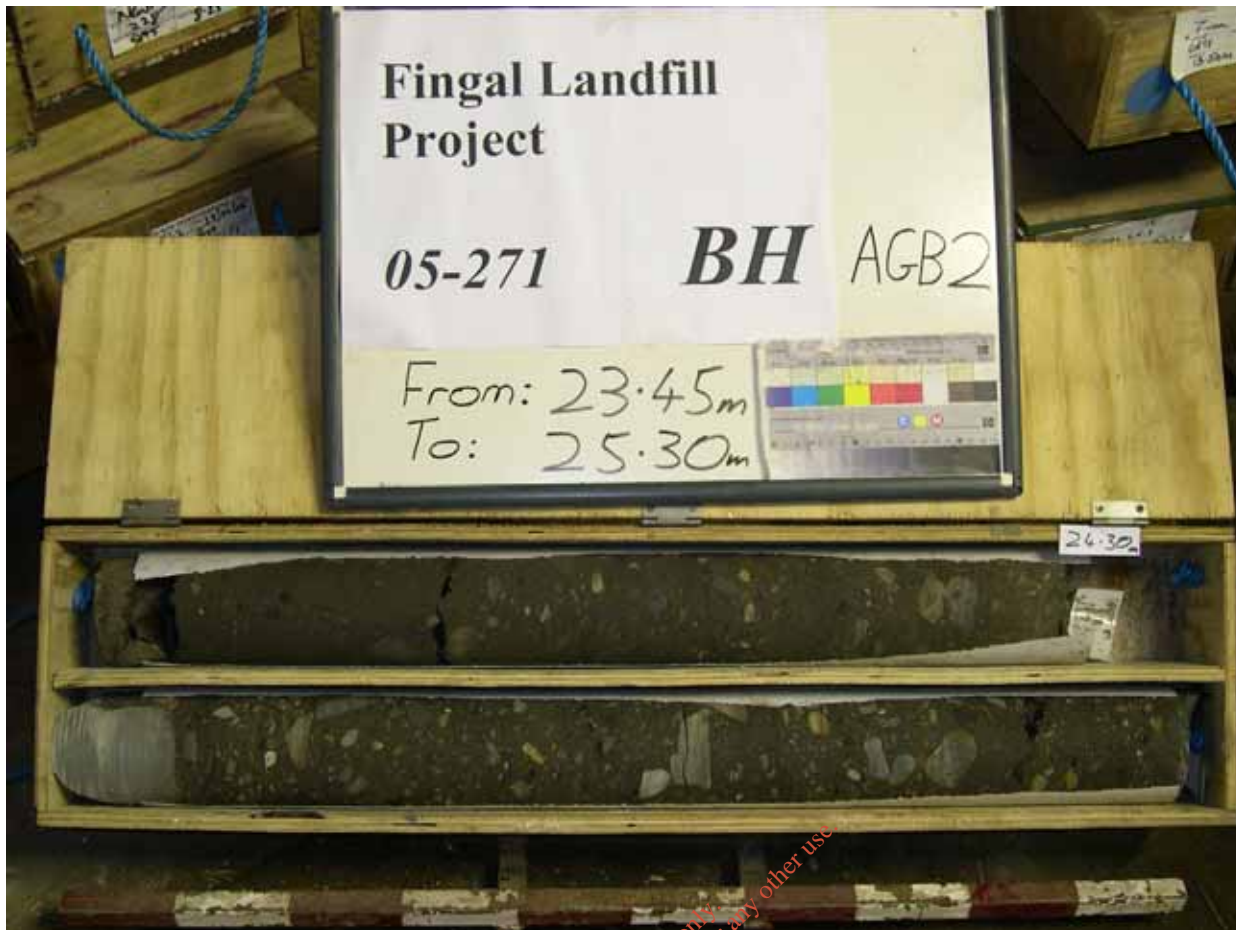
BH AGB2: 23.45-25.30m