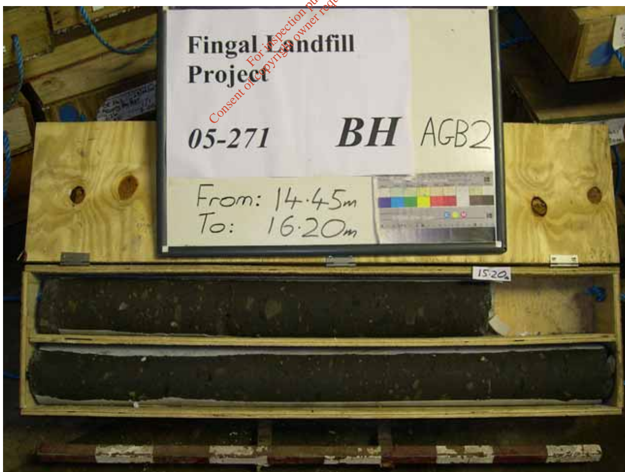
BH AGB2: 14.45-16.20m