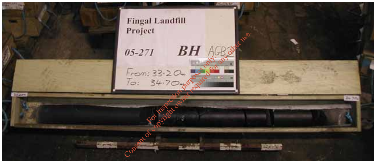
BH AGB2: 33.20-34.70m