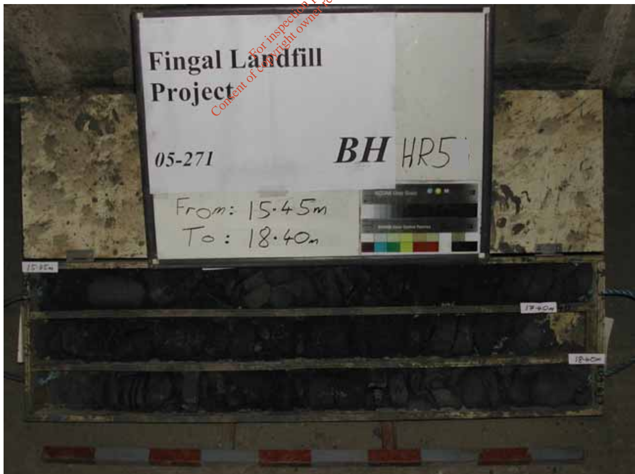
BH HR5: 15.45-18.40m