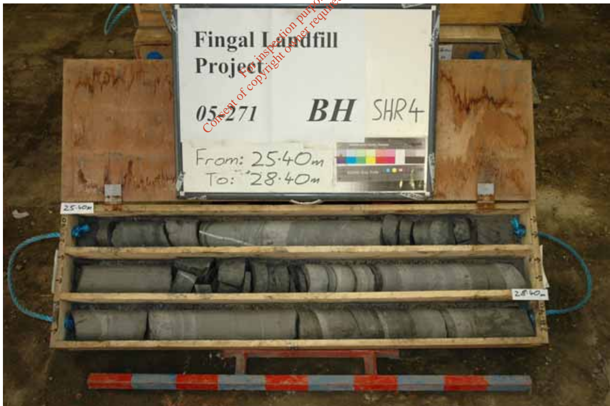
BH SHR4: 25.40-28.40m