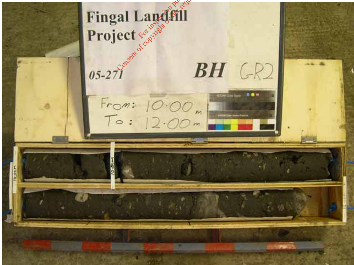
BH GR02: 10.00-12.00m