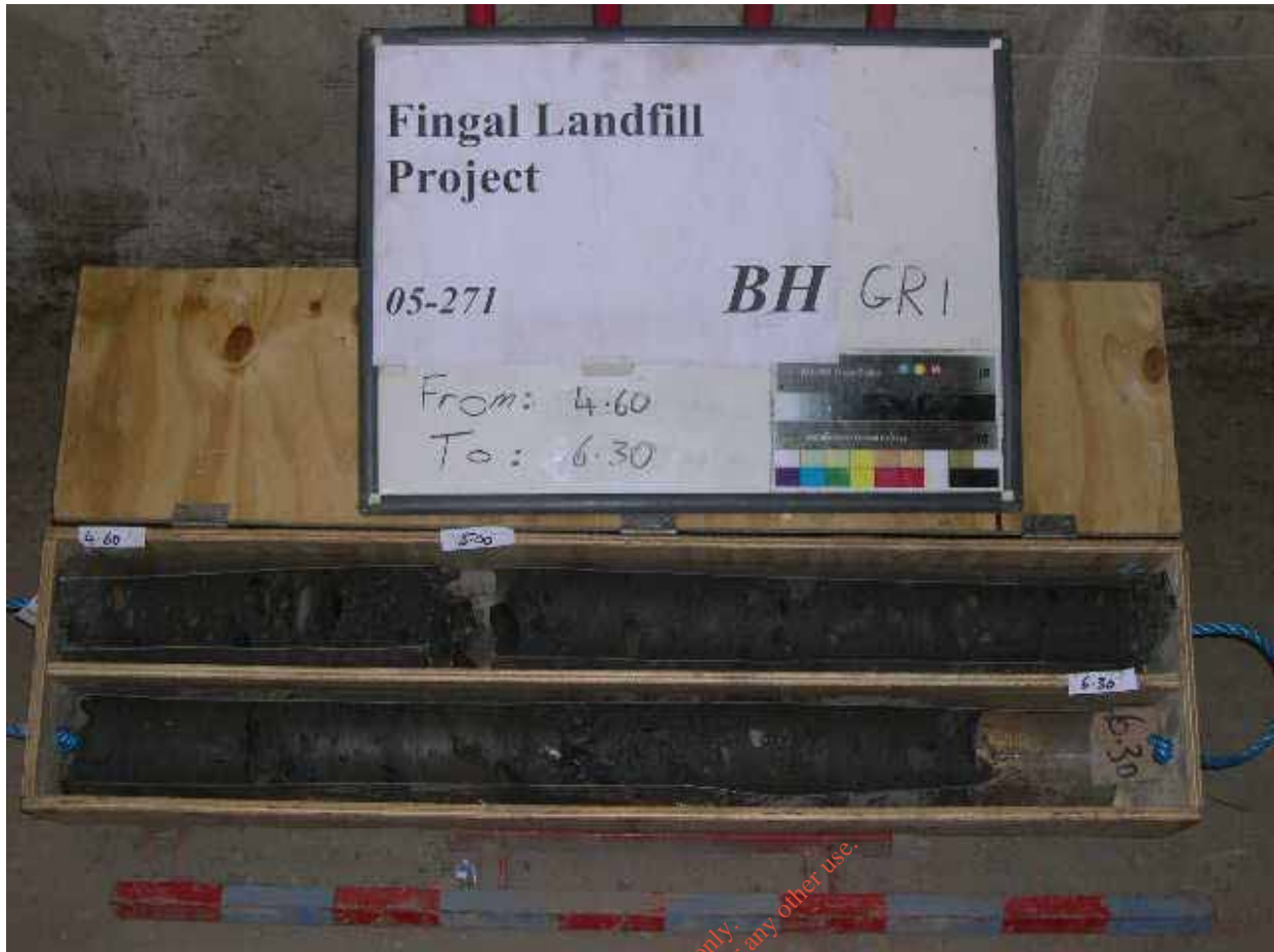
BH GR1: 4.60-6.30m