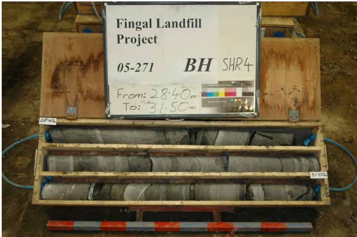
BH SHR4: 28.40-31.50m