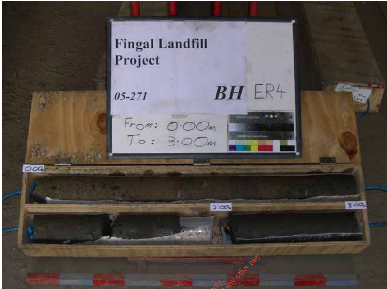
BH ER4: 0.00-3.00m