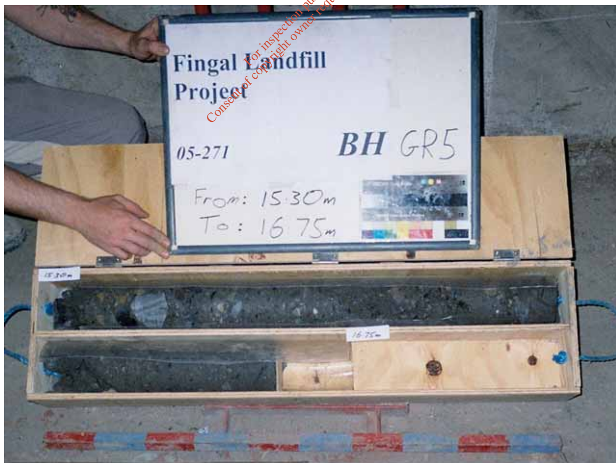
BH GR5: 15.30-16.75m