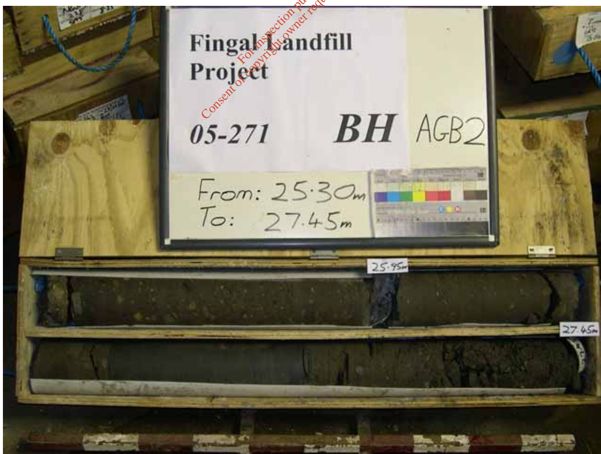
BH AGB2: 25.30-27.45m