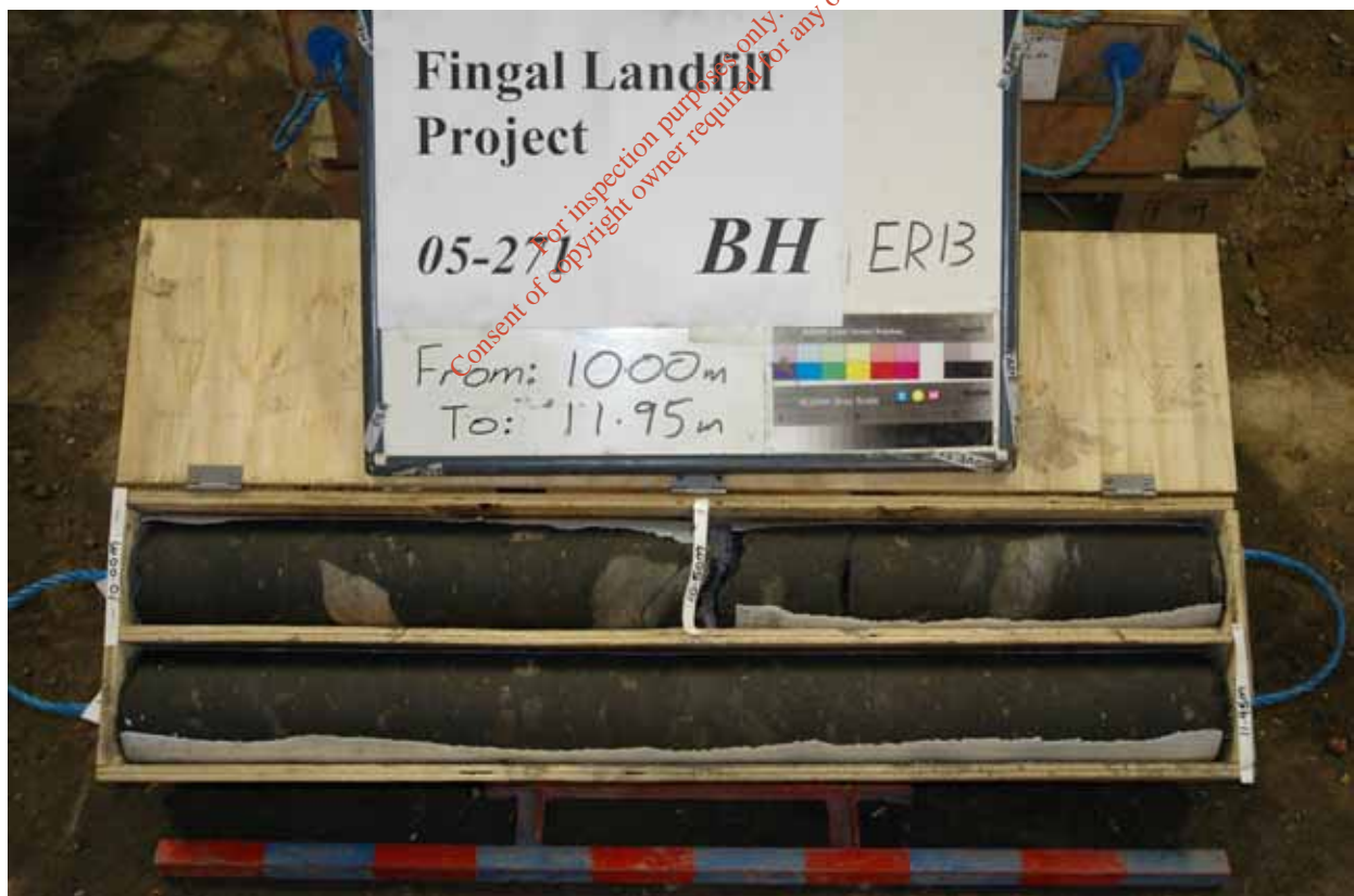
BH ER13: 10.00-11.95m