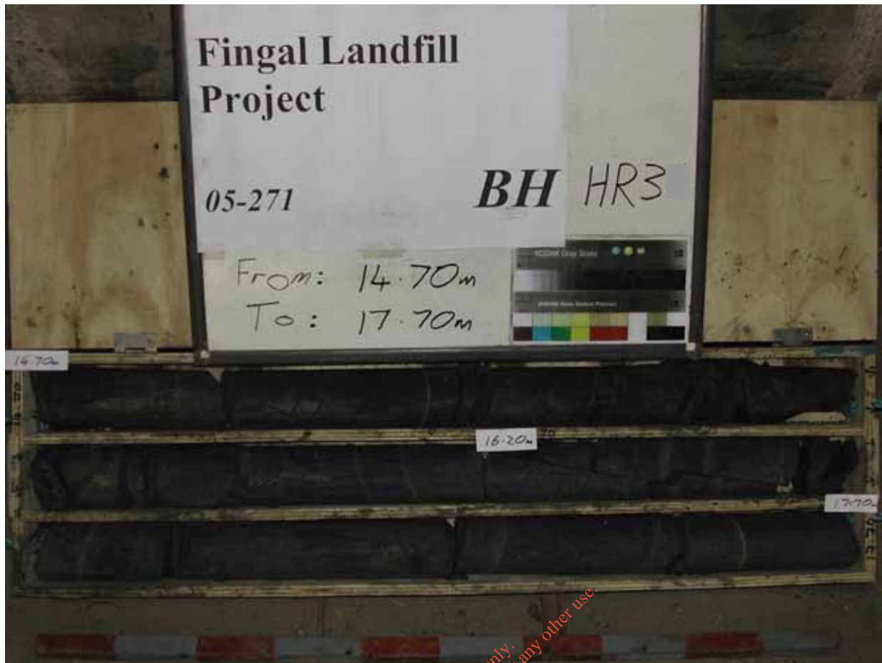
BH HR3: 14.70-17.70m