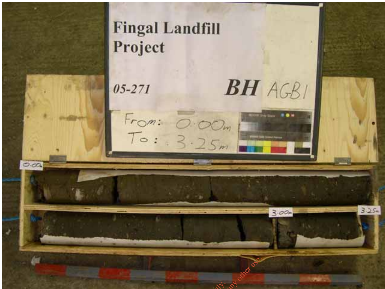
BH AGB1: 0.00-3.25m