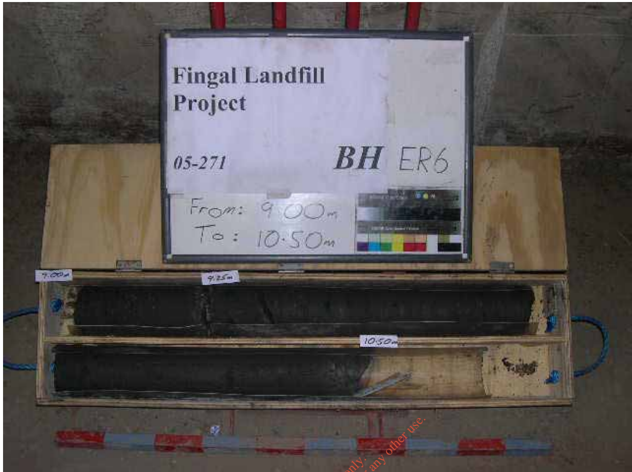
BH ER6: 9.00-10.50m