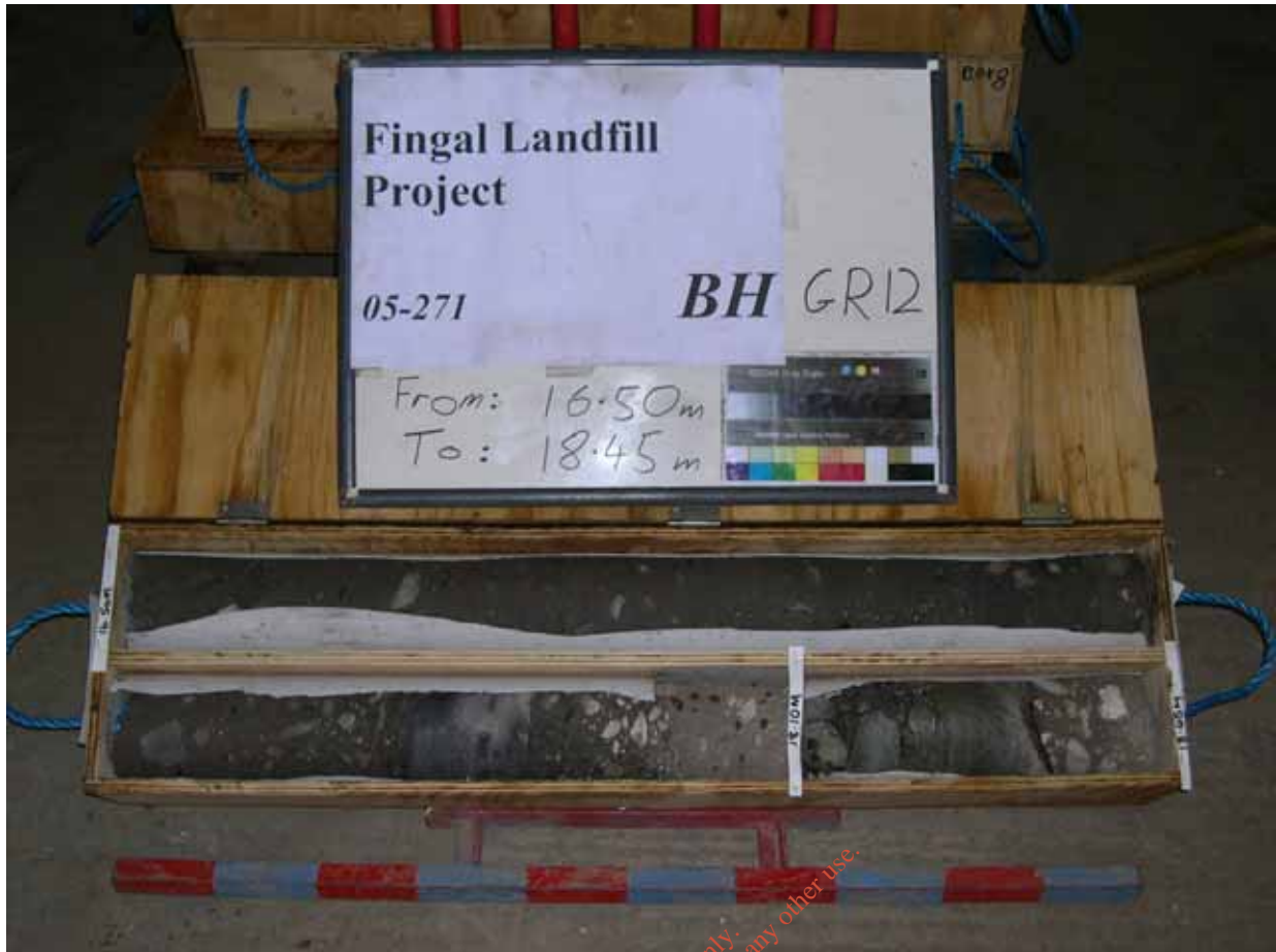
BH GR12: 16.50-18.45m