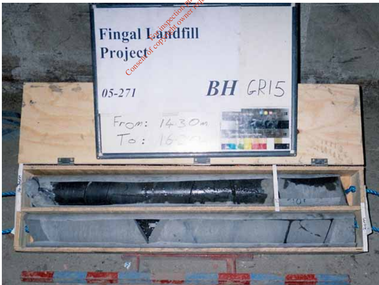
BH GR15: 14.30-16.20m