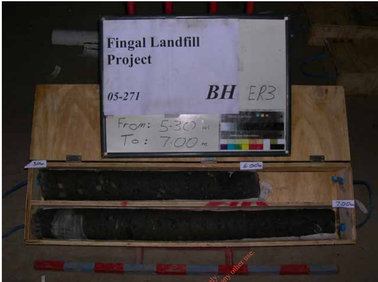
BH ER3: 5.30-7.00m