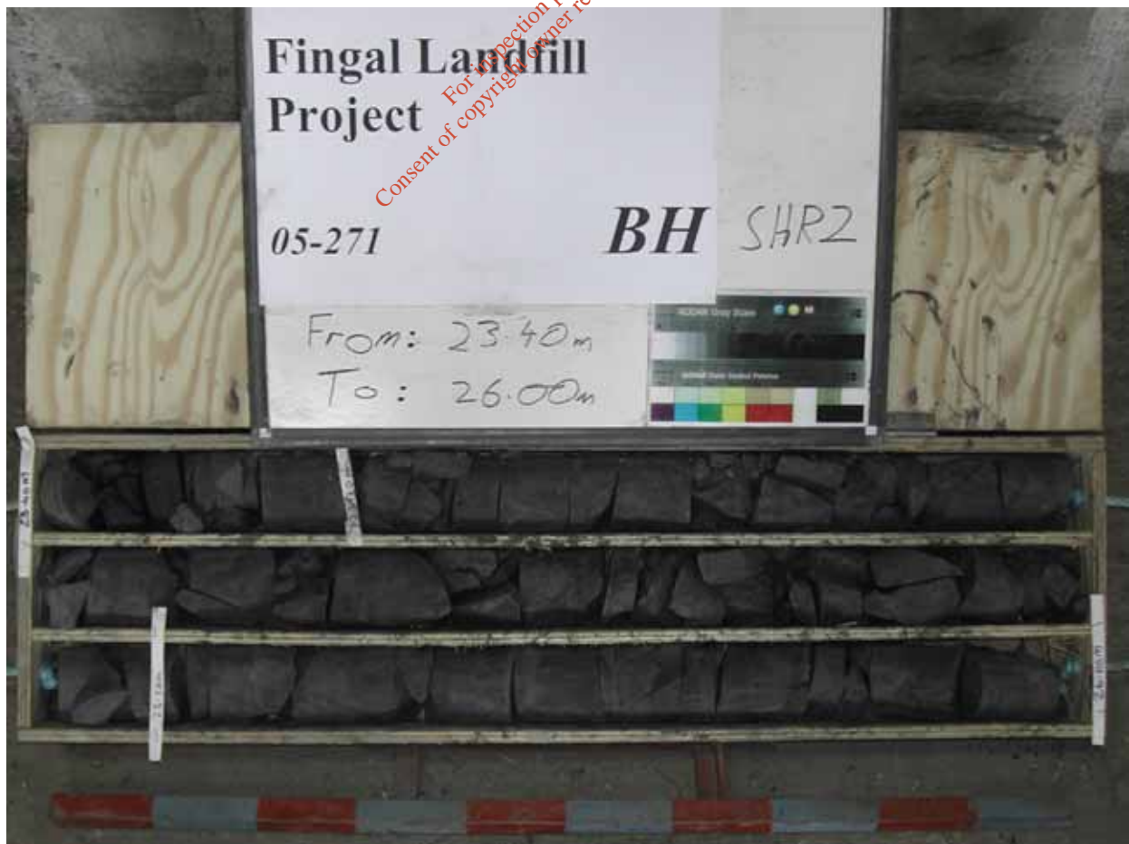
BH SHR2: 23.40-26.00m