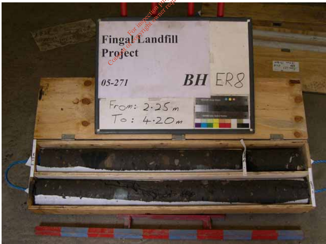
BH ER08: 2.25-4.20m