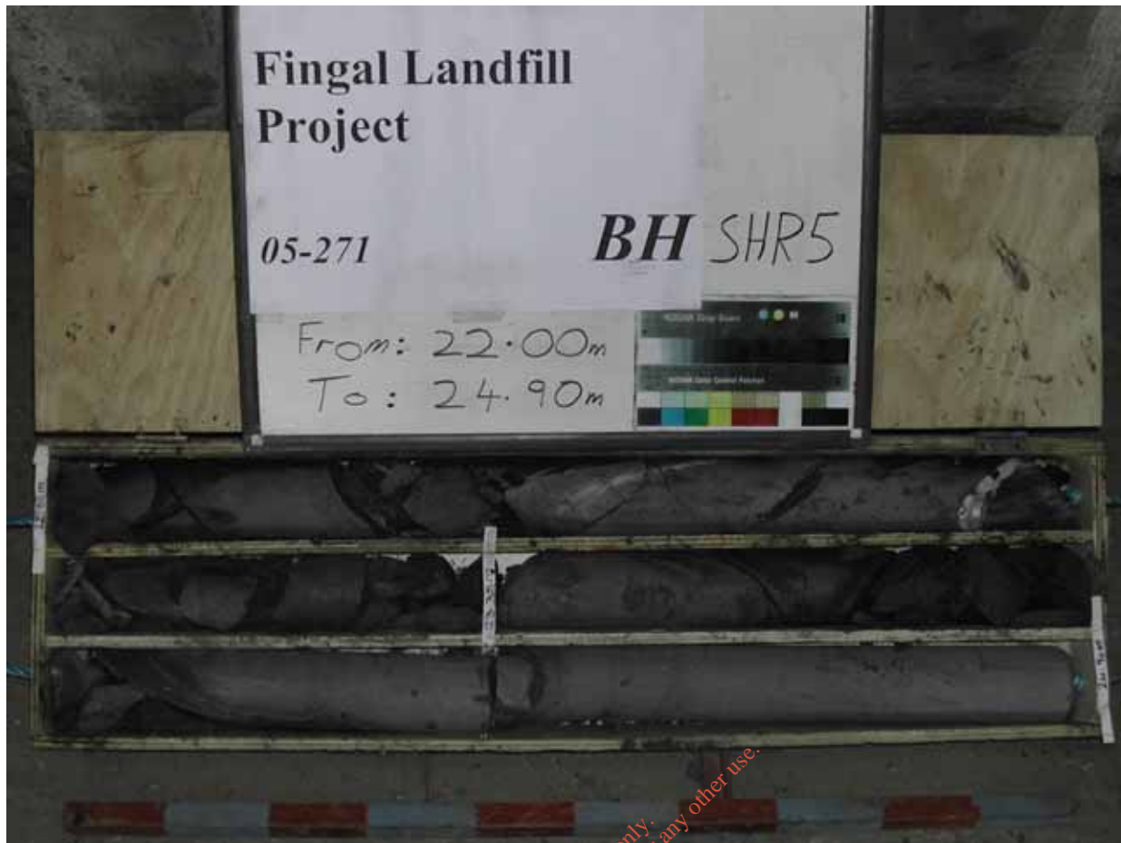
BH SHR5: 22.00-24.90m