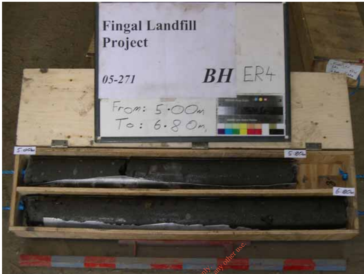
BH ER4: 5.00-6.80m