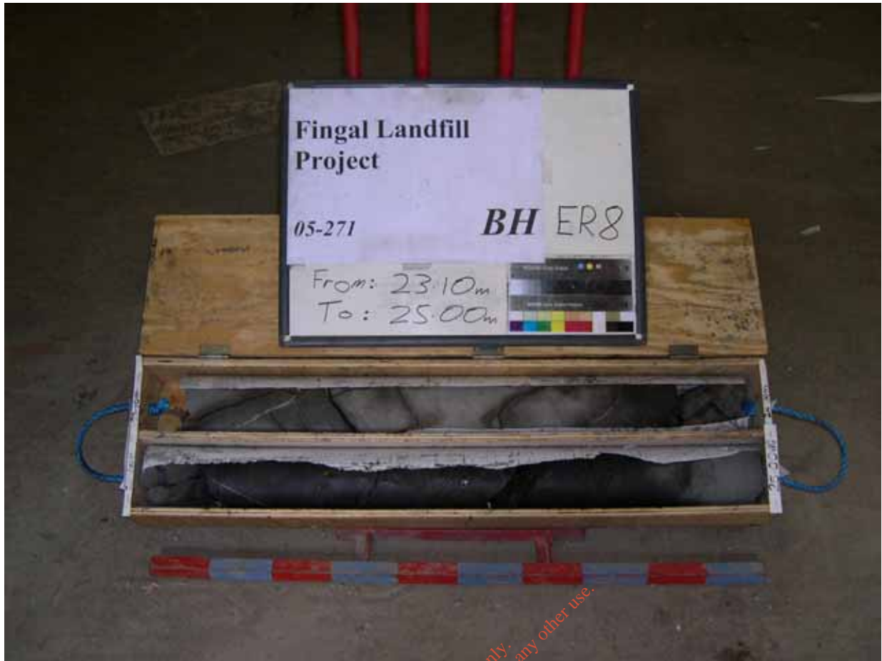
BH ER08: 23.10-25.00m