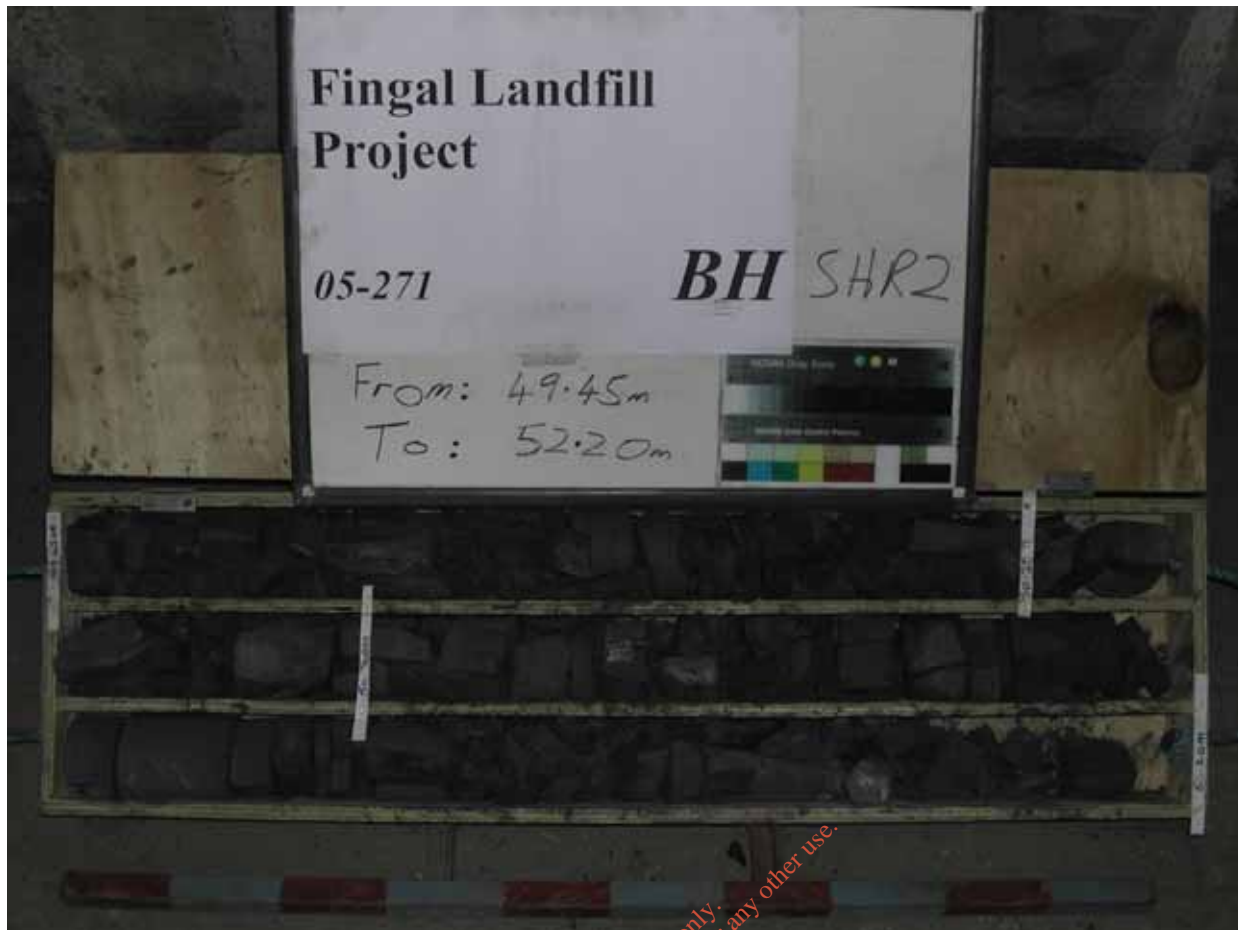
BH SHR2: 49.45-52.20m