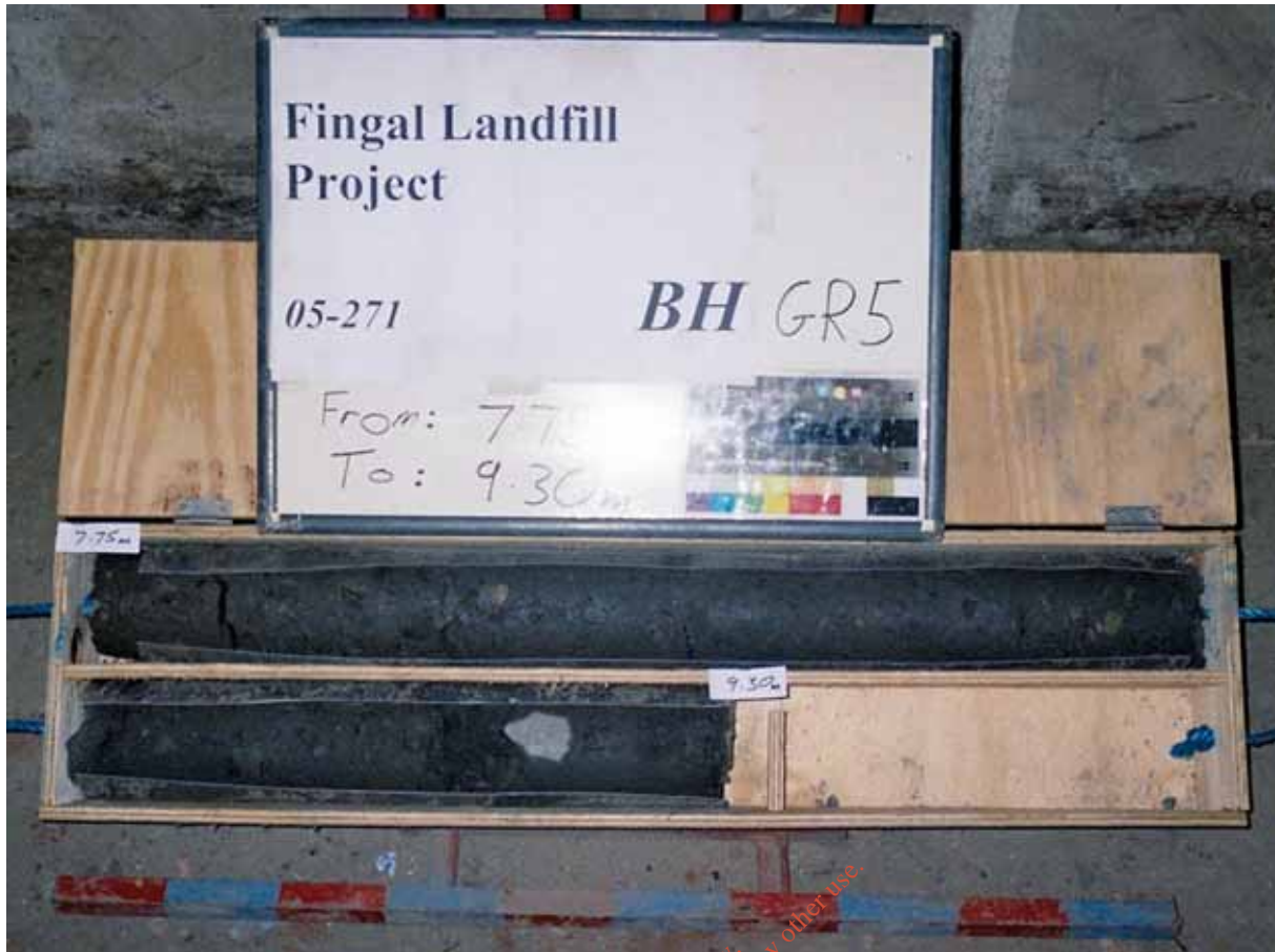
BH GR5: 7.75-9.30m