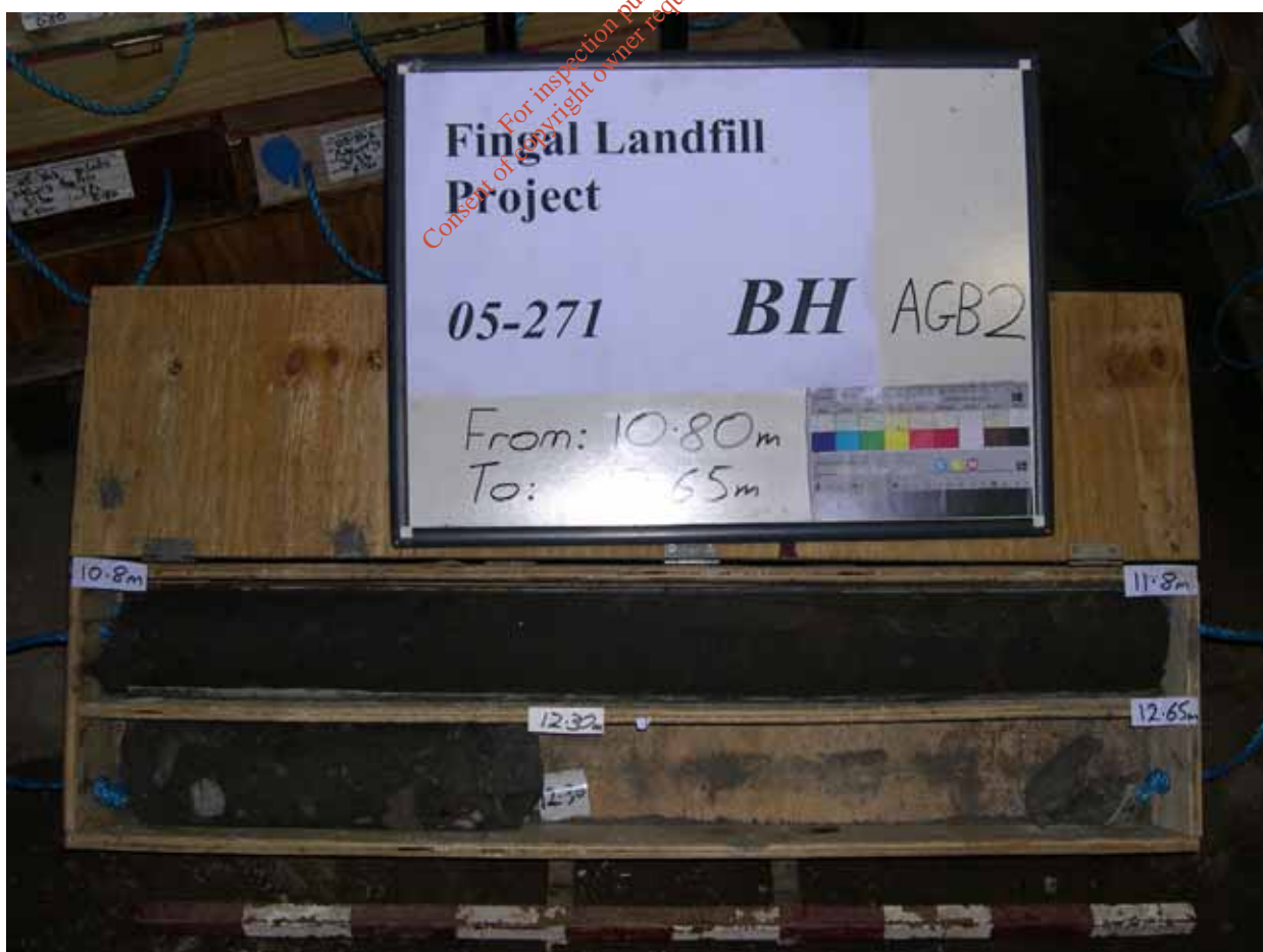
BH AGB2: 10.80-12.65m