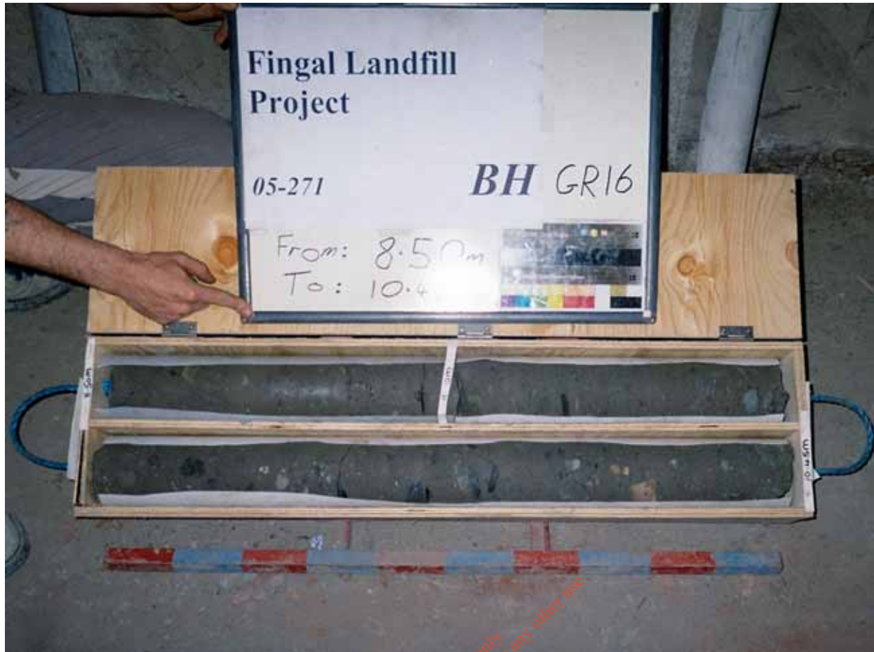
BH GR16: 8.50-10.45m