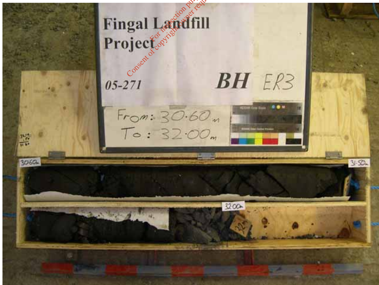
BH ER3: 30.60-32.00m