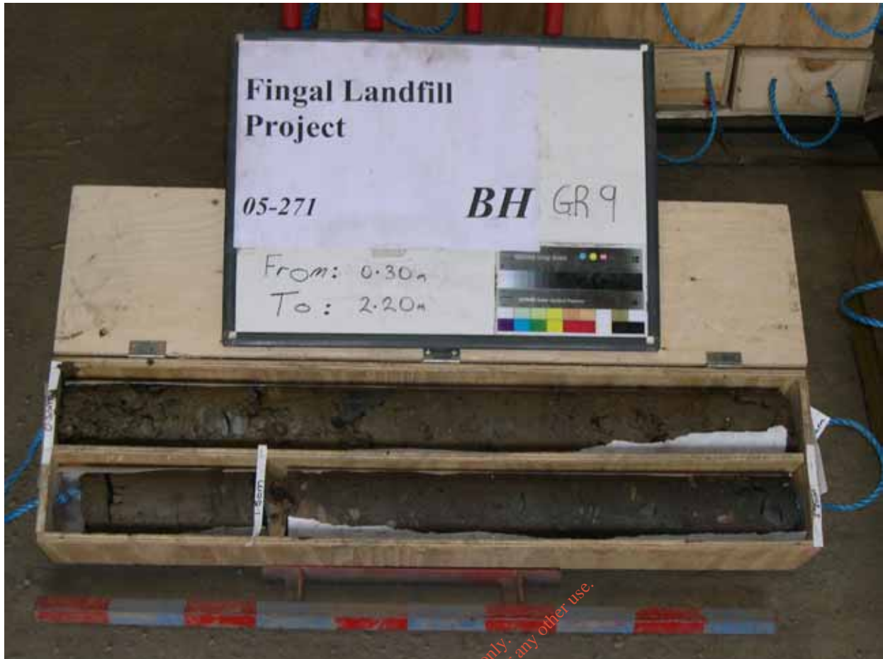
BH GR9: 0.30-2.20m