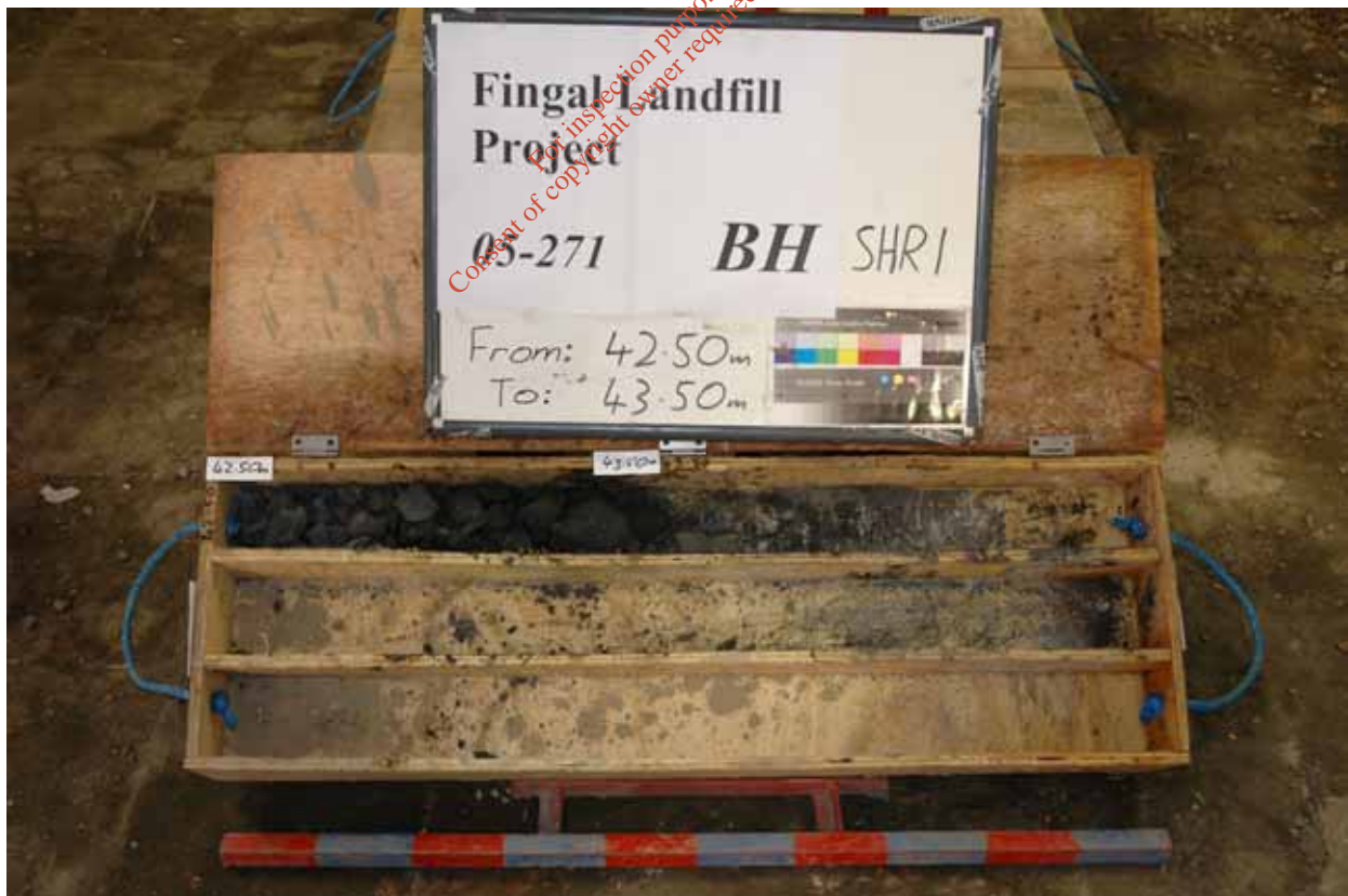
BH SHR1: 42.50-43.50m