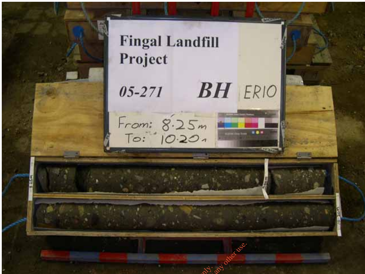
BH ER10: 8.25-10.20m