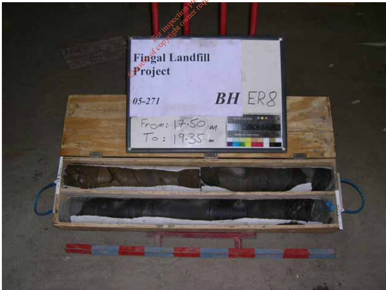
BH ER08: 17.50-19.35m