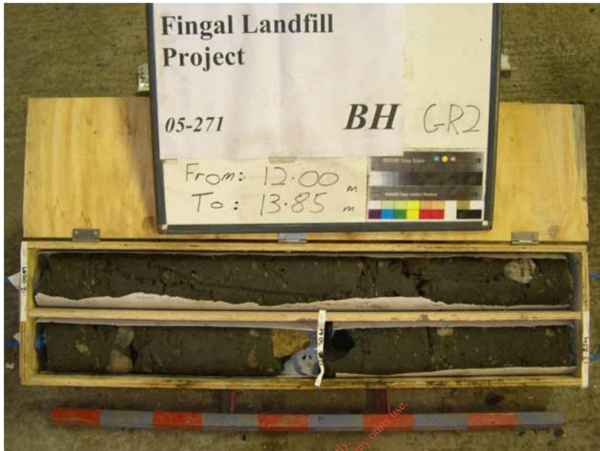
BH GR02: 12.00-13.85m