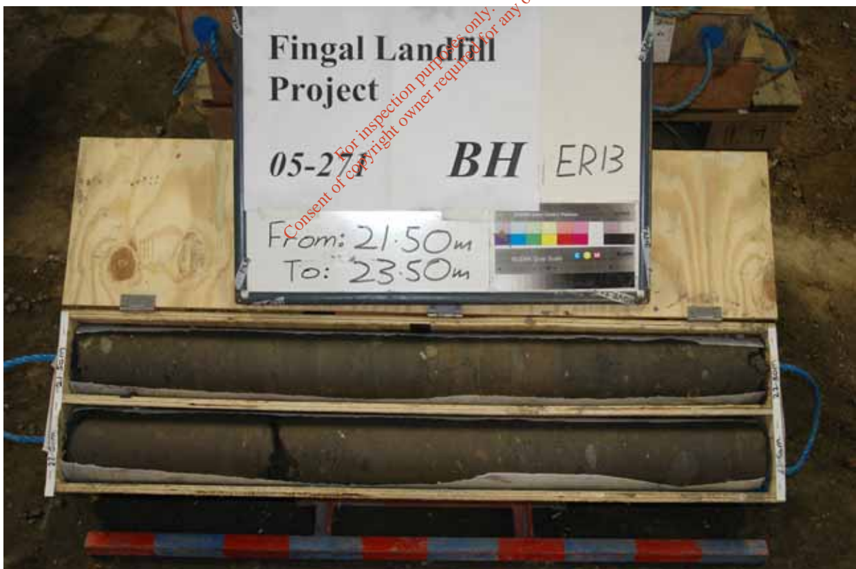
BH ER13: 21.50-23.50m