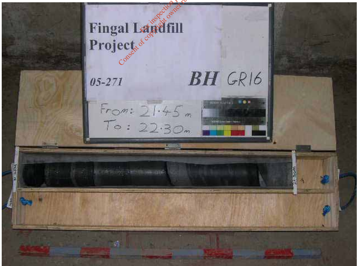
BH GR16: 21.45-22.30m