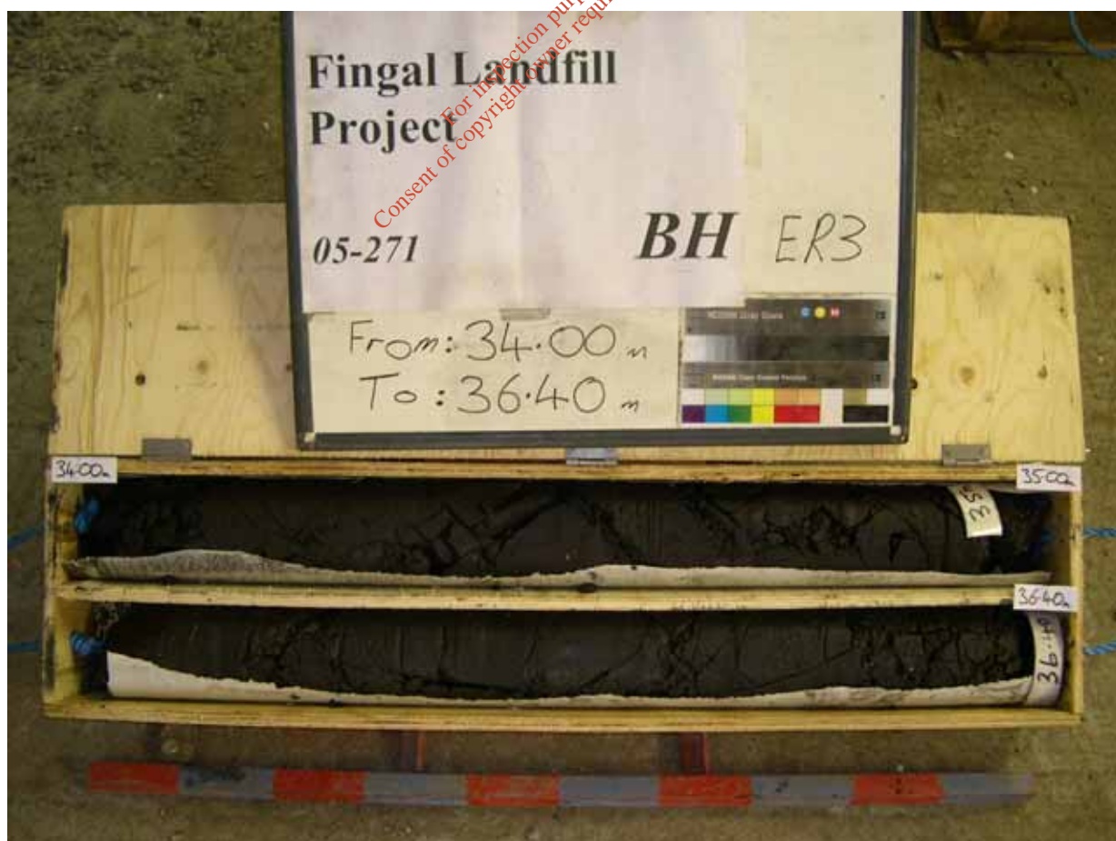
BH ER3: 34.00-36.40m