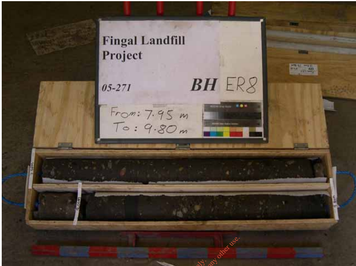
BH ER08: 7.95-9.80m