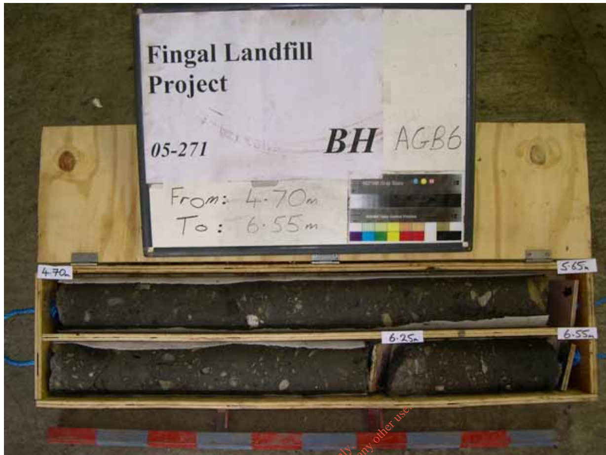
BH AGB6 4.70-6.55m