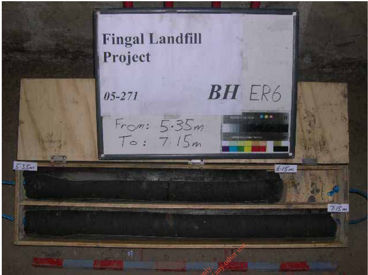
BH ER6: 5.35-7.15m