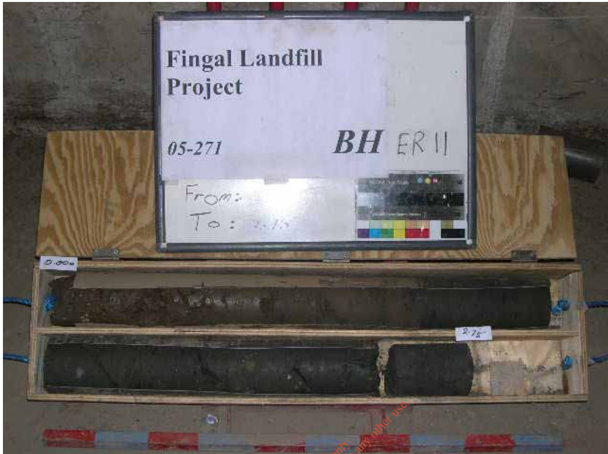
BH ER11: 0.00-2.75m