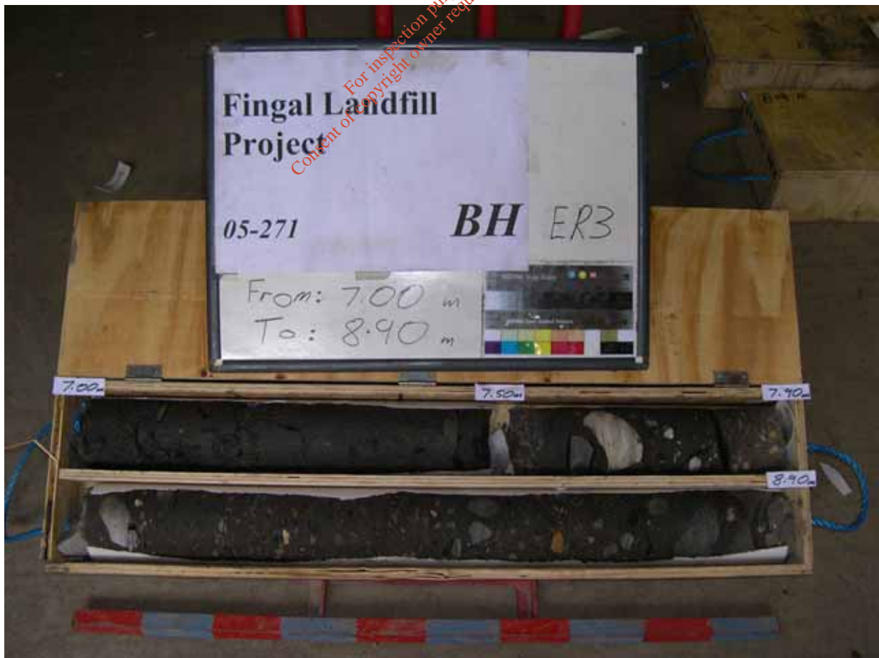
BH ER3: 7.00-8.90m