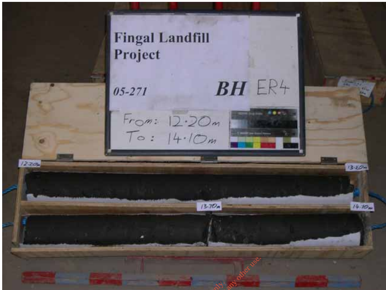
BH ER4: 12.20-14.10m