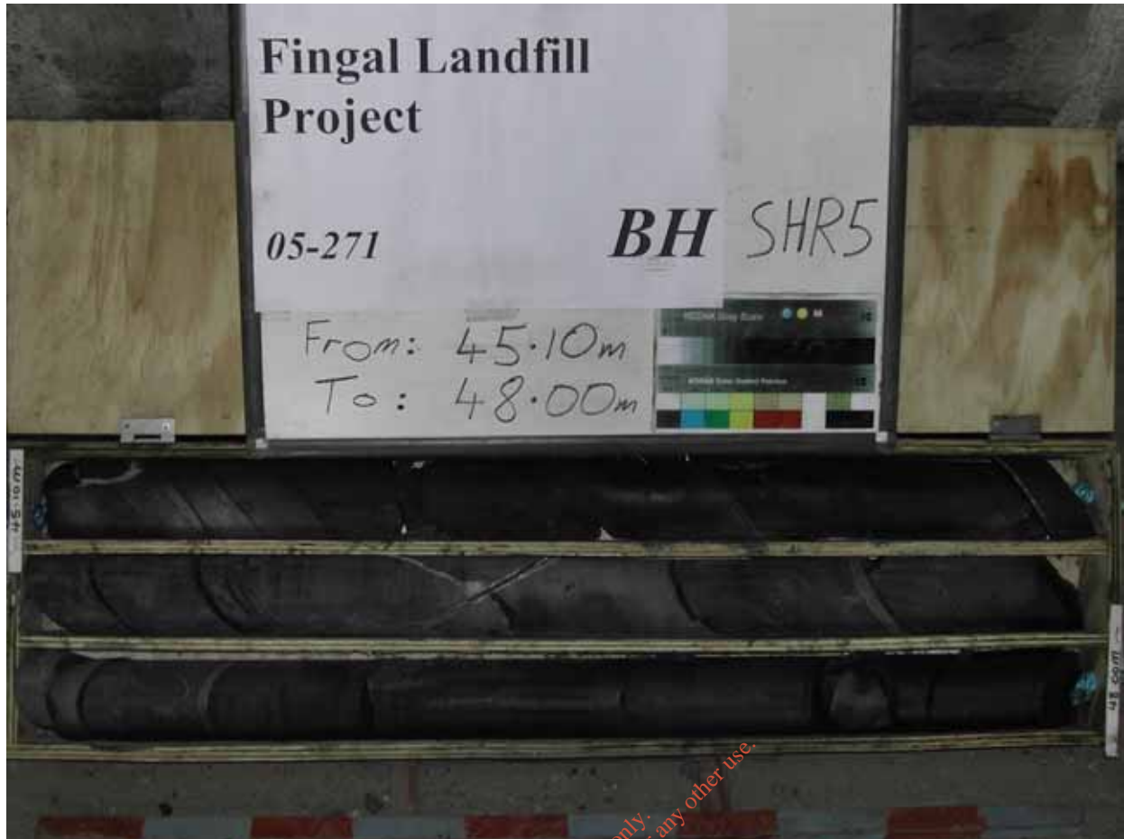
BH SHR5: 45.10-48.00m