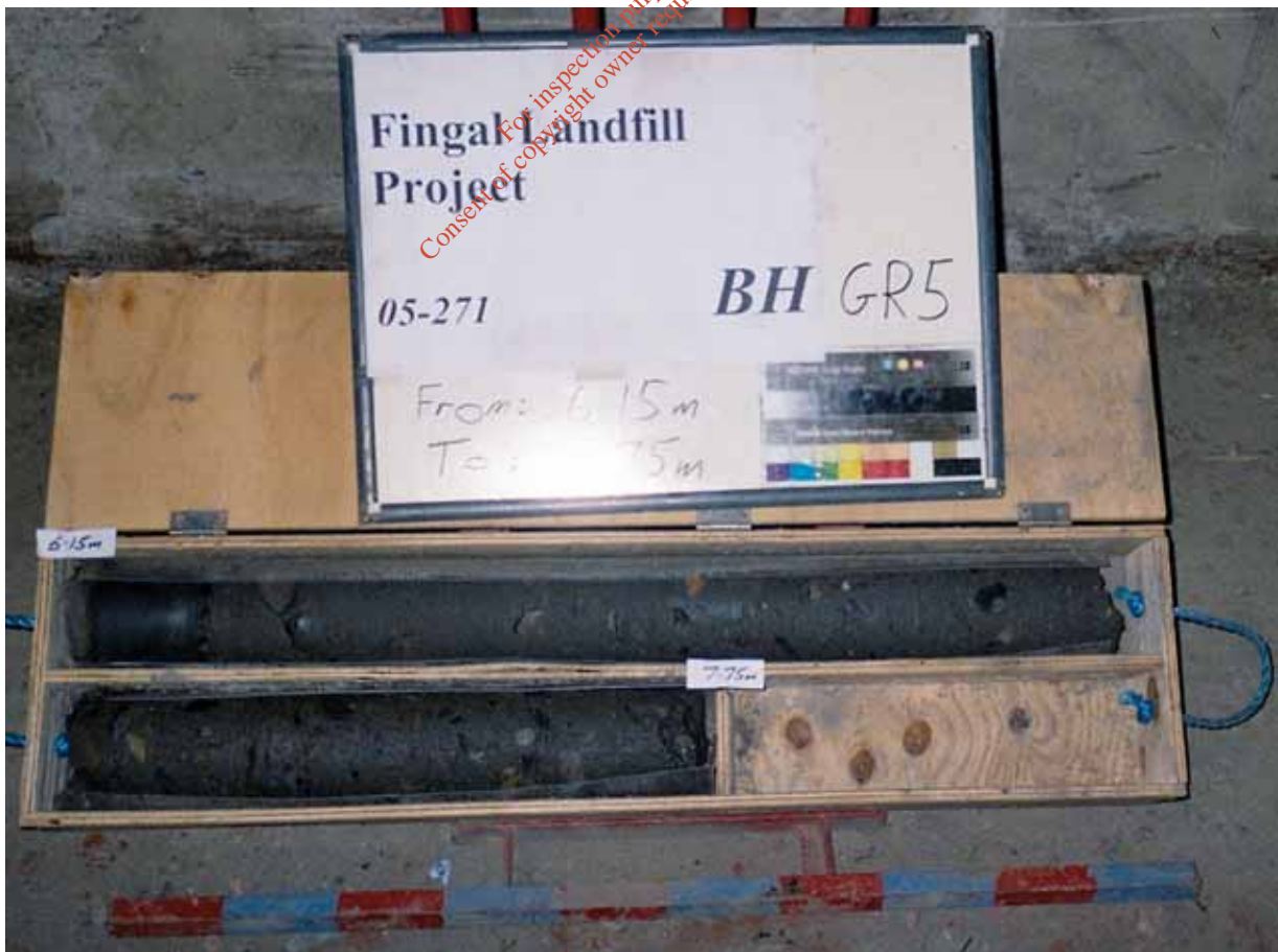
BH GR5: 6.15-7.75m