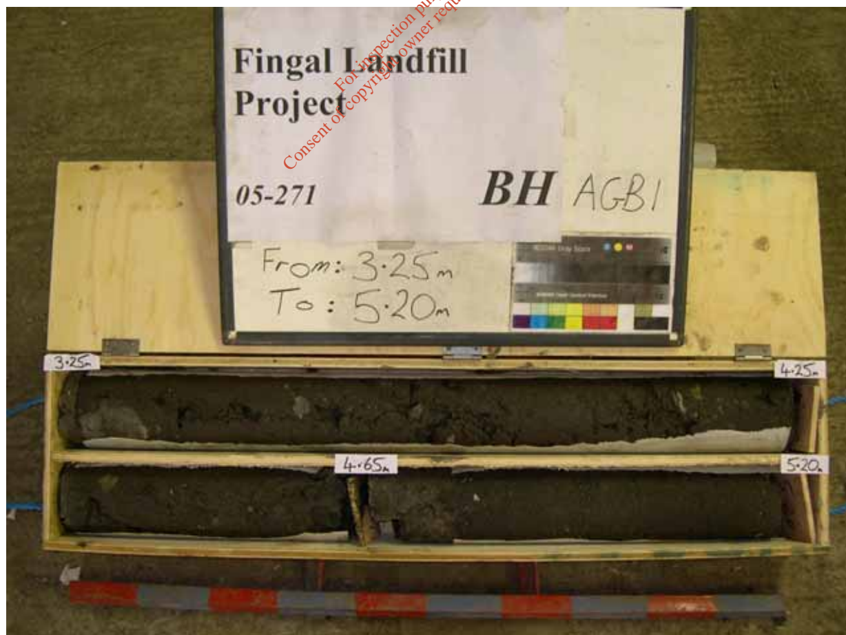
BH AGB1: 3.25-5.20m