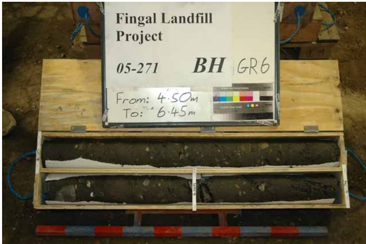
BH GR6: 4.50-6.45m