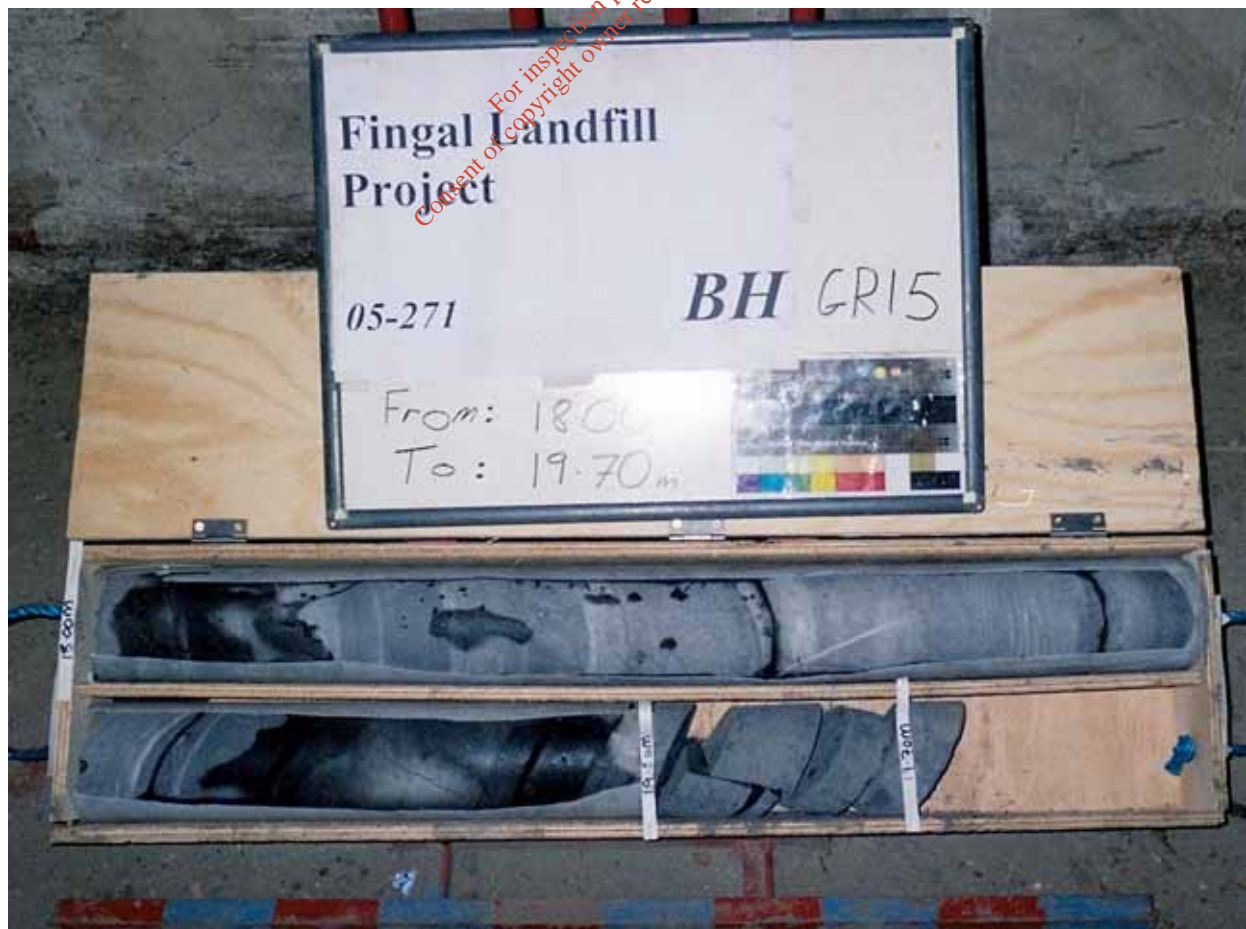
BH GR15: 18.00-19.70m