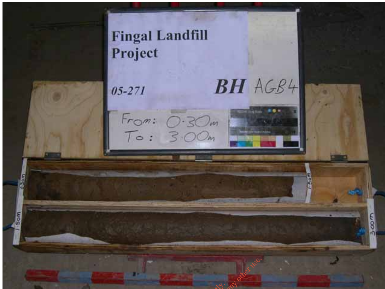
BH AGB4: 0.30-3.00m