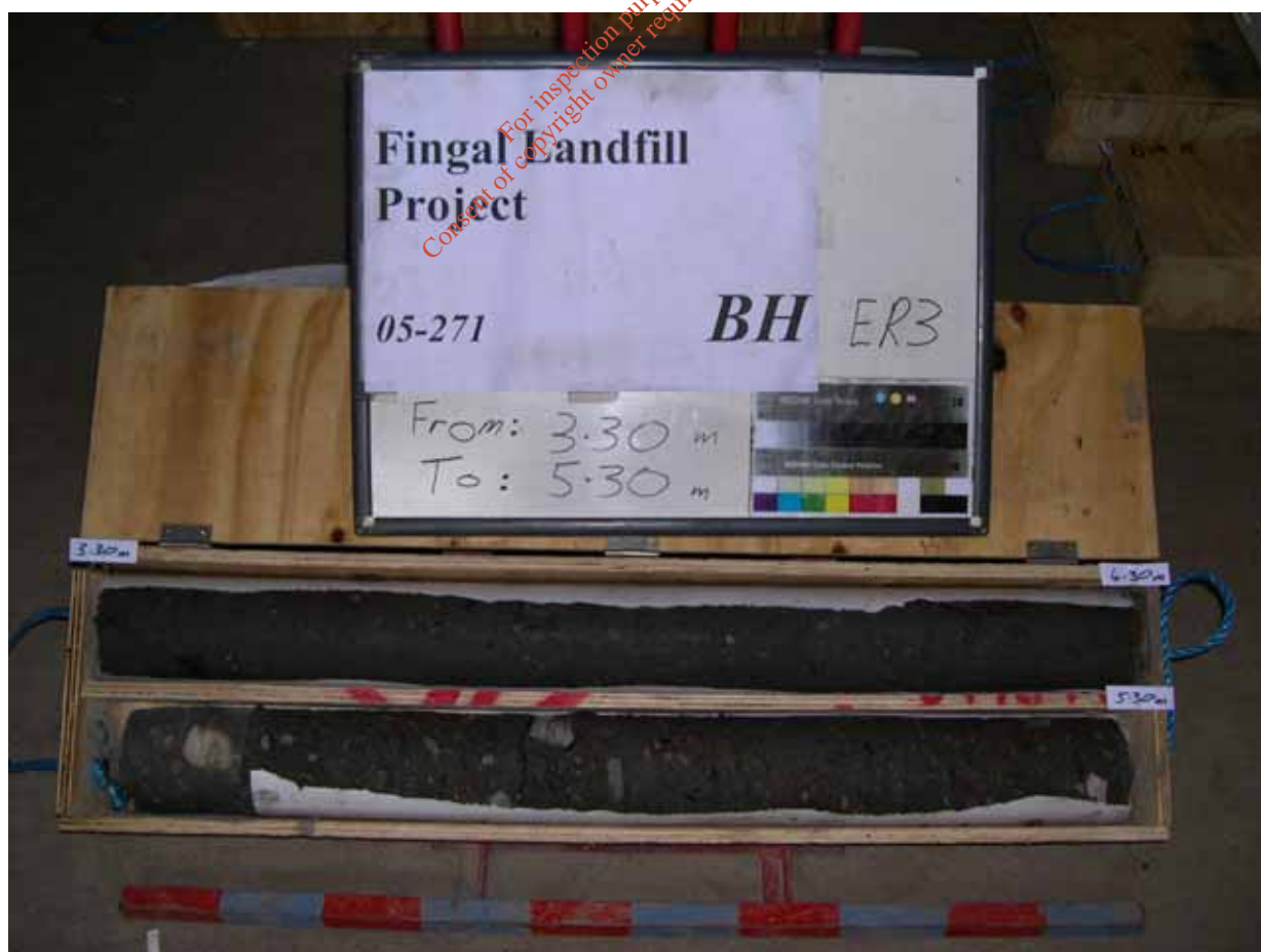
BH ER3: 3.30-5.30m