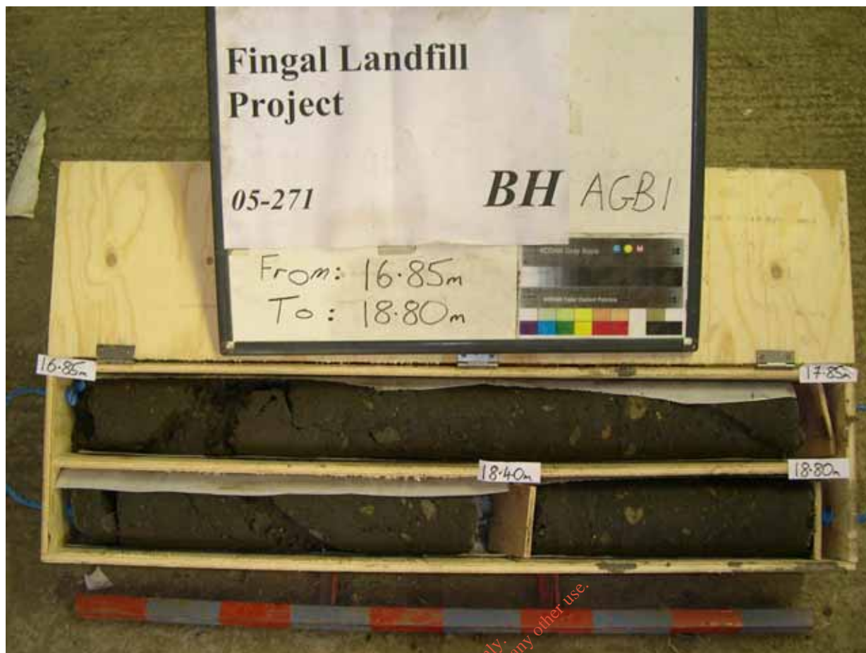
BH AGB1: 16.85-18.80m