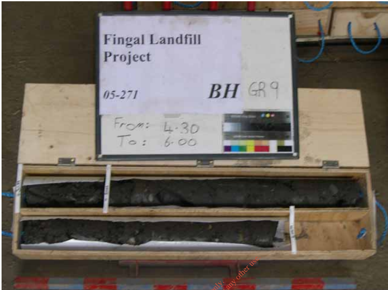
BH GR9: 4.30-6.00m