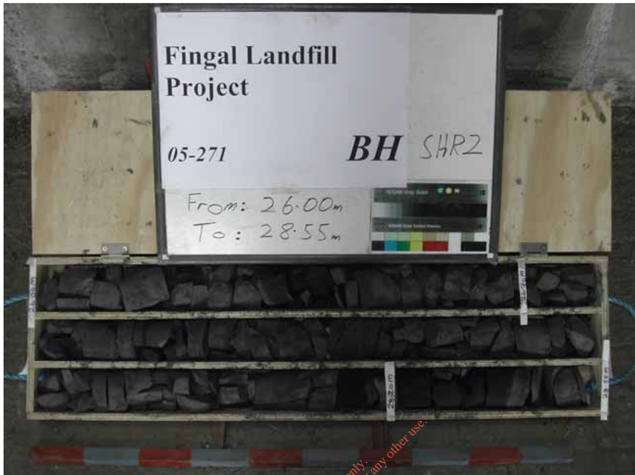
BH SHR2: 26.00-28.55m