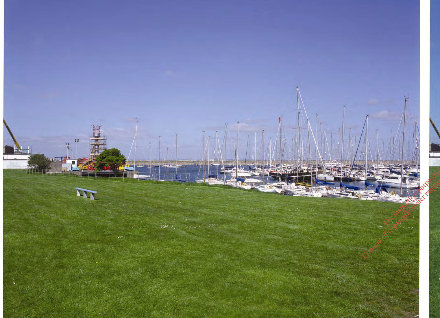
Viewpoint 21 - Royal Irish Yacht Club, Dun Laoghaire

Description: Royal Irish Yacht Club, Dun Laoghaire. 6km south east of the proposed site.