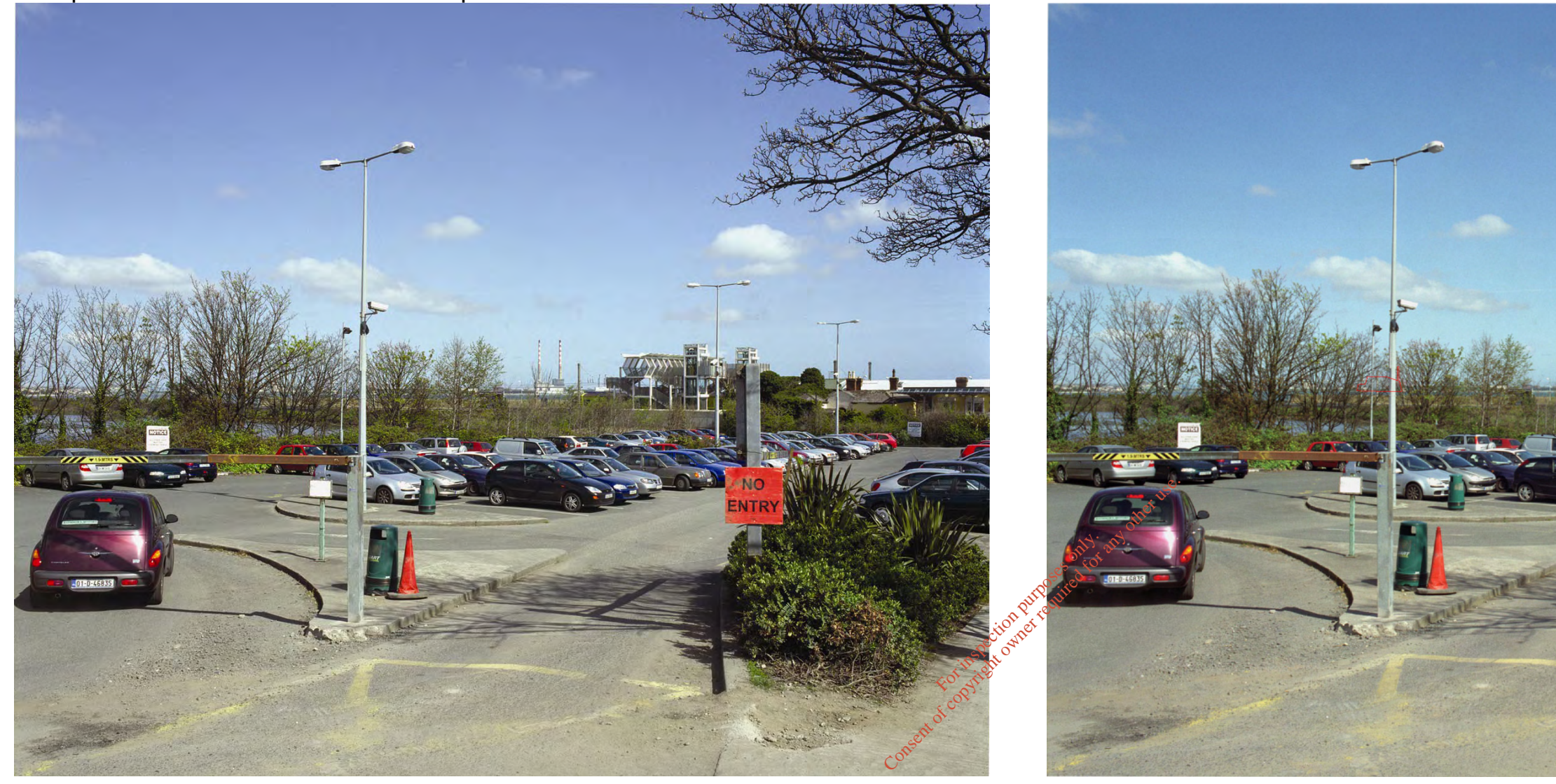
Viewpoint 19 - Booterstown DART Carpark