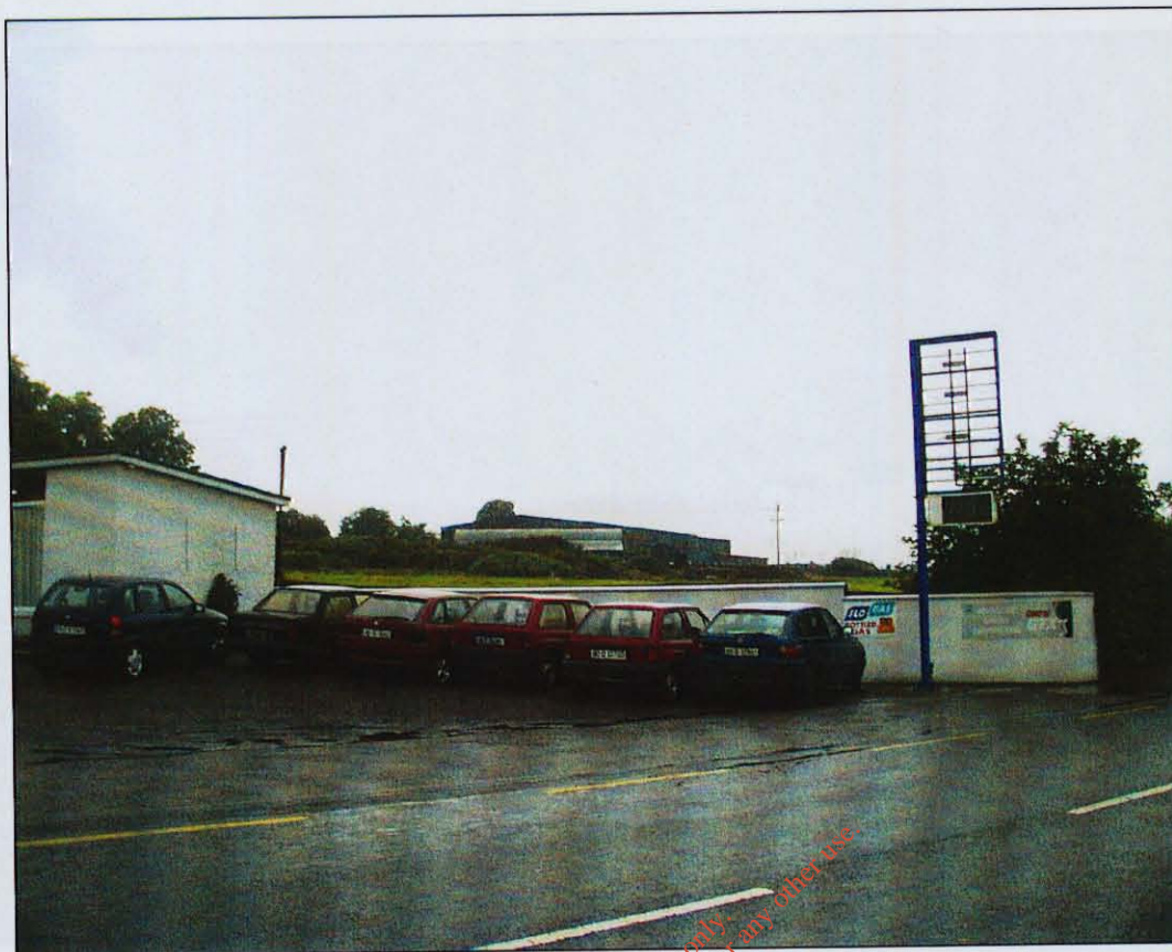
Plate 1 View from Wilkinstown along R162