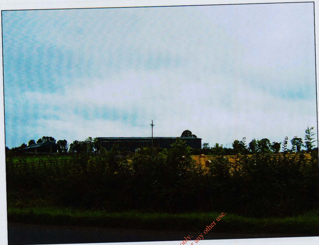
Plate 3 View from R162 after site entrance