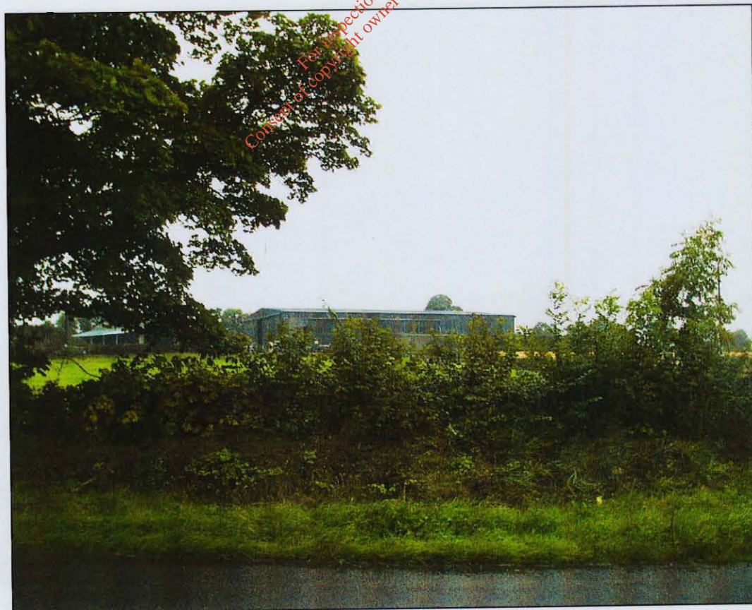
Plate 2 View from R162 before site entrance