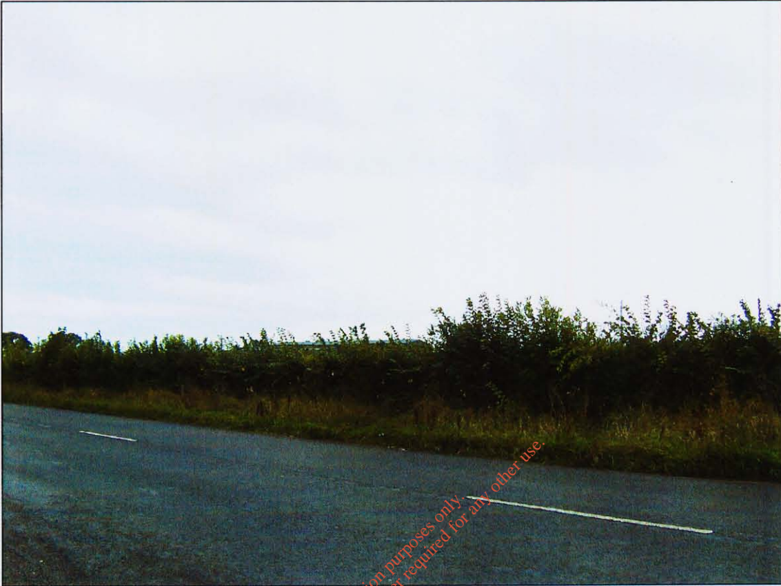
Plate 5: View from northeast

For inspection purposes only Consent of copyright owner required for any other use.