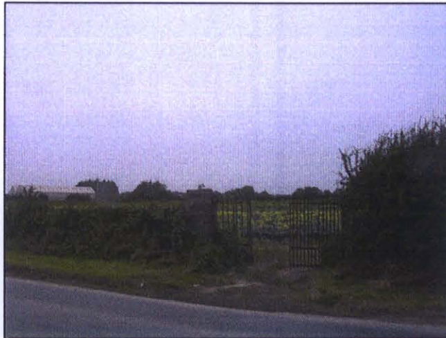
No. 9. View of site from Lusk Road (R127).