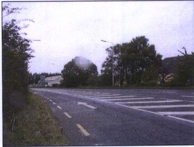
No. 11. View of site from N1 northbound.