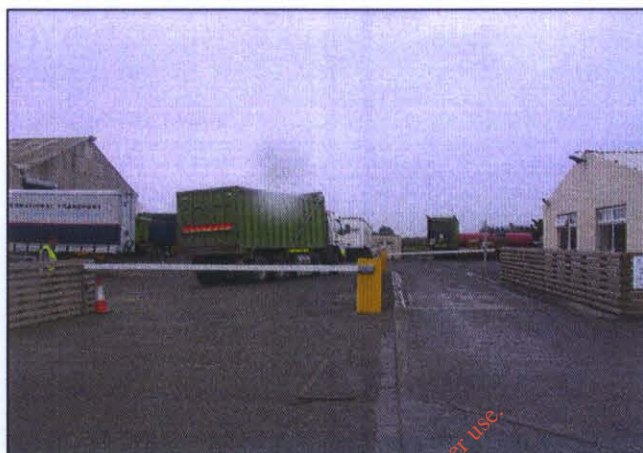
No. 1. View of site entrance from access road in industrial/commercial complex.