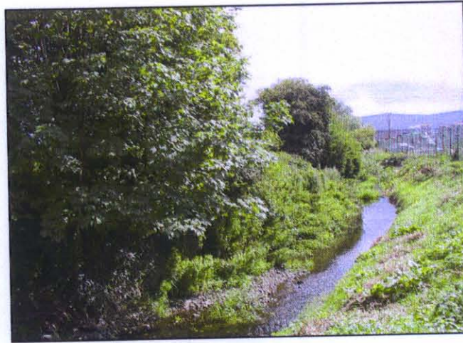
No 5. View of Ballough Stream along the eastern side of the existing warehouse