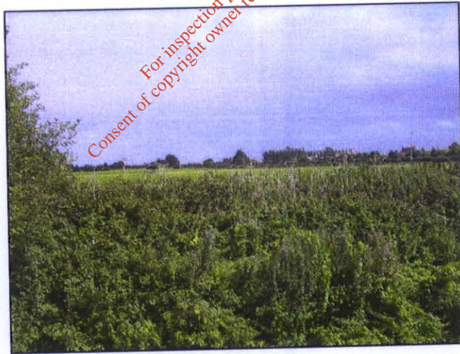
No. 6. View of proposed new area from eastern side of existing site