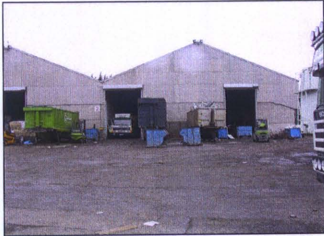
No. 3. View of existing warehouse