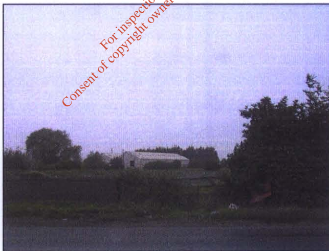
No. 8. View of site from Lusk Road (R127).