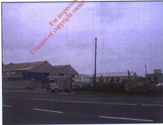
No. 12. View of site from N1.