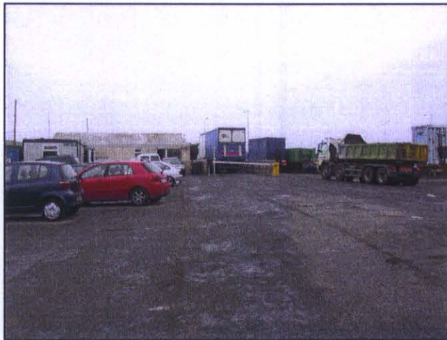
No. 7. View of site office in a western direction.