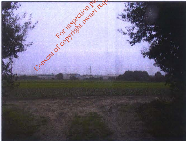
No. 10. View of site from minor road linking Lusk Road.