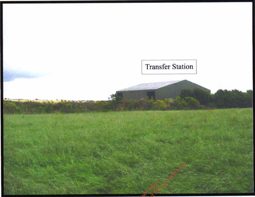
Attachment F.1.11 Plate 2: View of Site from North