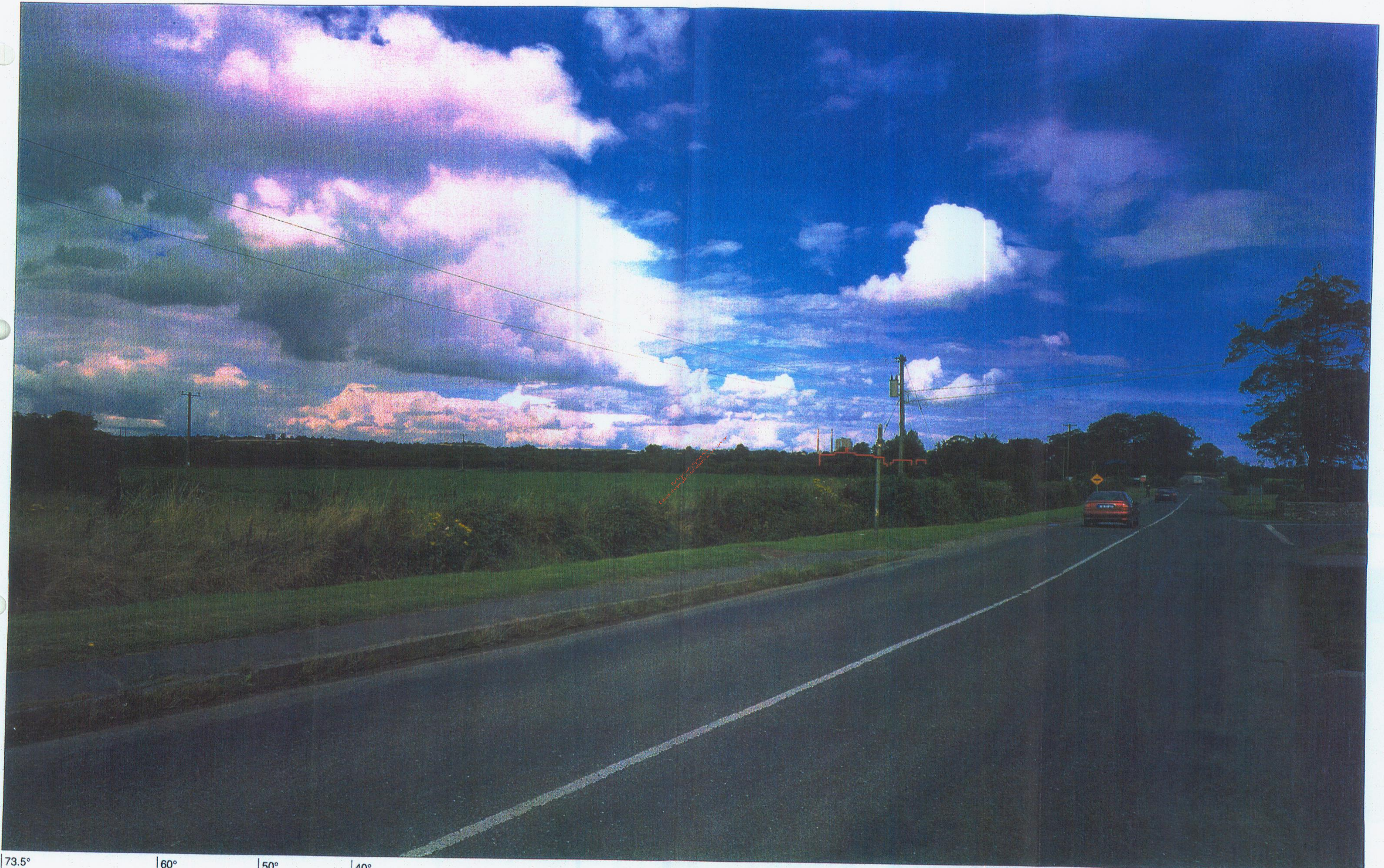
73.5° | 60° | 50° | 40° ANGLE OF VISION SCALE 40° | 50° | 60° | 73.5° Proposed Waste Management Facility at Carranstown, County Meath. View from northern end of Duleek, just before junction with R152. Outline of proposed development shown in red. View 8