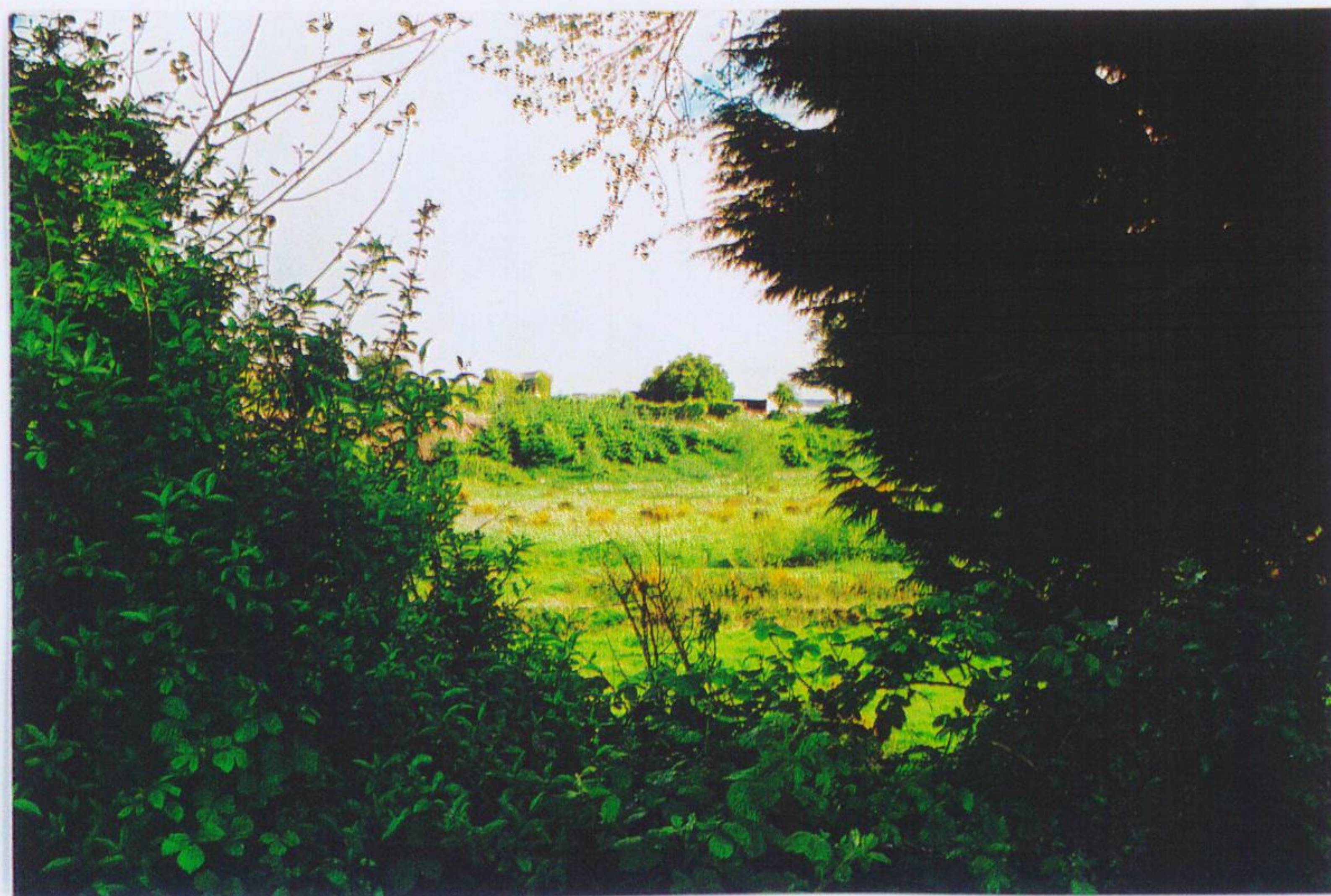
10. View of site from N11 through conifer screening.