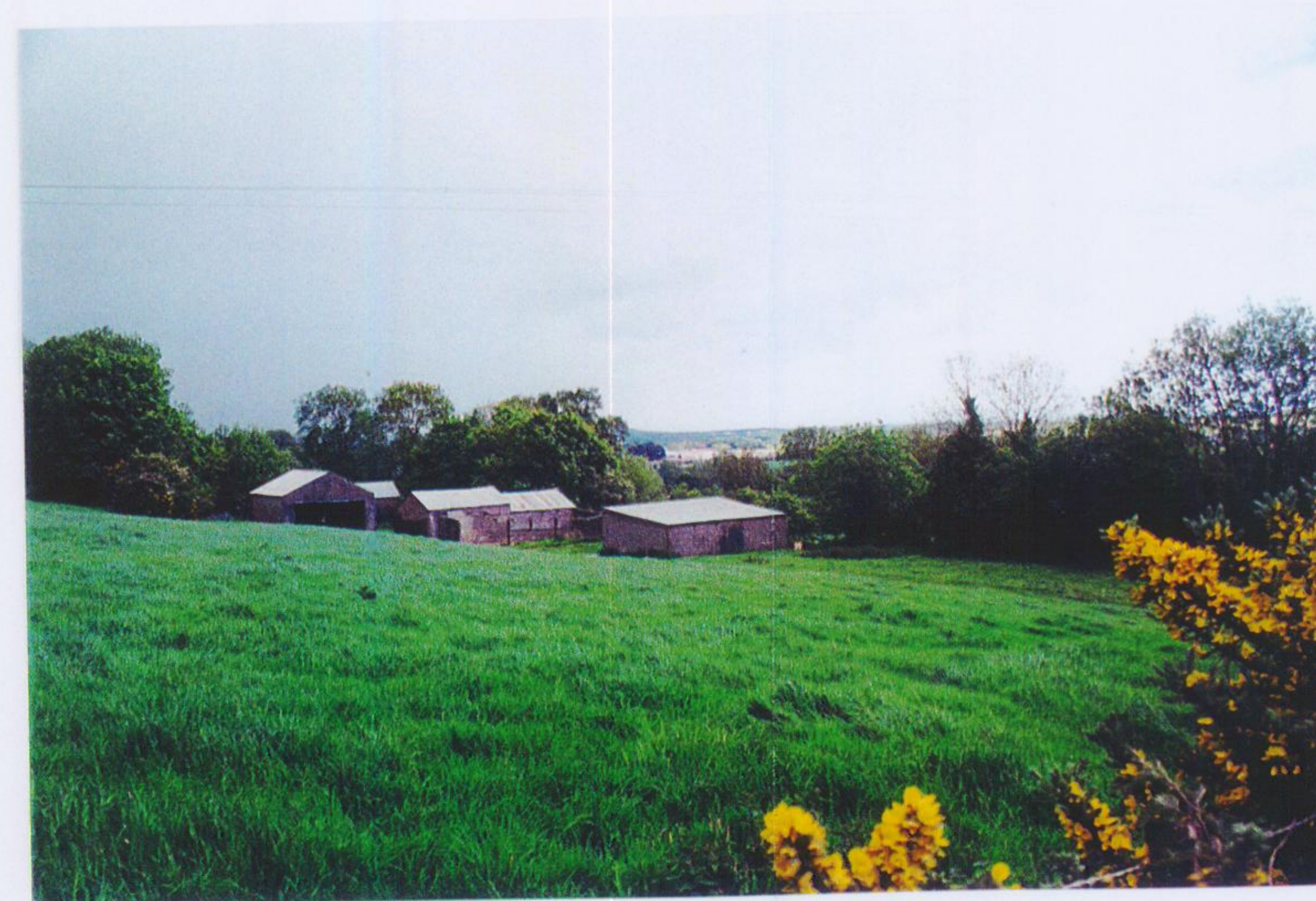
11. View of site from road leading to quarry, Coolishal Upper.

For personal or internal use only Copying or original work prohibited for any other use