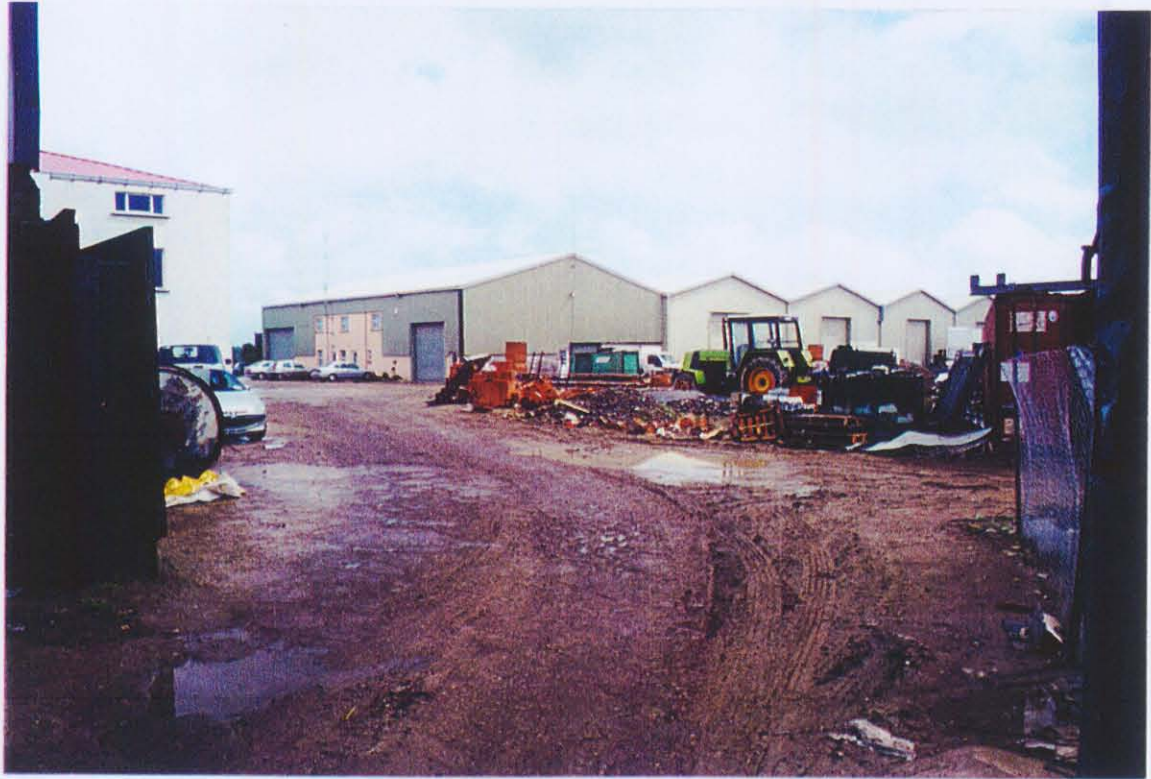
5. View from access gate looking out of the site.