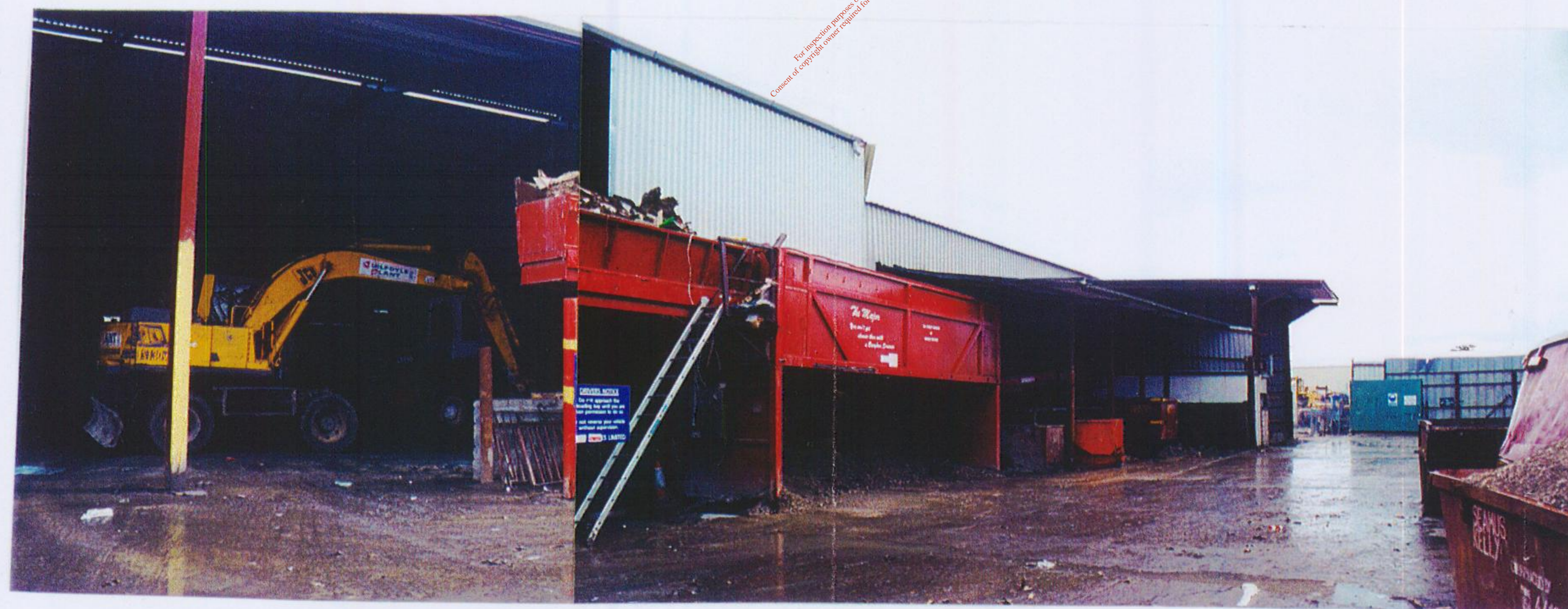
2. View of site in a southerly direction. Main building in foreground. Access gate in background.