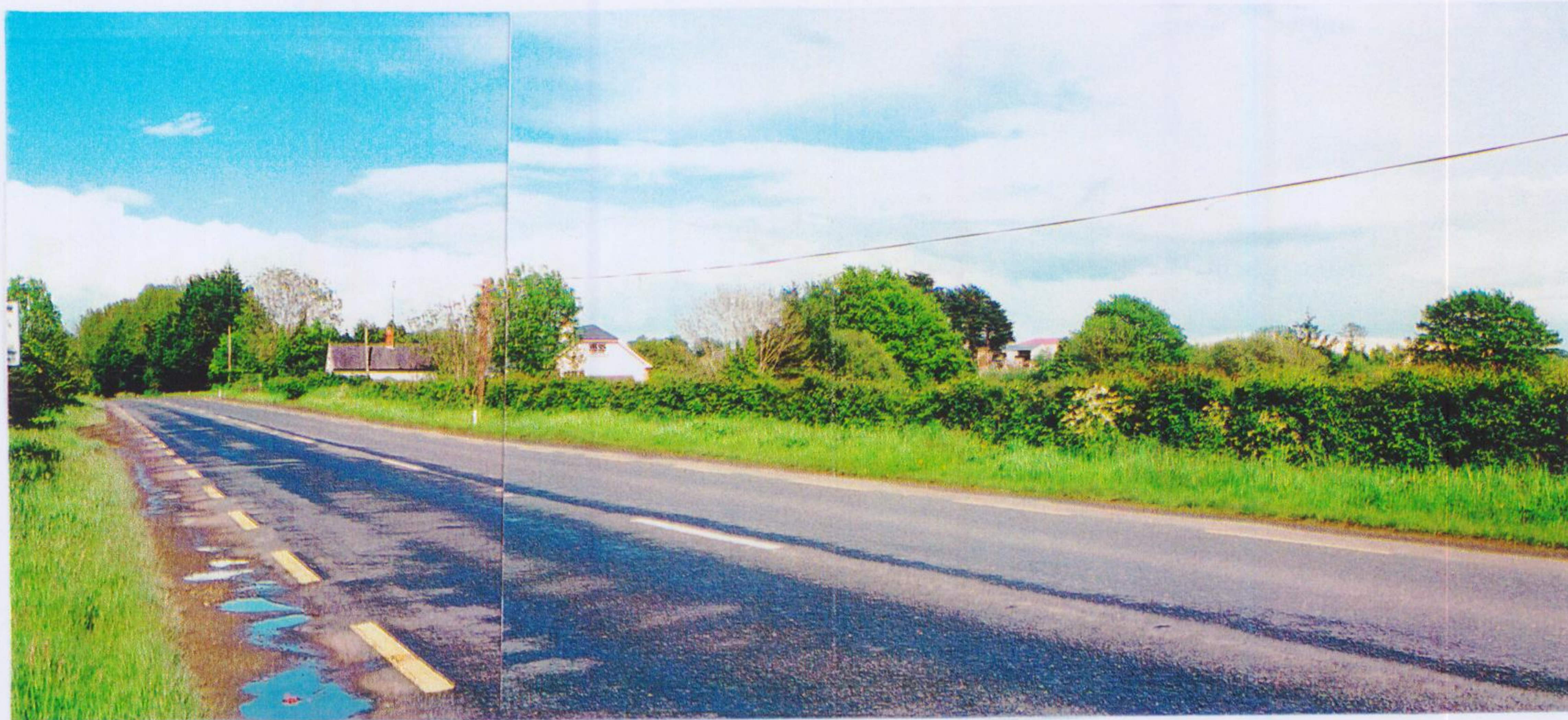
9. View of site from N11 in a north direction.