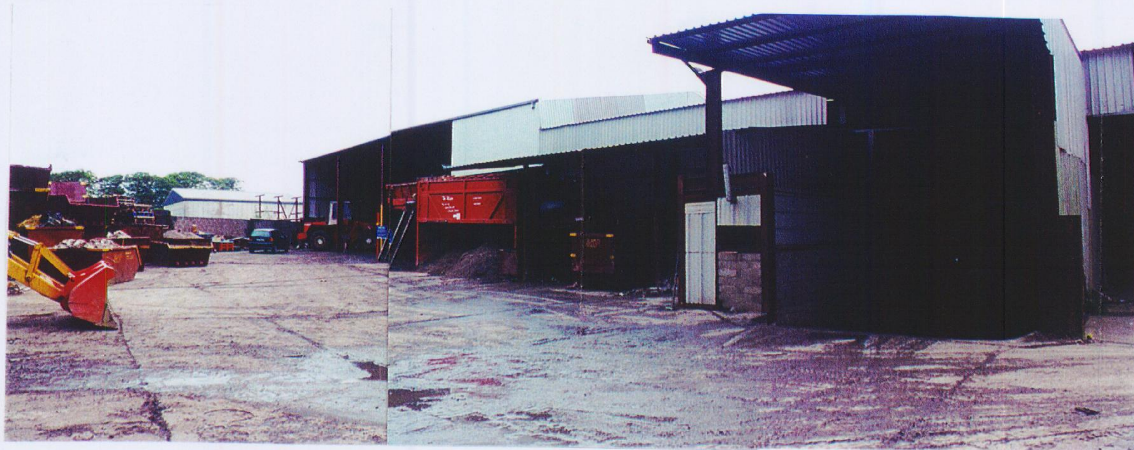
1. View of site in north easterly direction. Main buildings.