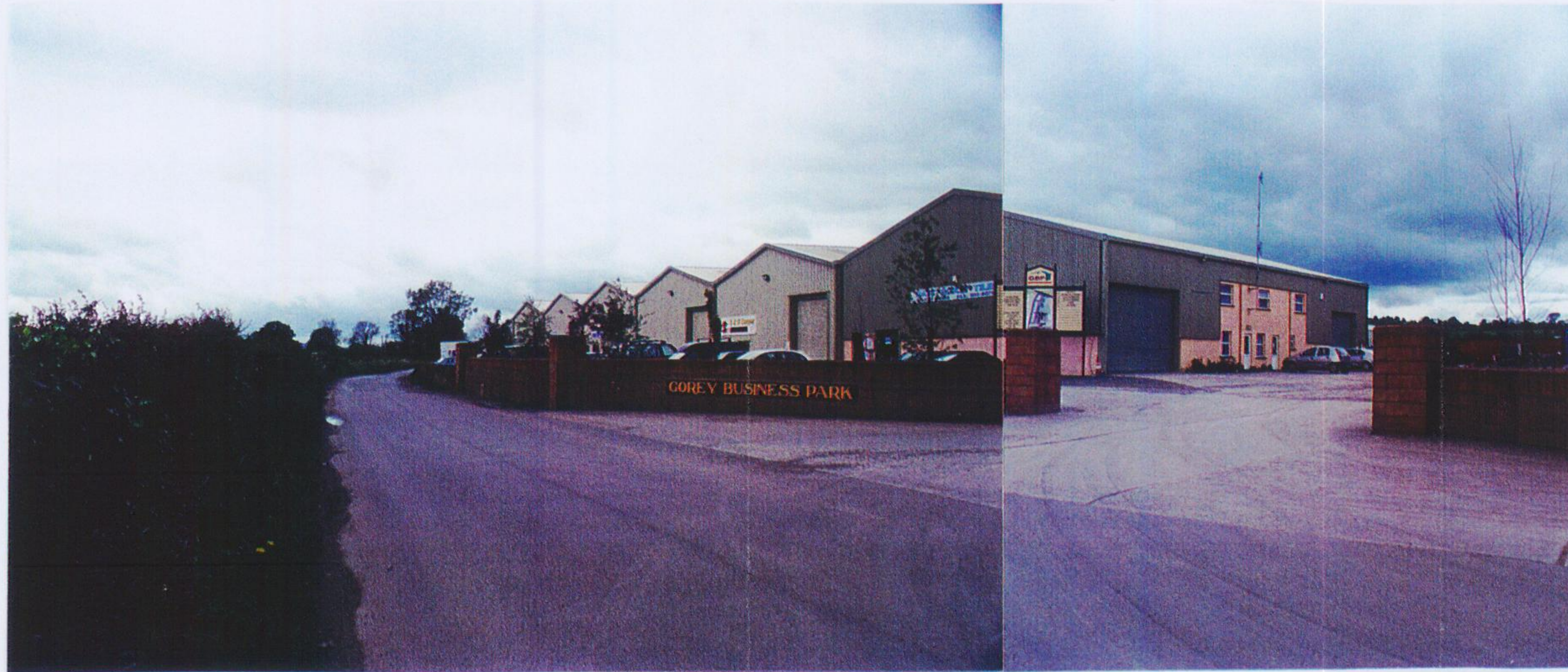
7. Southerly view of minor road from business park entrance.