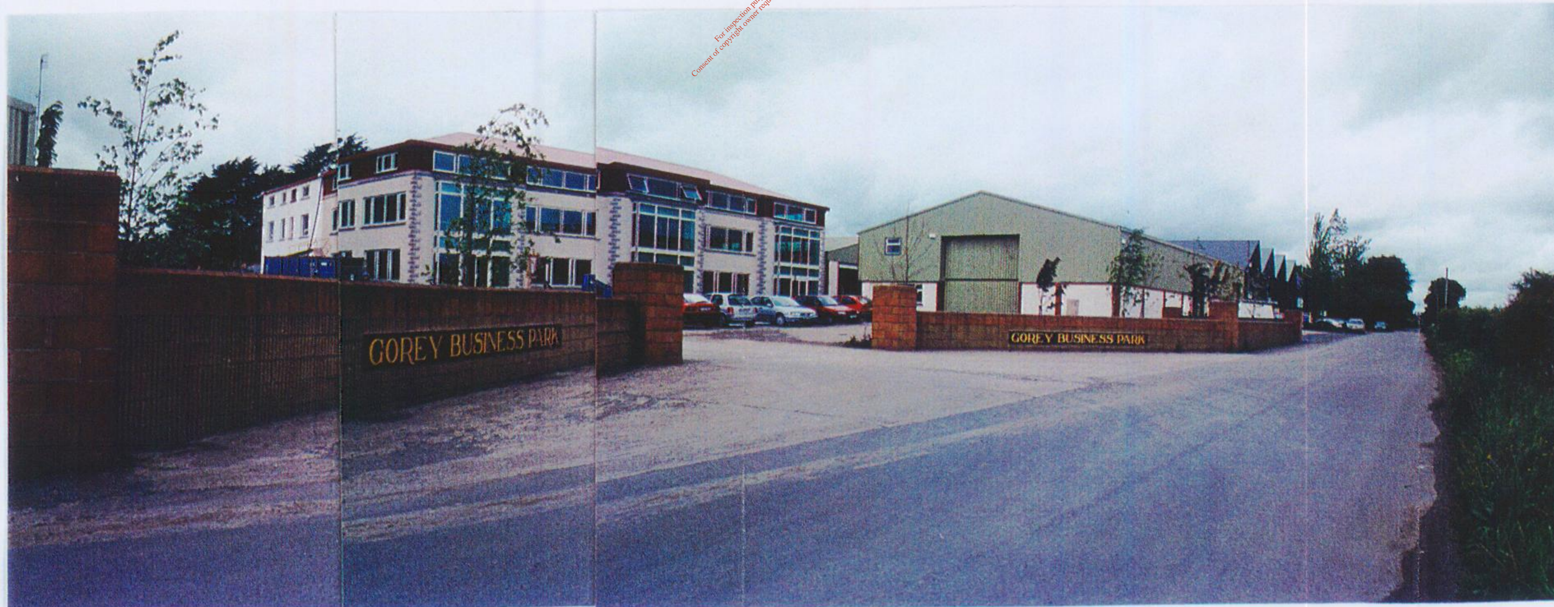
8. Northerly view of minor road from business park entrance.