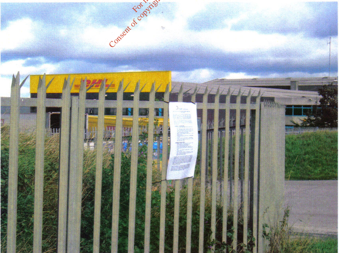
Plate 2.2: Site notice at Ballymount Road Lower at south east of site