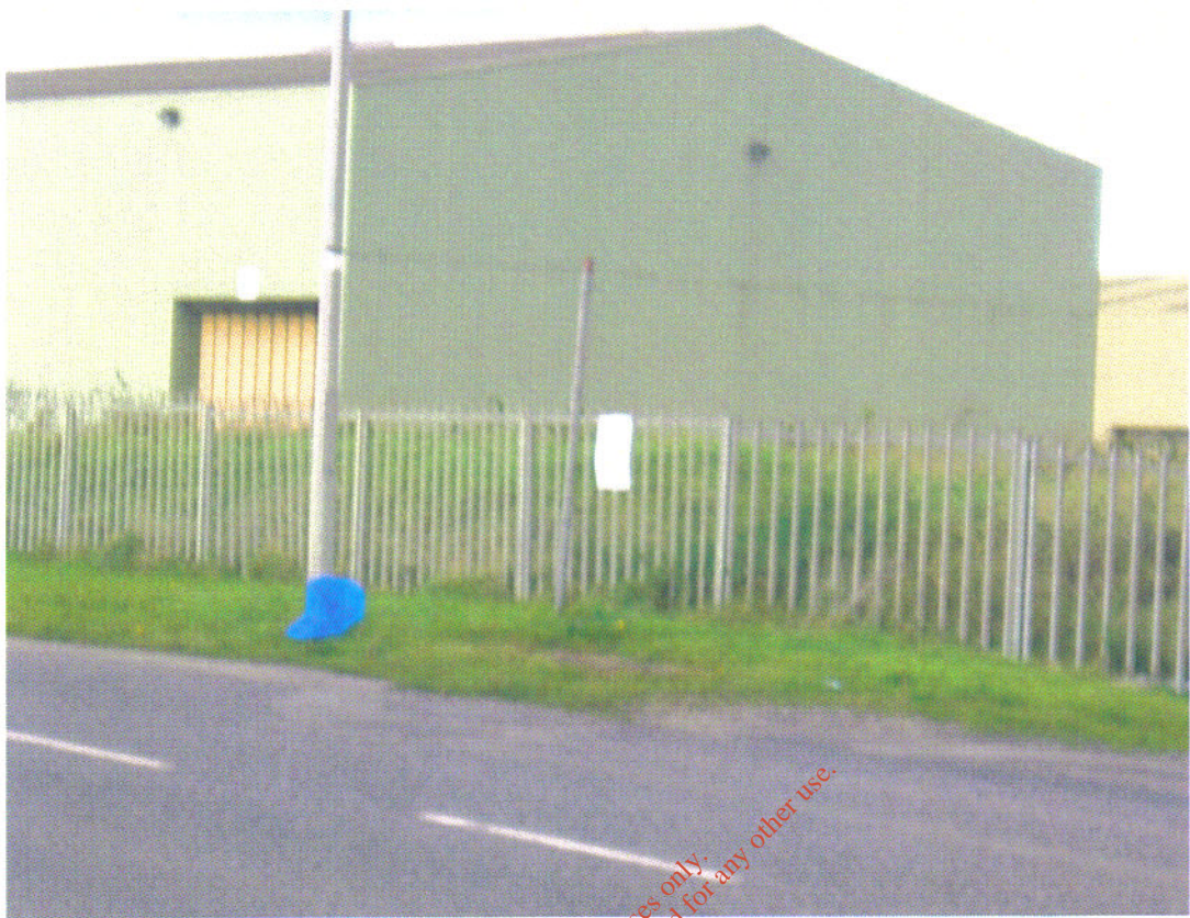
Plate 2.1: Site notice at Ballymount Road Lower at south east of site from Galco Steel Ltd entrance