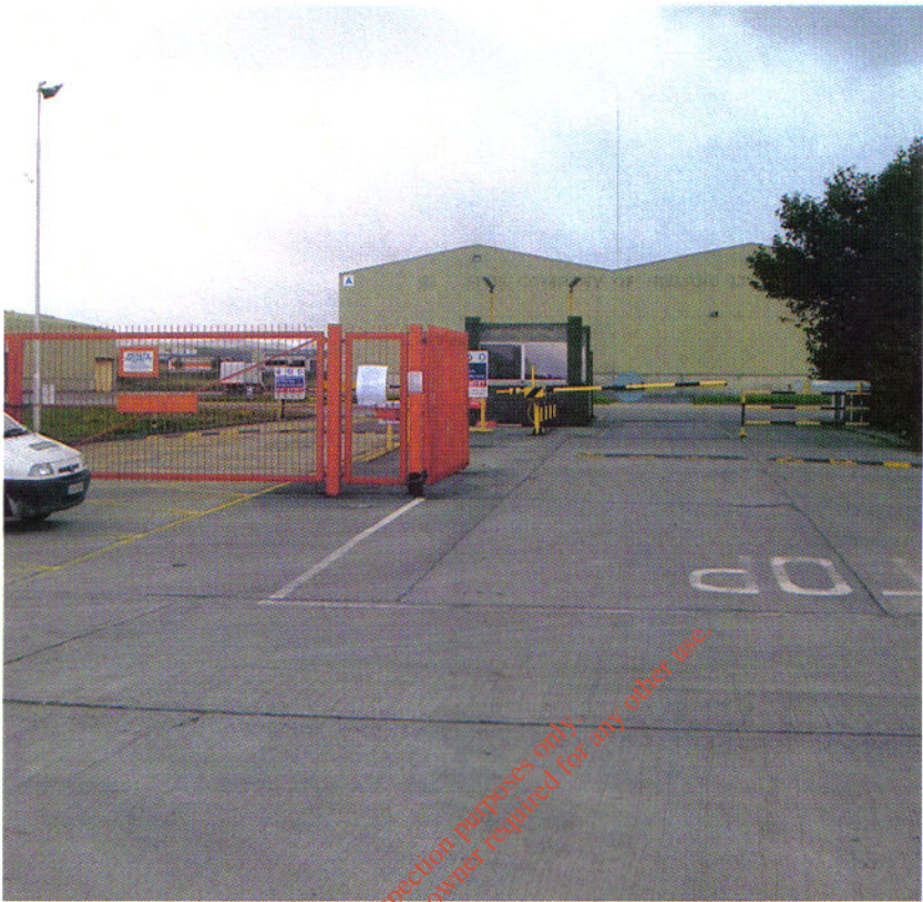
Plate 2.2: Site notice at site entrance