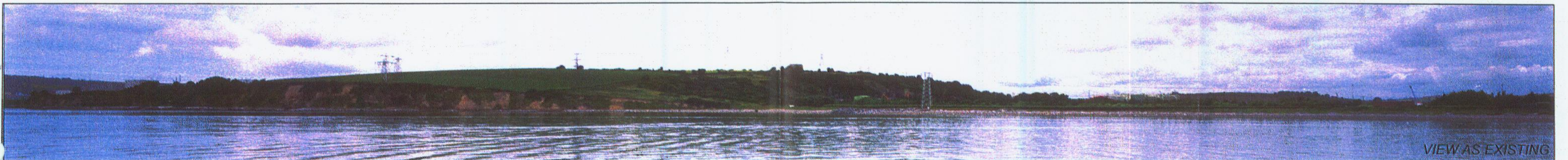
VIEW AS EXISTING

73.5° | 60° | 50° | 40° | ANGLE OF VISION SCALE | 40° | 50° | 60° | 73.5°