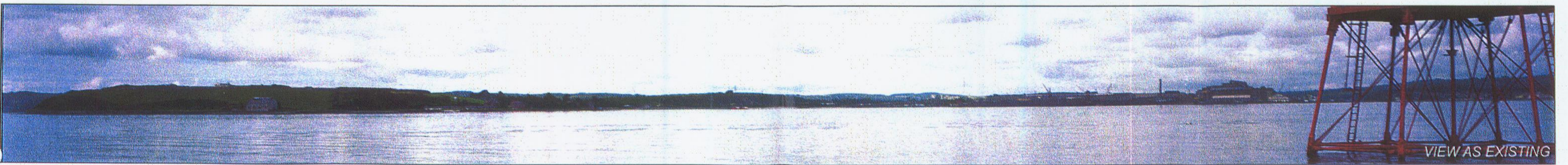
VIEW AS EXISTING