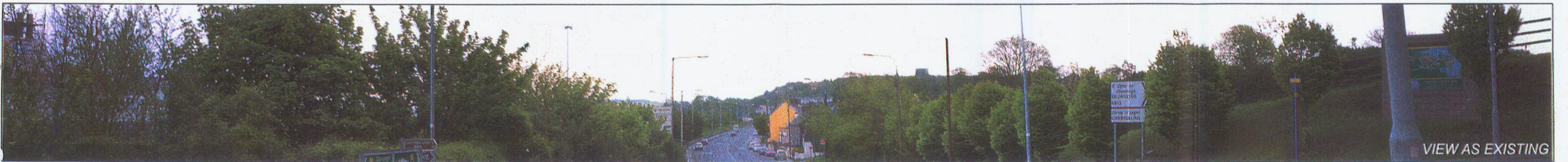
VIEW AS EXISTING