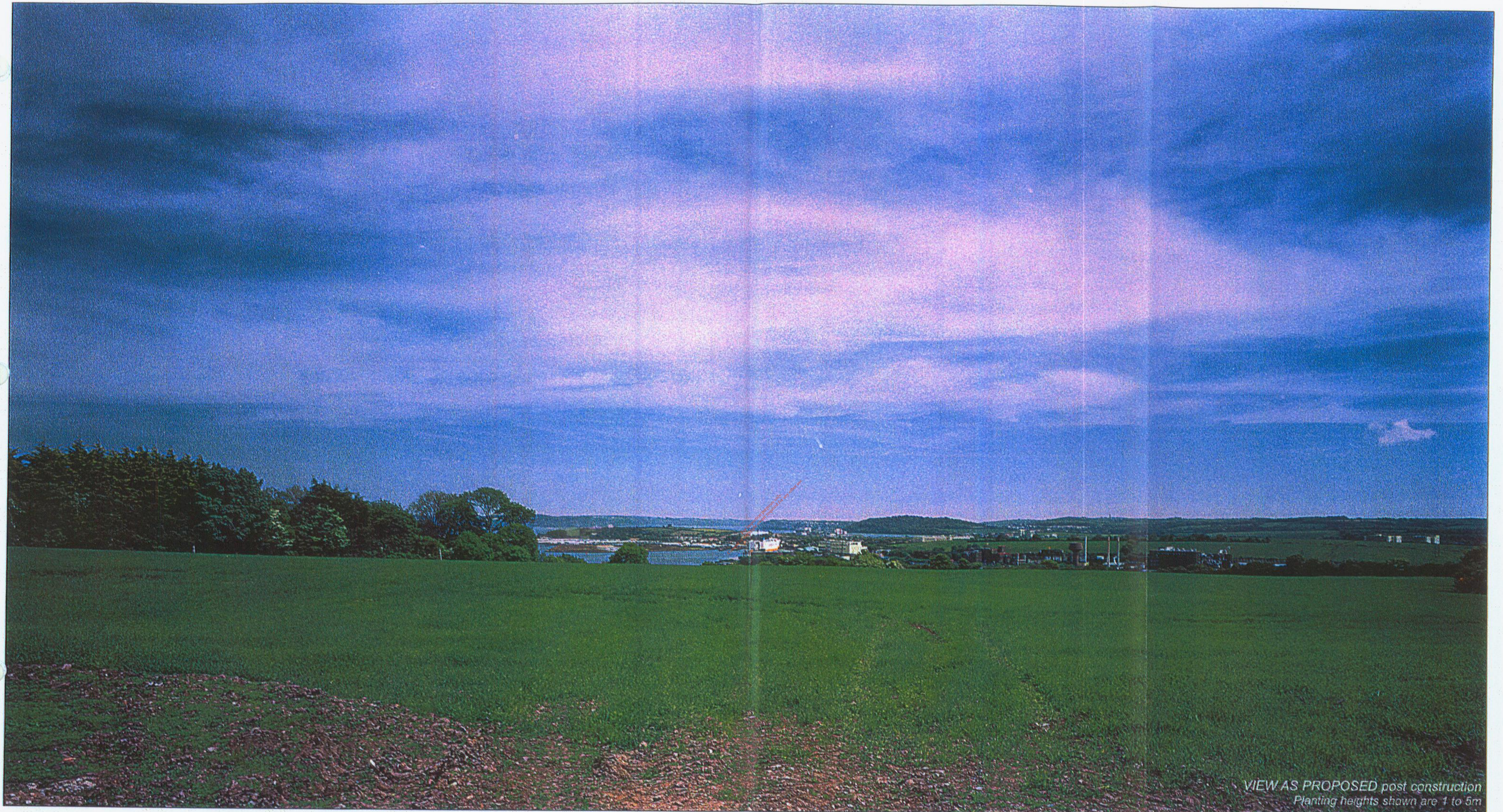
VIEW AS PROPOSED post construction Planting heights shown are 1 to 5m