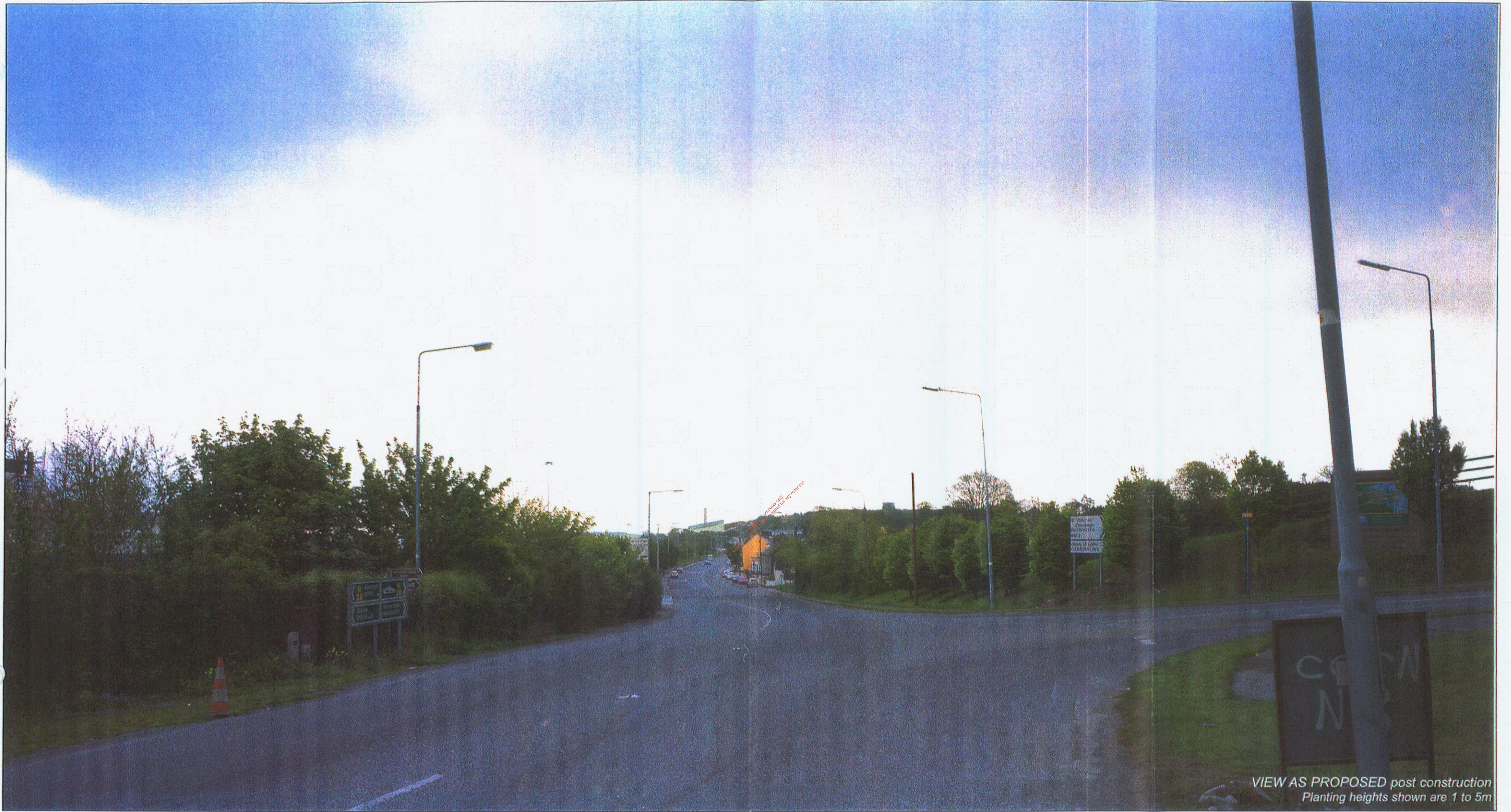
VIEW AS PROPOSED post construction Planting heights shown are 1 to 5m