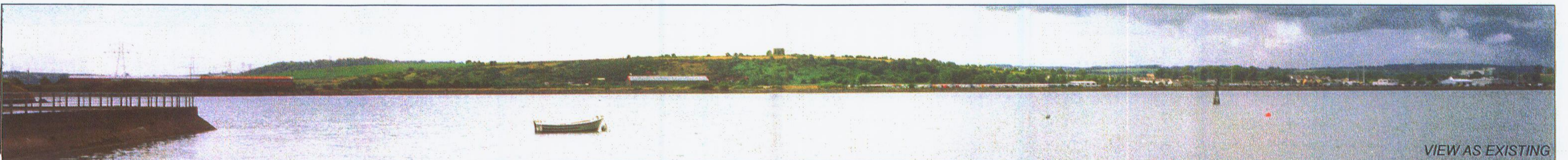
VIEW AS EXISTING