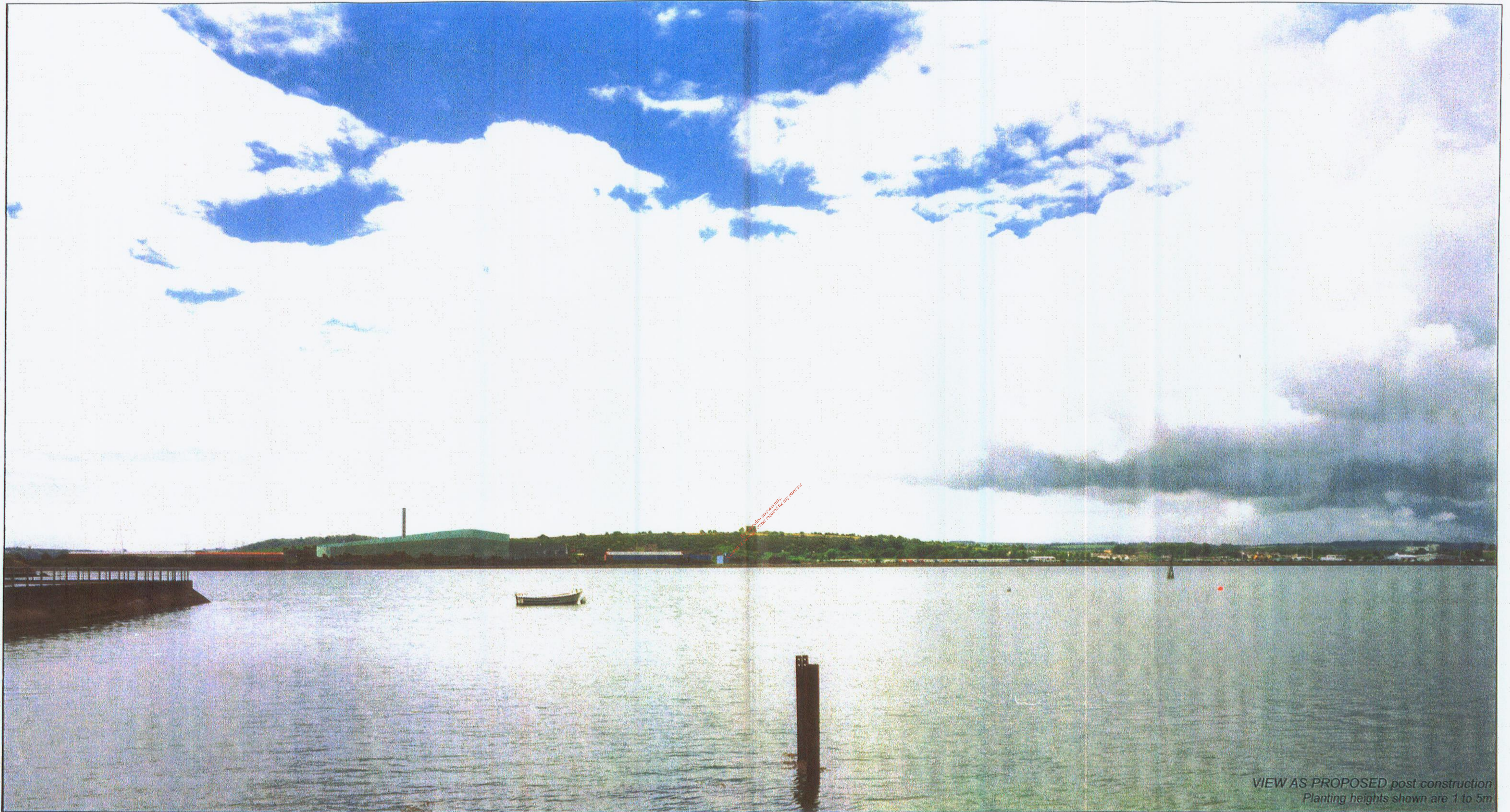
VIEW AS PROPOSED post construction Planting heights shown are 1 to 5m