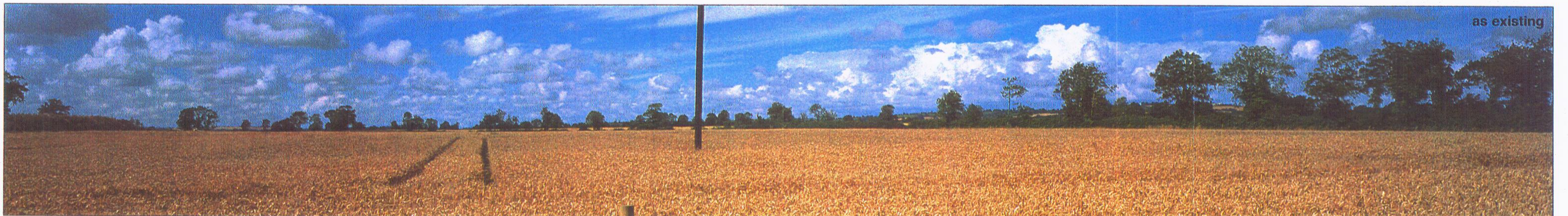
73.5° | 60° | 50° | 40° | ANGLE OF VISION SCALE | 40° | 50° | 60° | 73.5° | Proposed Waste Management Facility at Carranstown, County Meath. View from minor road just south of existing school building View 9