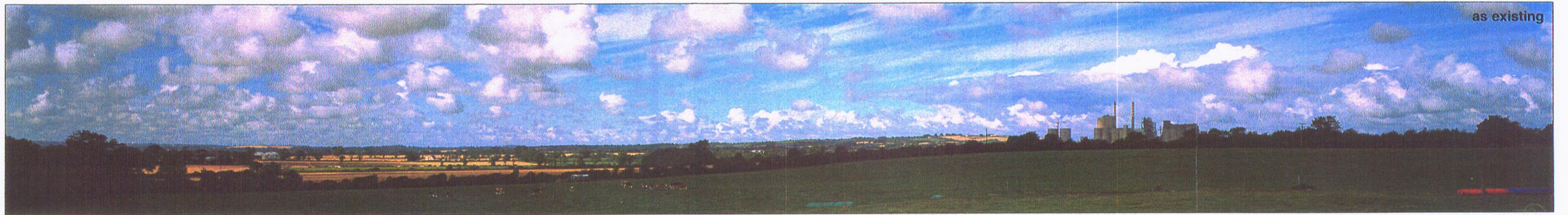
73.5° | 60° | 50° | 40° ANGLE OF VISION SCALE 40° | 50° | 60° | 73.5° Proposed Waste Management Facility at Carranstown, County Meath. View from high ground at Crufty, east of the site. View 10