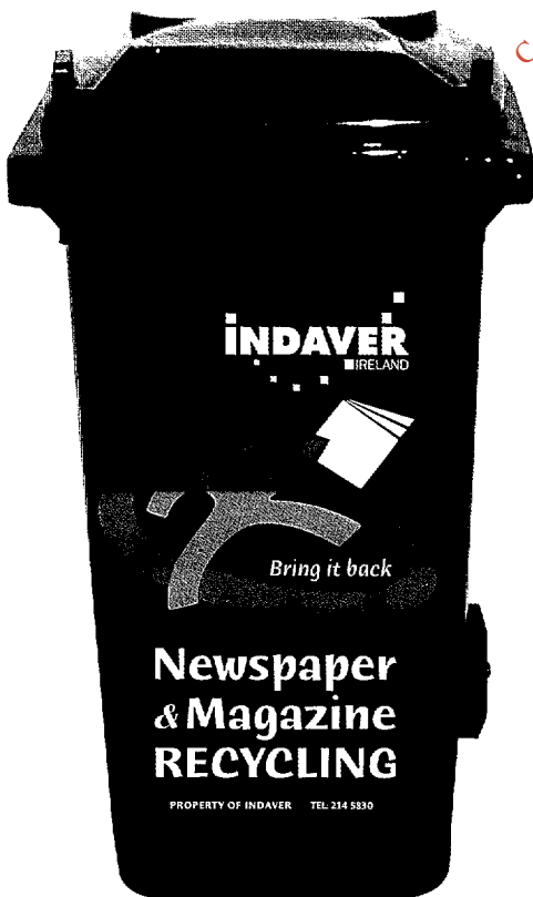
The 240L Bin

The Indaver team will be responsible for the delivery and maintenance of the bins and collection of the newspapers and magazines for recycling. This will provide a convenient, cost effective, environmentally friendly solution for the recycling of unwanted newspapers and magazines.