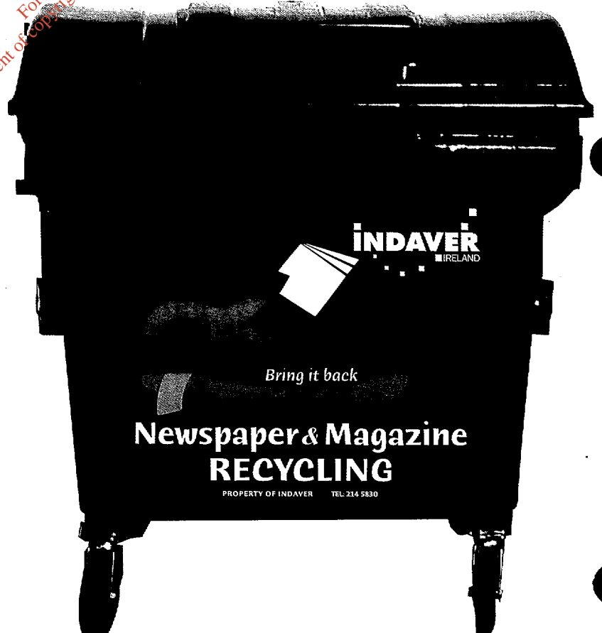
The 1,100L Bin

For inspection purposes only. Consent of copyright owner required for any other use.