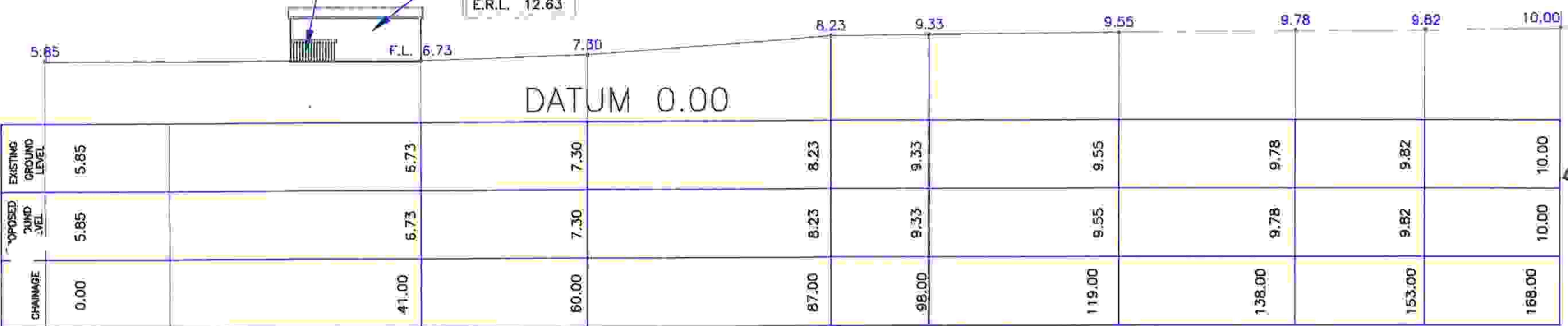
SITE SECTION A - A

EXISTING WORKSHOP E.G.L 6.73 E.F.L 6.73 E.R.L 12.63