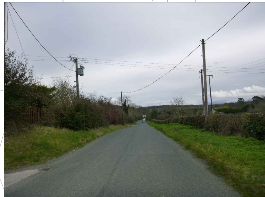
PLATE 1: Looking East