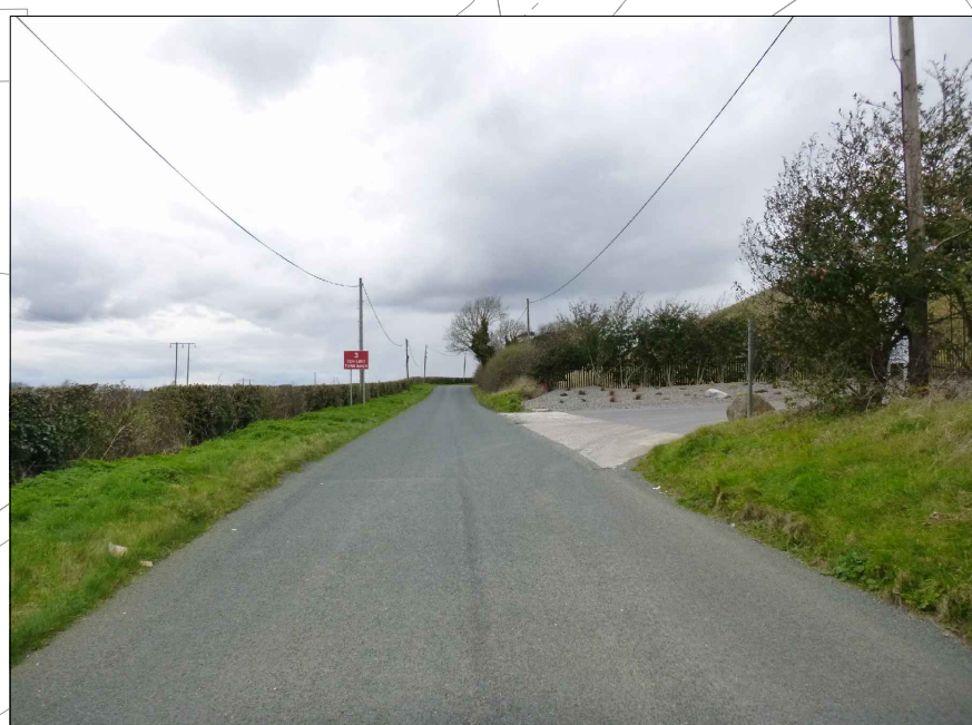
PLATE 2: Looking West