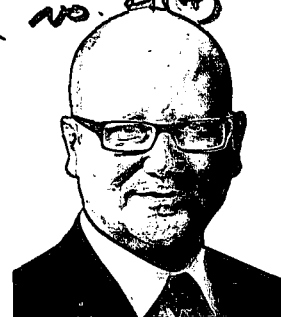
Gerald Nash TD Louth/East Meath

Dáil Office: Leinster House Kildare Street, Dublin 2 Tel: 01 618 3576 Fax: 01 618 4397 Email: gerald.nash@oir.ie