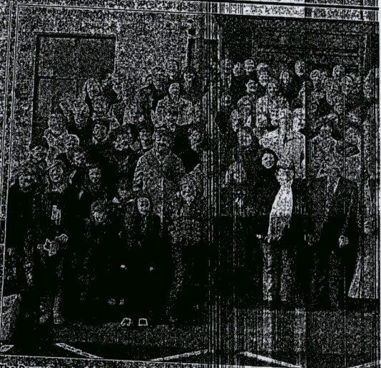
The Department of Agriculture, Cavan celebrated 20 years in Cavan this weekend. Members gathered to remember deceased staff of the Department with Minister Brian Cowen. For full story, see page 2.

At the time of going to print, no reply had been received from Oxigen in relation to the latest developments.